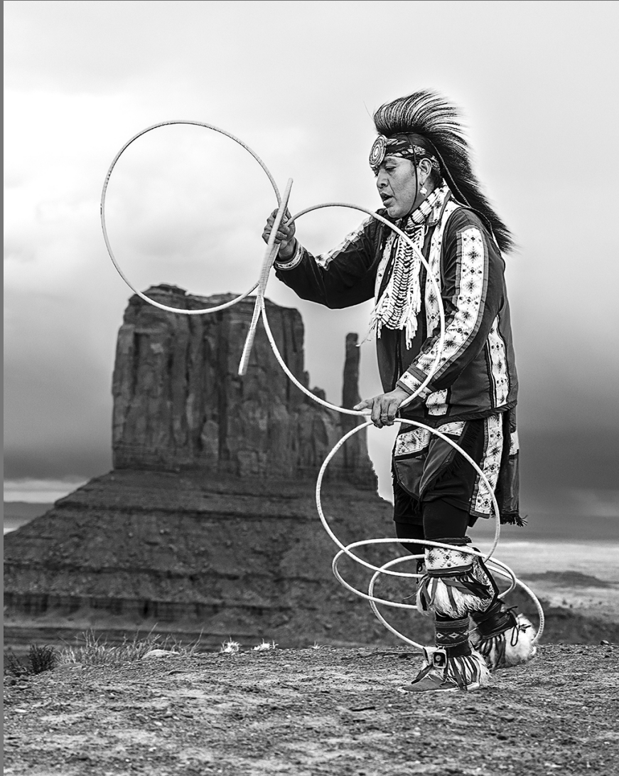
“HOOP DANCER TURNS W 6 HOOPS” by LILLIAN ROBERTS

Southern California Council of Camera Clubs