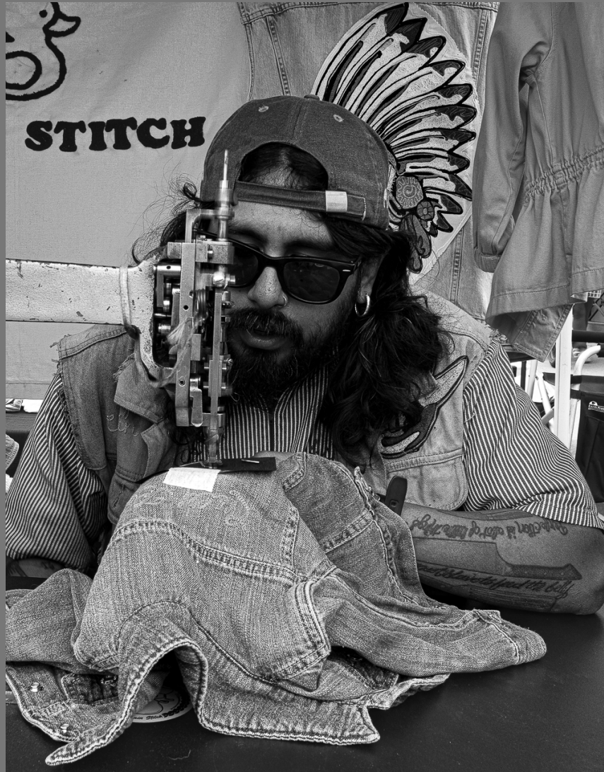
"STITCH" by ALEX ANDREWS

Southern California Council of Camera Clubs