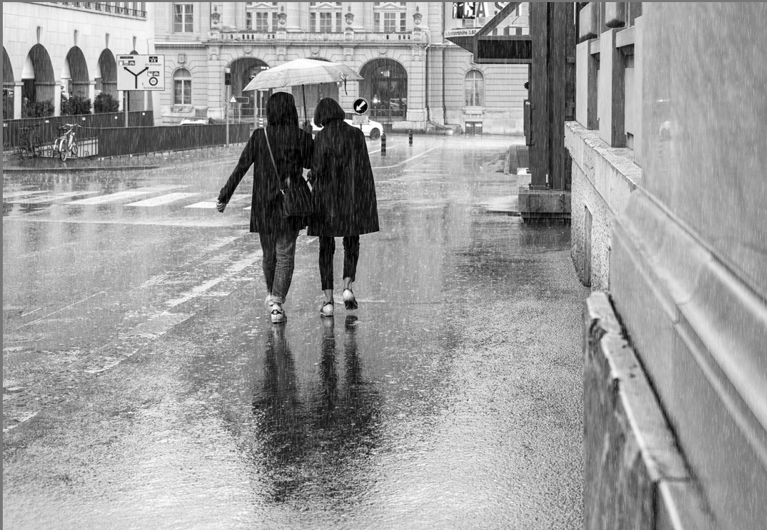
“RAINY DAY” by LEONID SHECTMAN

Southern California Council of Camera Clubs