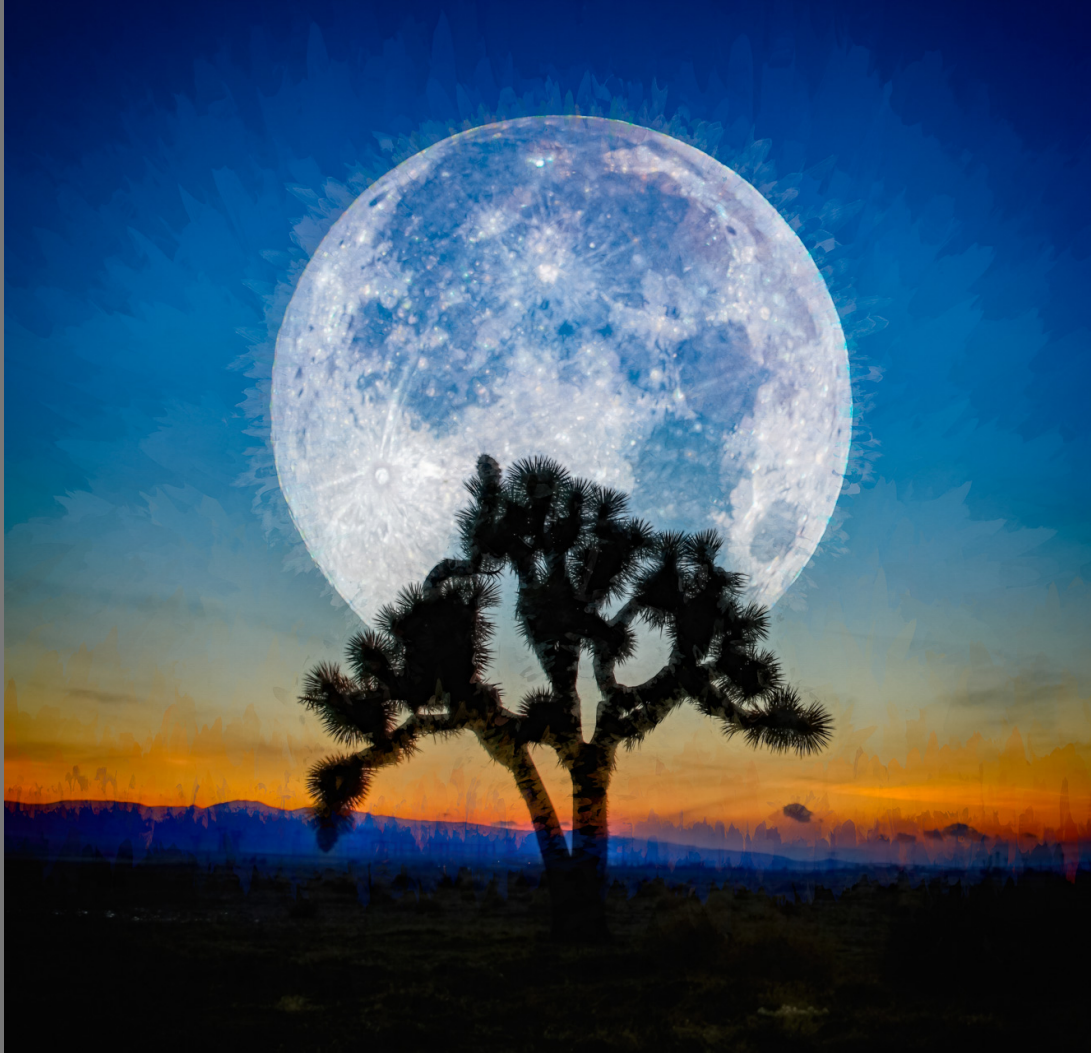
“JOSHUA MOON” by KATHRYN NEWMAN

Southern California Council of Camera Clubs