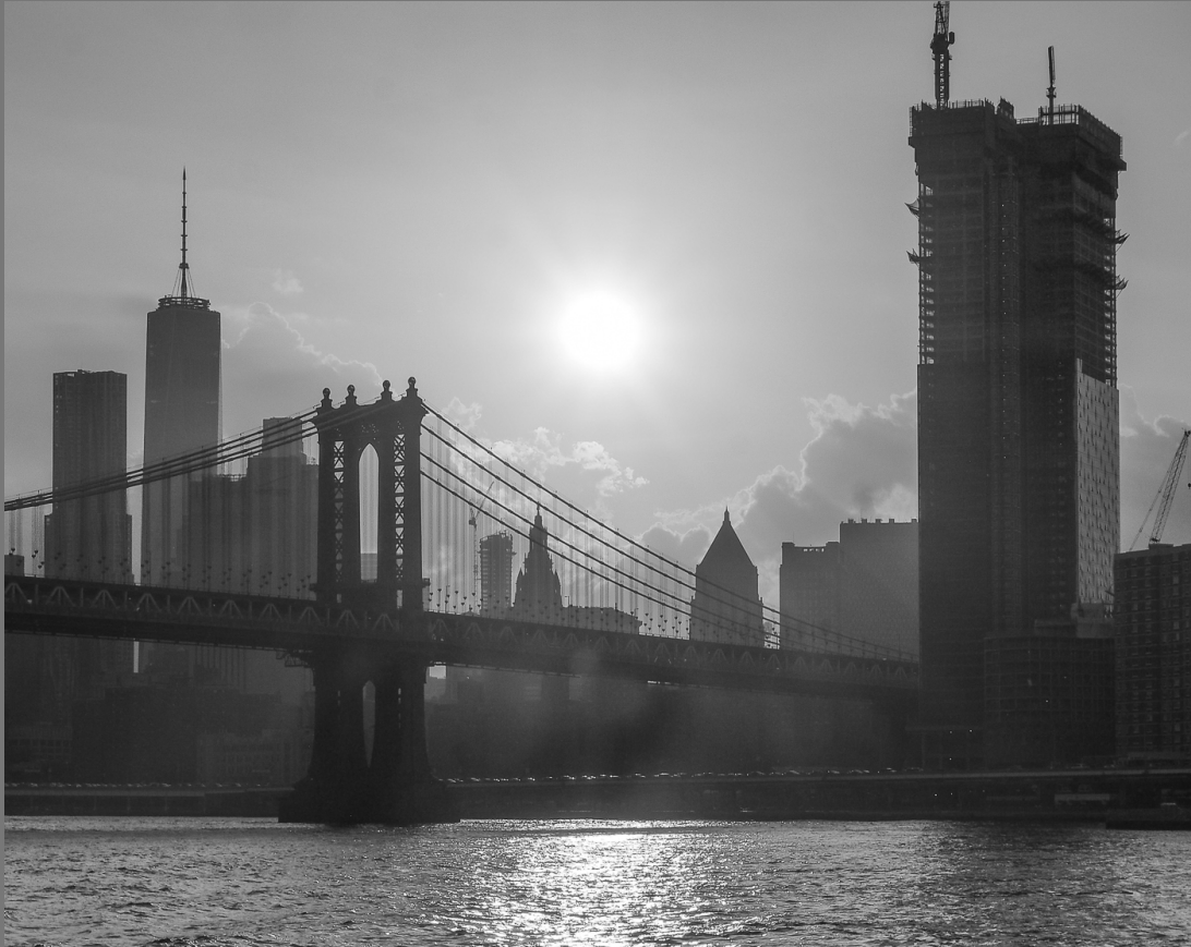
“BROOKLYN BRIDGE LATE AFTERNOON” by EDWARD HAUGH

Southern California Council of Camera Clubs