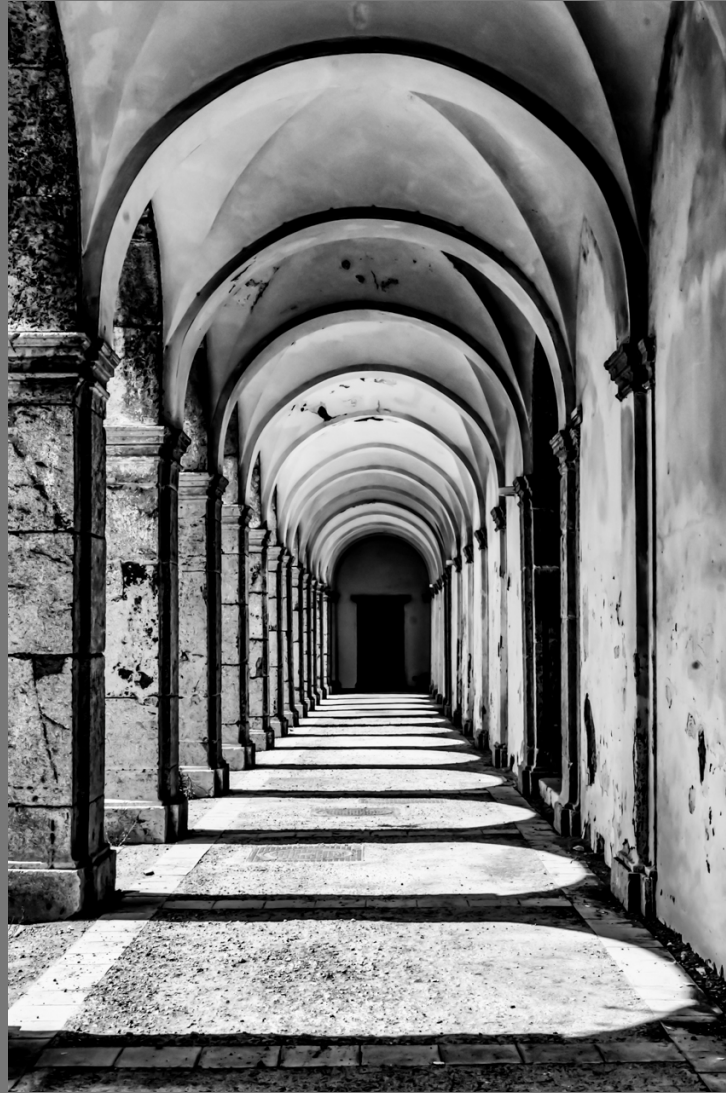
“VANISHING POINT” by USHA PEDDAMATHAM

Southern California Council of Camera Clubs