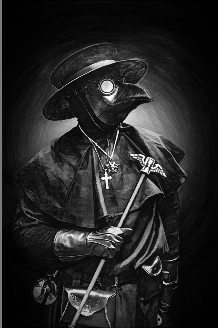
"THE PLAGUE DOCTOR" by KATHRYN NEWMAN

Southern California Council of Camera Clubs