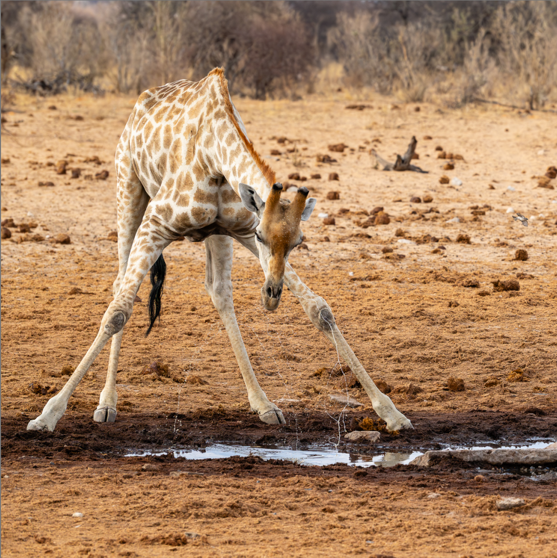
“BALANCE AND POISE” by CHRISTINE WILKINS

Southern California Council of Camera Clubs