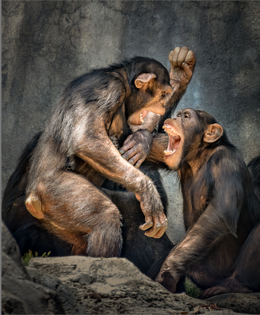
“BAD BREATH” by KATHRYN NEWMAN

Southern California Council of Camera Clubs