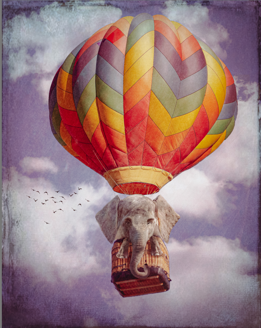
"UP UP AND AWAY" by KATHRYN NEWMAN

Southern California Council of Camera Clubs