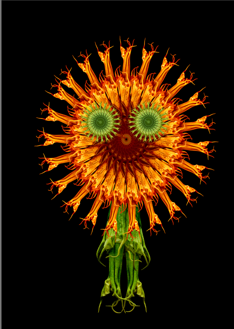
"DON'T WORRY BE HAPPY" by JERRY STEVENSON

Southern California Council of Camera Clubs