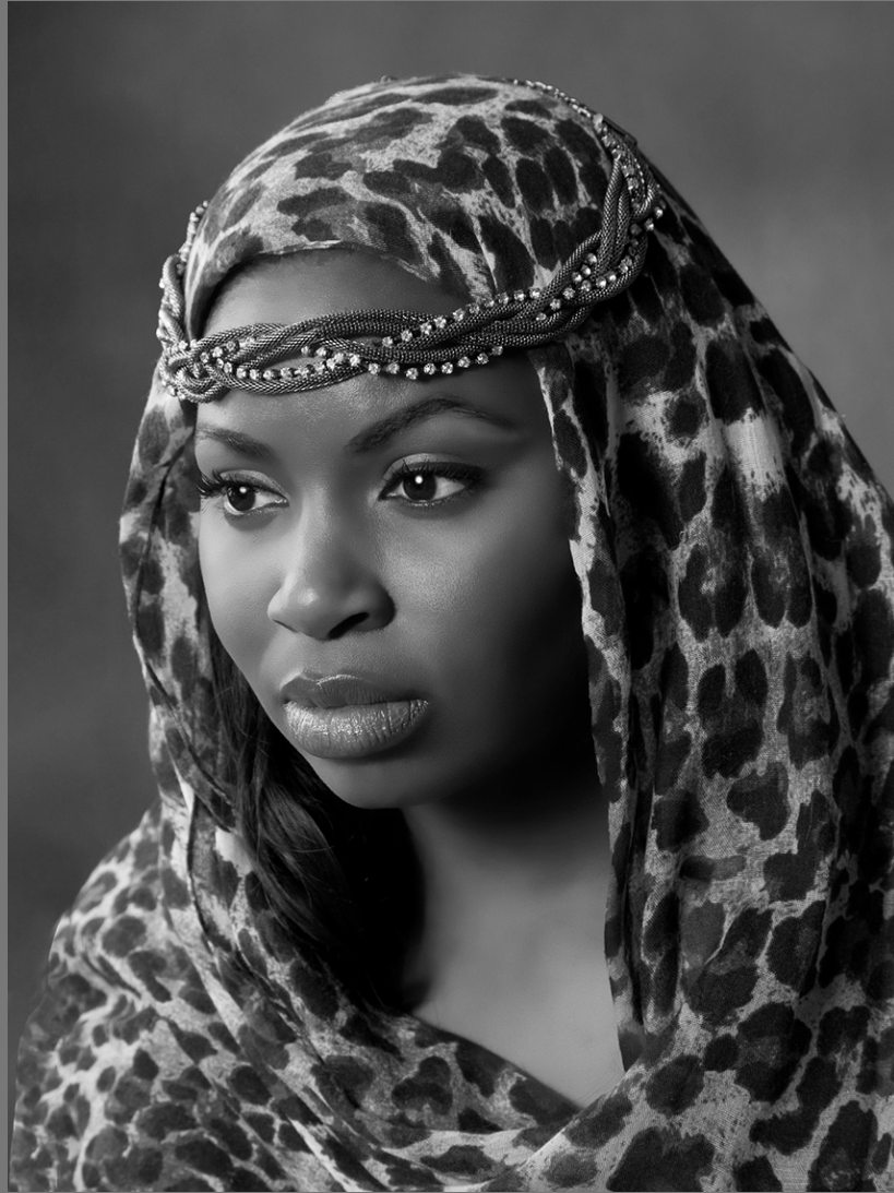
“AFRICAN QUEEN ERICA 2132” by SUZANNE GONZALEZ

Southern California Council of Camera Clubs