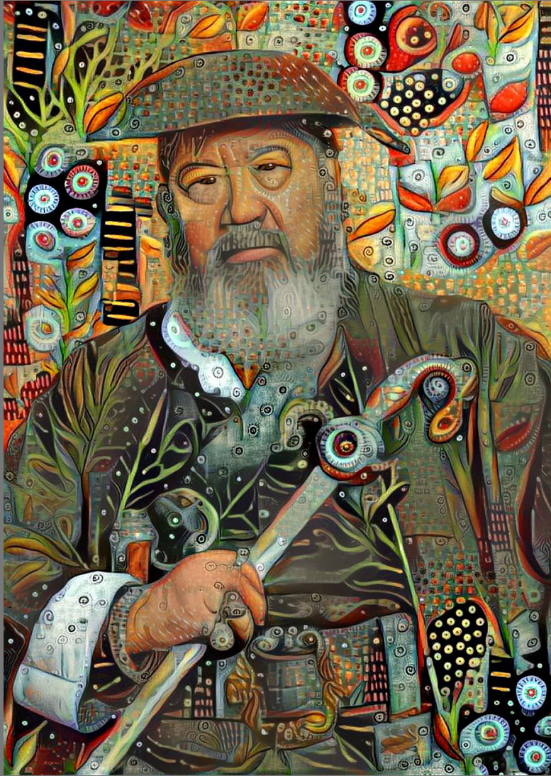
“COOKING WOK HAT 8696” by SUZANNE GONZALEZ

Southern California Council of Camera Clubs