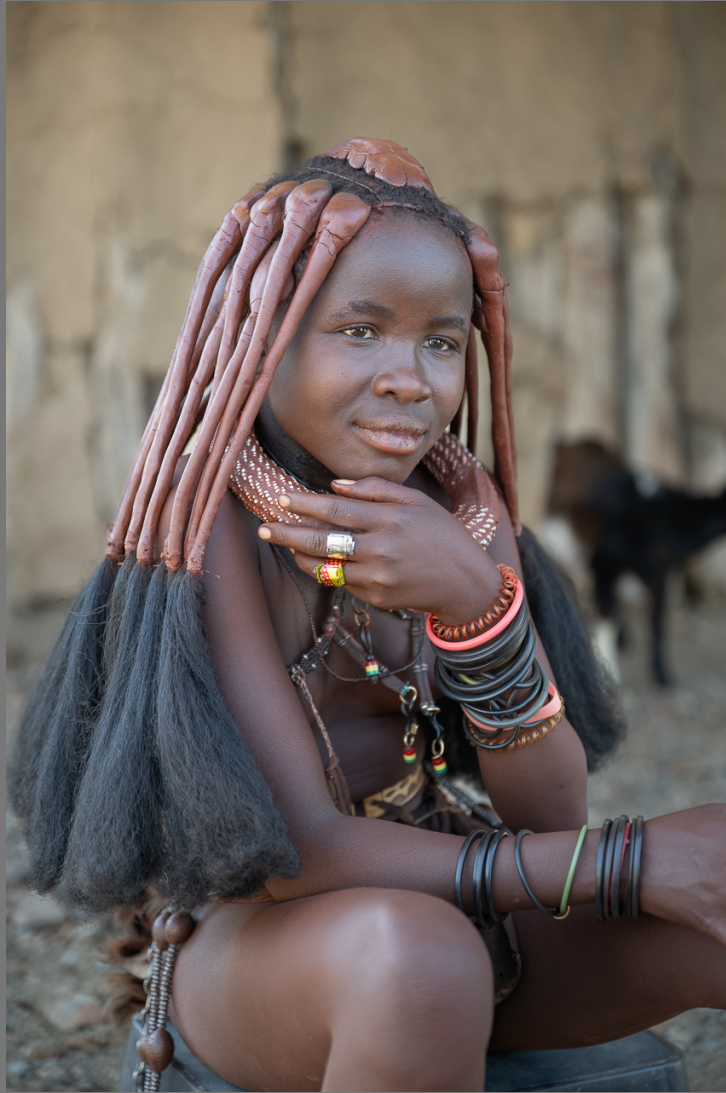
“TRADITIONAL HIMBA” by DAVID WILKINS

Southern California Council of Camera Clubs