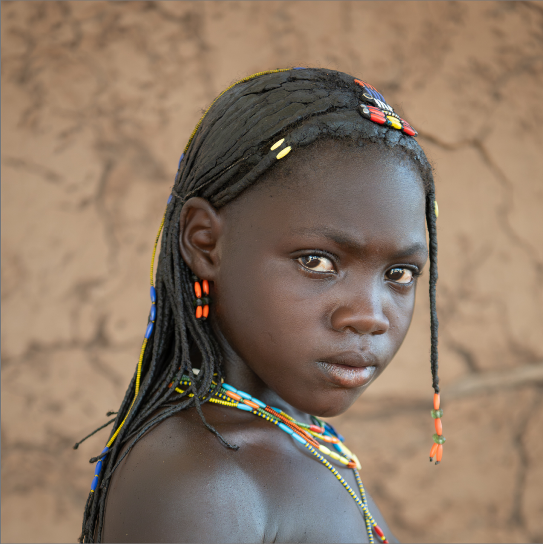
“YOUNG ZEMBA GIRL” by CHRISTINE WILKINS

Southern California Council of Camera Clubs