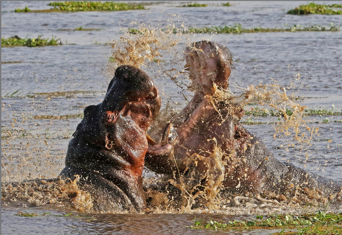
“FIGHTING HIPPOS IN RIVER 1931” by CHARLES STRICKER

Southern California Council of Camera Clubs