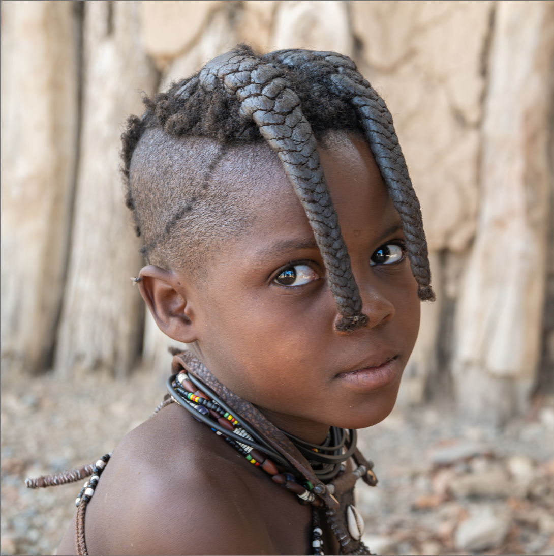
"YOUNG HIMBA GIRL-2" by CHRISTINE WILKINS

Southern California Council of Camera Clubs