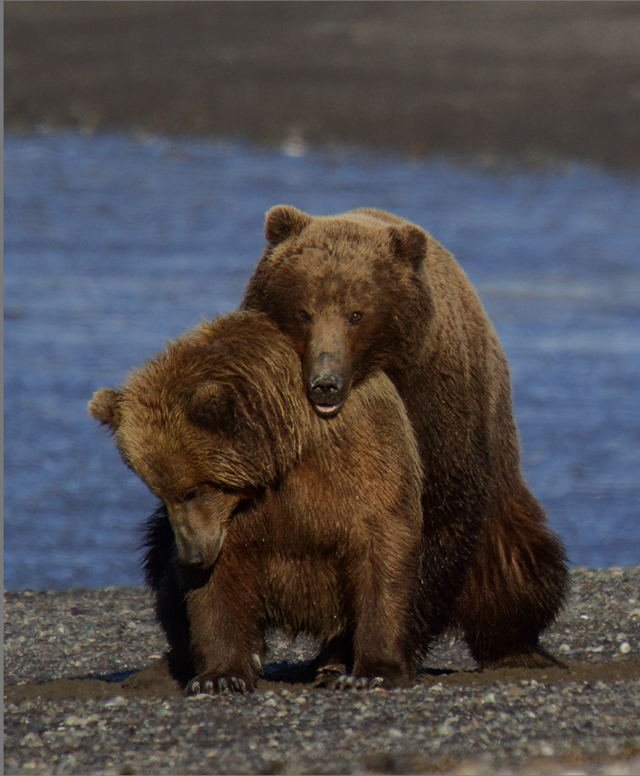
“NEXT YEAR'S CUBS” by DARCY QUIMBY

Southern California Council of Camera Clubs