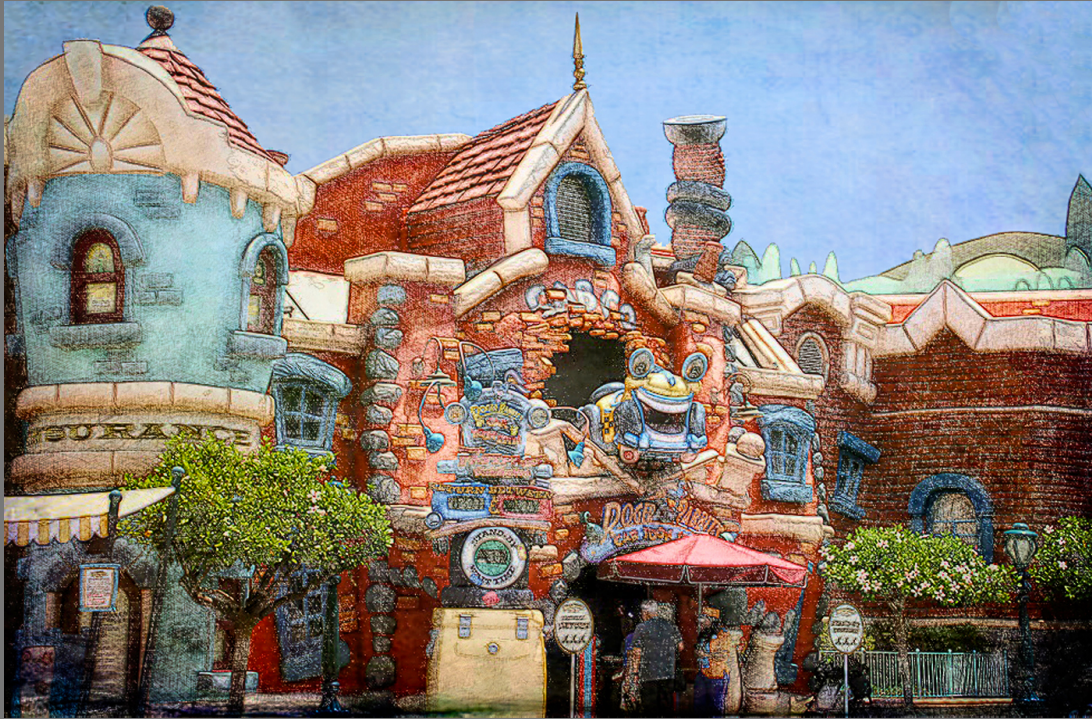
“DISNEY TOONTOWN FS” by DIANE PECK

Southern California Council of Camera Clubs