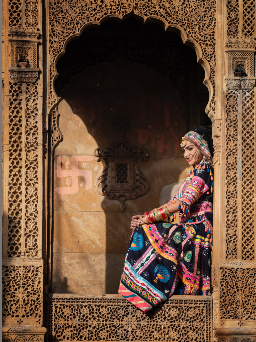
"COLORFUL MODEL" by USHA PEDDAMATHAM

Southern California Council of Camera Clubs