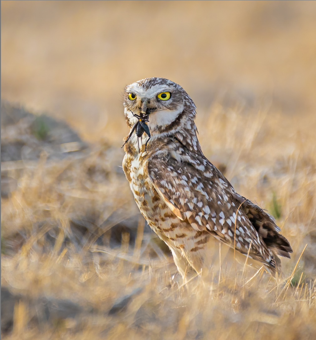
“CAUGHT A BUG” by KATHRYN NEWMAN

Southern California Council of Camera Clubs