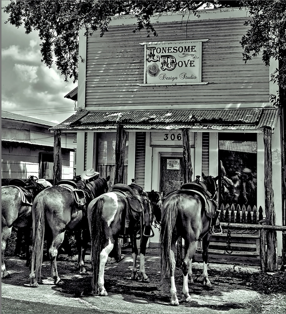
"COWBOY CITY STEET PARKING-M" by SCOTT SHACKELFORD

Southern California Council of Camera Clubs