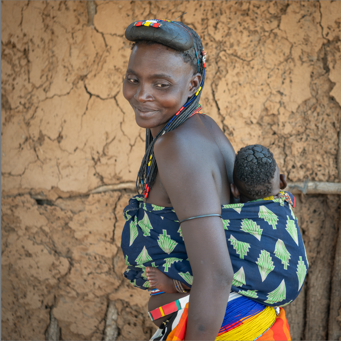
“ZEMBA MOTHER AND CHILD” by CHRISTINE WILKINS

Southern California Council of Camera Clubs