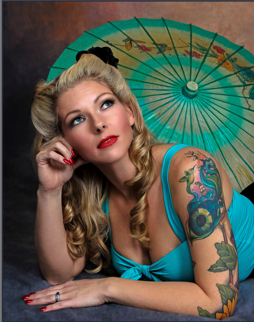
"PINUP DREAMIN" by CRYSTAL OLGUIN

Southern California Council of Camera Clubs