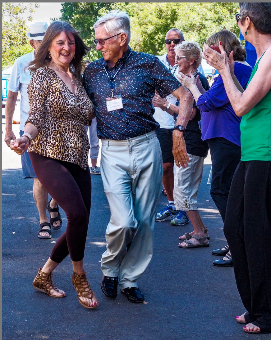
“DANCING FOOLS” by DONNA JUDD

Southern California Council of Camera Clubs