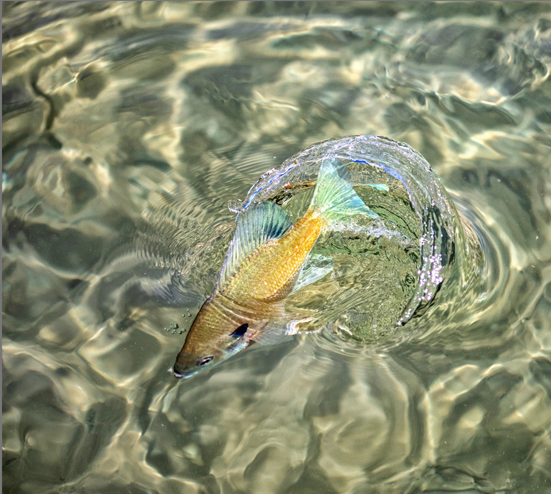
"FISH OUT OF WATER" by DEBORA SUTERKO

Southern California Council of Camera Clubs