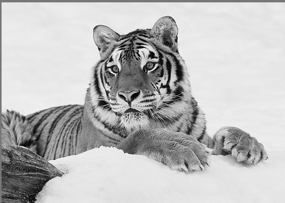
“RELAXED TIGER” by SANDRA CRANTZ

Southern California Council of Camera Clubs