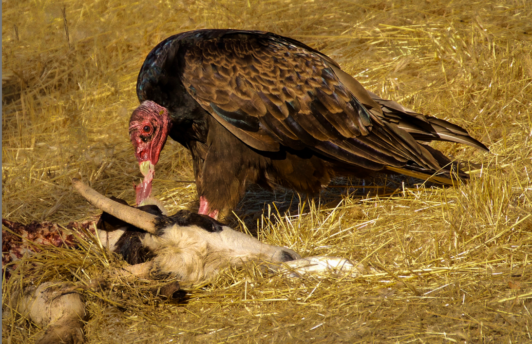
“DINNER TIME” by HARRY WANG

Southern California Council of Camera Clubs