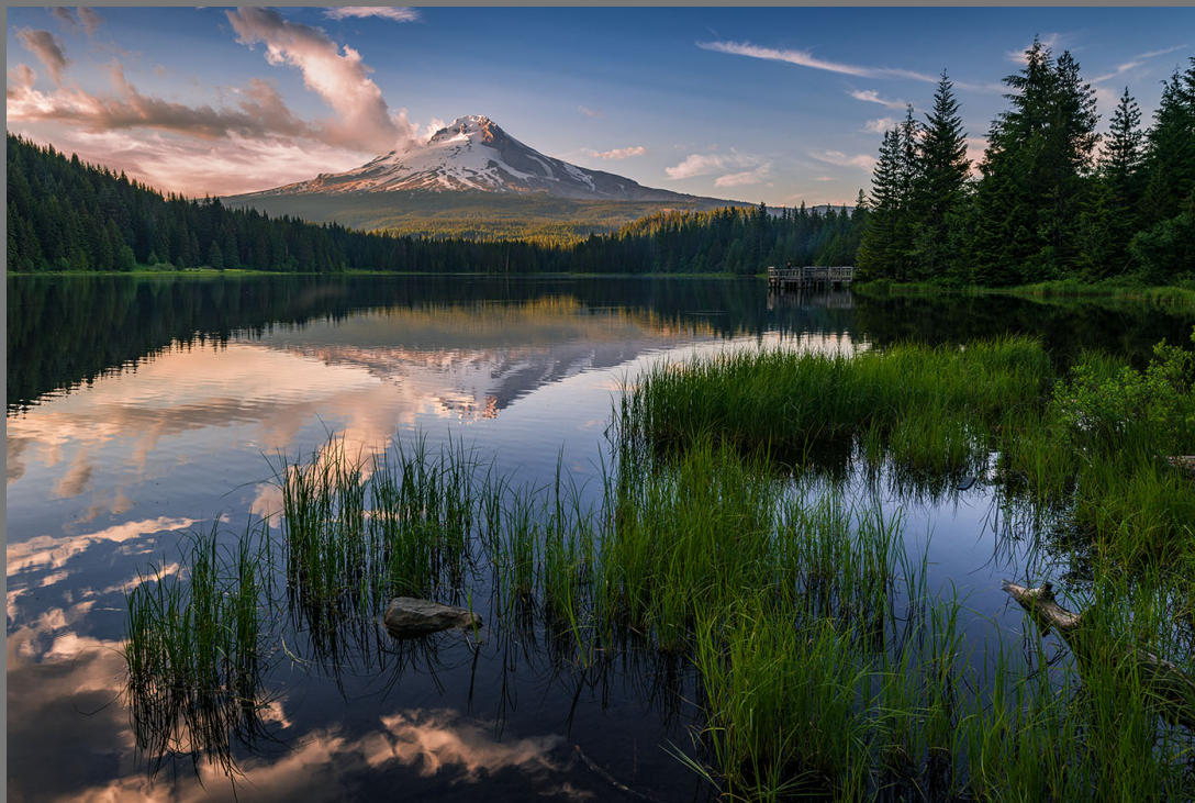
“SCENE AT TRILLIUM LAKE” by CHUCK ZAMITES

Southern California Council of Camera Clubs