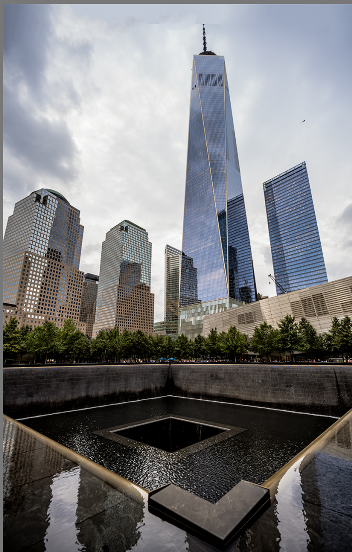
“NEW WTC WITH MEMORIAL NYC” by JAMES WAT

Southern California Council of Camera Clubs