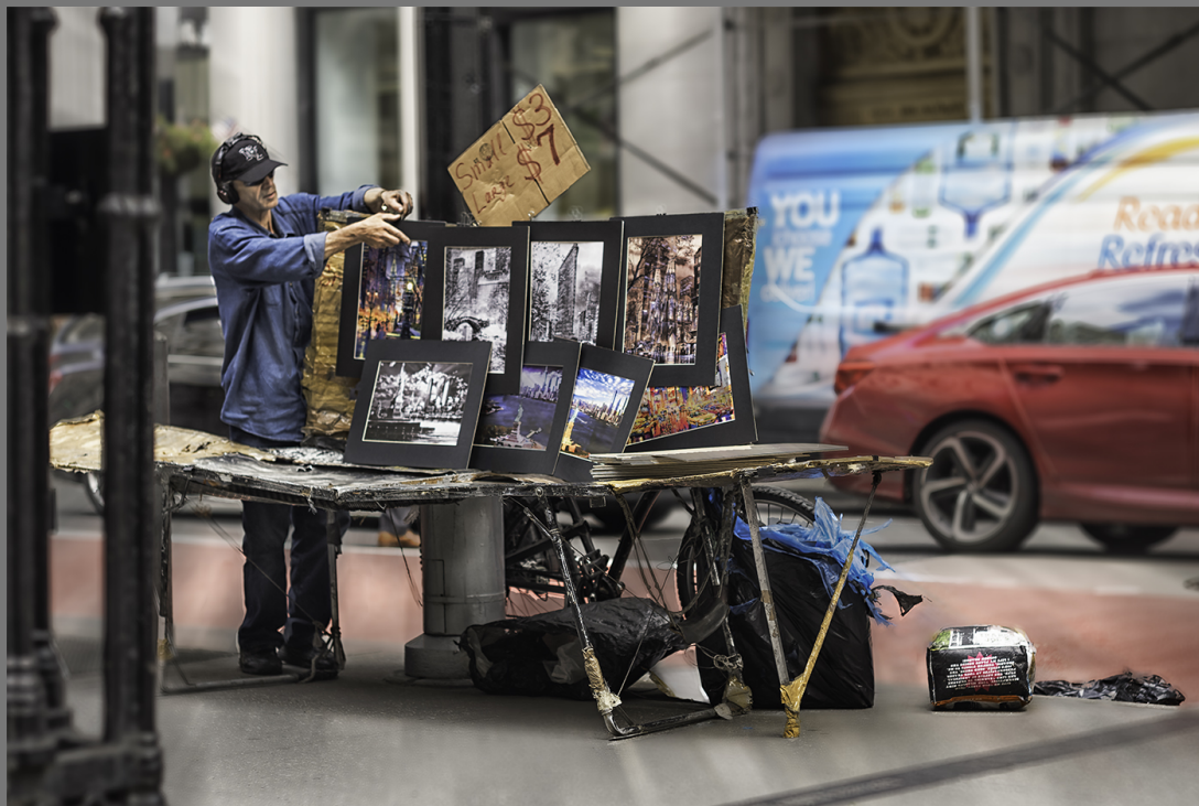
"THE PICTURE VENDOR NYC" by JAMES WAT

Southern California Council of Camera Clubs