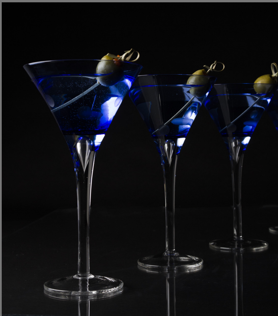
“CHEERS”

Southern California Council of Camera Clubs