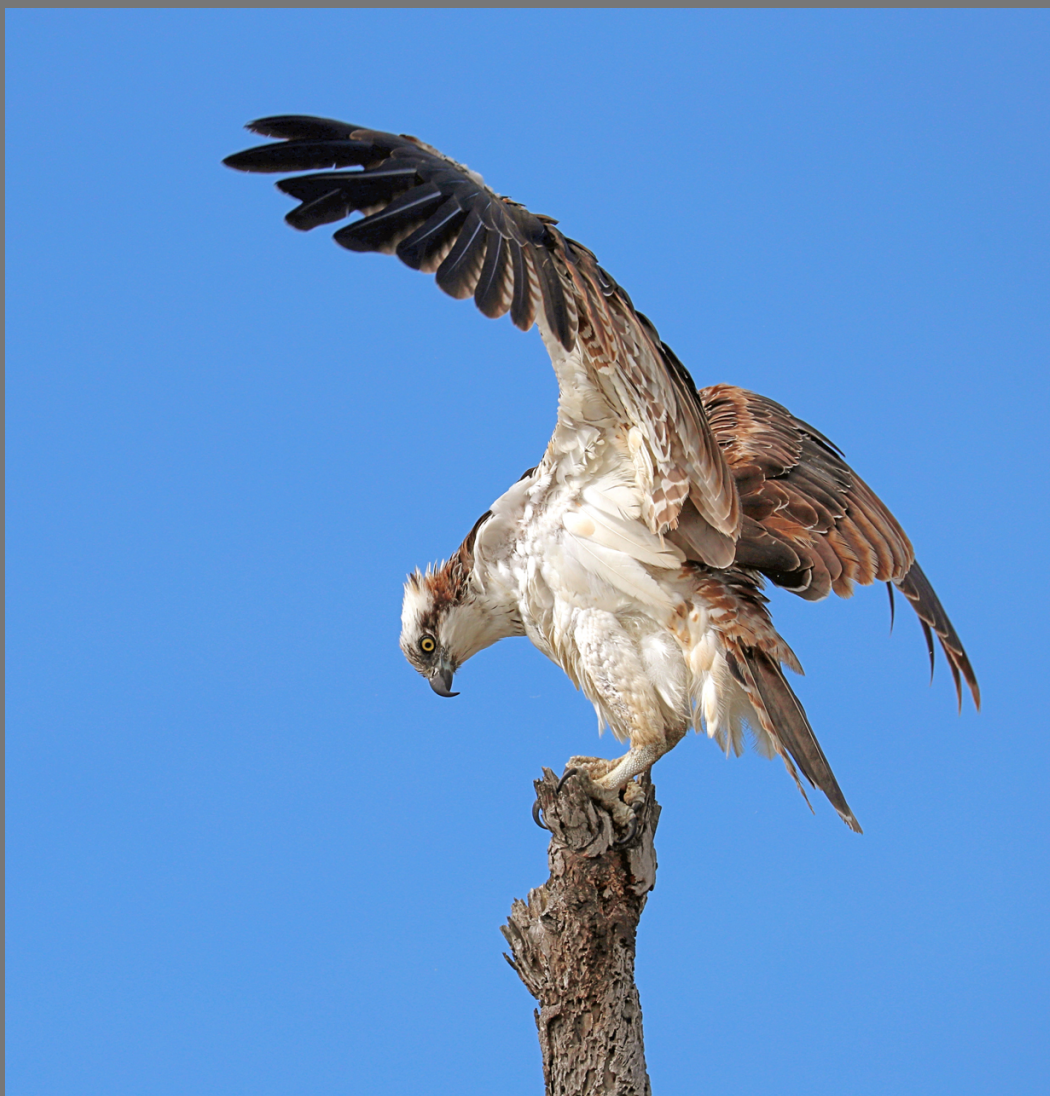
“GRACEFUL LANDING” by LORI KRUM

Southern California Council of Camera Clubs