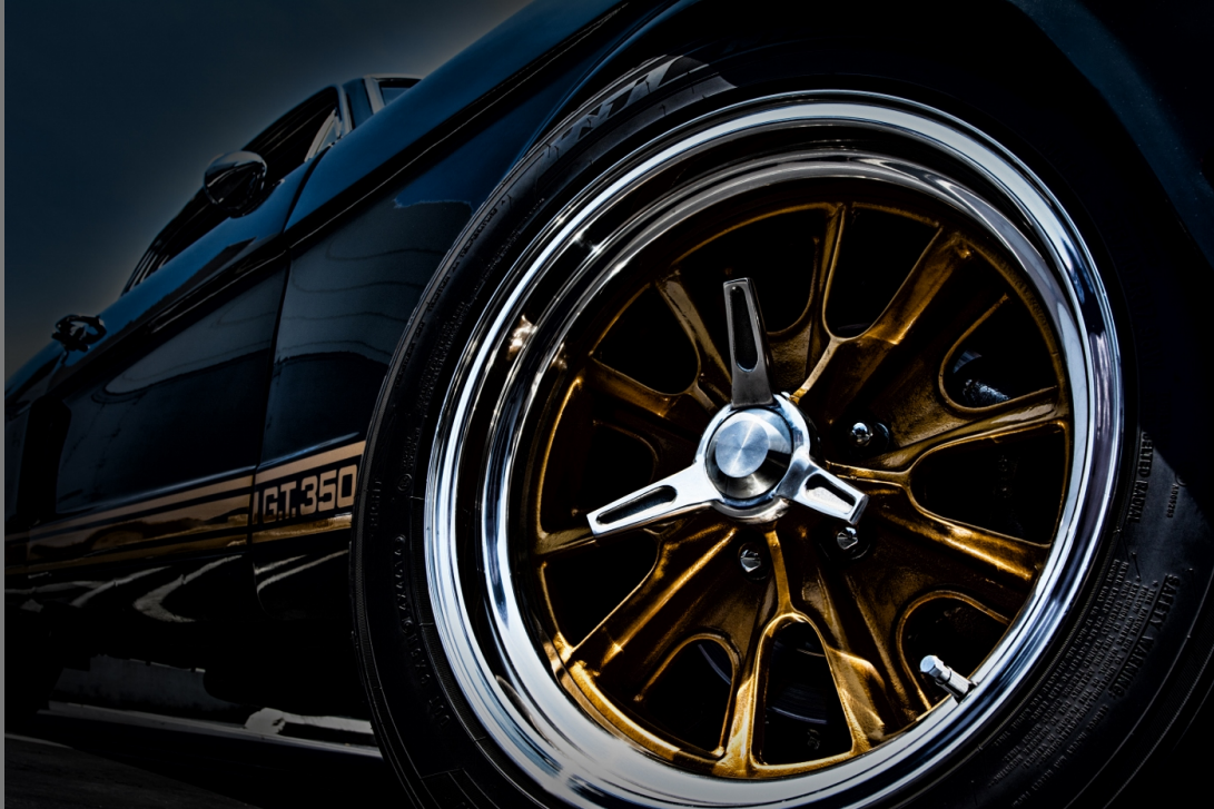
"GT 350 STANCE" by KEN RANDALL

Southern California Council of Camera Clubs