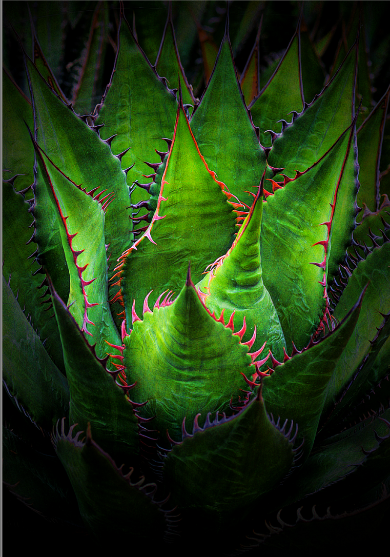
“THE AGAVE” by BARBARA BURKE

Southern California Council of Camera Clubs