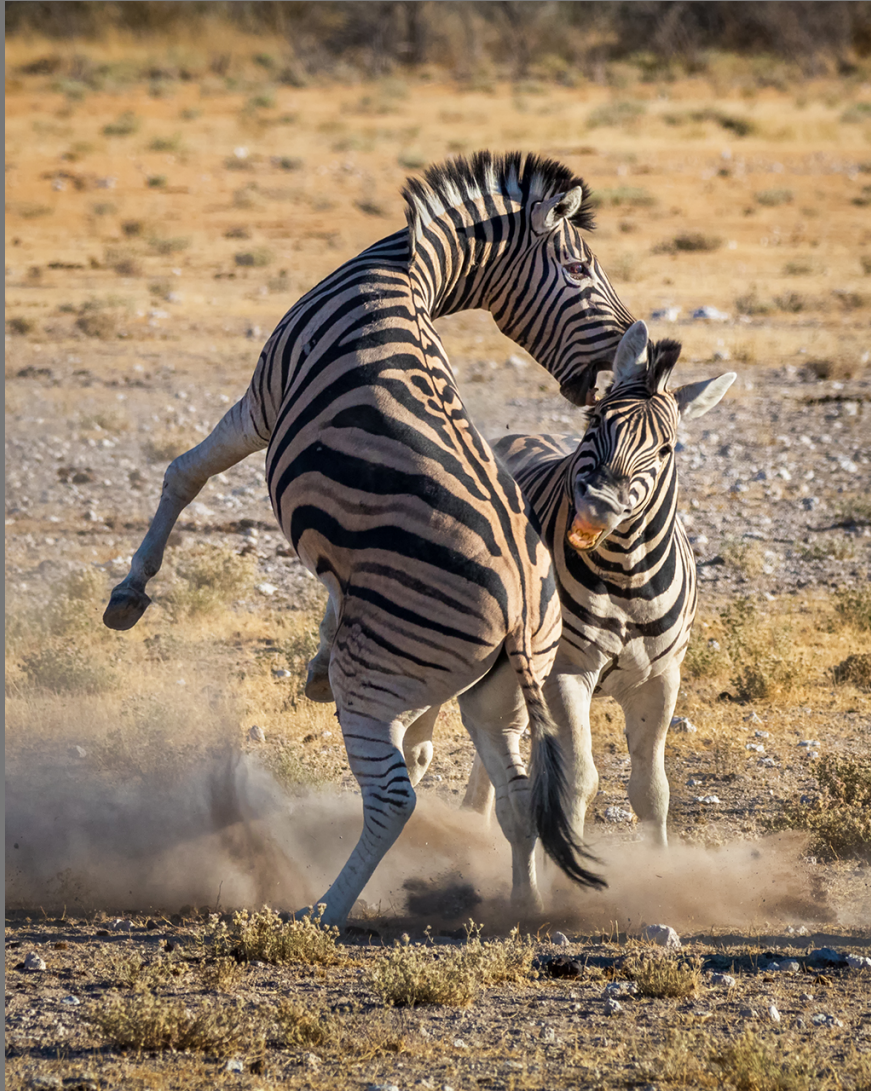
“FIGHTING ZEBRAS 2” by PETER SCIFRES

Southern California Council of Camera Clubs