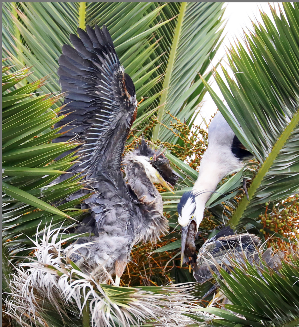
"DINNER" by LORI KRUM

Southern California Council of Camera Clubs