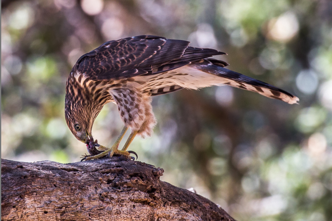
"HAWK EATING LIZARD" by JEFF FRETZ

Southern California Council of Camera Clubs