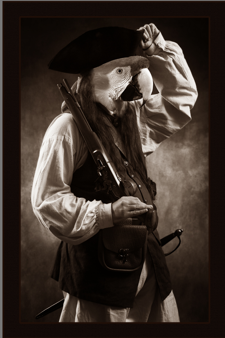
“THE PARROT PIRATE” by CRYSTAL OLGUIN

Southern California Council of Camera Clubs