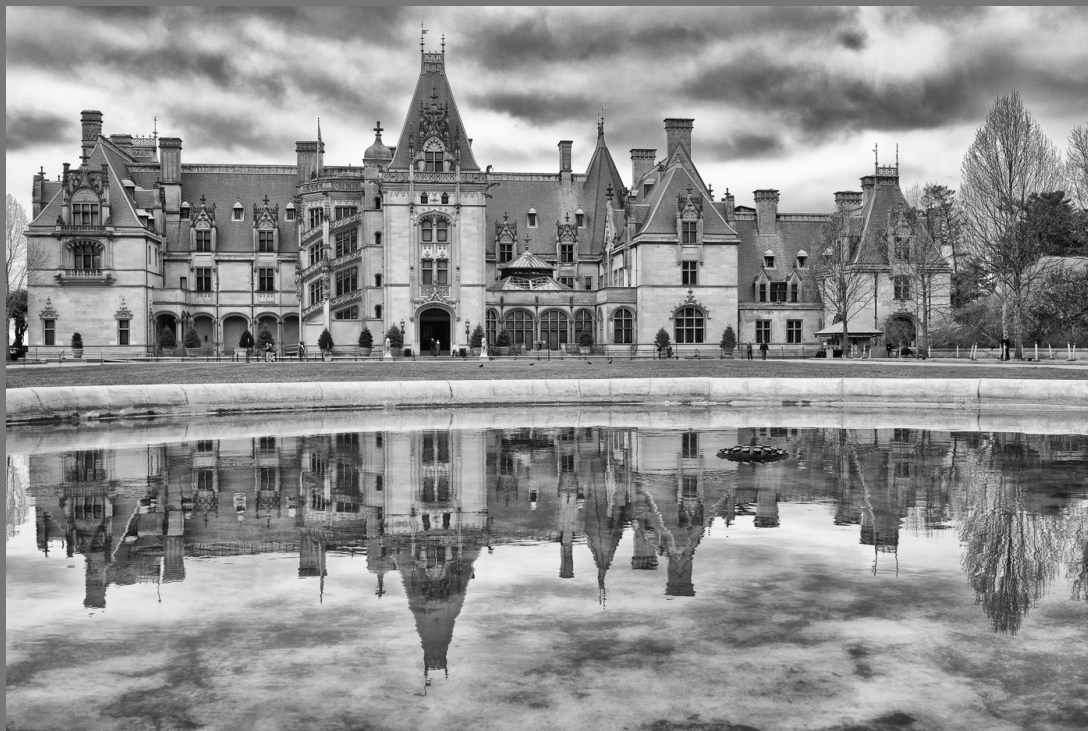
"THE BILTMORE ESTATE" by DAVID WILKINS

Southern California Council of Camera Clubs