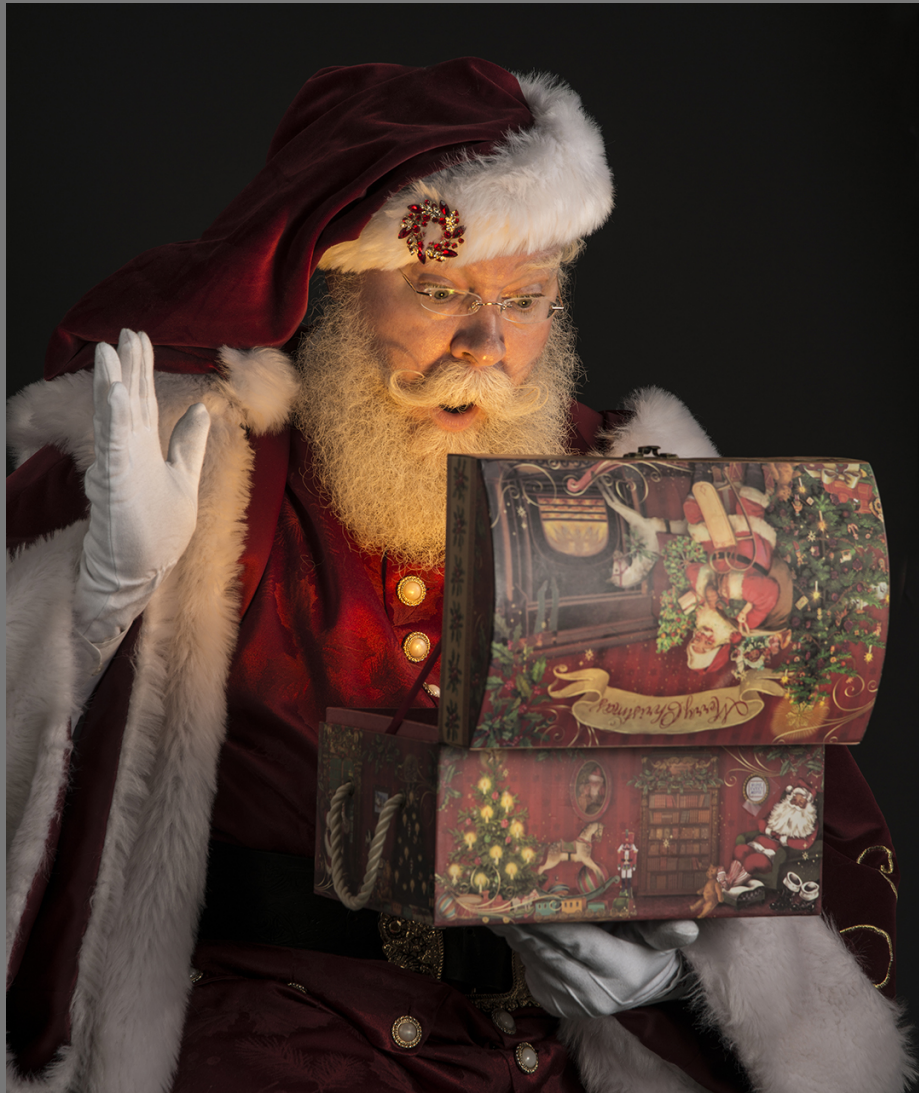
"BOX OF MAGIC 6881" by SUZANNE GONZALEZ

Southern California Council of Camera Clubs