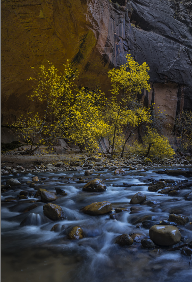
“ZION NARROWS AND YELLOW TREE” by PETER SCIFRES

Southern California Council of Camera Clubs