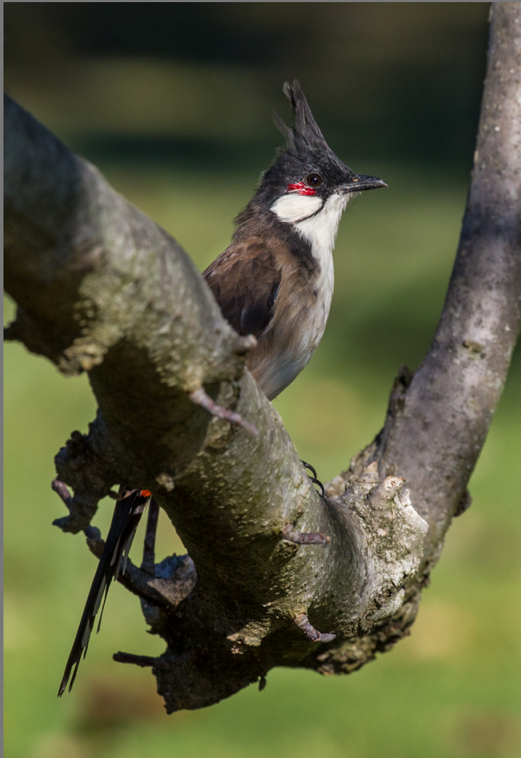
“RED WISKERED BULBUL” by JEFF FRETZ

Southern California Council of Camera Clubs