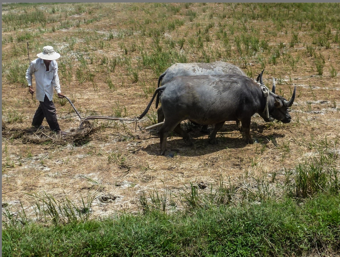
“VIETNAM TRACTOR” by JERI CONKLIN

Southern California Council of Camera Clubs