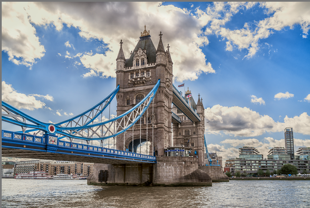
“TOWER BRIDGE-LONDON” by JAMES WAT

Southern California Council of Camera Clubs