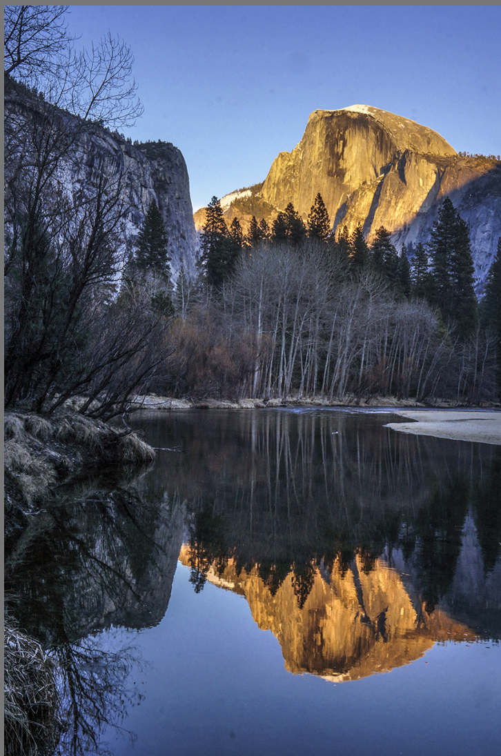
“YOSEMITE REFLECTION” by JOHN HOUSEMAN

Southern California Council of Camera Clubs