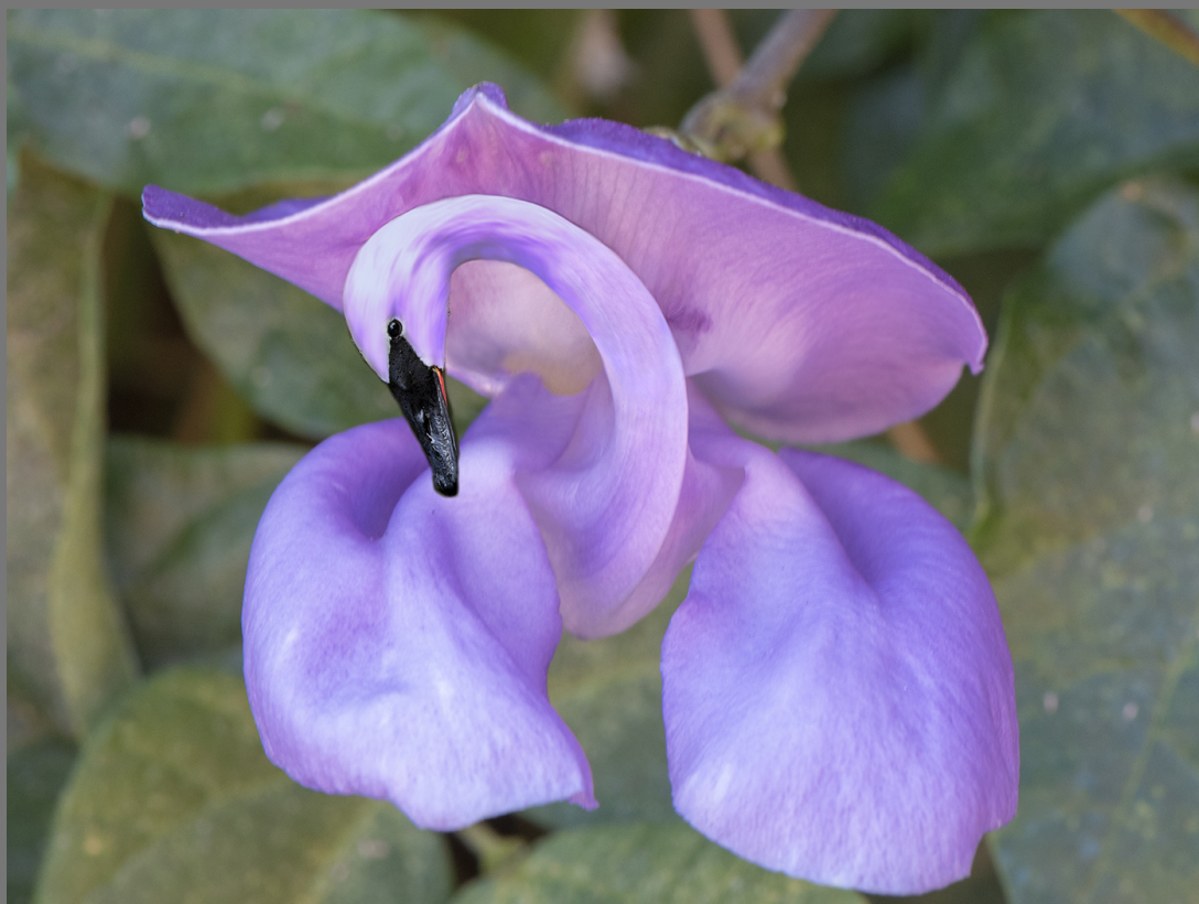
"SWAN FLOWER" by GARY EARL

Southern California Council of Camera Clubs