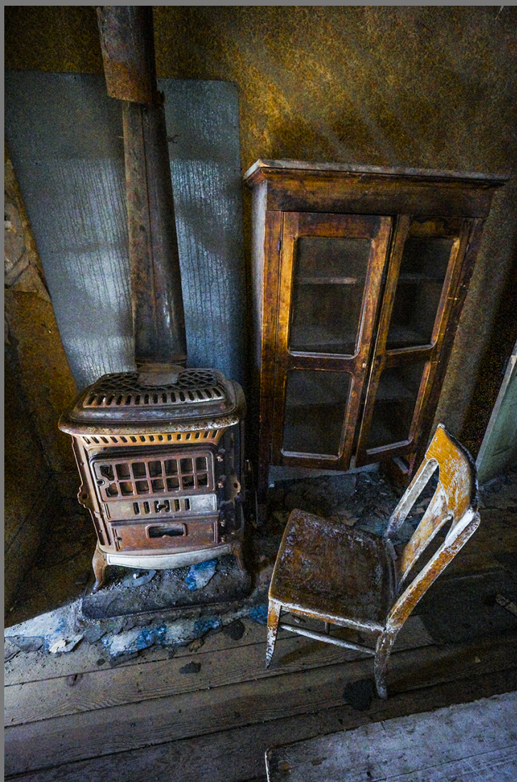
“WESTERN SETTING” by JOHN HOUSEMAN

Southern California Council of Camera Clubs