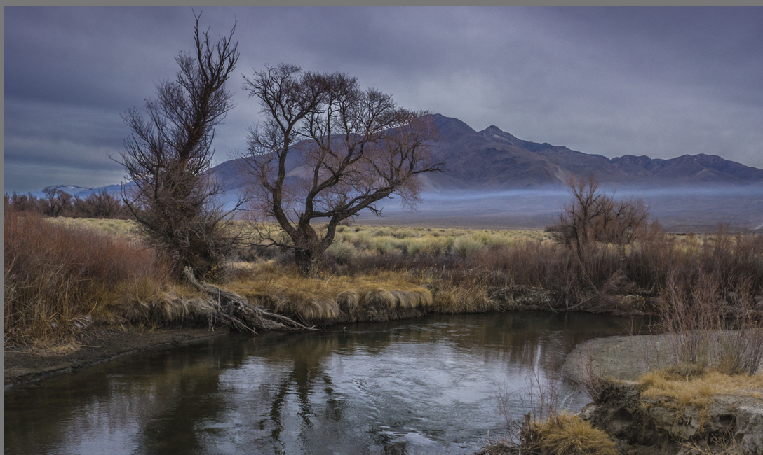
“OWENS RIVER” by JOHN HOUSEMAN

Southern California Council of Camera Clubs