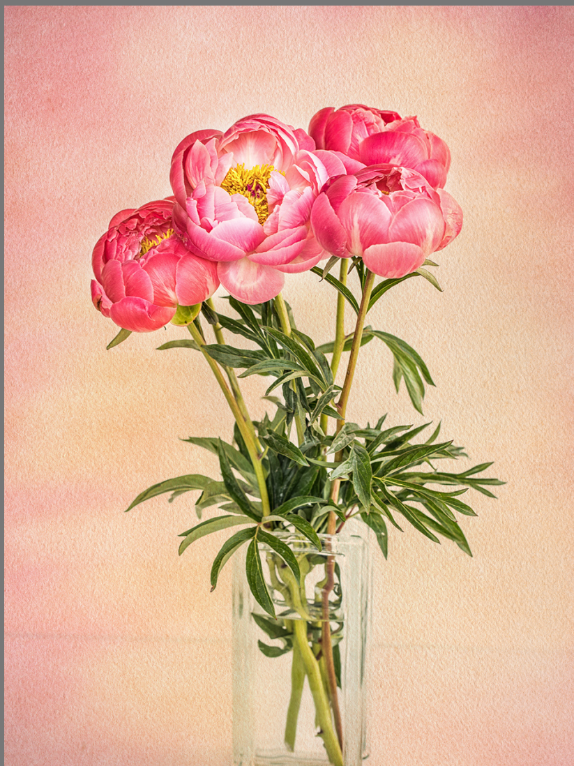
"PINK PEONY PLEASURE" by DEBORA SUTERKO

Southern California Council of Camera Clubs