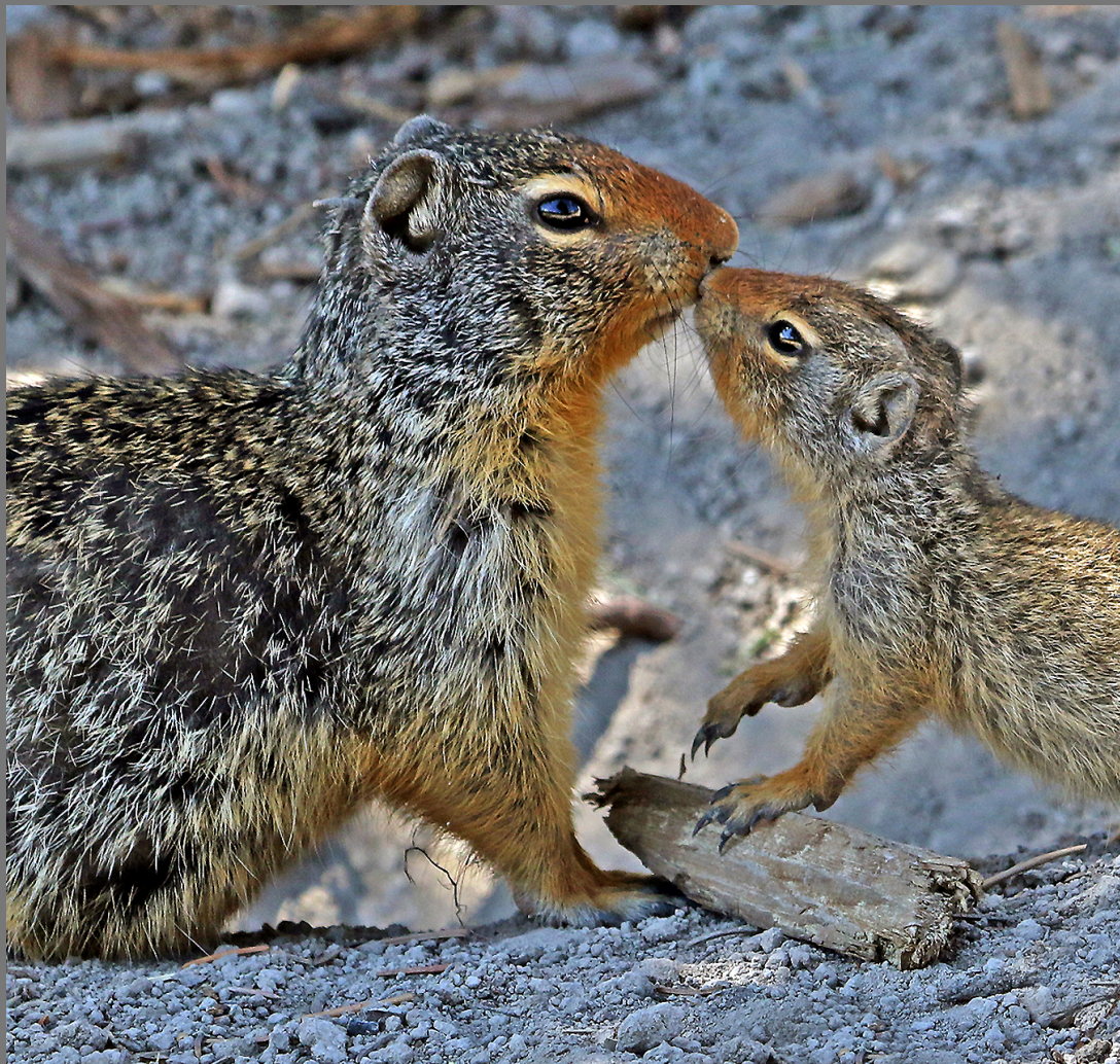
"BABY GOPHER KISSES MOTHER 1490" by CHARLES STRICKER

Southern California Council of Camera Clubs