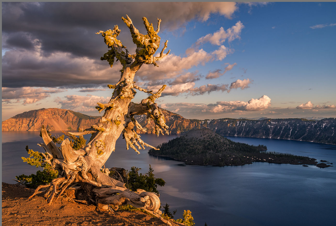
“CRATER LAKE SCENE” by CHUCK ZAMITES

Southern California Council of Camera Clubs