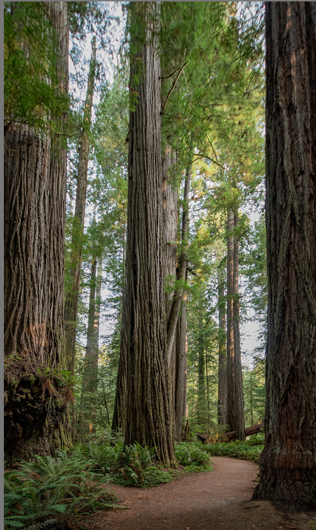
“AMONG THE GIANTS” by RUSSELL TROZERA

Southern California Council of Camera Clubs