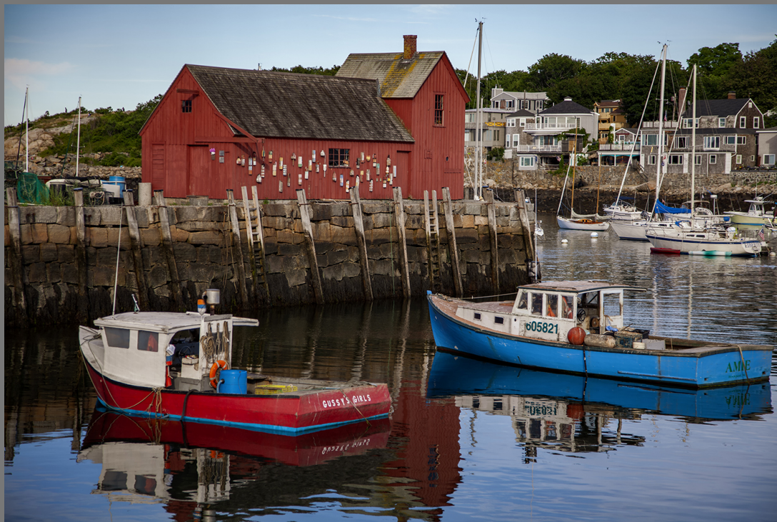
“ROCKPORT HARBOR” by LARRY WHITE

Southern California Council of Camera Clubs