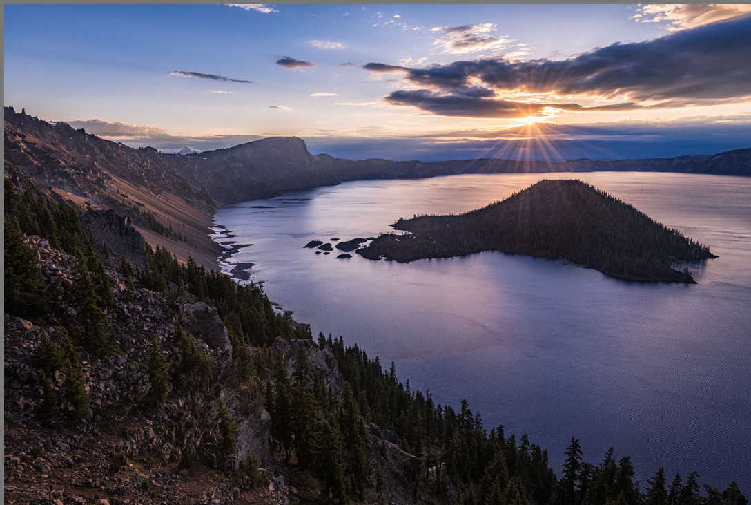
"SUNRISE AT CRATER LAKE" by CHUCK ZAMITES

Southern California Council of Camera Clubs