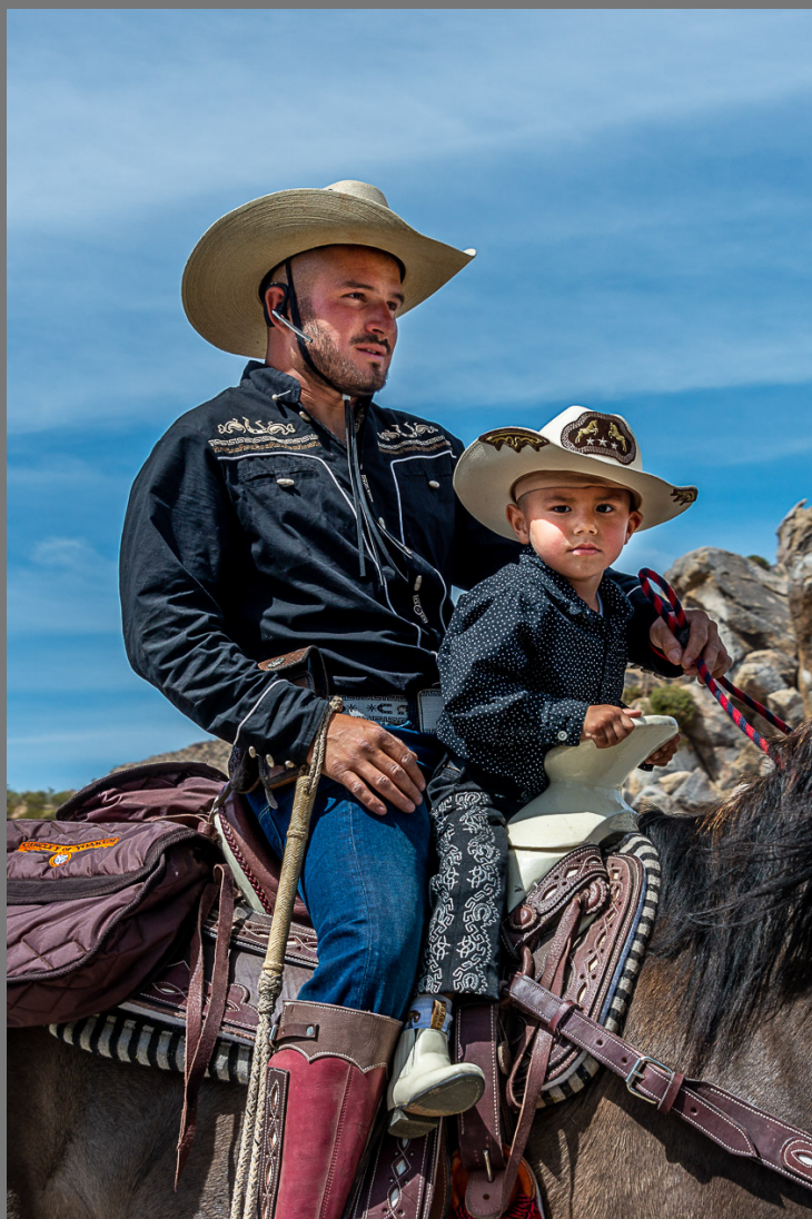
"A RIDE WITH DAD" by TERRY DICKERSON

Southern California Council of Camera Clubs