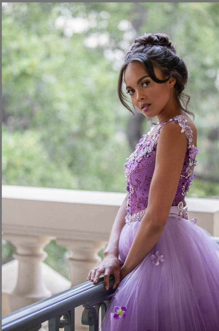
“TIFFANY IN PINK” by LARRY WHITE

Southern California Council of Camera Clubs