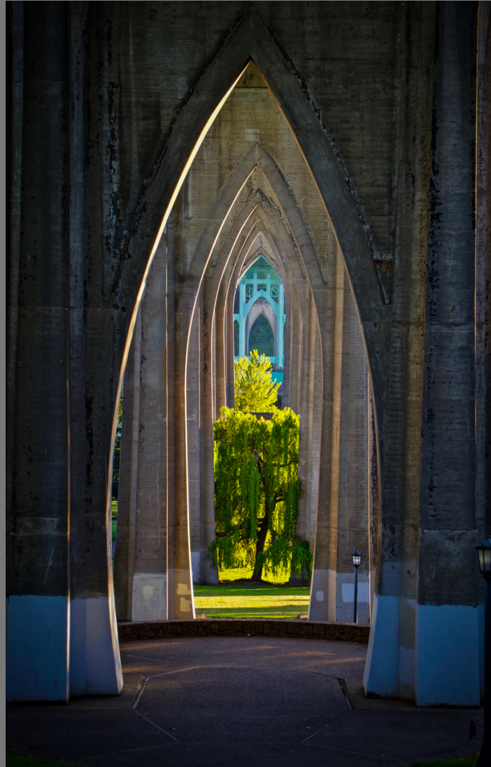
“CATHEDRAL UNDER THE BRIDGE” by HARRY WANG

Southern California Council of Camera Clubs