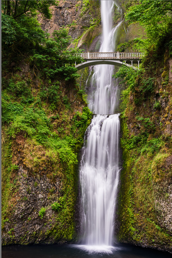
“VIEW OF MULTNOMAH FALLS” by CHUCK ZAMITES

Southern California Council of Camera Clubs