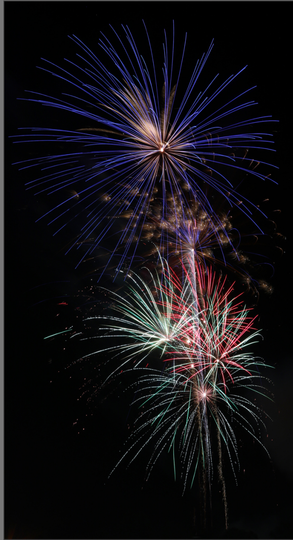
"JULY 4TH FIREWORKS 0348" by CHARLES STRICKER

Southern California Council of Camera Clubs