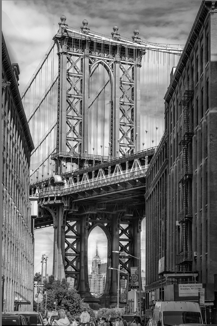
“MANHATTAN BRIDGE FROM BROOKLYN” by JAMES WAT

Southern California Council of Camera Clubs