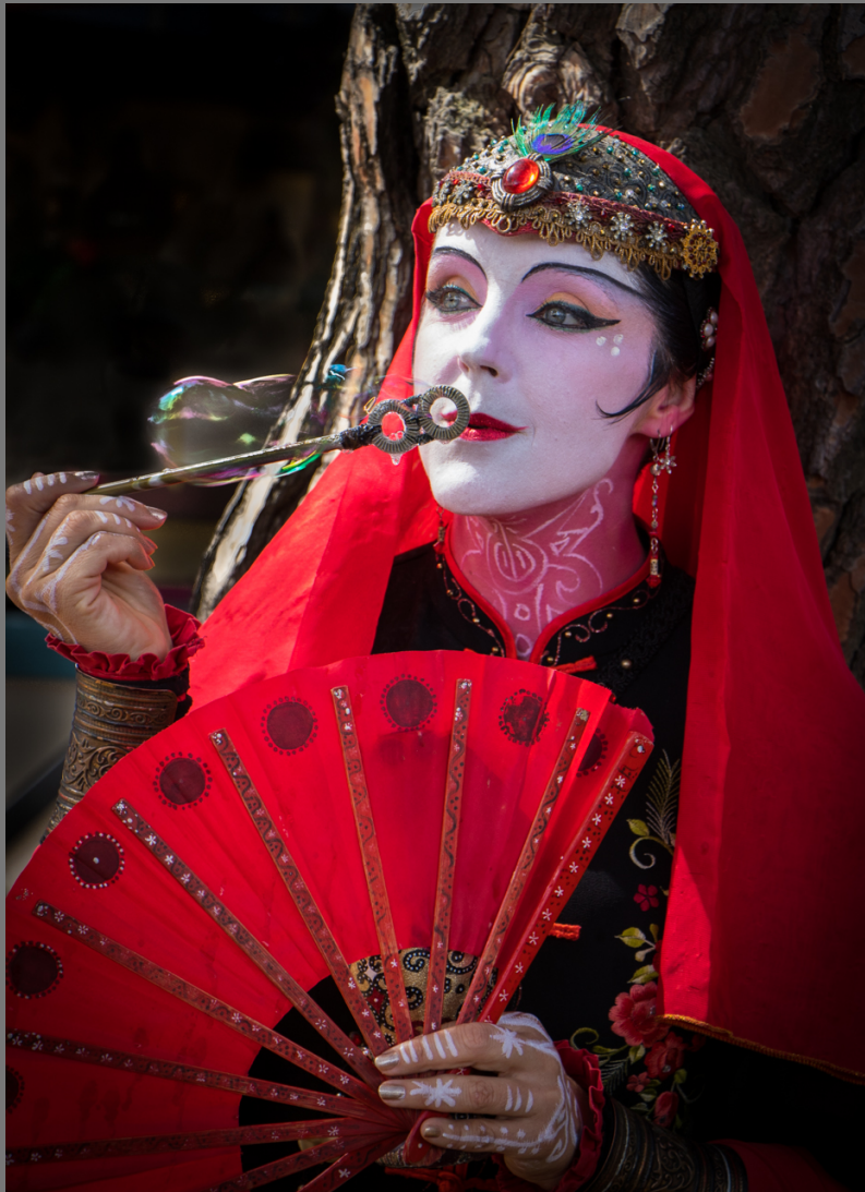
“RED FAN PRINCESS” by KITURAH WANG

Southern California Council of Camera Clubs