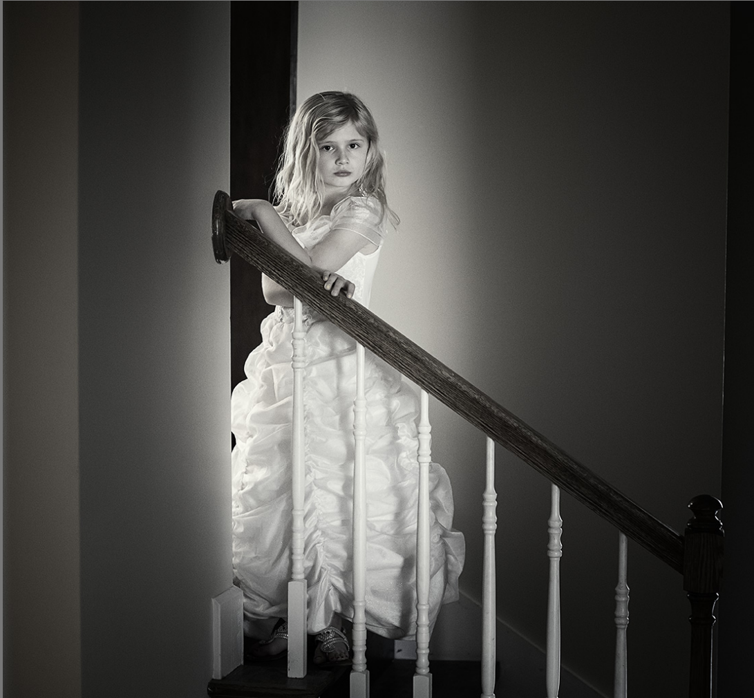
“TOP OF THE STAIRS” by DEBORA SUTERKO

Southern California Council of Camera Clubs