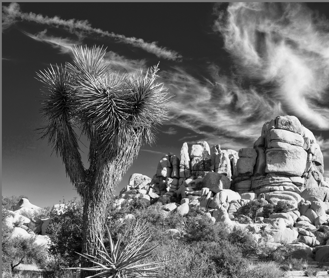
“HIGH DESERT” by JAMES COLLIER

Southern California Council of Camera Clubs