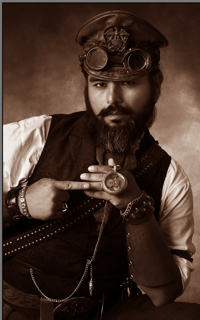
"WELL LOOK AT THE TIME" by CRYSTAL OLGUIN

Southern California Council of Camera Clubs