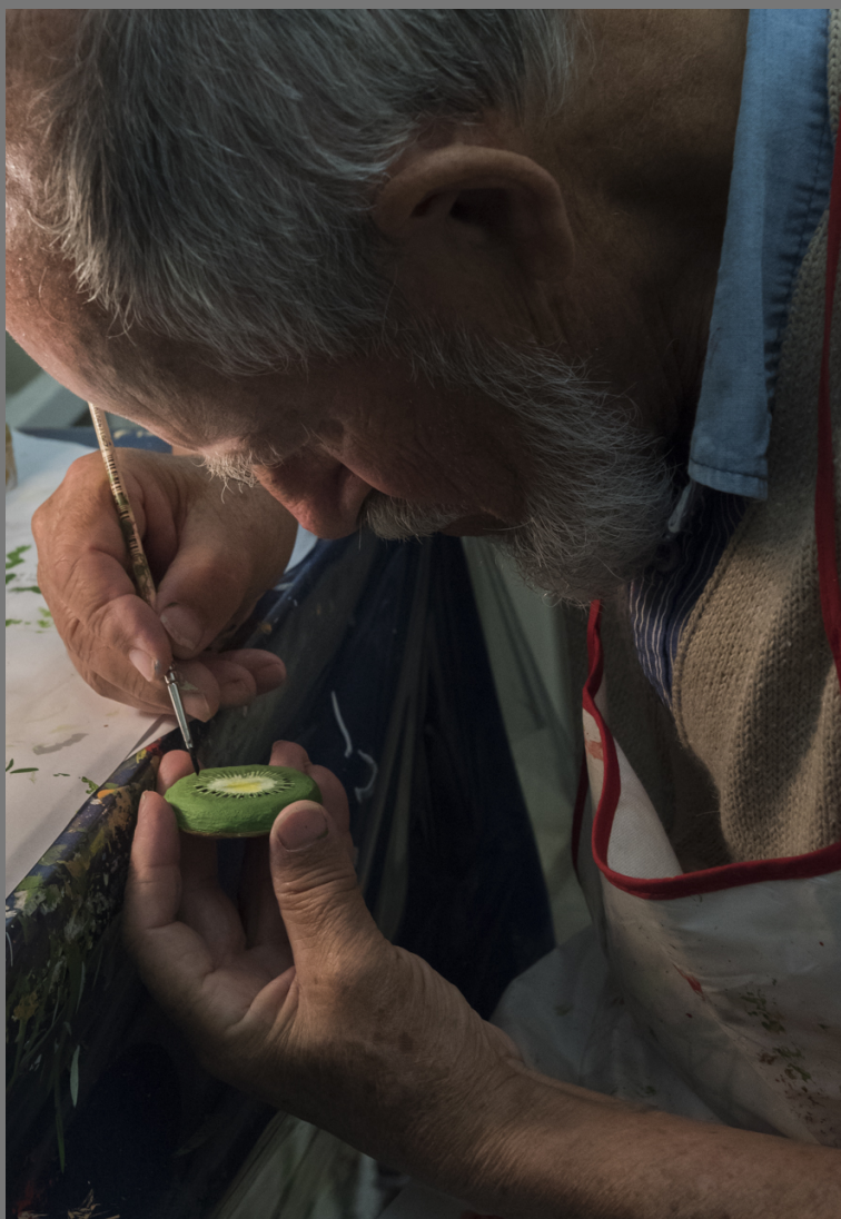
“THE ARTISAN”

Southern California Council of Camera Clubs