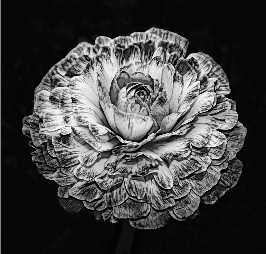
"RANUNCULA BEAUTY" by BARBARA BURKE

Southern California Council of Camera Clubs