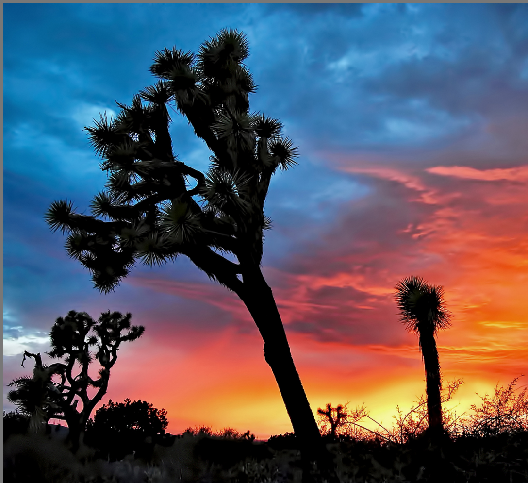
"PARTIAL JOSHUA SUNSET" by SCOTT SHACKELFORD

Southern California Council of Camera Clubs