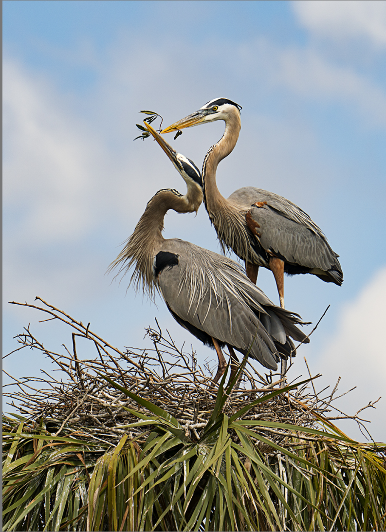
"GBH NEST BUILDING PAIR" by LILLIAN ROBERTS

Southern California Council of Camera Clubs