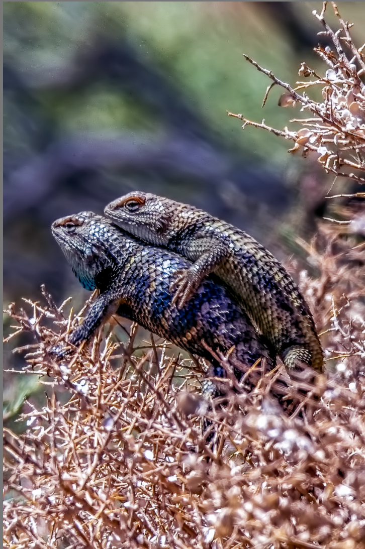
“LIZARD LOVE” by TERRY DICKERSON

Southern California Council of Camera Clubs