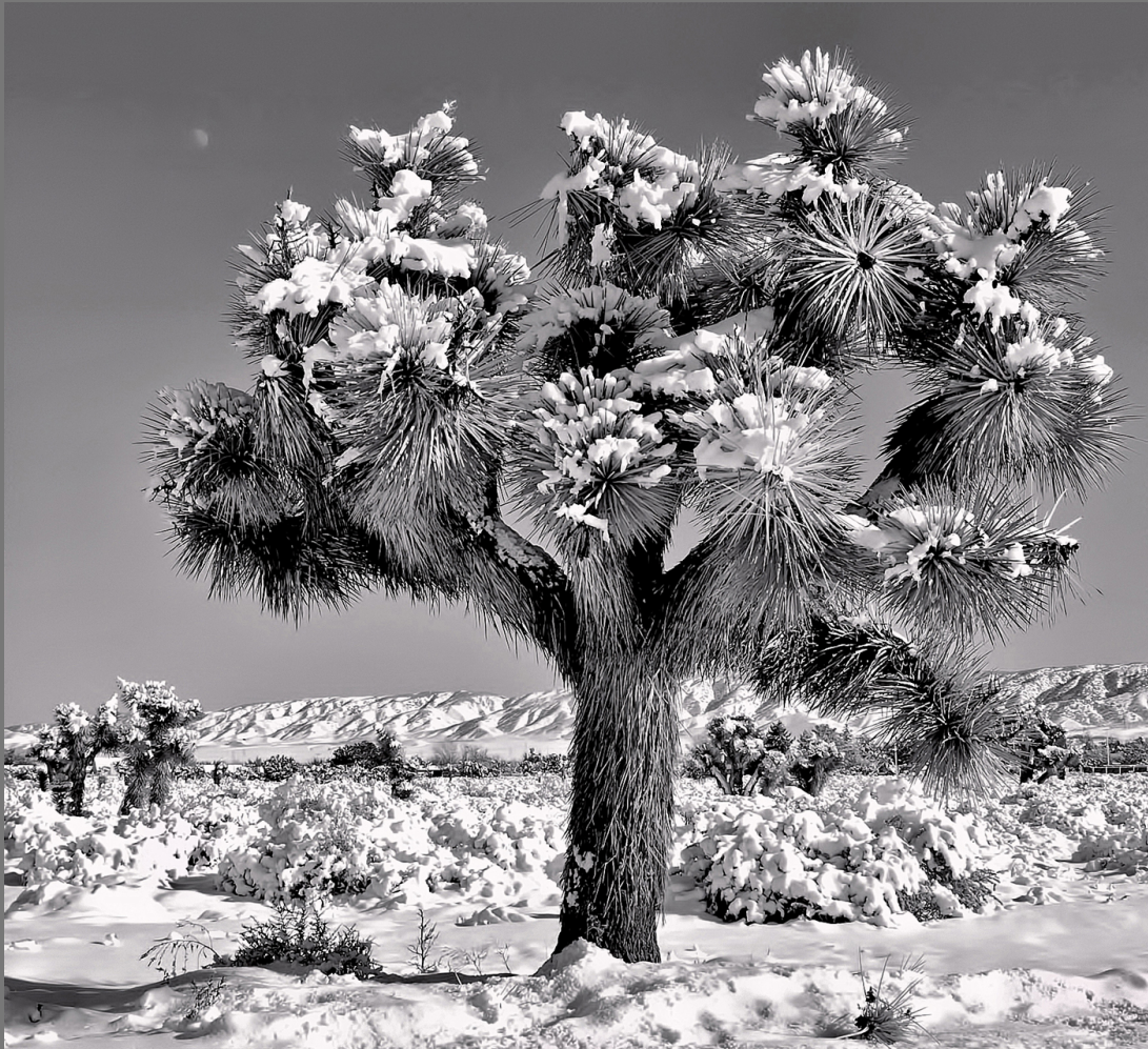
“MOON OVER SNOW JOSHUA” by SCOTT SHACKELFORD

Southern California Council of Camera Clubs