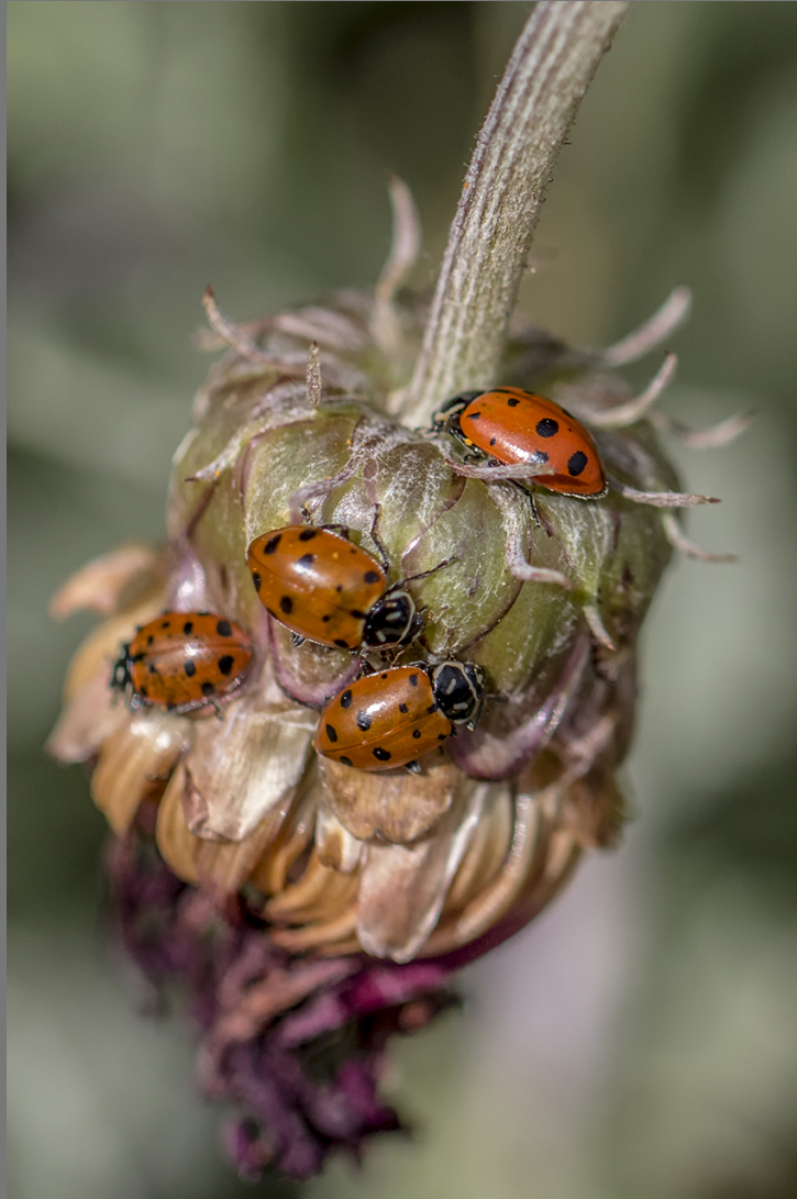
“LADY BUGS 4012” by LARRY WHITE

Southern California Council of Camera Clubs