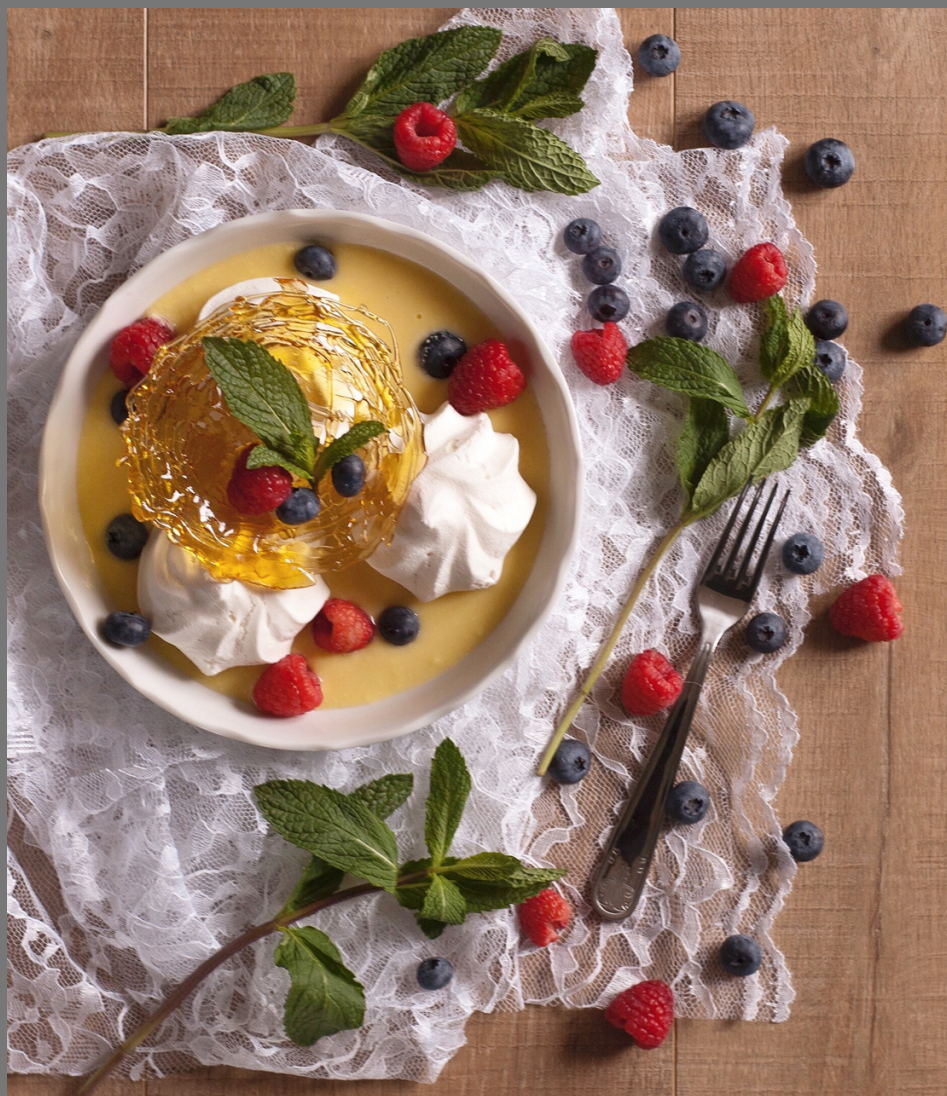
"FLOATING ISLANDS" by NEAL COTTER

Southern California Council of Camera Clubs