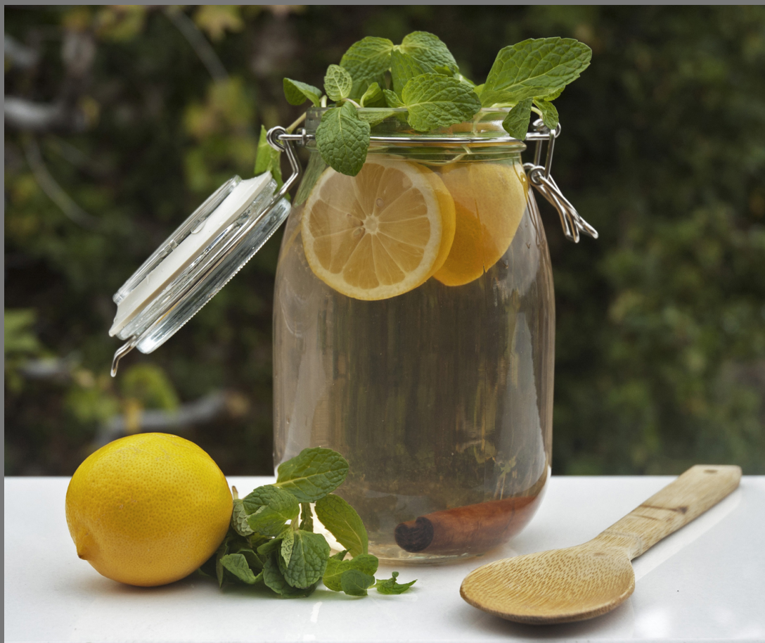
“CINNAMON SUN TEA” by NEAL COTTER

Southern California Council of Camera Clubs