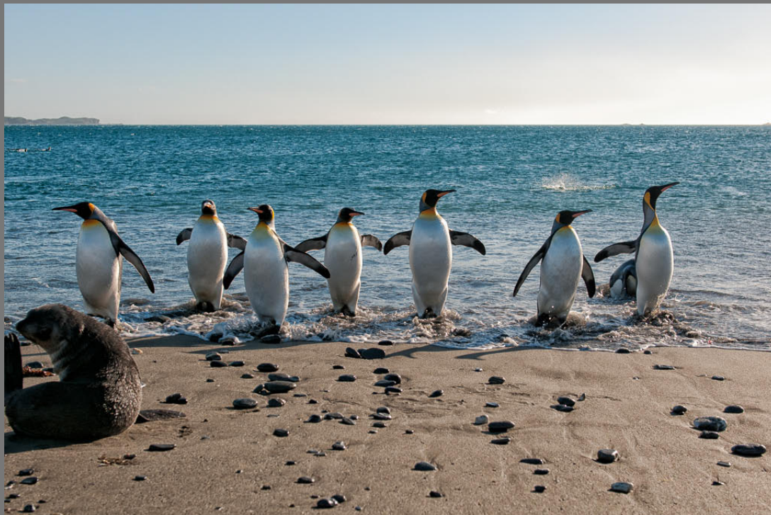
“King Penguins Return From The Sea” by David Wilkins

Southern California Council of Camera Clubs