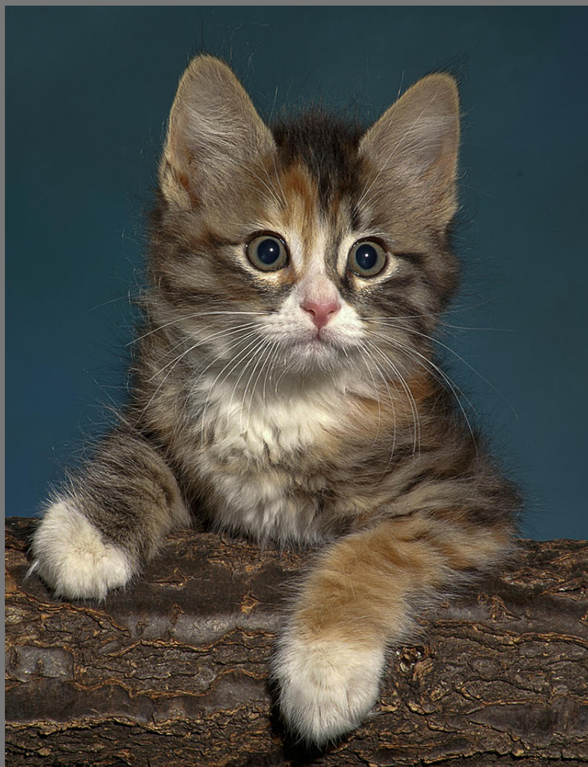
"Tri Color Kitten 0112" by Dale Gilkinson

Southern California Council of Camera Clubs