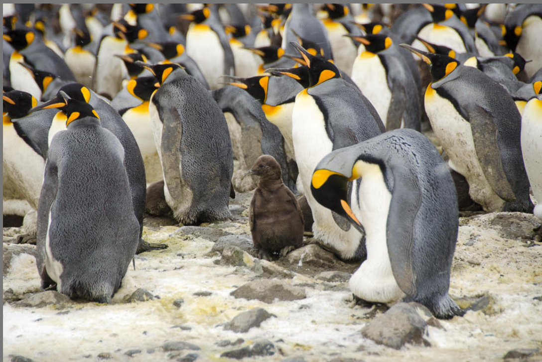
"Juvenile King Penguin In The Colony" by Christine Wilkins

Southern California Council of Camera Clubs