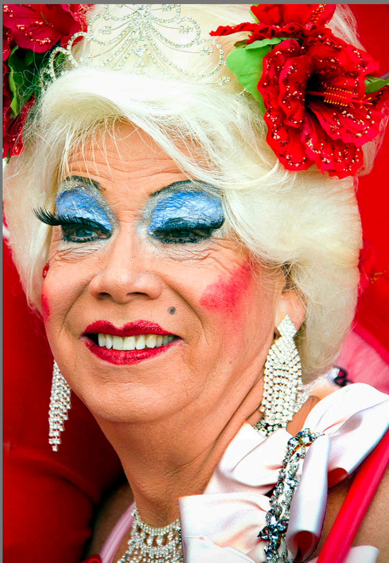
"Lots Of Color" by George Karlin

Southern California Council of Camera Clubs