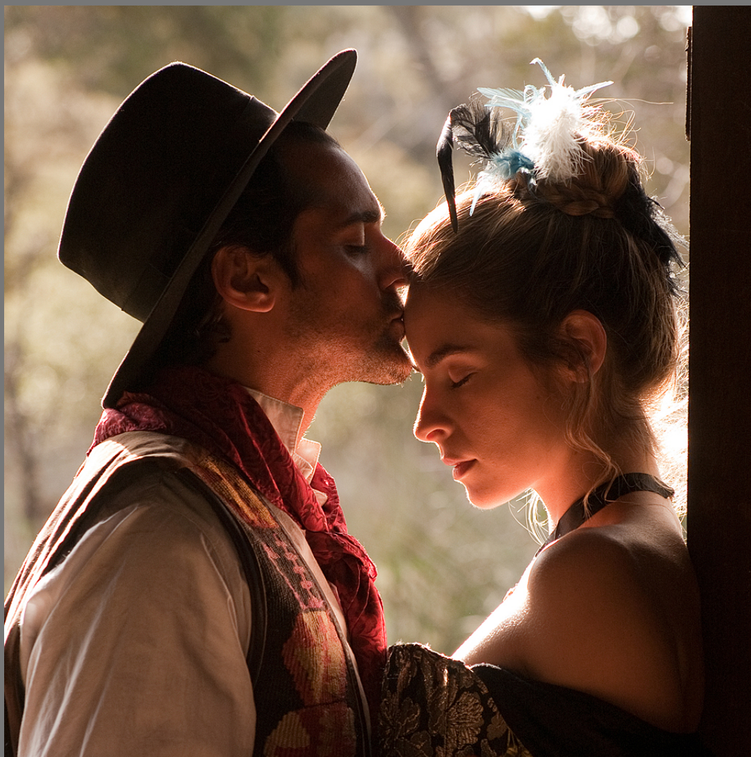
"The Kiss 1729" by Suzanne Gonzalez

Southern California Council of Camera Clubs