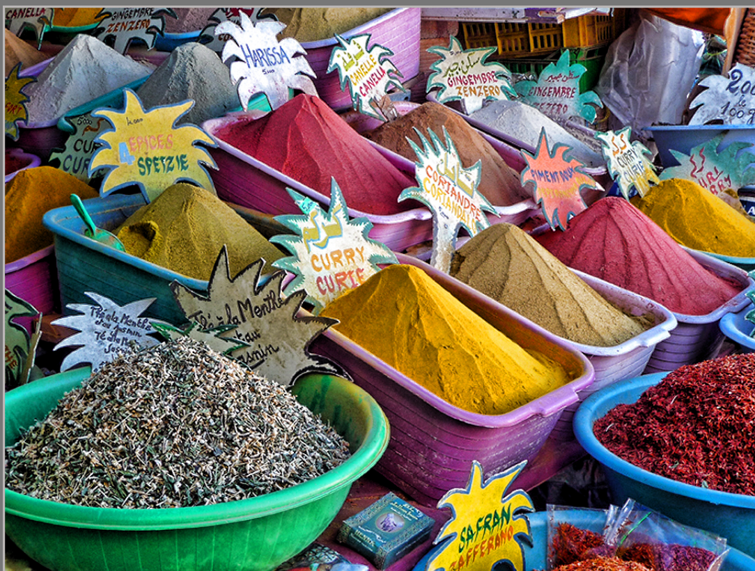
“Spices In Tunisia” by June Carr

Southern California Council of Camera Clubs