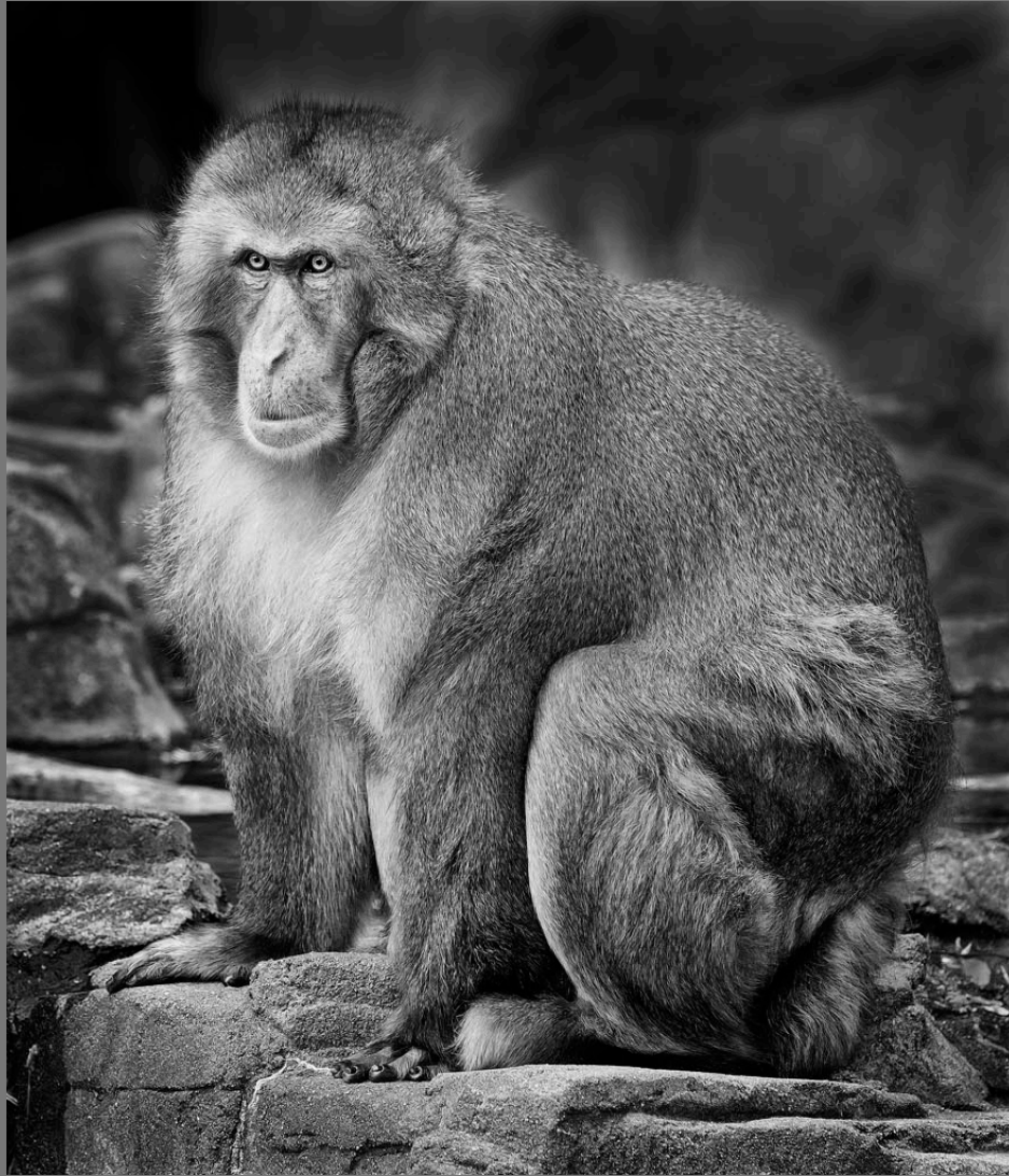
"Snow Monkey 1518" by Nan Carder

Southern California Council of Camera Clubs