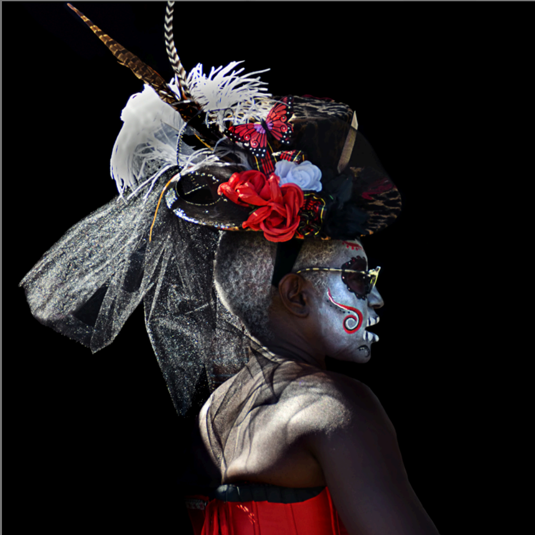
"Painted Lady" by Norma Warden

Southern California Council of Camera Clubs