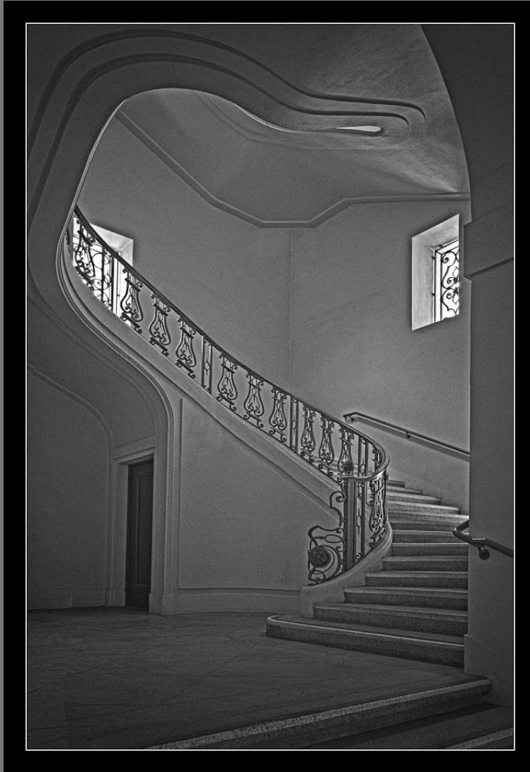
"Pasadena City Hall"

Southern California Council of Camera Clubs