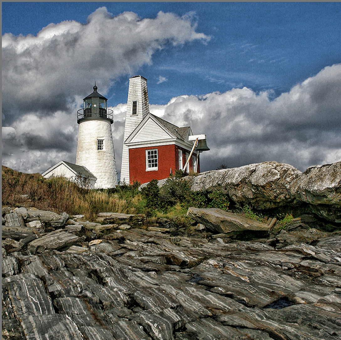
"Pemaquid Light" by Diane Peck

Southern California Council of Camera Clubs