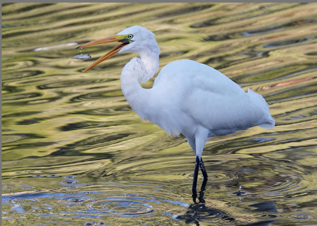
"Egret 8763" by Nan Carder

Southern California Council of Camera Clubs