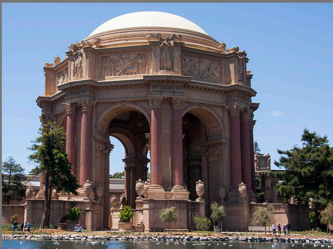
“Palace Of Fine Arts” by Pat Ware

Southern California Council of Camera Clubs