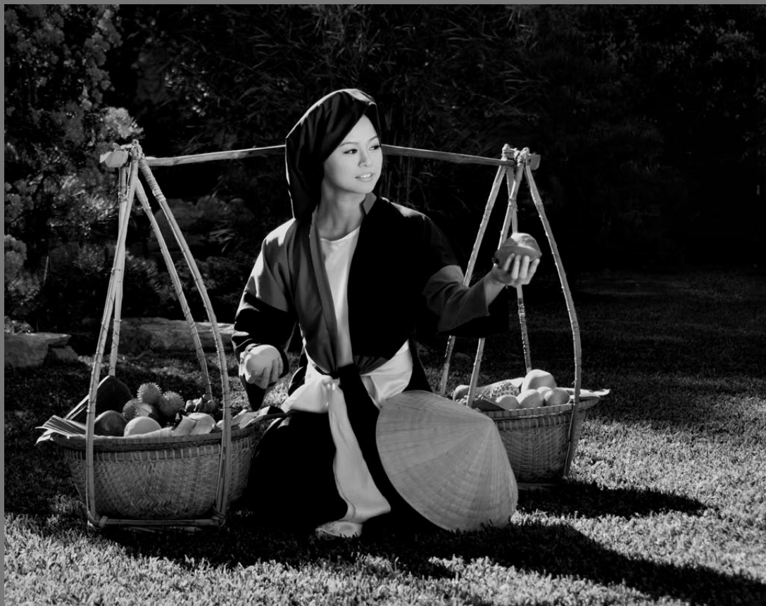
“vietnamese girl”

Southern California Council of Camera Clubs