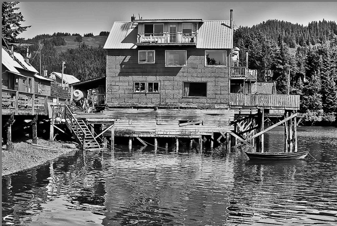
“Seldovia_Boat House_”

Southern California Council of Camera Clubs