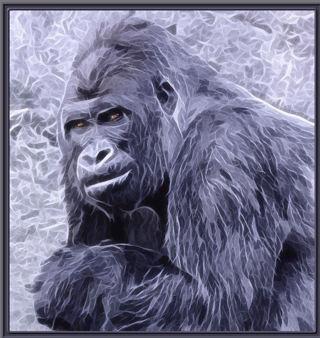
"Silverback 3969" by Nan Carder

Southern California Council of Camera Clubs