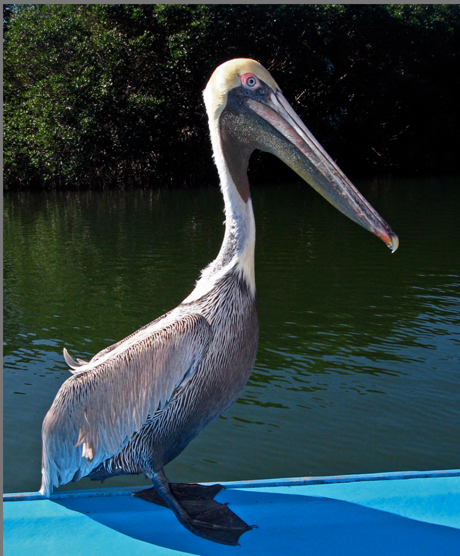
“Friendly Pelican” by Sally Medearis

Southern California Council of Camera Clubs