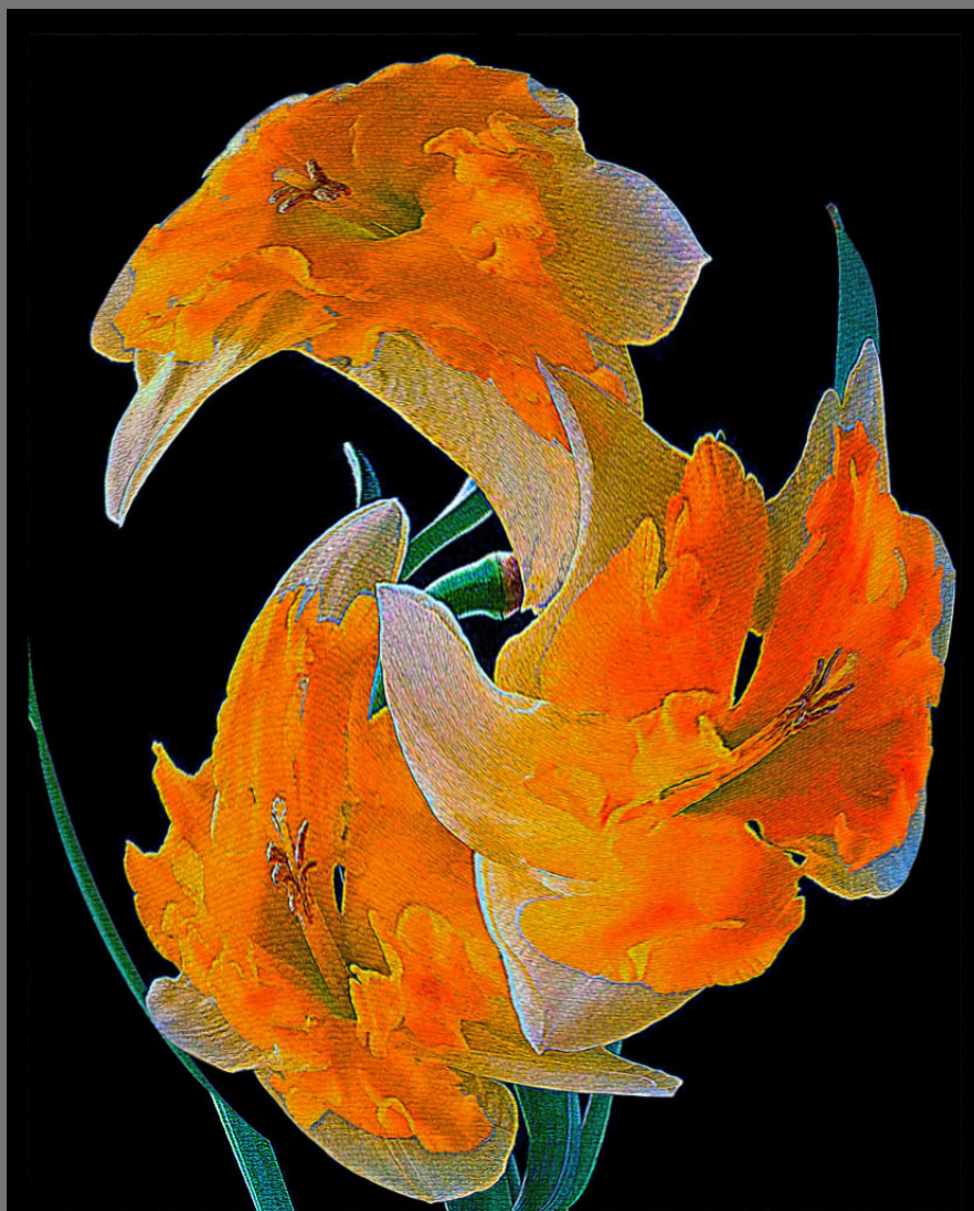
"Flowers in a Twirl" by Seymour Novins

Southern California Council of Camera Clubs