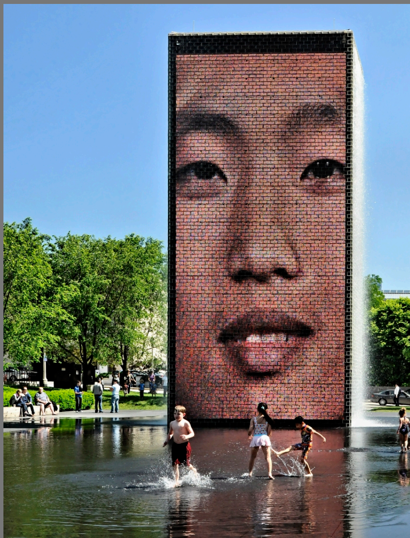
“Crown Fountain Chicago Kids” by Frank Gehry

Southern California Council of Camera Clubs