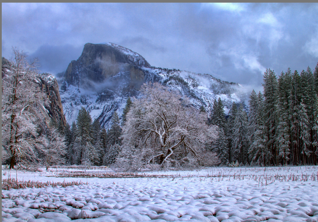
"Half Dome" by Ed Bechtel Valley West Photography Club HM Skill Level AA Pictorial - Interclub Color Dig December, 2012

Southern California Council of Camera Clubs