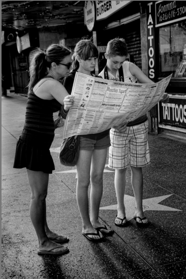
“Hollywood Tourists” by Norma Warden

Southern California Council of Camera Clubs