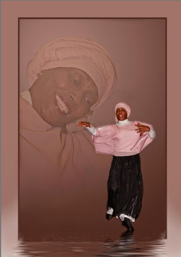
"Lady in Pink" by Nan Carder

Southern California Council of Camera Clubs