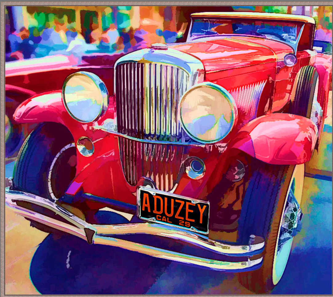
"Red Car" by Snehendu Kar

Southern California Council of Camera Clubs