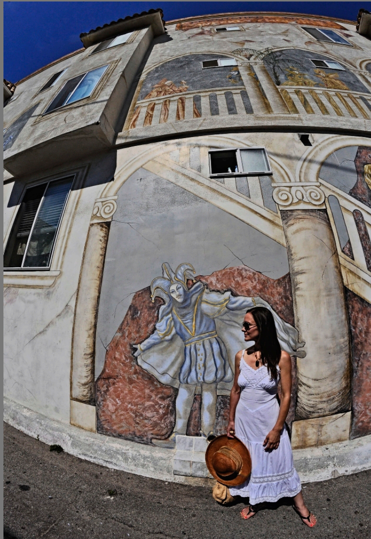
"Honoring The Muse" by Frank Goroszko

Southern California Council of Camera Clubs