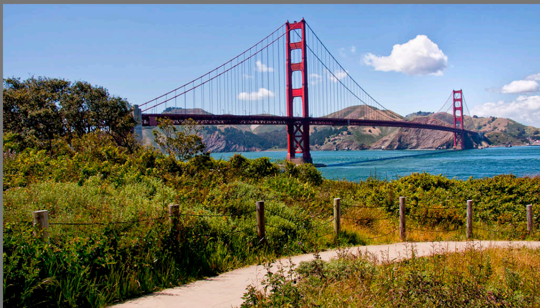
“Golden Gate Bridge” by Pat Ware

Southern California Council of Camera Clubs