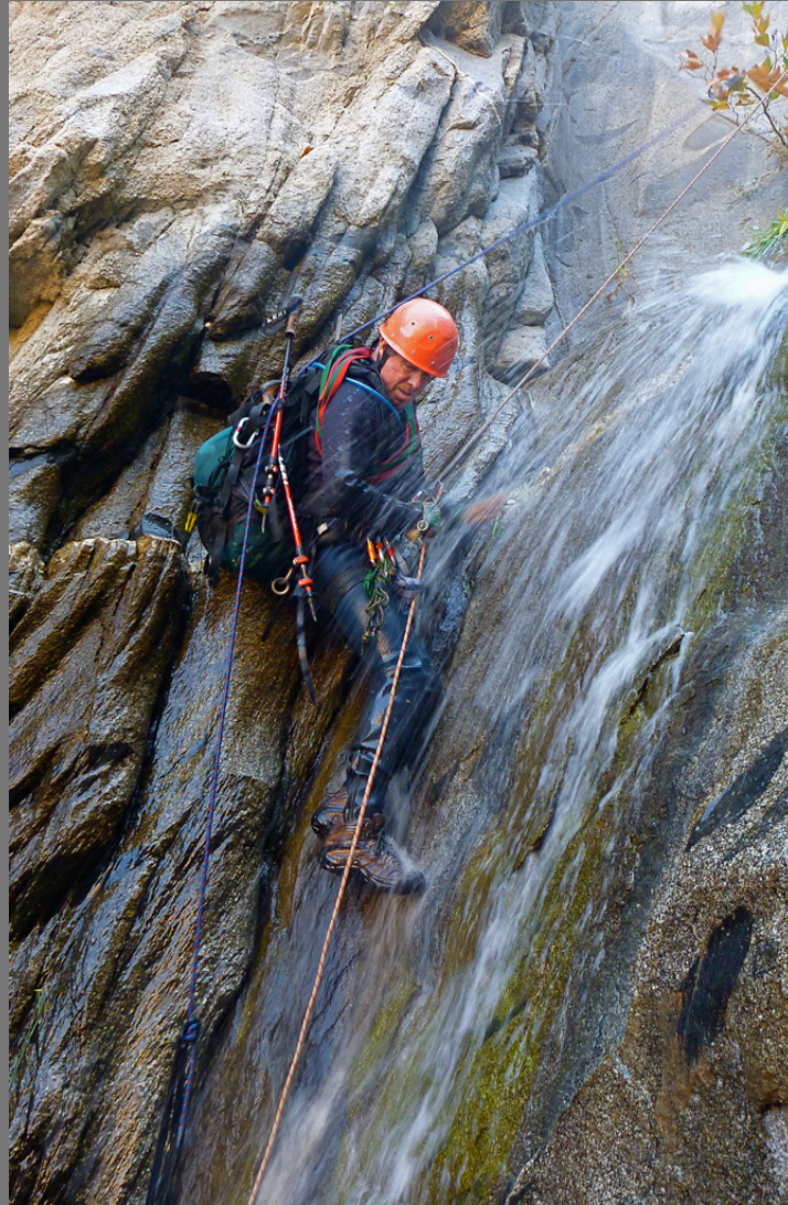
"Cougar Canyon Descent" by Rich Henke

Southern California Council of Camera Clubs