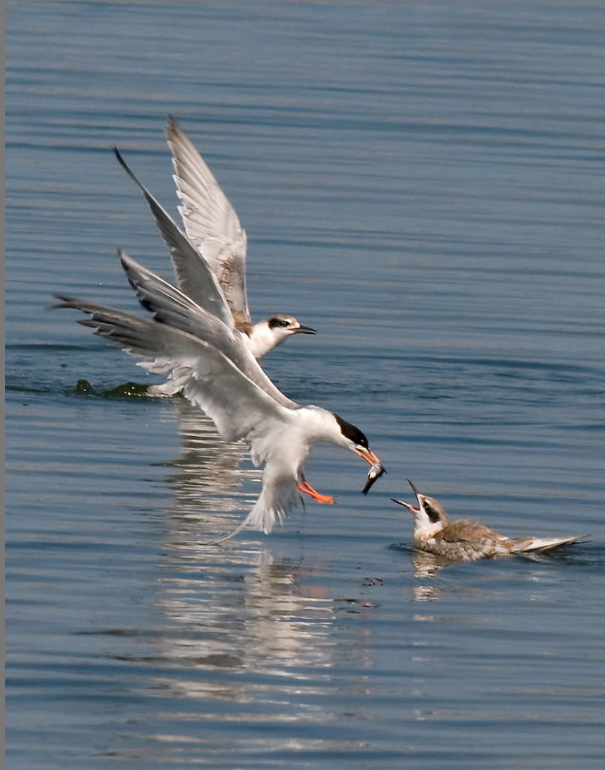
"Feeding 2" by Tram Nguyen

Southern California Council of Camera Clubs