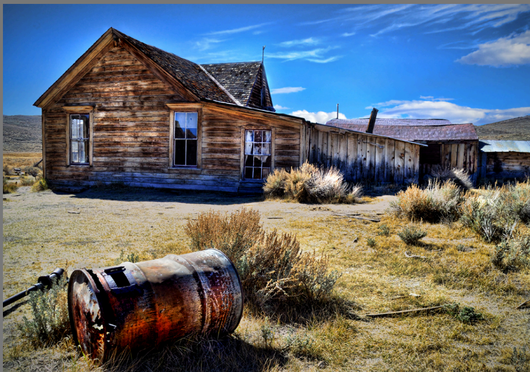
“House and Barrel – Bodie, CA ” by Norma Warden

Southern California Council of Camera Clubs