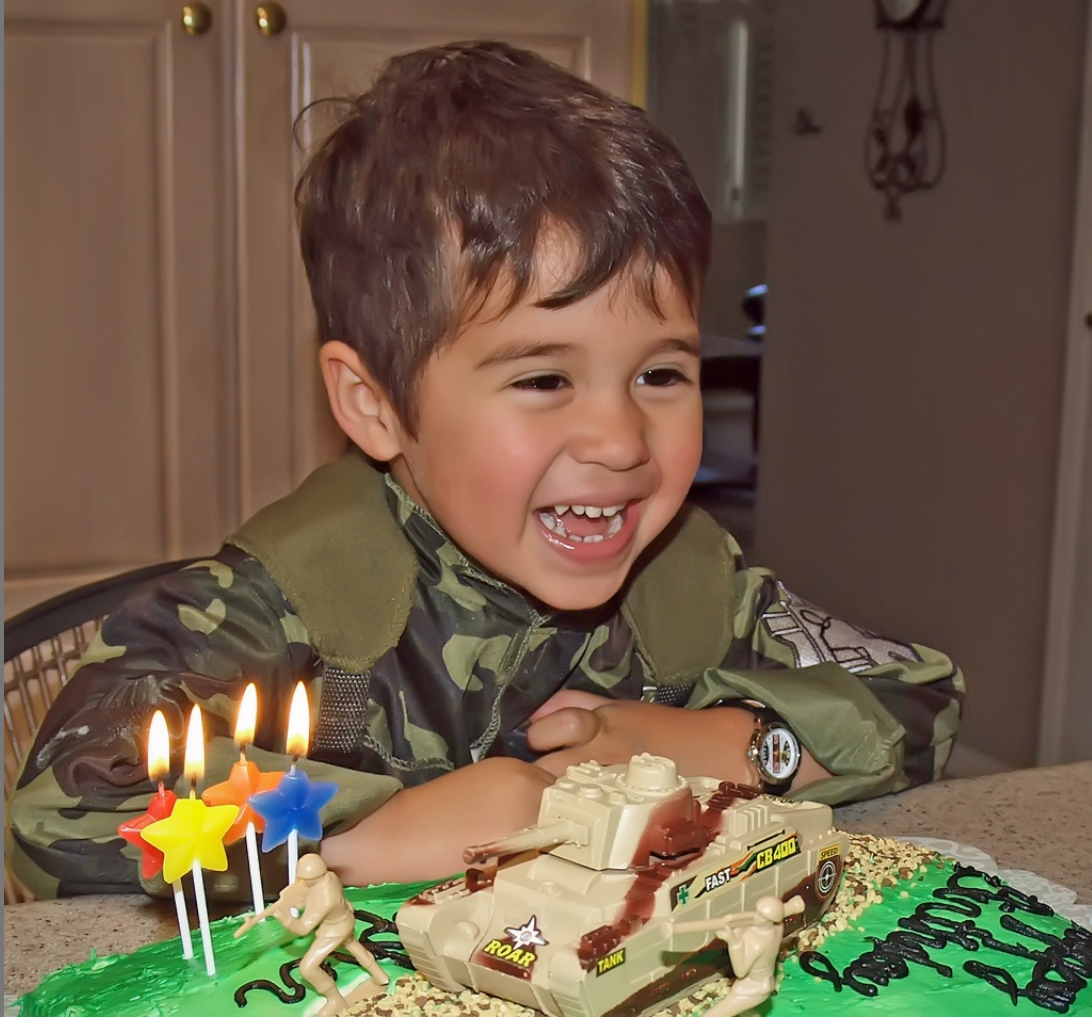
"Birthday Boy"

Southern California Council of Camera Clubs