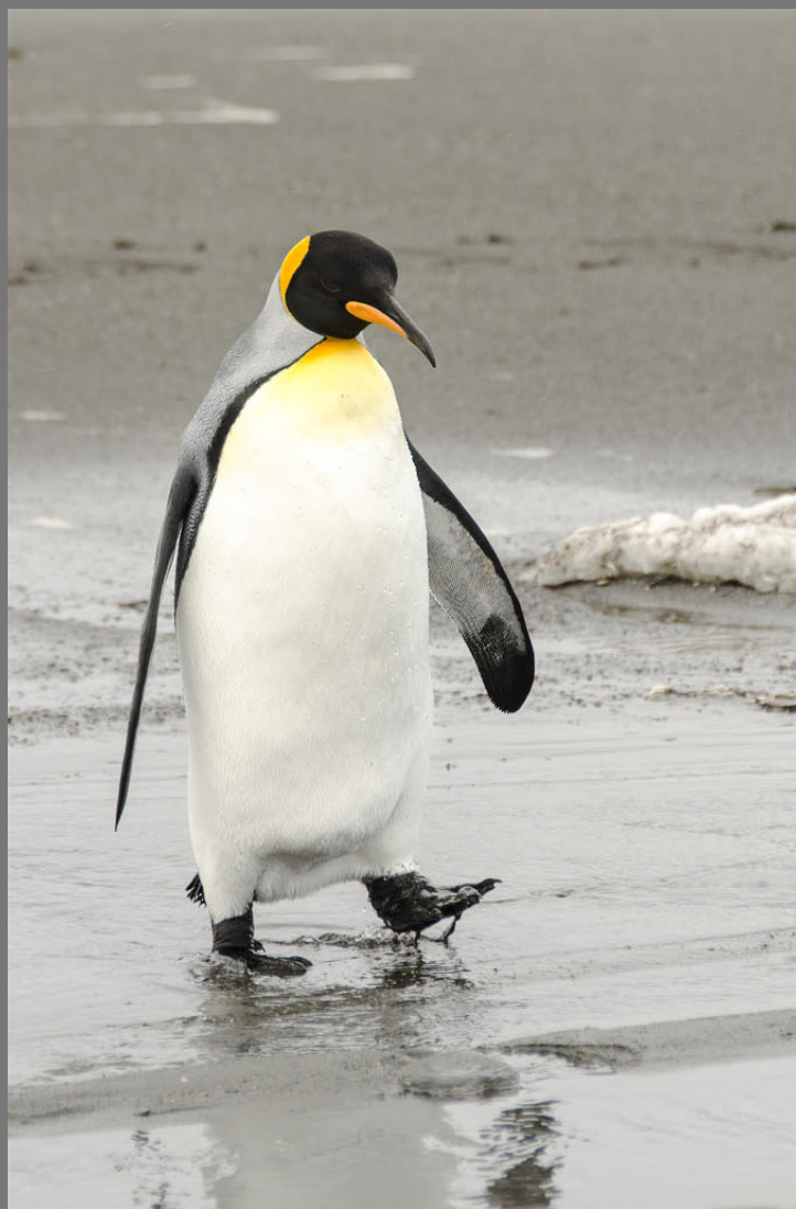
“King Penguin Emerging From The Sea” by Christine Wilkins

Southern California Council of Camera Clubs