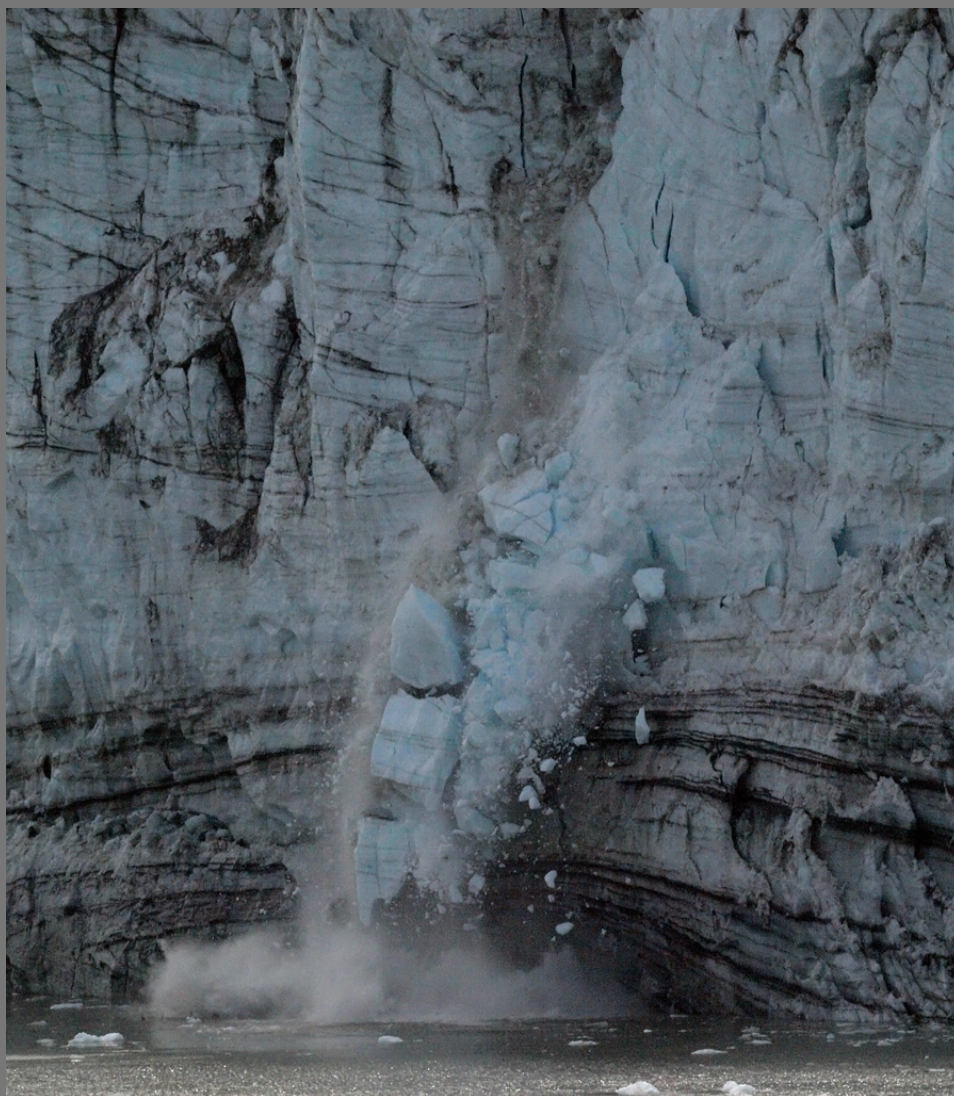
“Calving Glacier” by Sally Medearis

Southern California Council of Camera Clubs