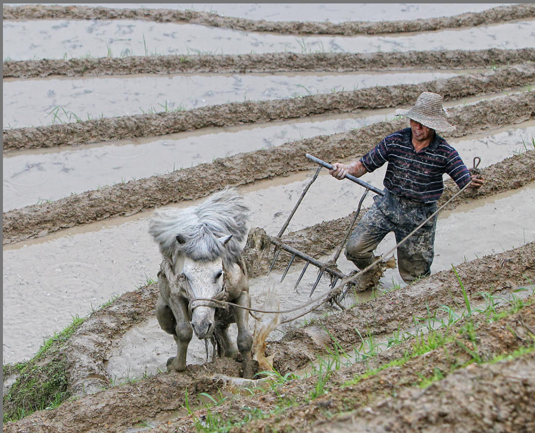
“Rice Field Worker 9236” by Nan Carder

Southern California Council of Camera Clubs