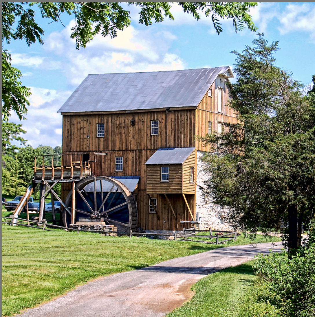
"Wade's Gristmill Entrance-1036-TvDg" by Scott Shackelford

Southern California Council of Camera Clubs