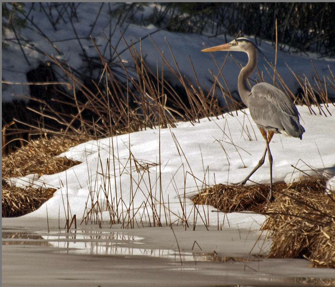
“Blue Heron In Snow” by Sally Medearis

Southern California Council of Camera Clubs