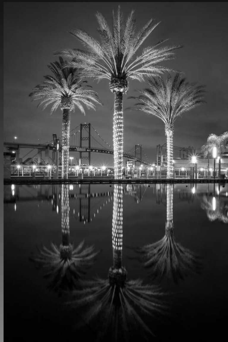
'SPIRIT OF SAN PEDRO' BY JULIAN JOLLIFFE (Silver Medal)