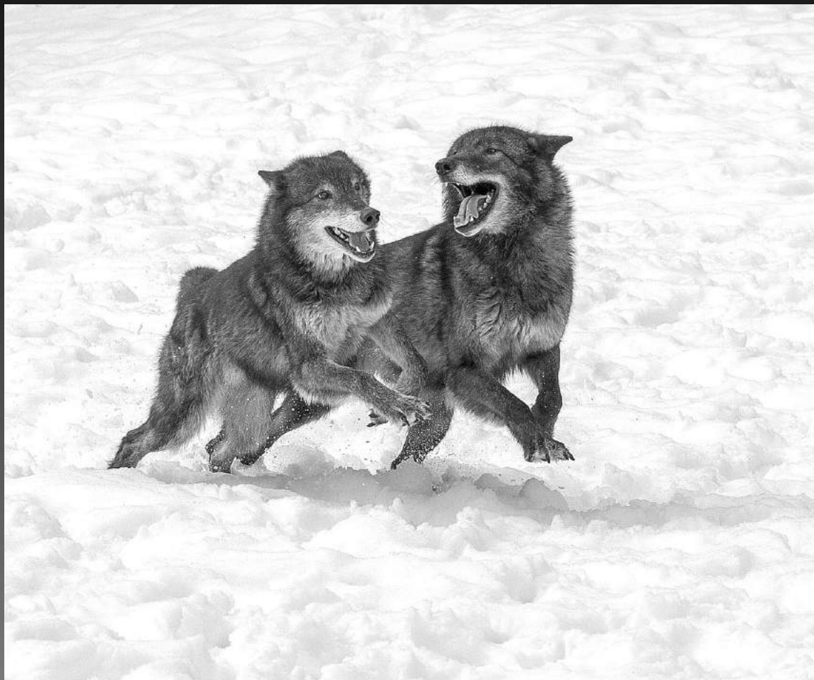
'WOLF PLAY' BY SANDRA CRANTZ, QPSA FS4C (Honor Award)