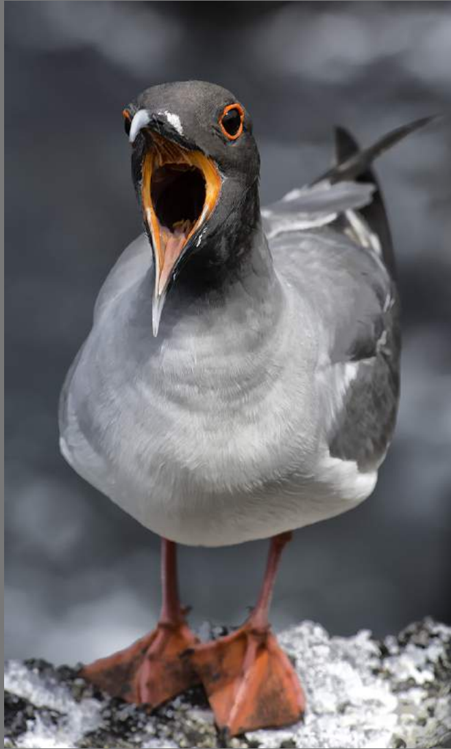
“SWALLOW-TAILED GULL” by HANS ZIMA

Southern California Council of Camera Clubs