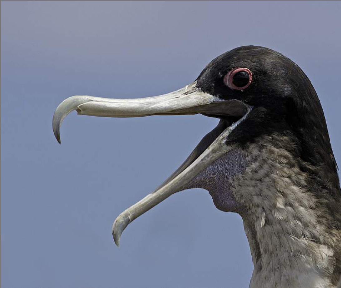
“EXCITED GULL” by HANS ZIMA

Southern California Council of Camera Clubs