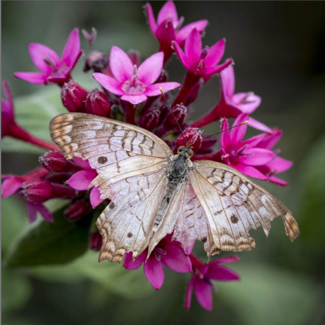
“BROKEN WINGS” by TERRY MIRANDA

Southern California Council of Camera Clubs