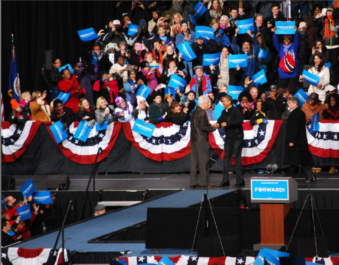
“OBAMA GREETES CLINTON 2012 RALLY” by MARILYN PEAKE

Southern California Council of Camera Clubs