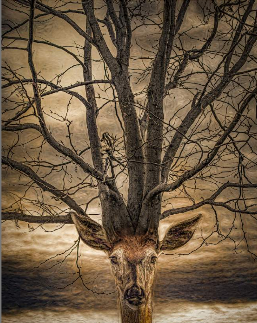
"TREE ANTLERS" by TERRY MIRANDA

Southern California Council of Camera Clubs