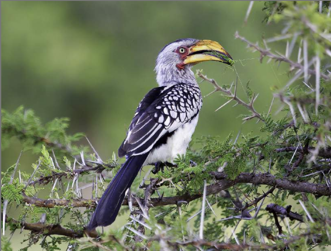
“HORNBILL WITH SNACK” by PAUL ABRAVAYA

Southern California Council of Camera Clubs