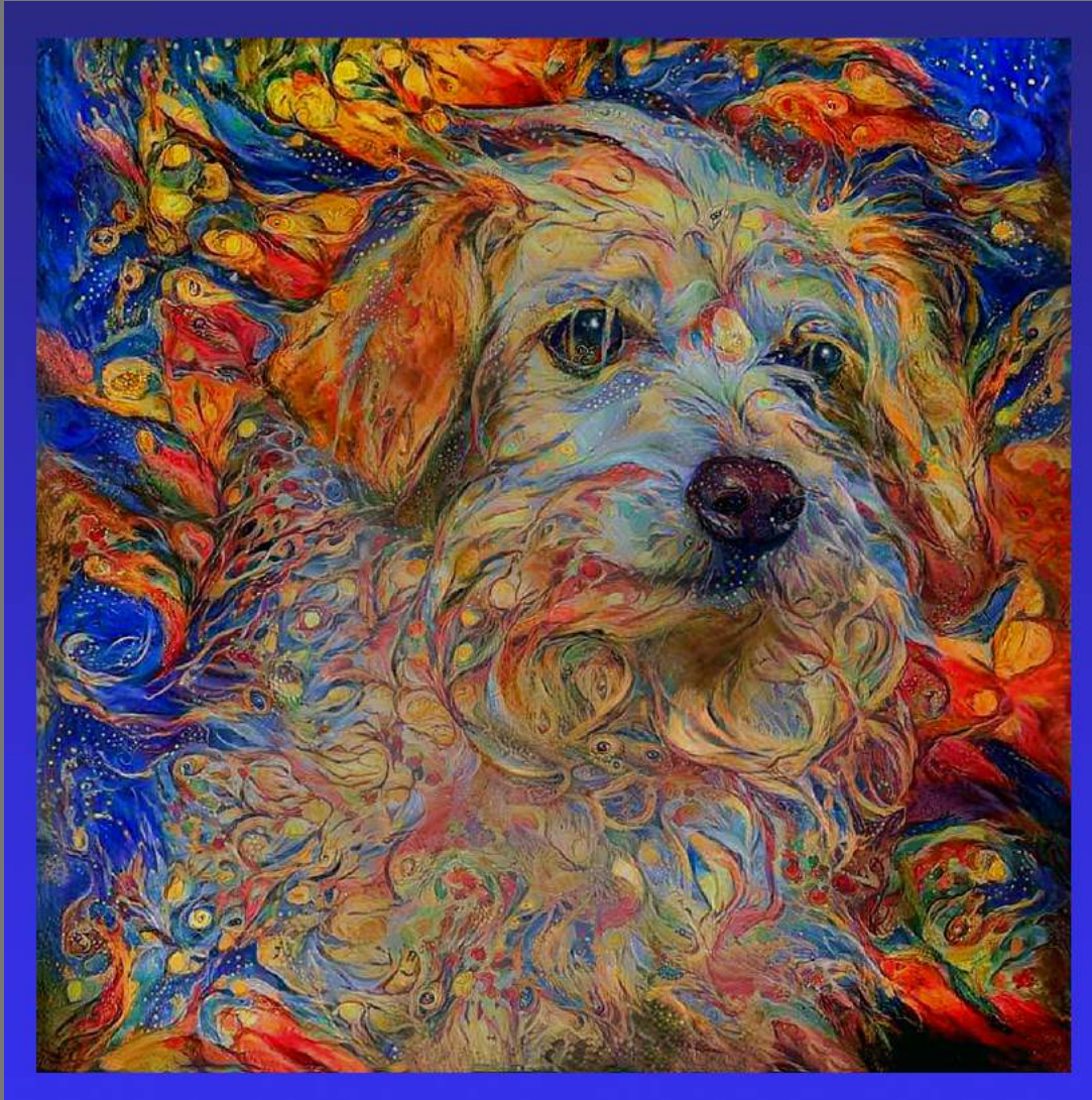
"COLORFUL SCRUFFY DOG" by SUZANNE GONZALEZ

Southern California Council of Camera Clubs