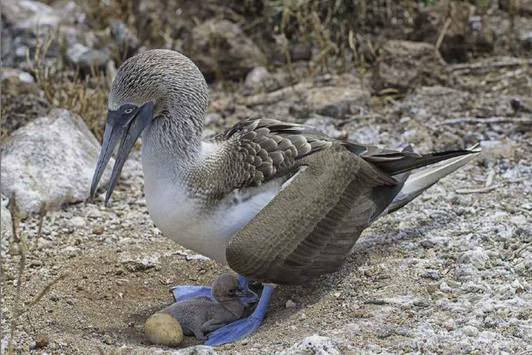
"BLUE-FOOTED BOOBY" by HANS ZIMA

Southern California Council of Camera Clubs