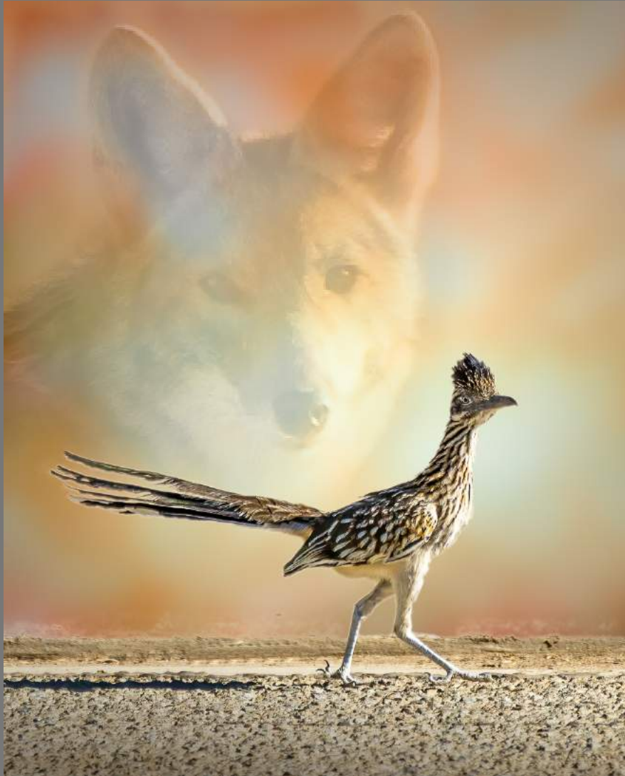
"ALWAYS ON MY MIND" by TERRY DICKERSON

Southern California Council of Camera Clubs