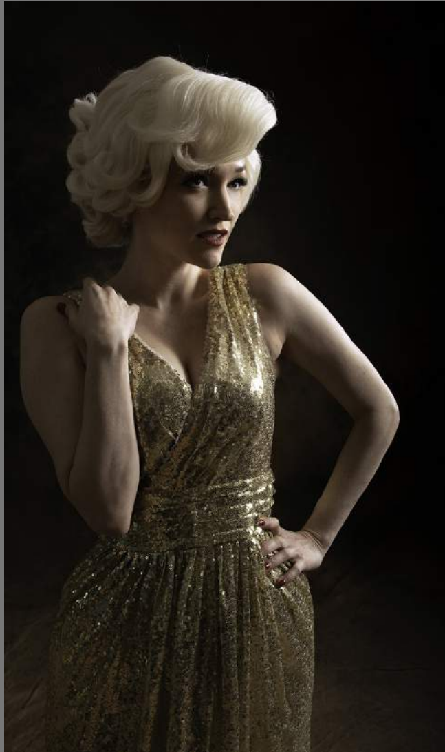
"BLONDE BOMBSHELL" by GARY EARL

Southern California Council of Camera Clubs