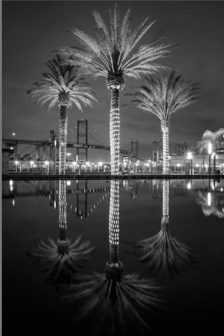
“SPIRIT OF SAN PEDRO” by JULIAN JOLLIFFE

Southern California Council of Camera Clubs