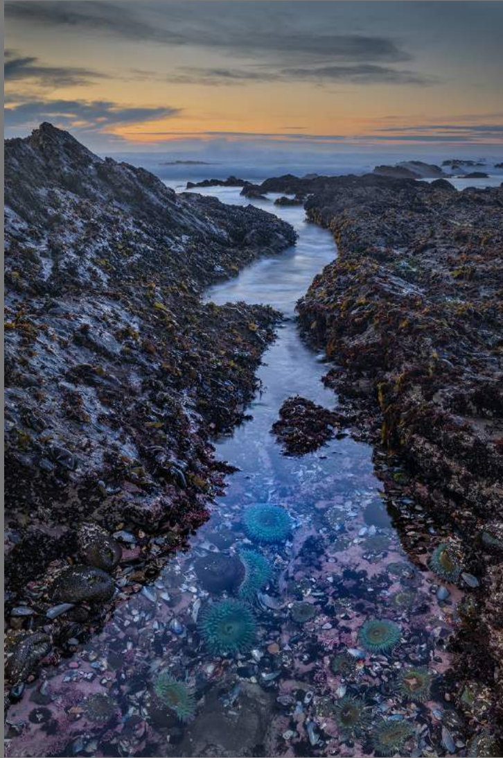
“SEA ANEMONES” by PETER SCIFRES

Southern California Council of Camera Clubs