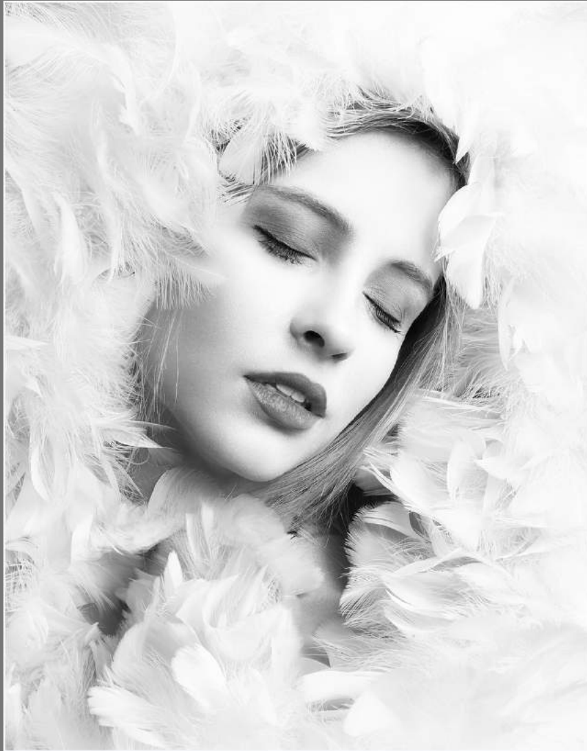
"SWEET DREAMS" by CRYSTAL OLGUIN

Southern California Council of Camera Clubs