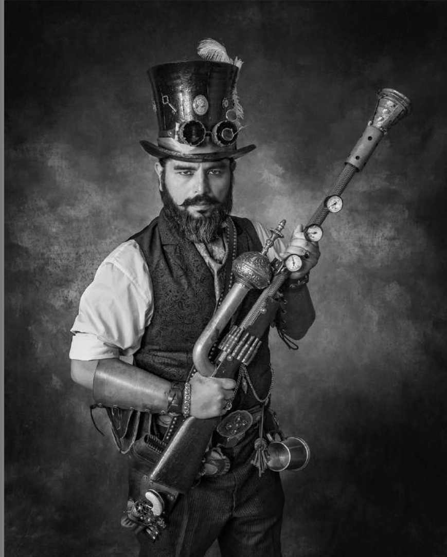
“STEAMPUNK ALEX-07B” by PAUL SPEAKER

Southern California Council of Camera Clubs