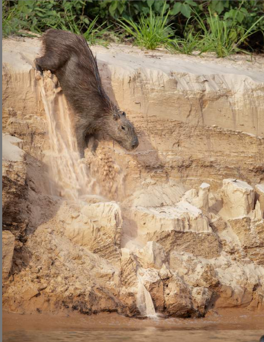
“CAPYBARA ESCAPE” by LARA FERRARO

Southern California Council of Camera Clubs