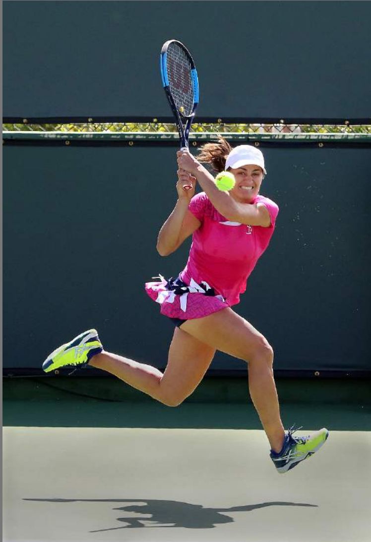
“RUNNING NICOLESCU BACKHAND 5688” by CHARLES STRICKER

Southern California Council of Camera Clubs