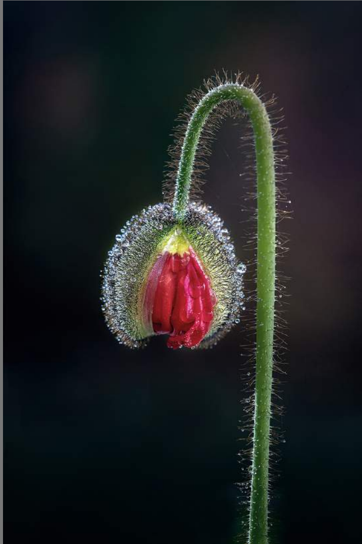
“POPPY TO BE” by DEBORA SUTERKO

Southern California Council of Camera Clubs