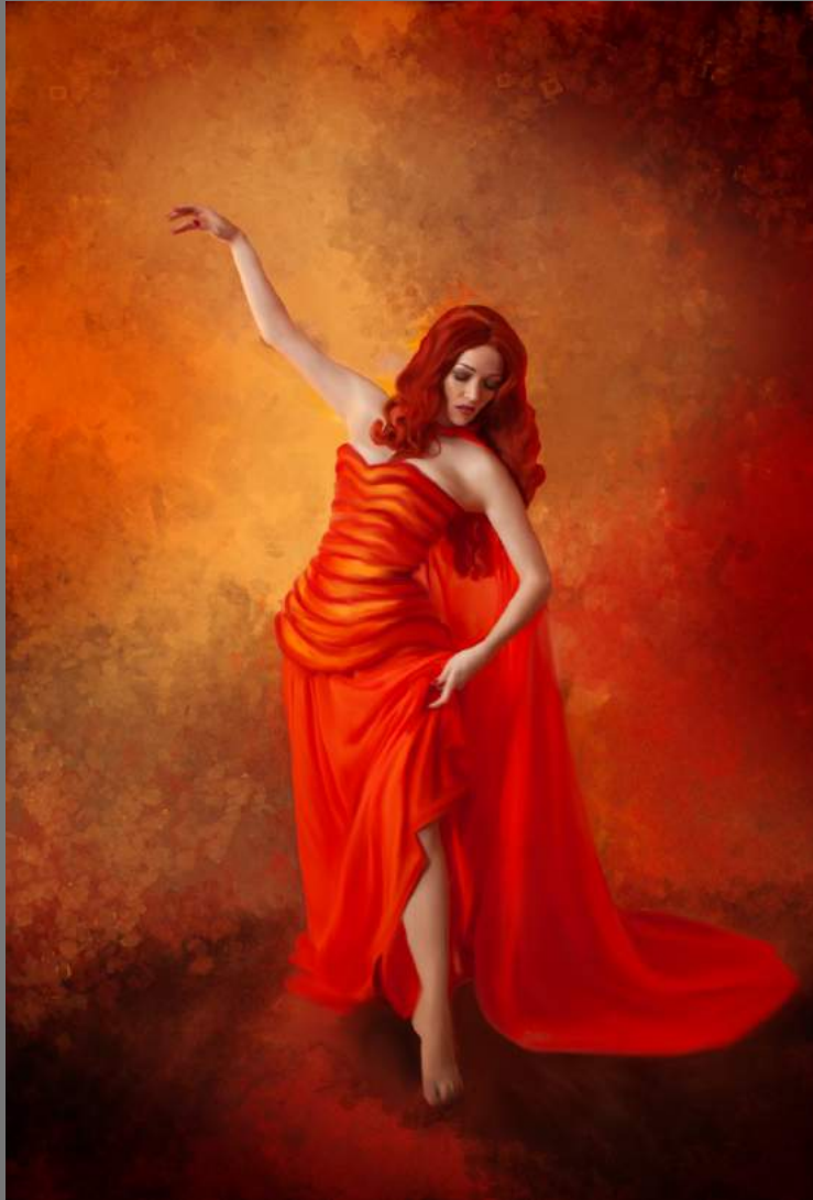
"LADY IN RED" by NANCY SPEAKER

Southern California Council of Camera Clubs