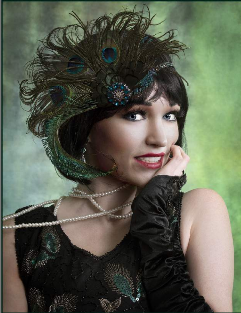
"FABULOUS FLAPPER" by CRYSTAL OLGUIN

Southern California Council of Camera Clubs