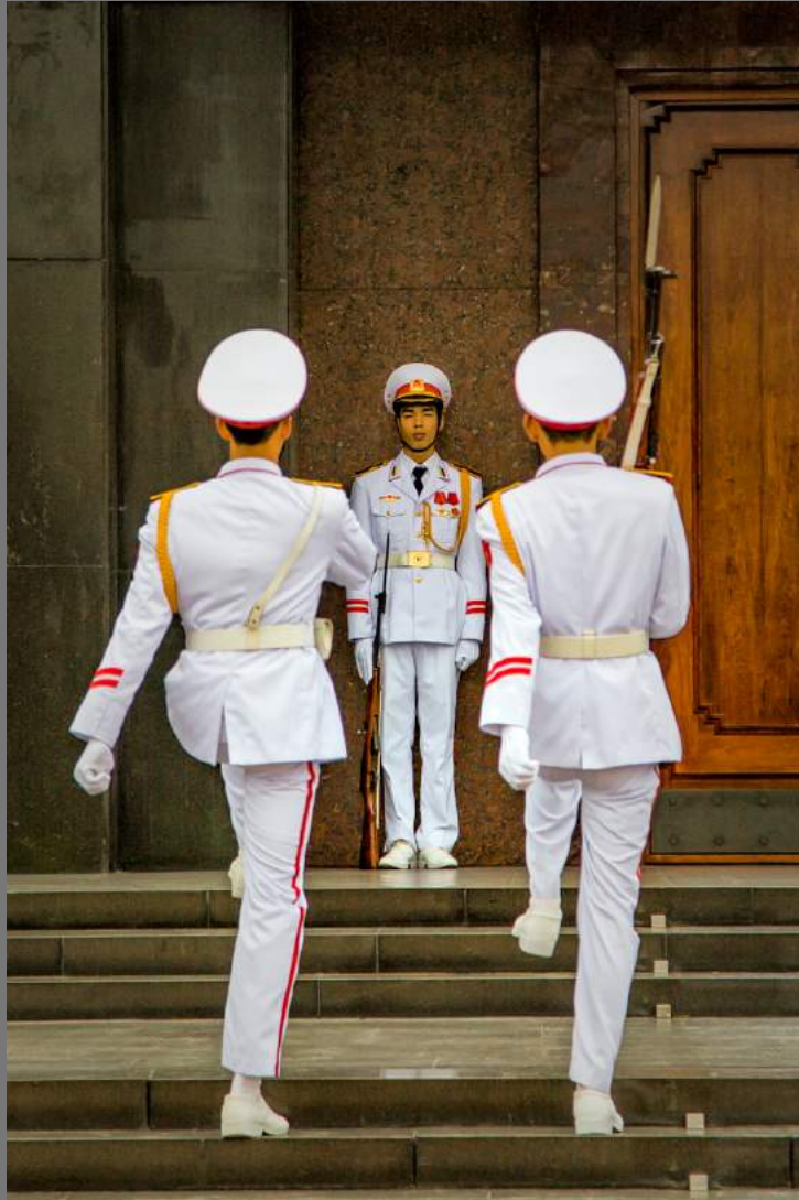
"TOMB GUARDS" by GERALD FLEURY

Southern California Council of Camera Clubs