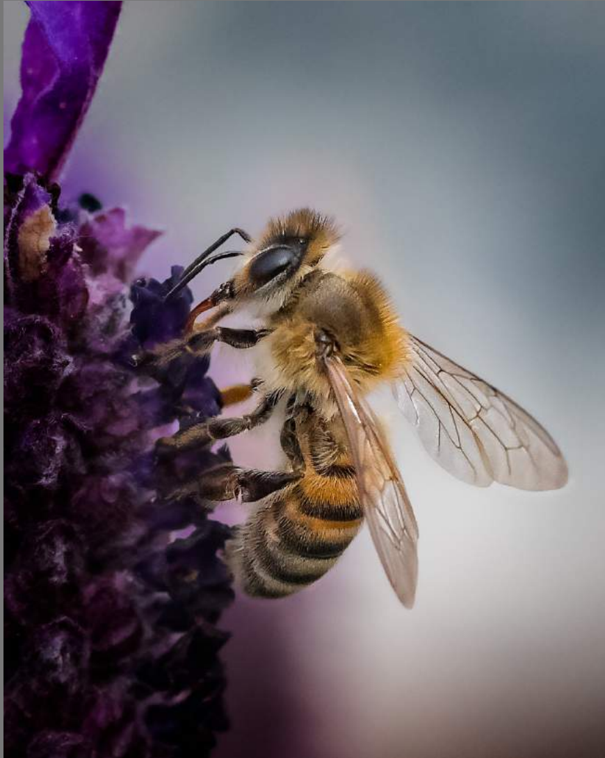
“BEEUTIFUL” by STAN FRY

Southern California Council of Camera Clubs