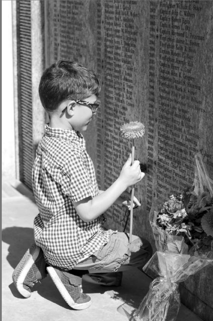
"GRANDPA'S MEMORIAL" by TERRY MIRANDA

Southern California Council of Camera Clubs