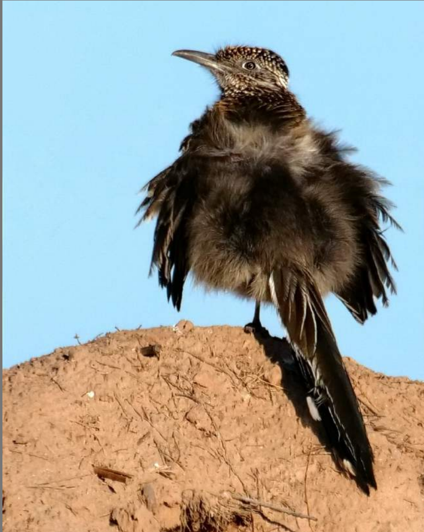
“ROADRUNNER MATING PLUMMAGE” by CHRISTINE COPE PENCE

Southern California Council of Camera Clubs