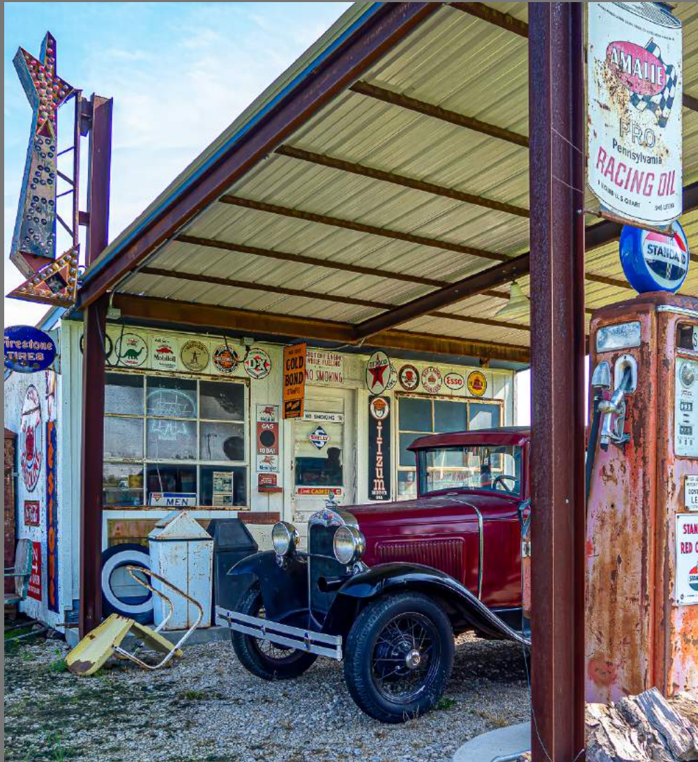
“DAYS GONE BY” by TERRY DICKERSON

Southern California Council of Camera Clubs