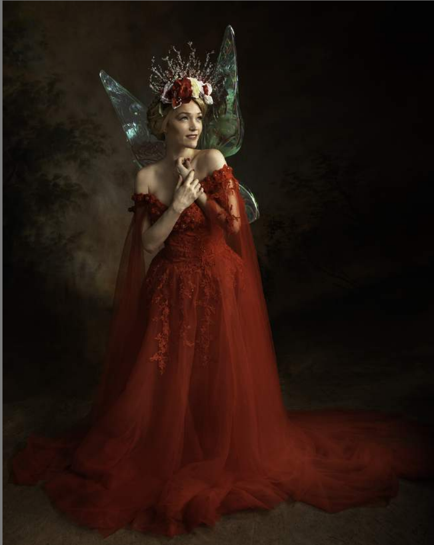
"RED FAIRY" by GARY EARL

Southern California Council of Camera Clubs