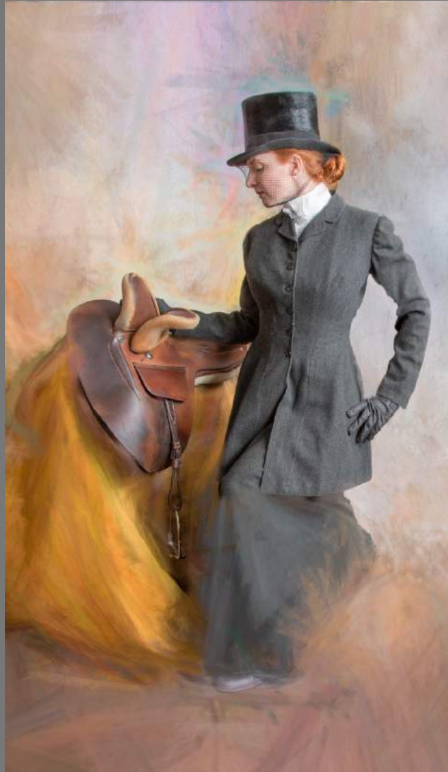
"VIRGINA 131" by NANCY SPEAKER

Southern California Council of Camera Clubs