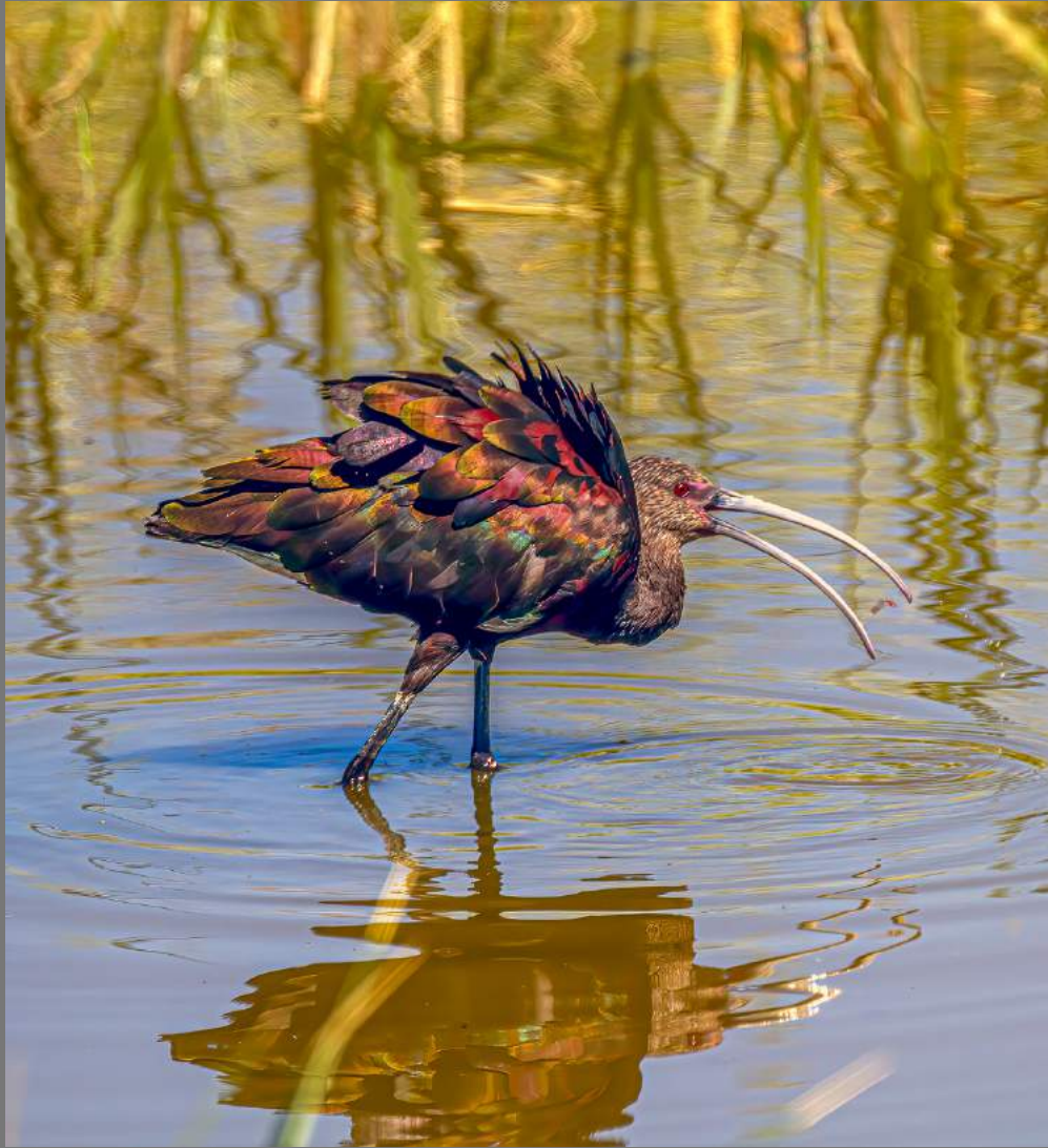
“WHITE-FACED IBIS FEEDS” by TERRY DICKERSON

Southern California Council of Camera Clubs