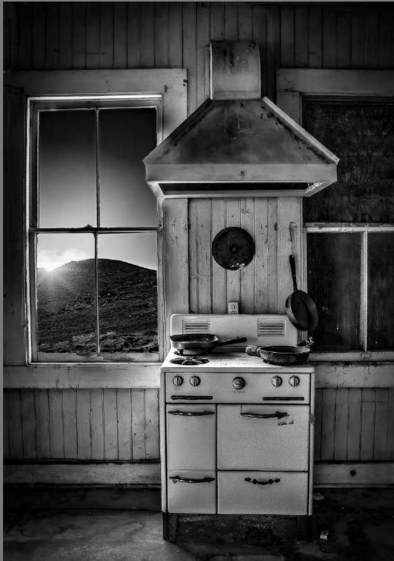
"YESTERDAYS KITCHEN" by TERRY DICKERSON

Southern California Council of Camera Clubs