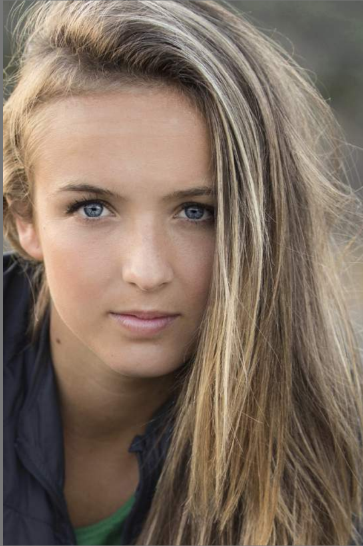
"BLUE EYED BLONDE" by TERRY MIRANDA

Southern California Council of Camera Clubs