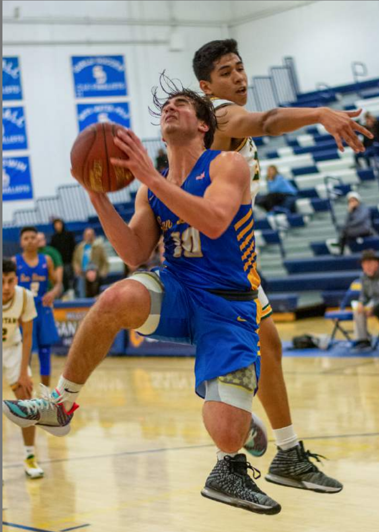
“A CONTACT SPORT”

Southern California Council of Camera Clubs