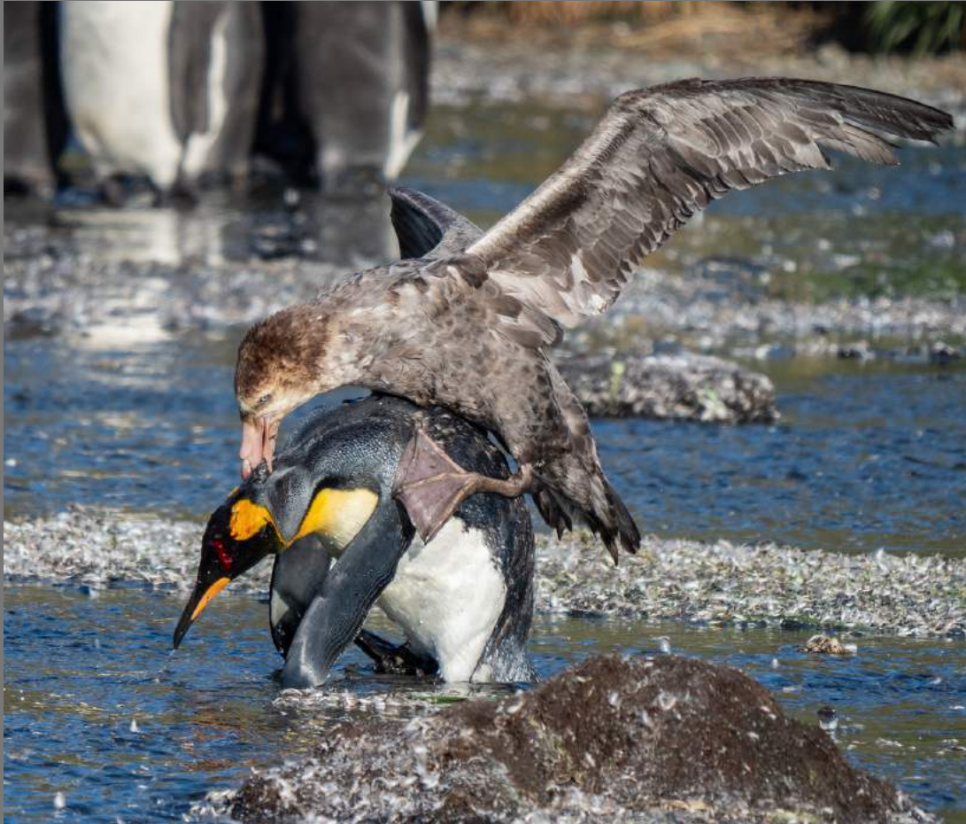
“ATTACKING THE KING” by MARY CROUCH

Southern California Council of Camera Clubs