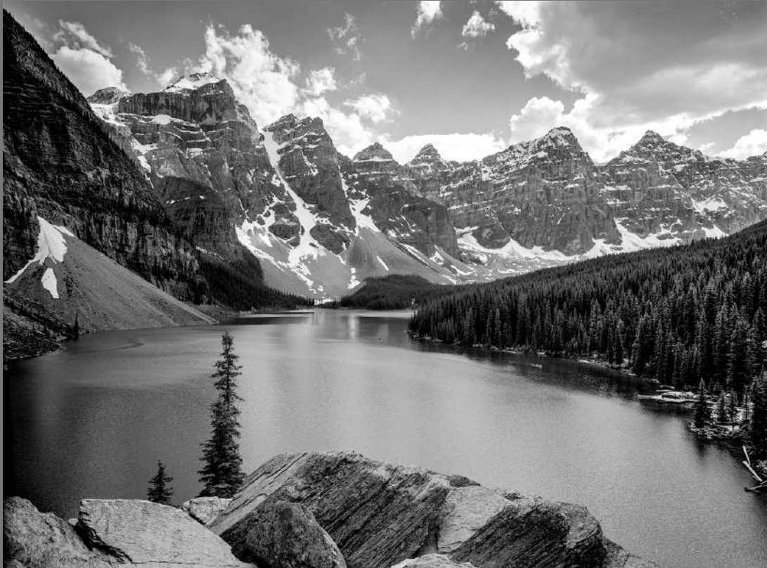
“LAKE MORRAINE”

Southern California Council of Camera Clubs