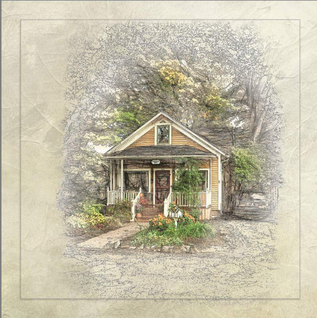
“OREGON CITY COTTAGE-04 ALT” by PAUL SPEAKER

Southern California Council of Camera Clubs