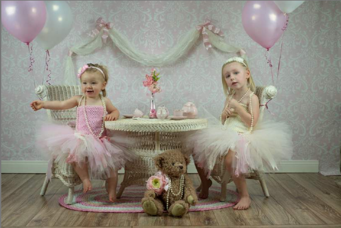
“TEA WITH TEDDY” by KATHLEEN WALTER

Southern California Council of Camera Clubs