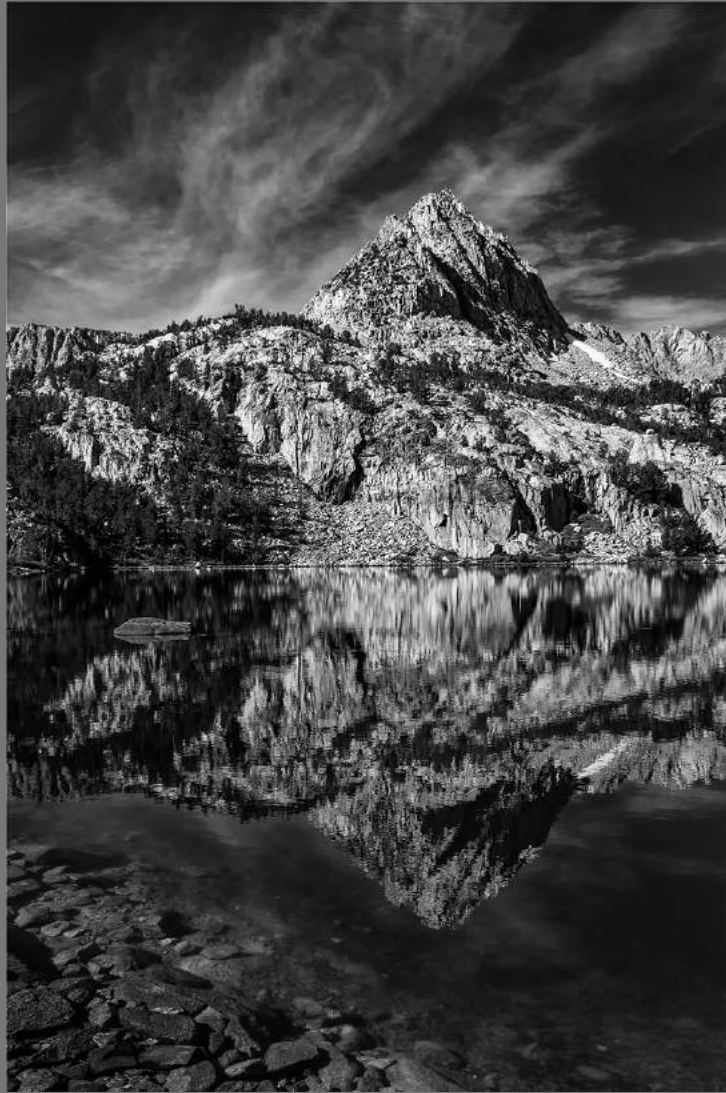
“LOWER LAMARCK LAKE” by PETER SCIFRES

Southern California Council of Camera Clubs