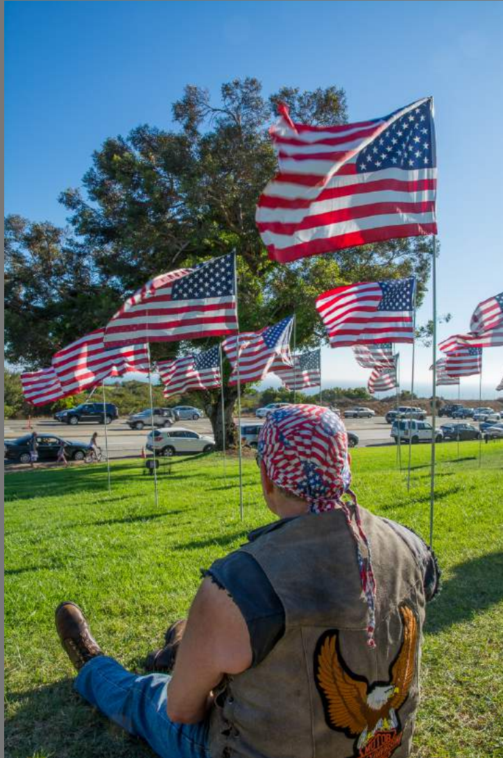
“VETERAN 9780” by ROY PATIENCE

Southern California Council of Camera Clubs