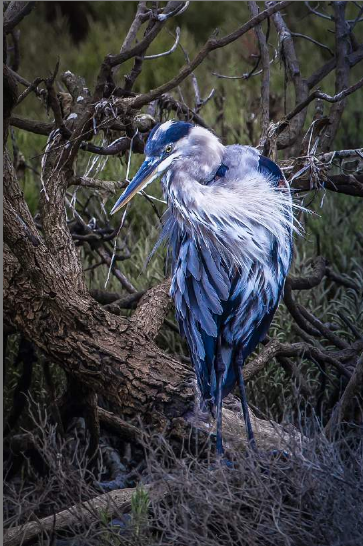
“BLUE HERON” by GERALD FLEURY

Southern California Council of Camera Clubs