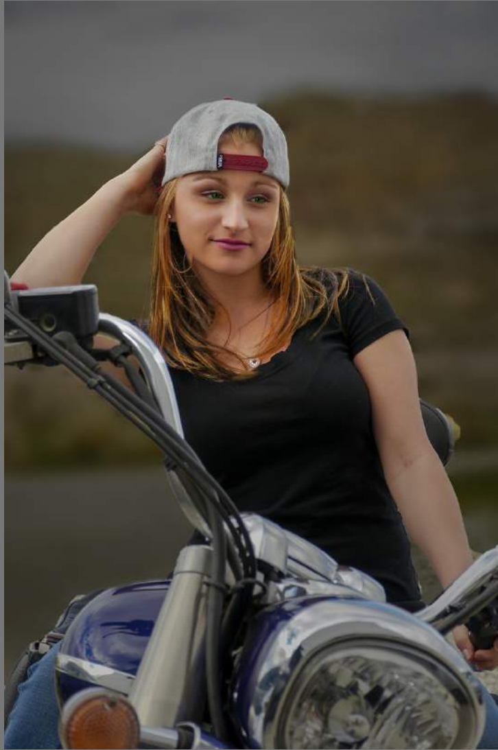
“READY TO RIDE” by WILLIAM PEAKE

Southern California Council of Camera Clubs