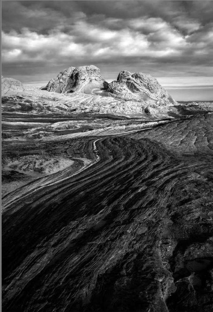
“TWO BRAINS” by PETER SCIFRES

Southern California Council of Camera Clubs