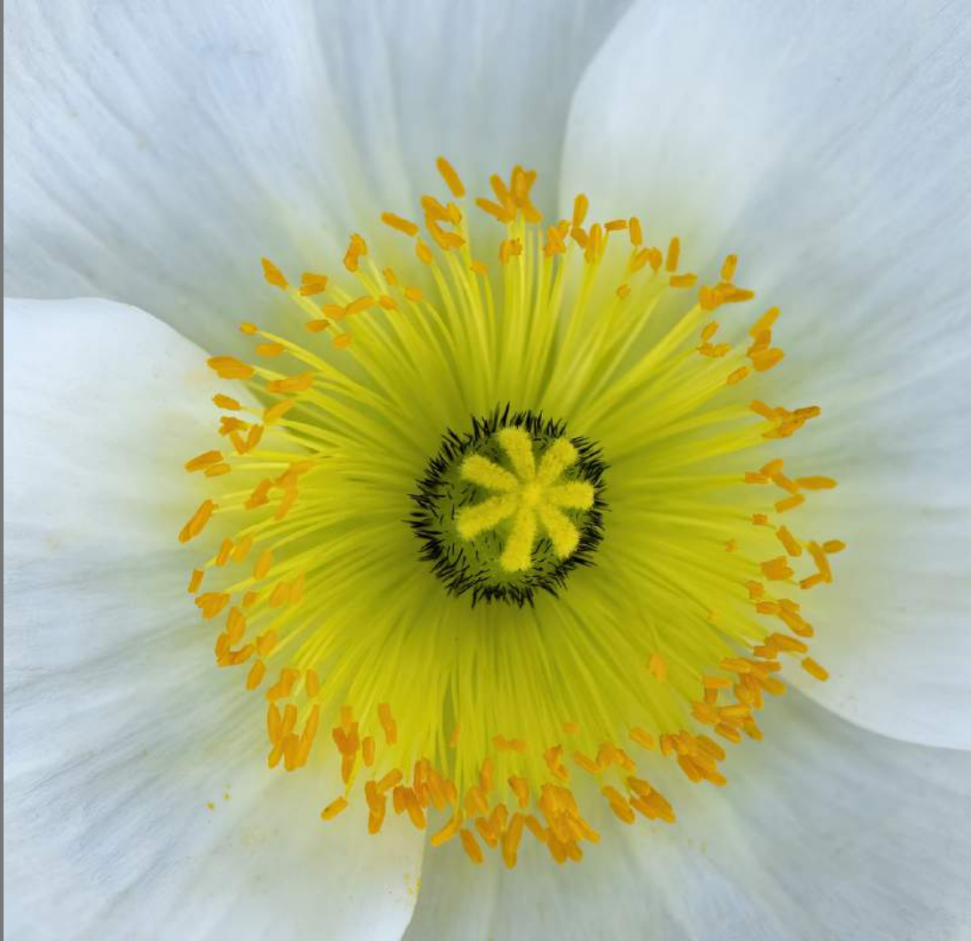
"WHITE POPPY" by HANA NOVAK

Southern California Council of Camera Clubs