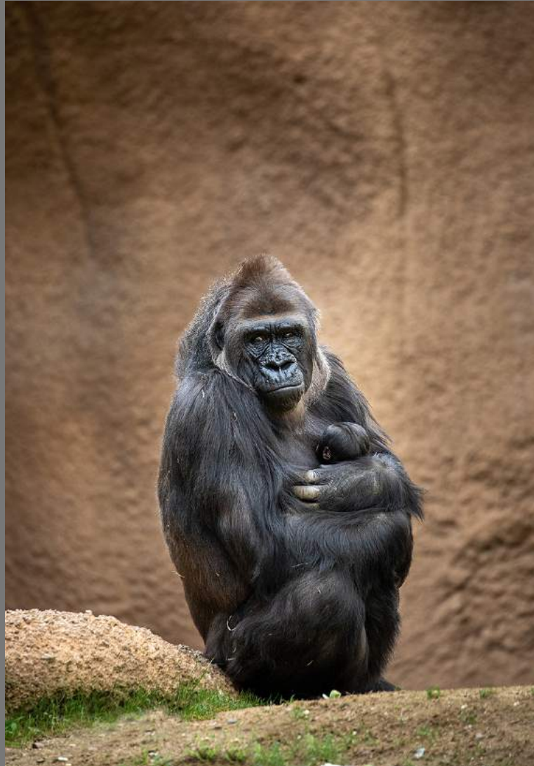
“LOVING MAMA” by DEBORA SUTERKO

Southern California Council of Camera Clubs