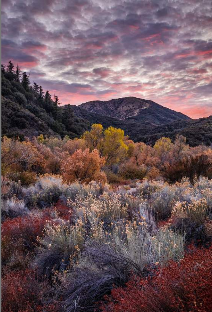
“SESPE WILDERNESS FALL COLORS” by PETER SCIFRES

Southern California Council of Camera Clubs