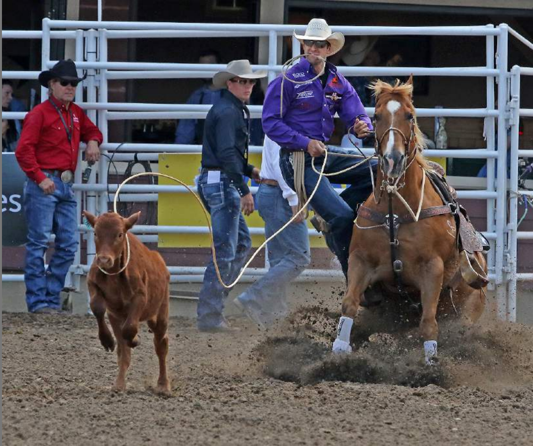
“CALF ROPING IN ACTION 2526” by CHARLES STRICKER

Southern California Council of Camera Clubs