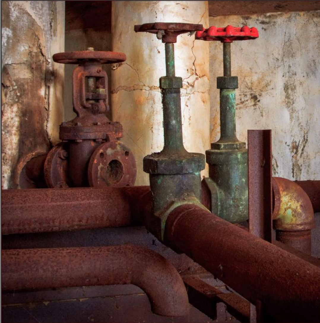
“ABANDONED MILL STIL LIFE” by GREGORY LILLY

Southern California Council of Camera Clubs