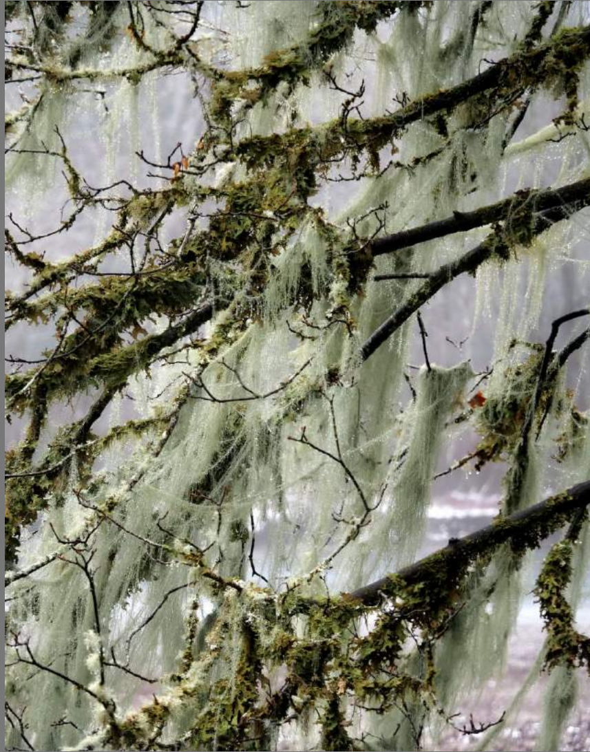
"WINTER CURTAIN" by CHRISTINE COPE PENCE

Southern California Council of Camera Clubs