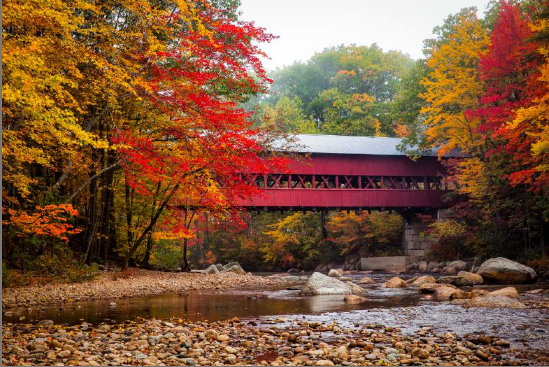
“COVERED BRIDGE” by GERALD FLEURY

Southern California Council of Camera Clubs