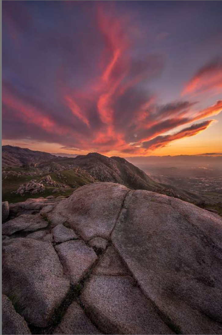
"FLARE UP" by JULIAN JOLLIFFE

Southern California Council of Camera Clubs