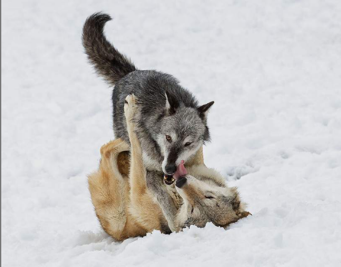
“WOLFS PLAYING” by SANDRA CRANTZ

Southern California Council of Camera Clubs