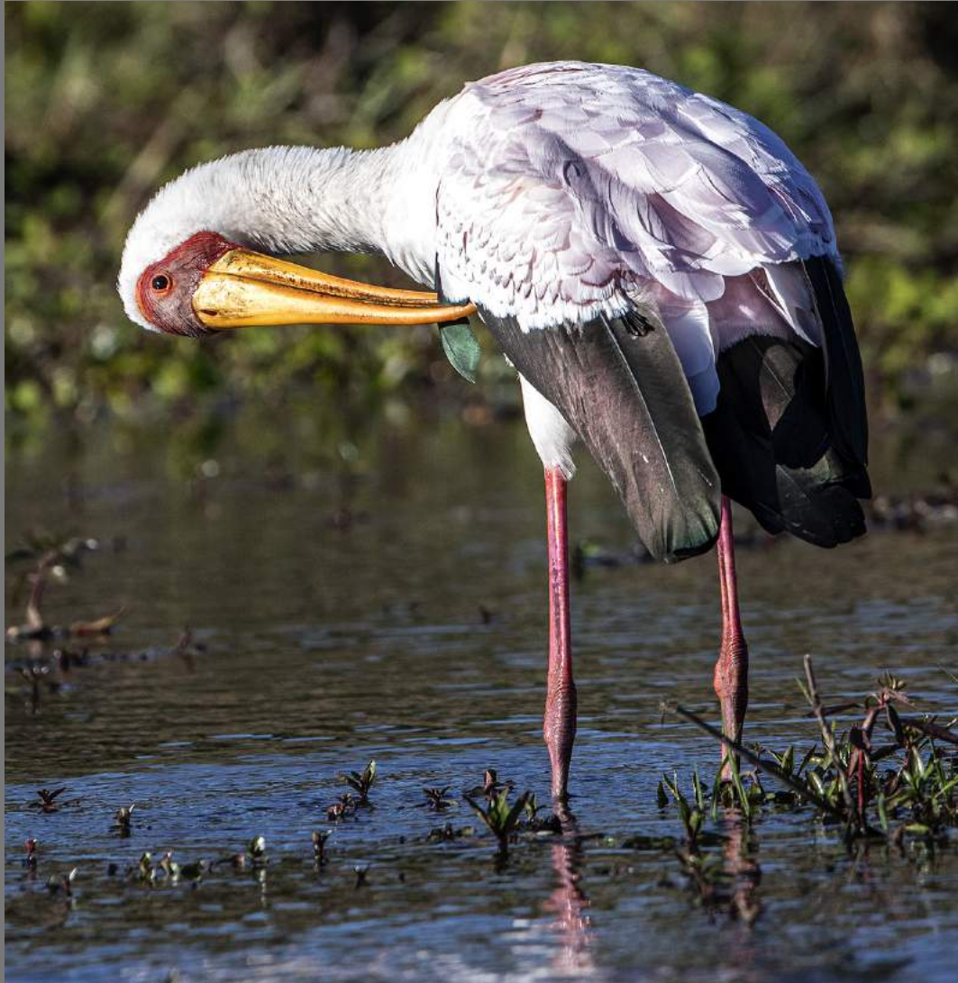
"STORK GREEN FEATHER" by SANDRA CRANTZ

Southern California Council of Camera Clubs