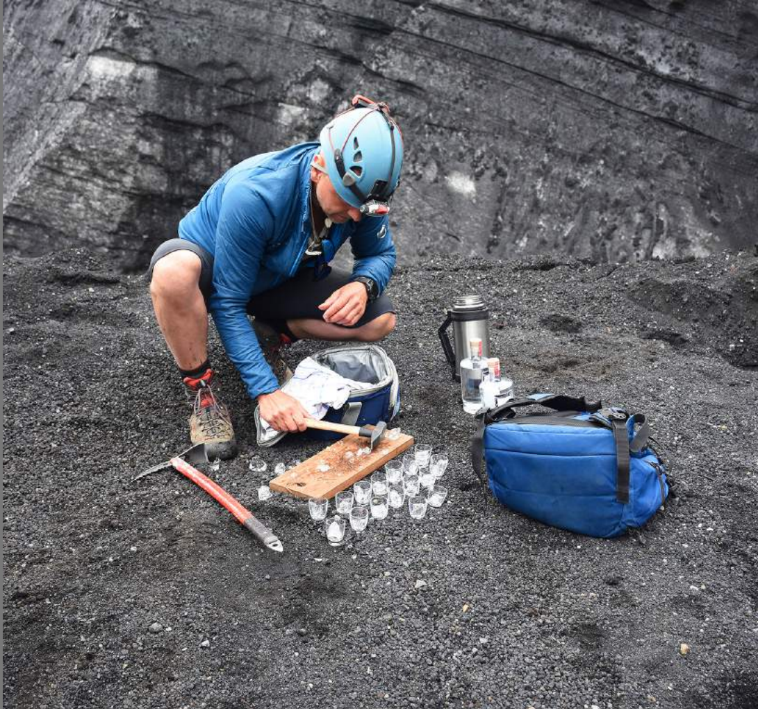
“GLACIER ICE IN SHOT GLASSES” by MARILYN PEAKE

Southern California Council of Camera Clubs