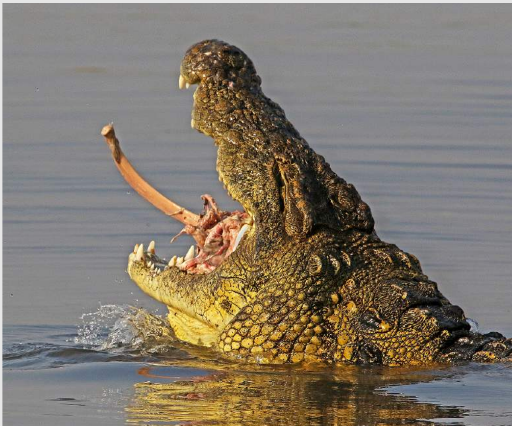
"CROC SWALLOWS LARGE MEAL 1920"