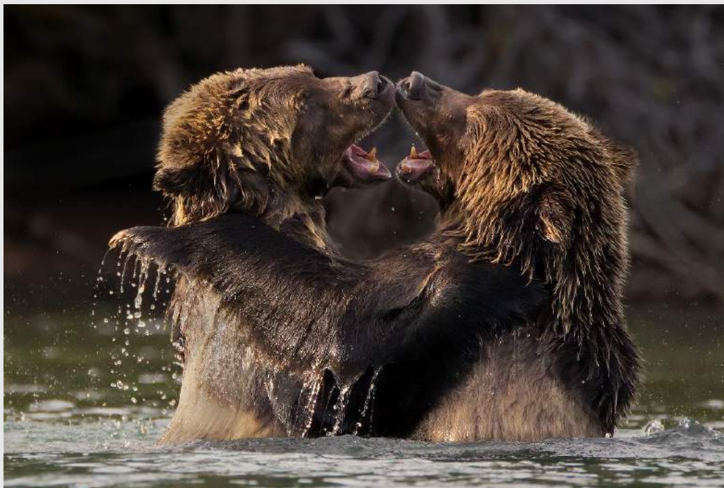
“GRIZZLY CUBS PLAYFIGHTING”