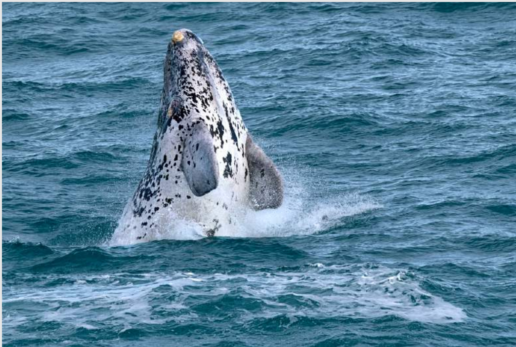
“SOUTHERN RIGHT WHALE CALF”