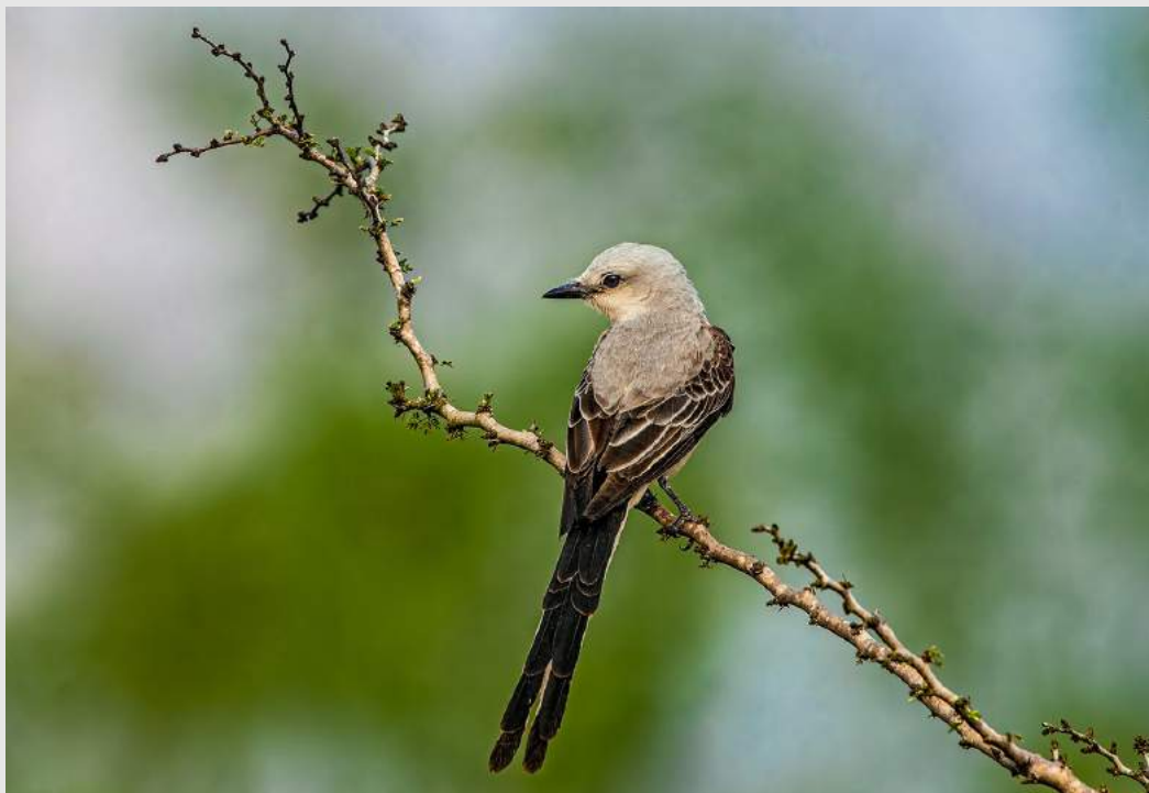
“SCISSOR TAILED FLYCATCHER”