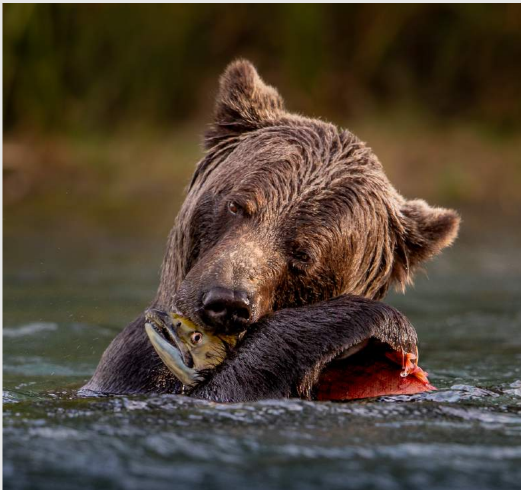
“GRIZZLY WITH SOCKEYE SALMON”