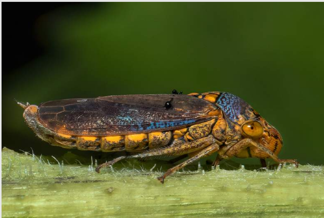
“BROAD HEADED SHARPSHOOTER”