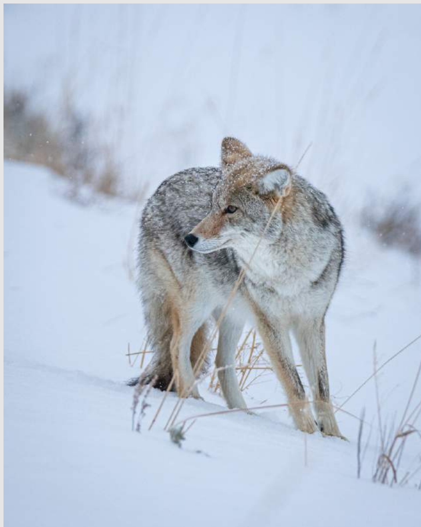
"COYOTE IN THE SNOW"