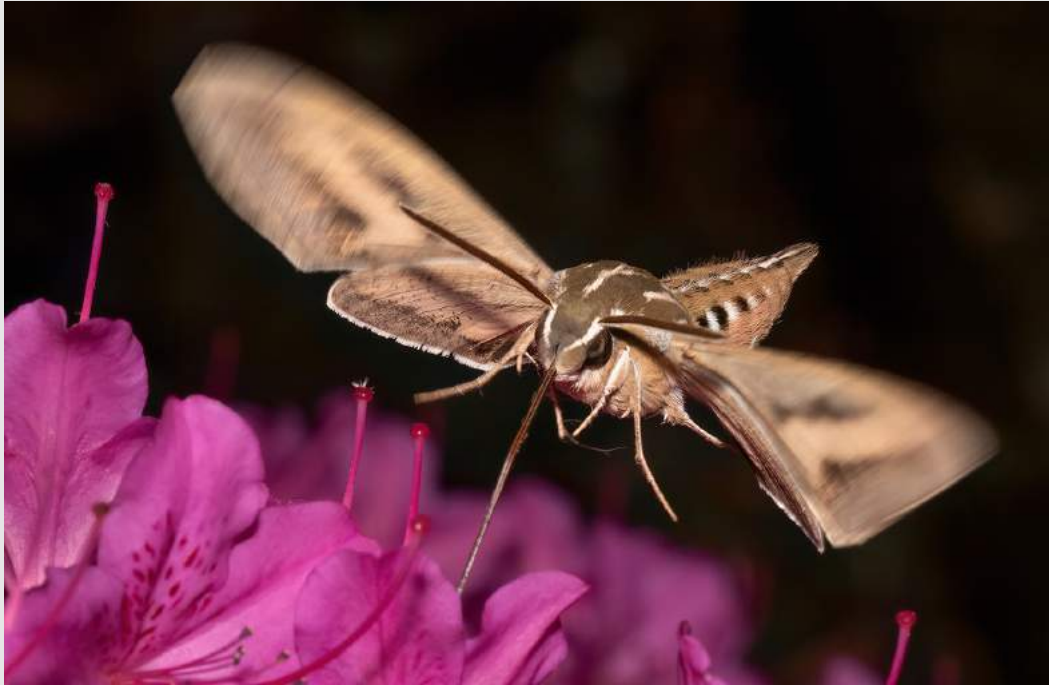
"WHITELINED SPHINX MOTH FEEDING"