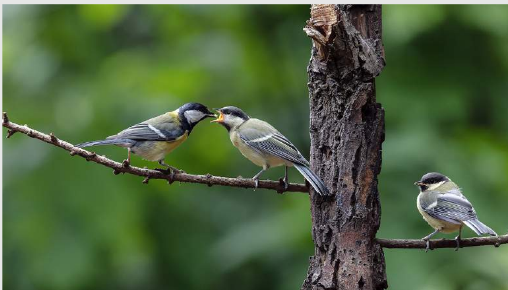
“FEEDING GREAT TIT”