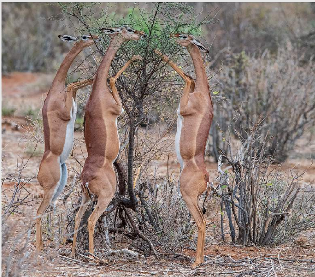
"THREE HUNGRY GERENUKS"