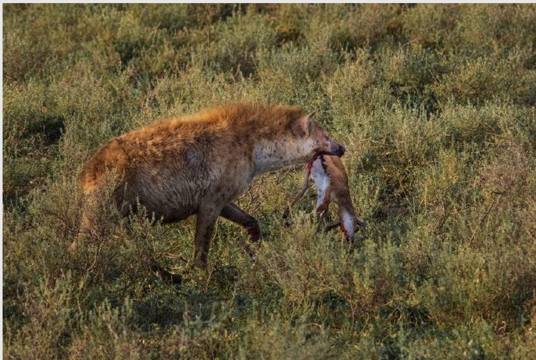
“HYENA EATING BABY”