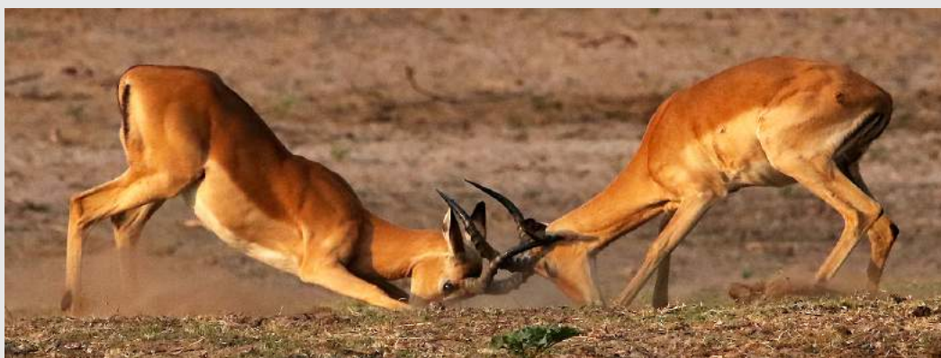
“IMPALA JOUST 2764”