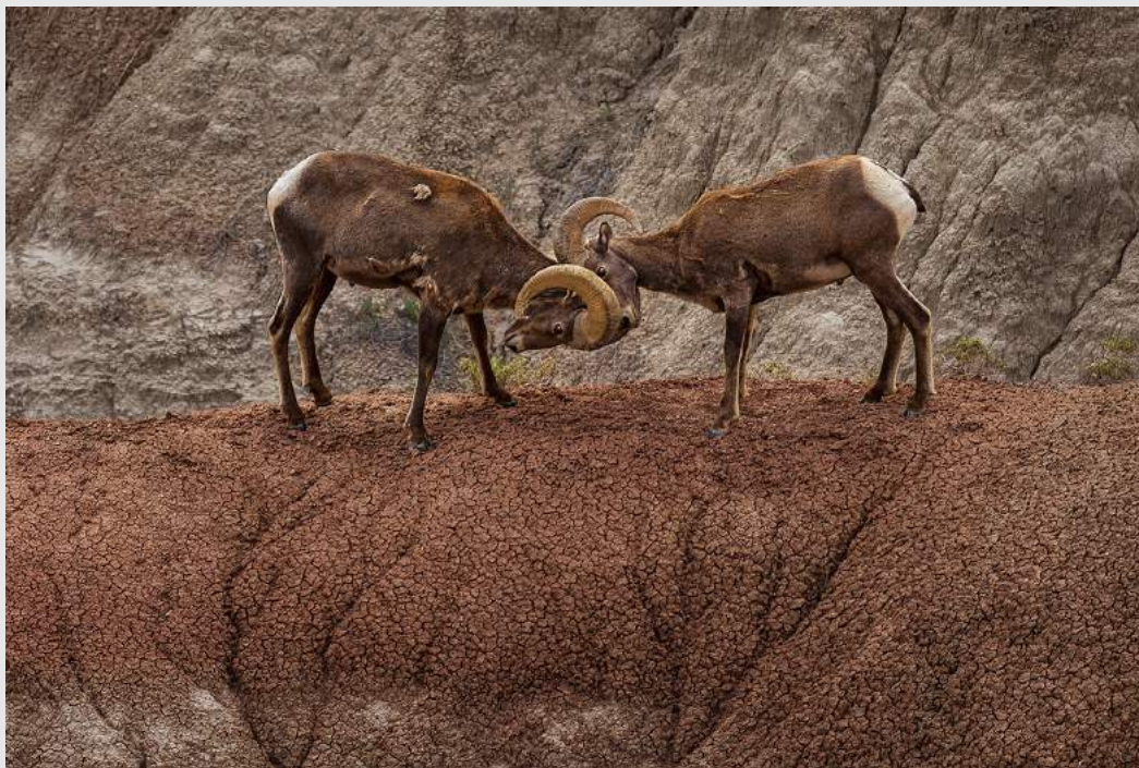
"TWO BIG HORNS"