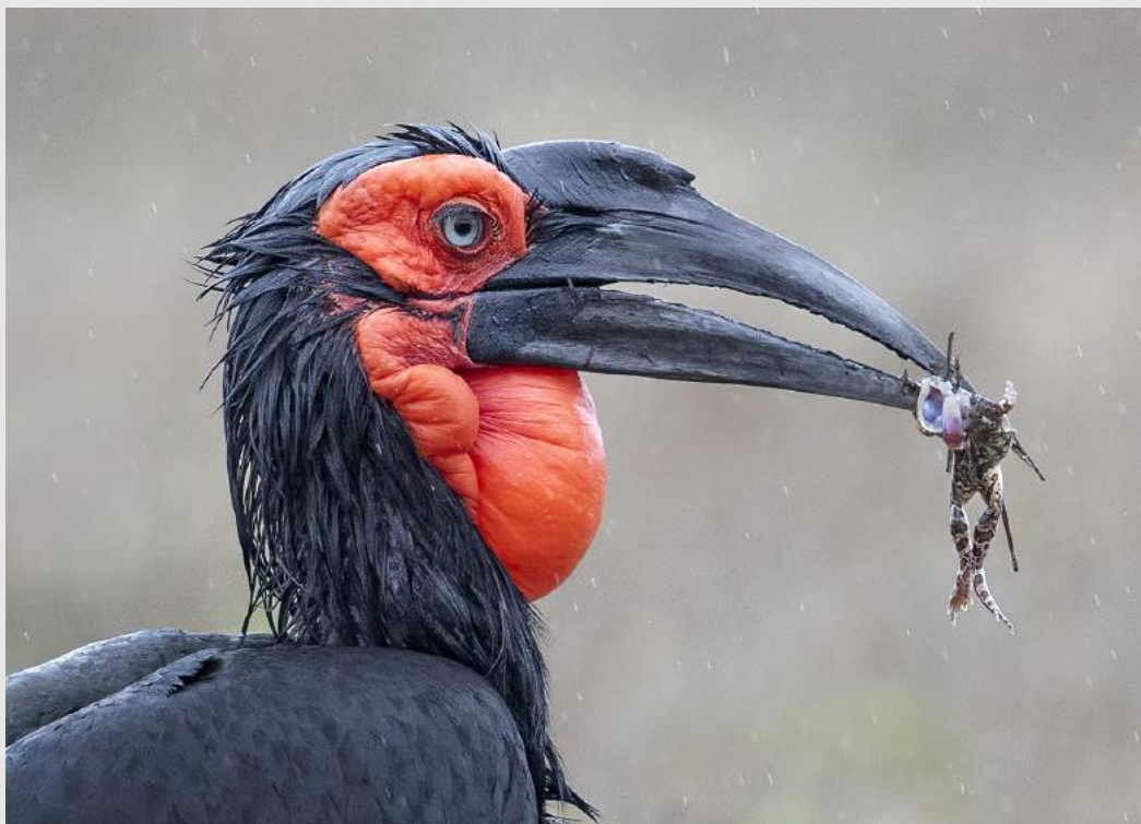
"SOUTHERN GROUND HORNBILLN WITH FROG"