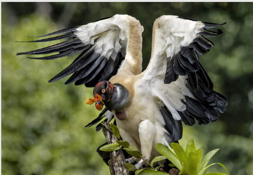
“KING VULTURE LANDING ON STUMP”