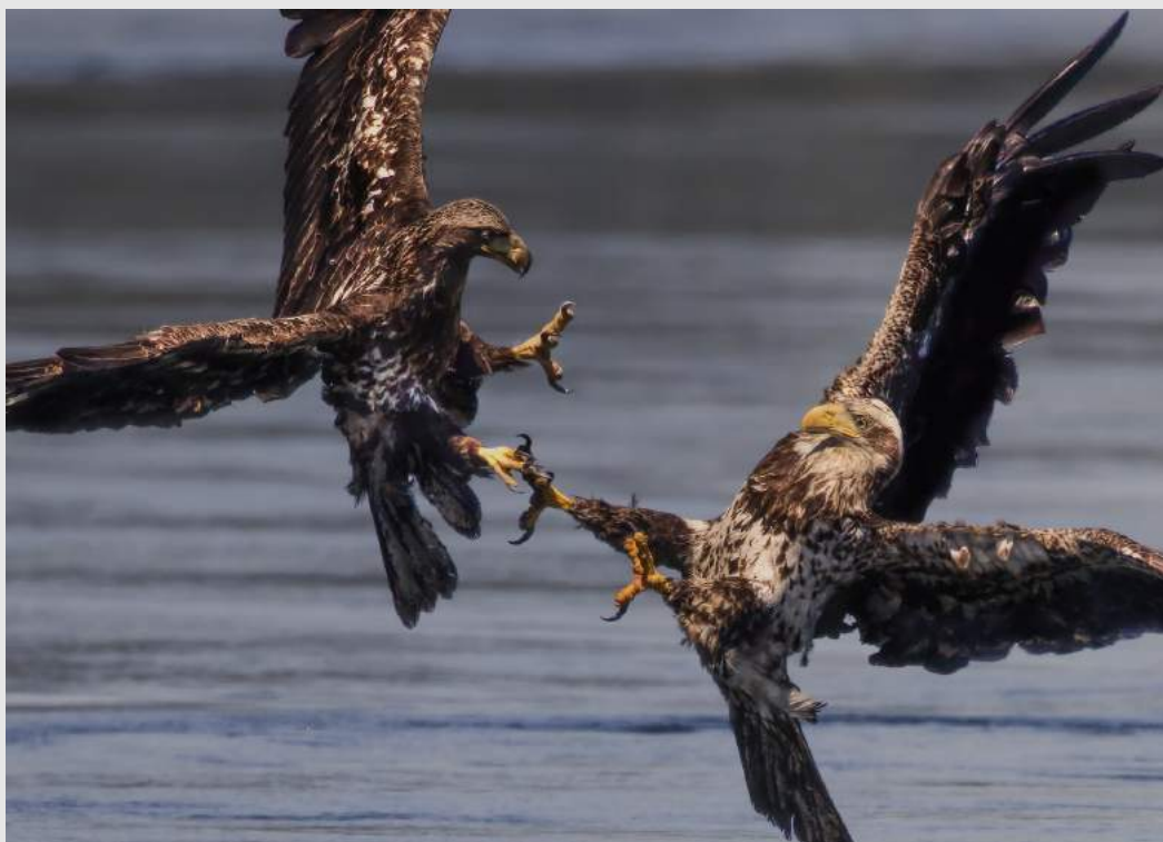
“YOUNG EAGLES FIGHTING”