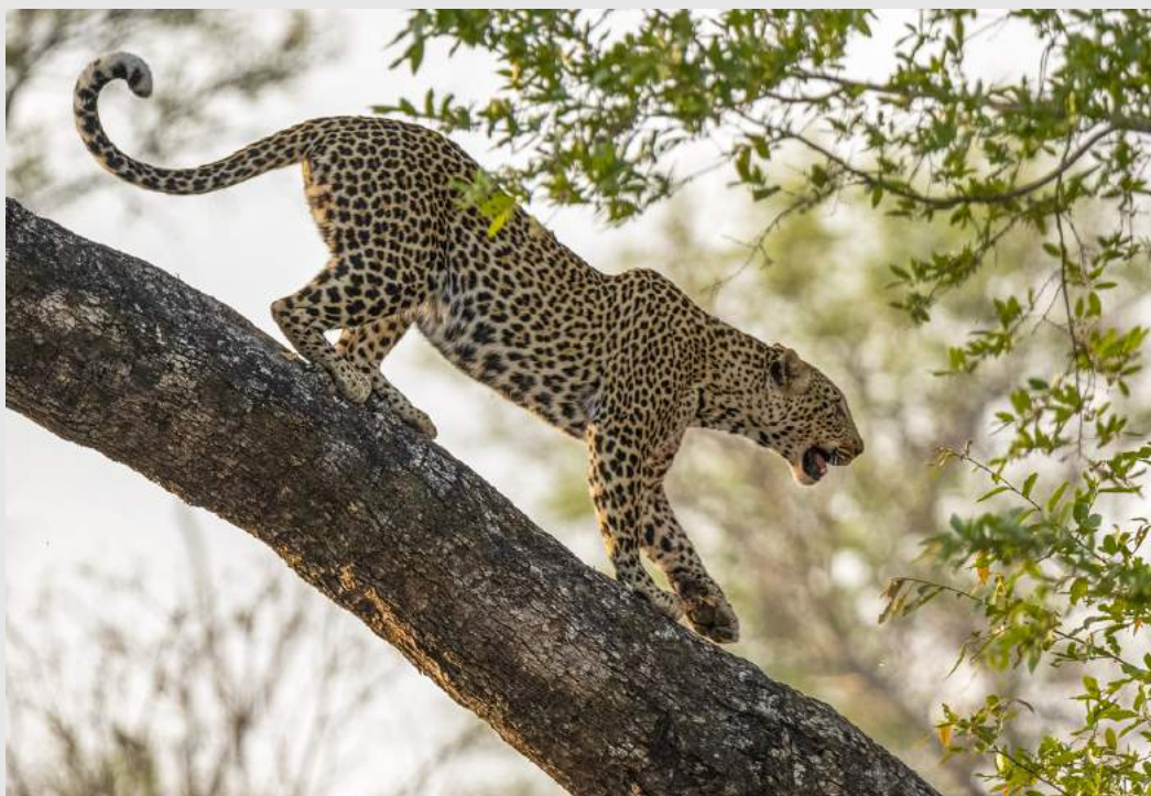
“LEOPARD CLIMBING DOWN TREE”