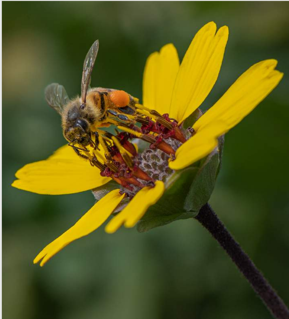
“BEE STUDY 8781”