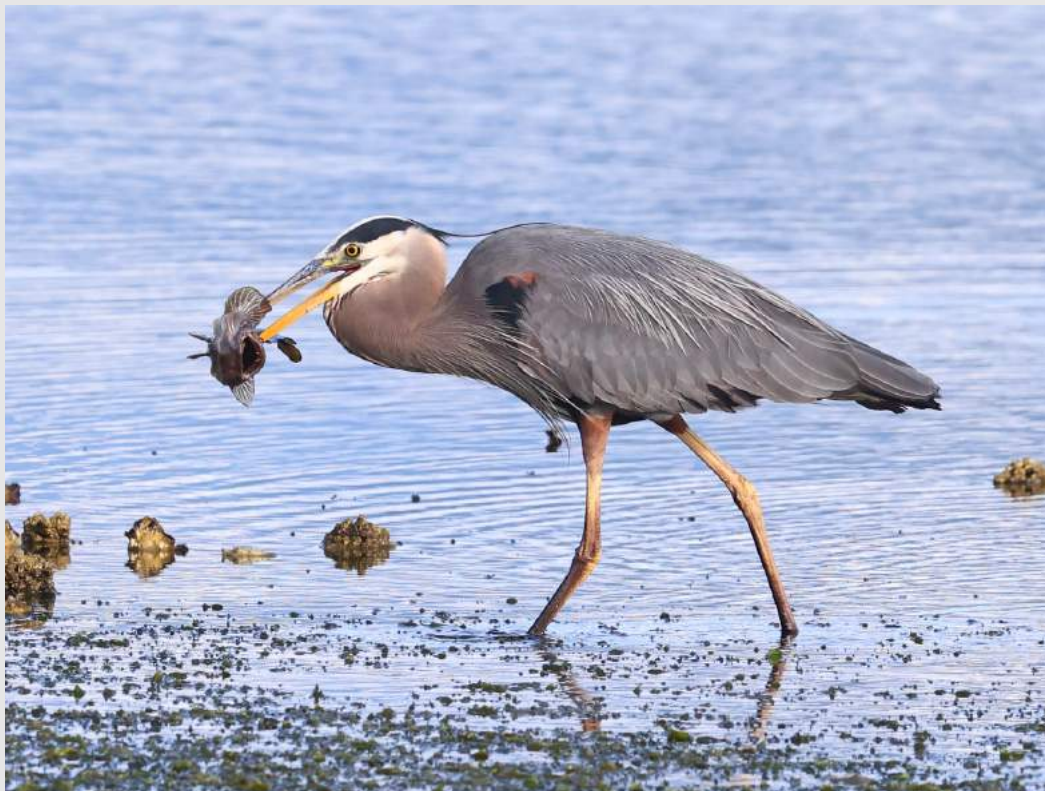
“HERON WITH MIDSHIPMAN FISH”