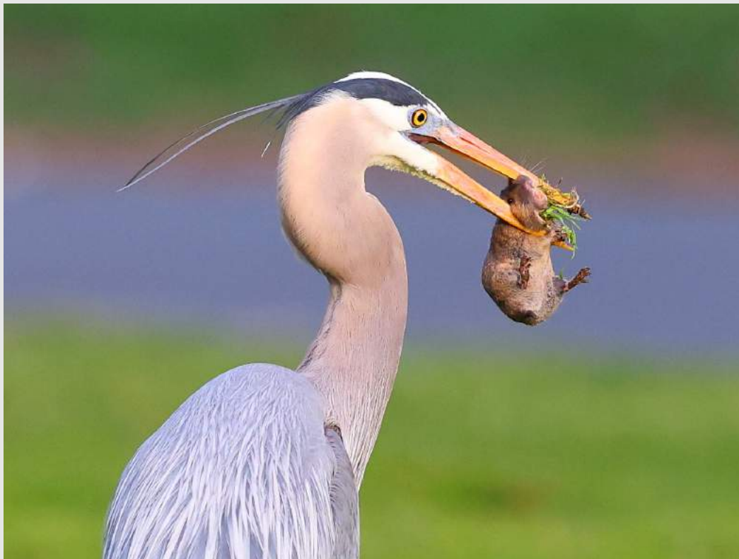
"HERON WITH GOPHER"