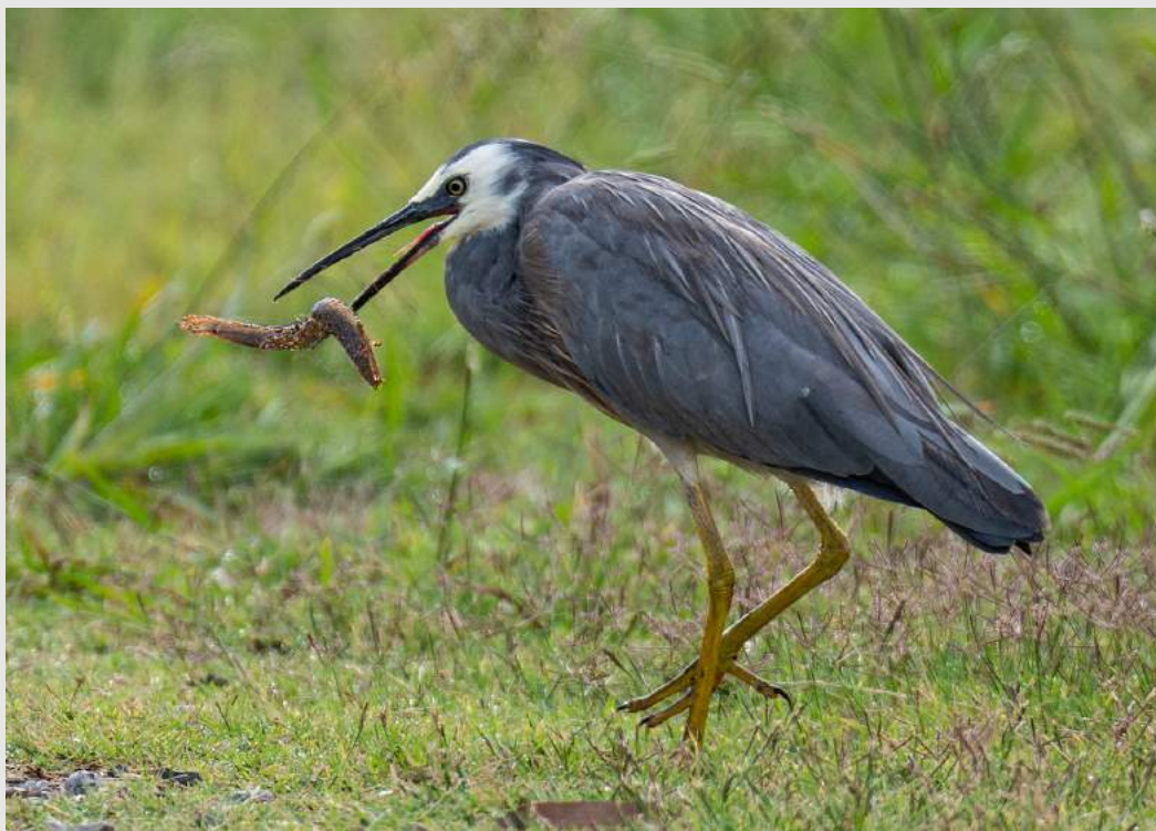
"HERON WITH CATCH"