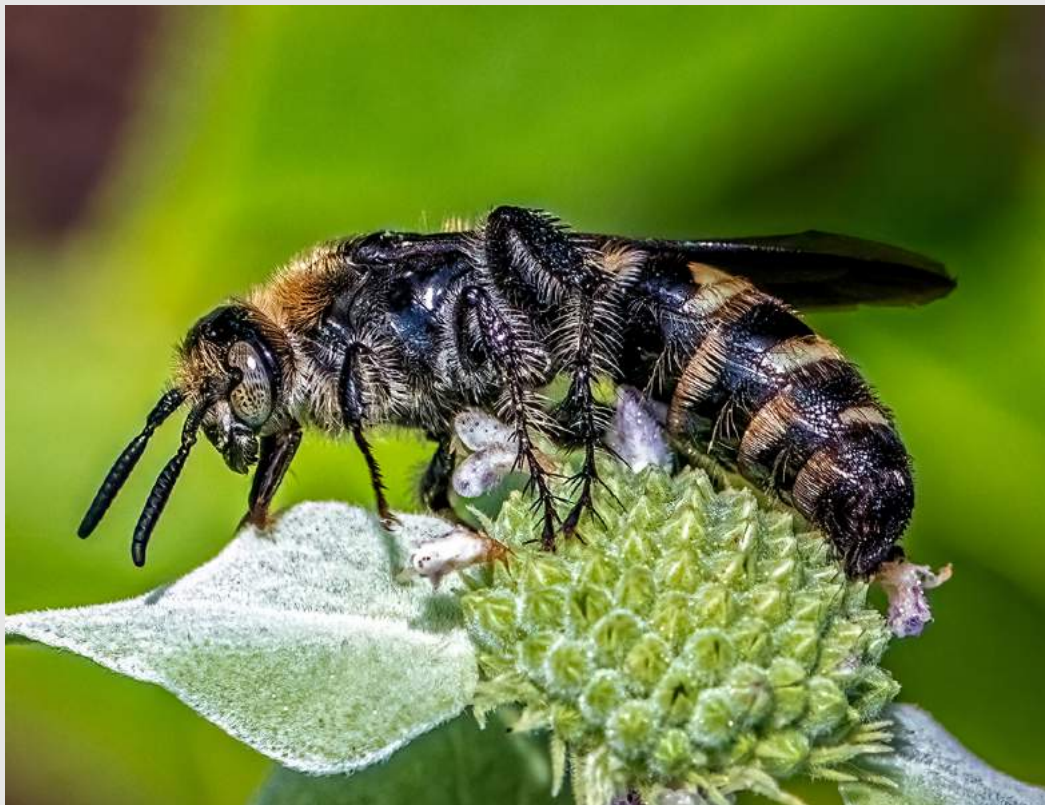
“FEATHER LEGGED SCOLIID WASP”