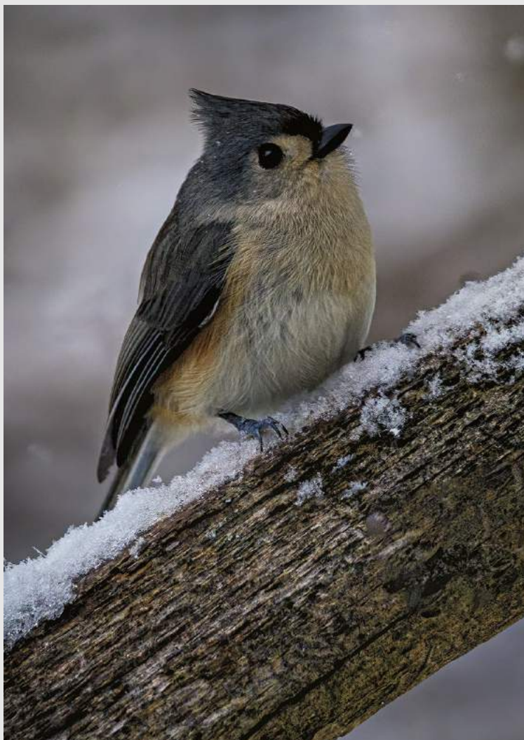
"TITMOUSE JAN SNOWSTORM"