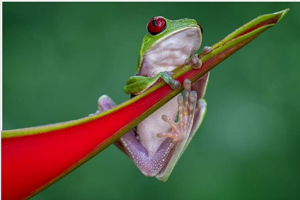
“GREEN EYE FROG HOLDING ON”