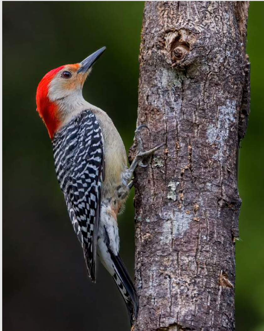
“RED BELLIED WOODPECKER IN APRIL”