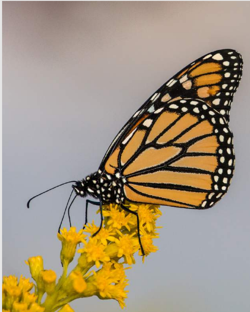
"MONARCH BUTTERFLY 6164"