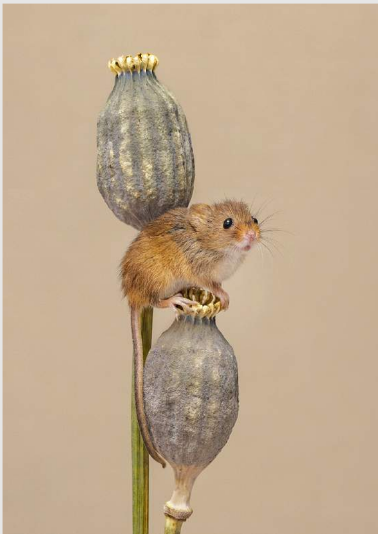
“HARVEST MOUSE ON POPPYHEAD”