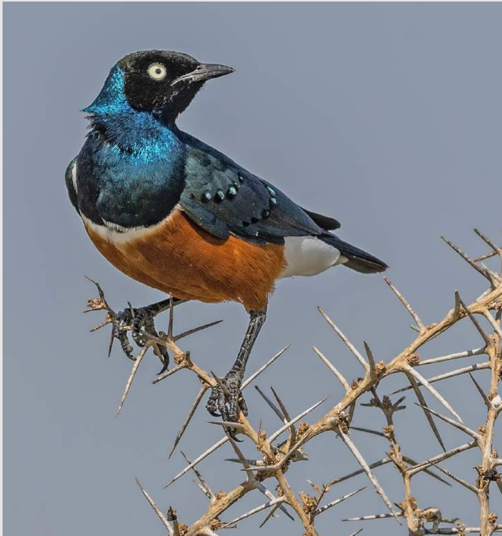
"STARLING ON THORNS"