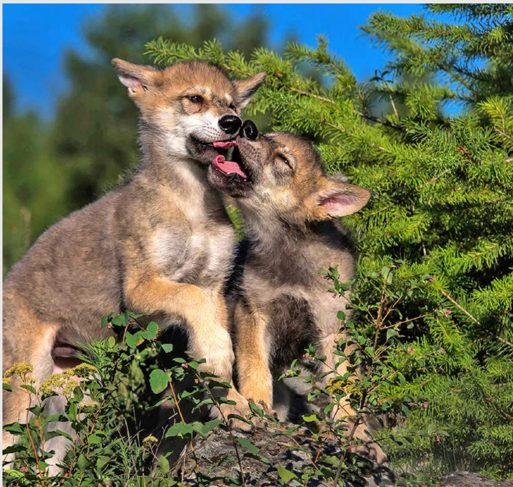
“WOLF PUPS PLAYING”