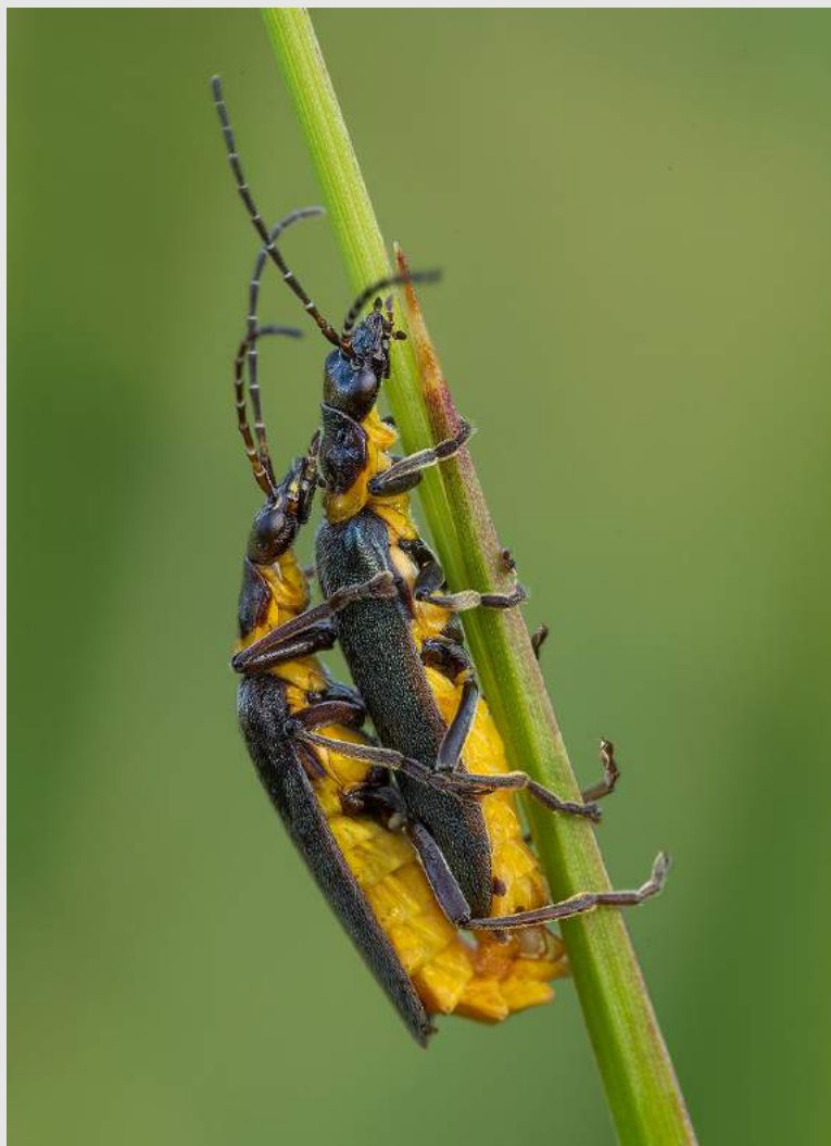
“PLAGUE SOLDIER BEETLES MATING 8”