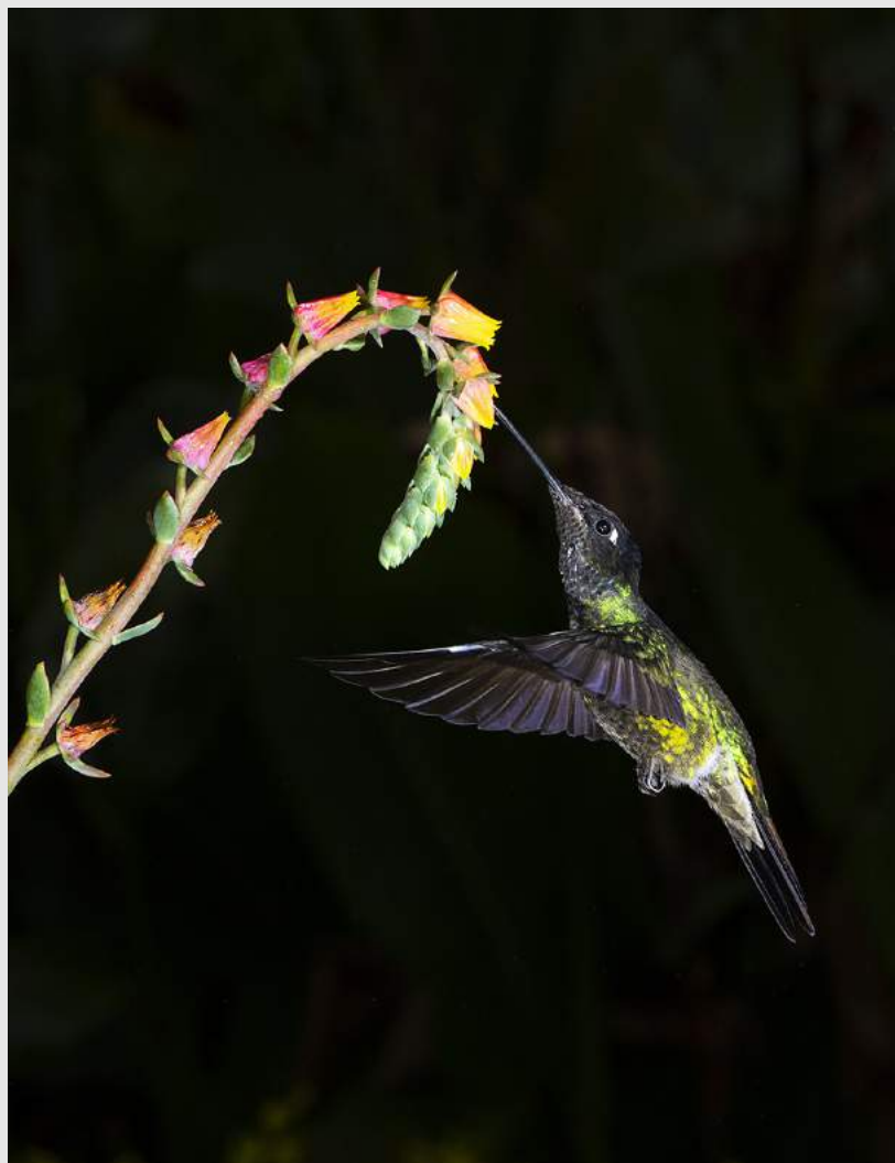
“GREEN HUMMER STRAIGHT BILL 01”