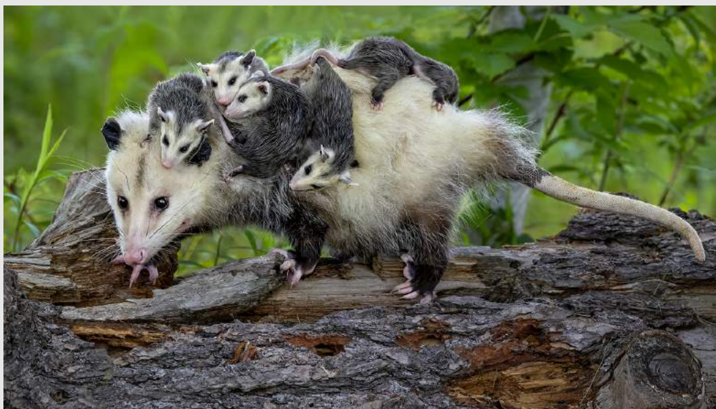
“PASSEL OF POSSUMS”