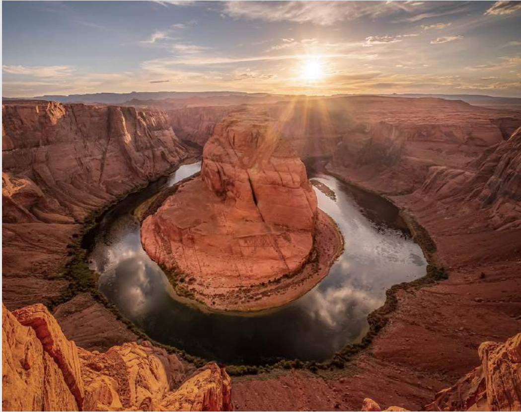
“HORSESHOE BEND SUNSET”