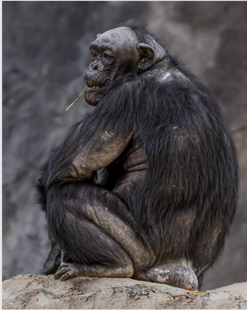
“PENSIVE OLD CHAP”