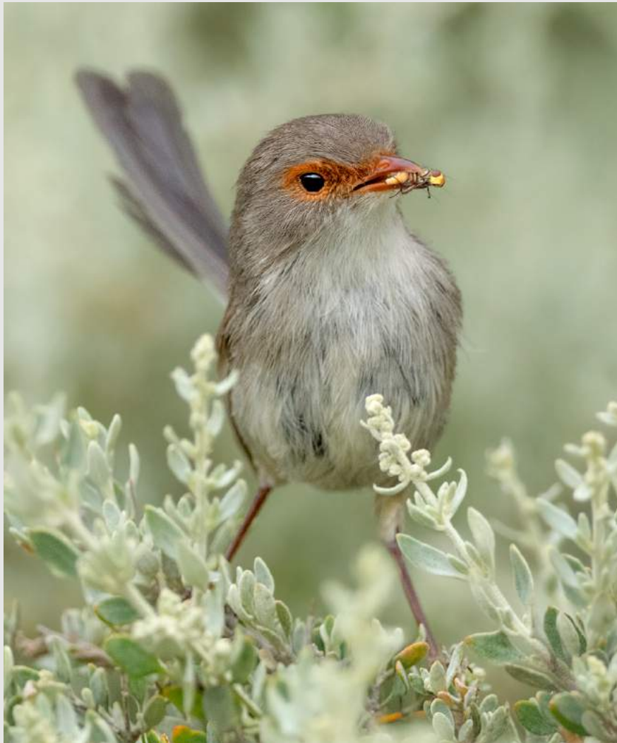
“JENNY WREN WITH HOVERFLY 5”