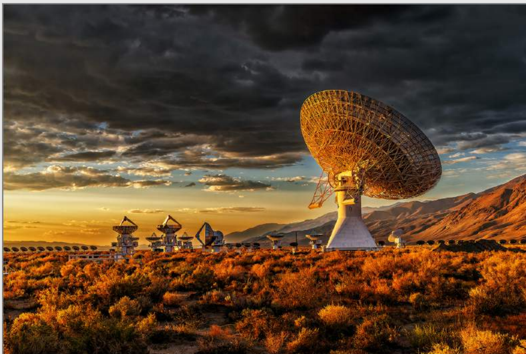
“OWENS VALLEY RADIO OBSERVATORY-02”