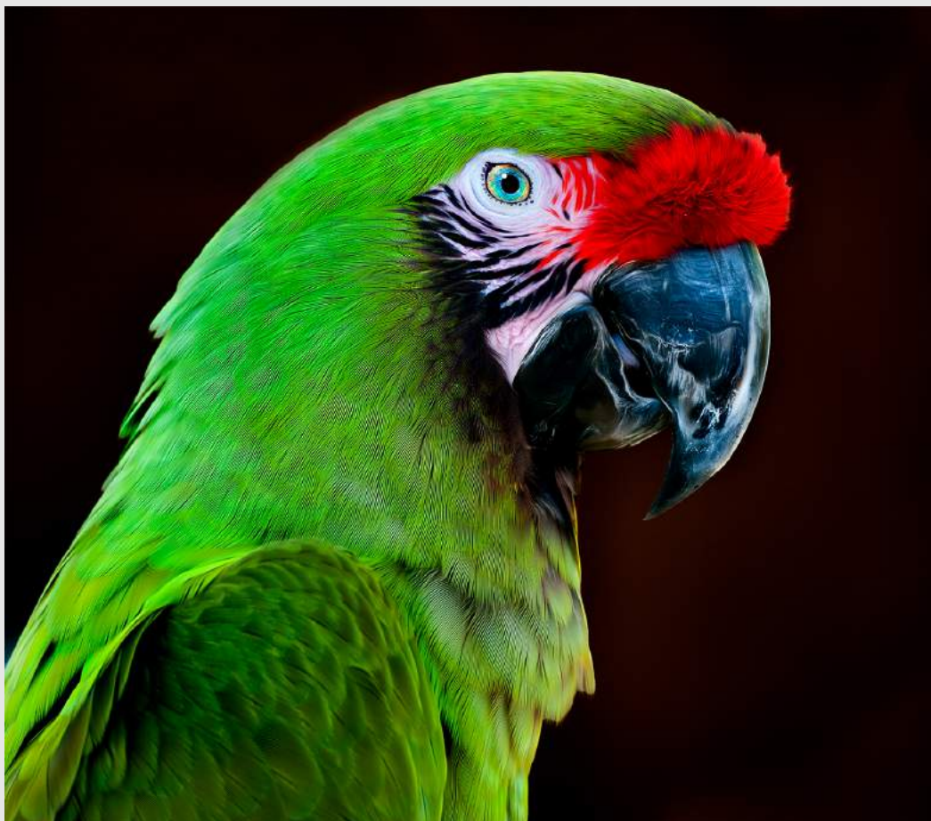
“GREEN PARROT 0651”