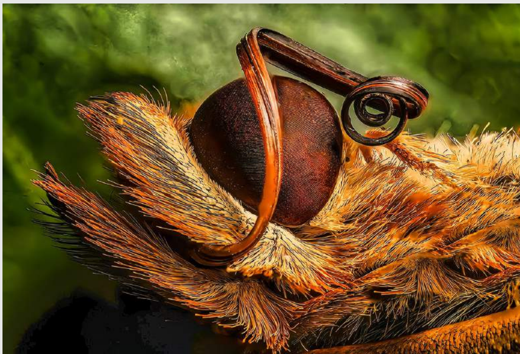
“BUTTERFLY EYE AND PROBOSCIS”