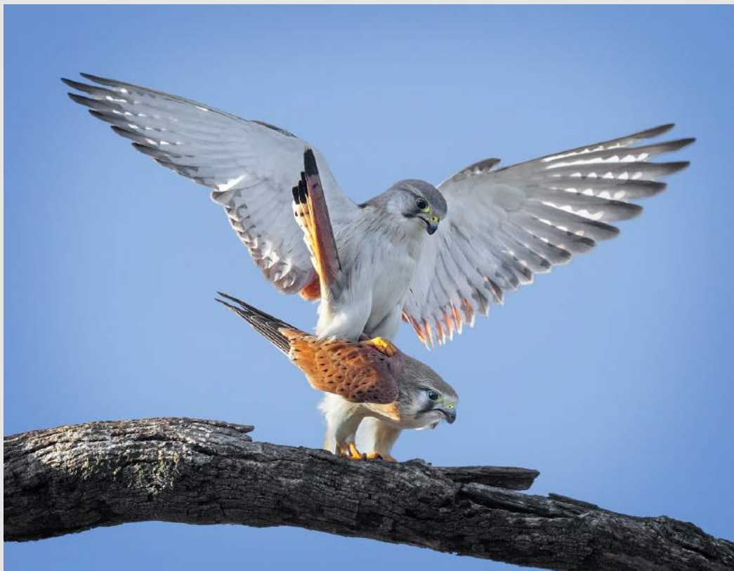
“MATING KESTRELS 21”