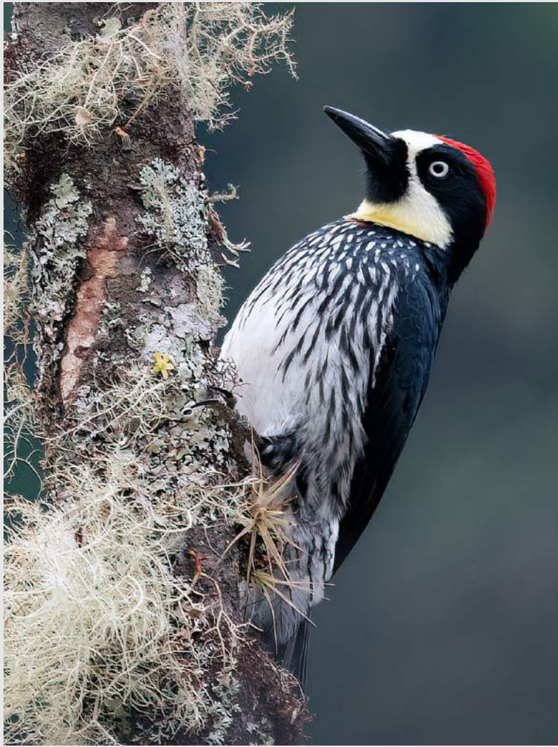
“WHITE FACED WOODPECKER”