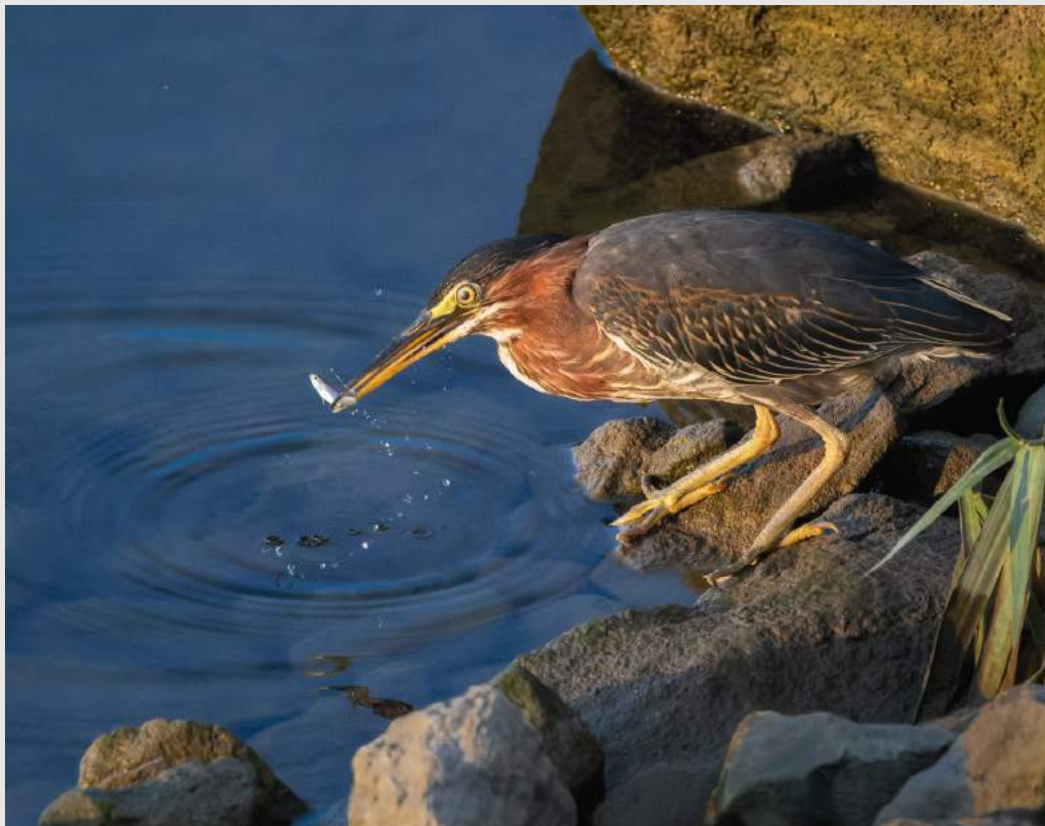
“GREEN HERON I”