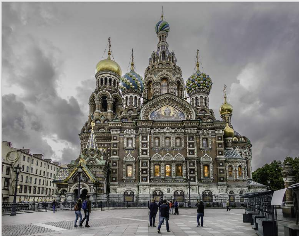
“CATHEDRAL OF CHRIST ST PETERSBURG”