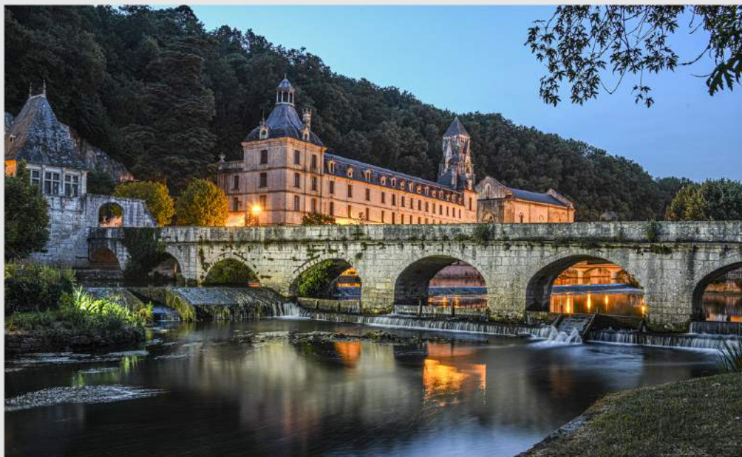
“EVENING LIGHT ON BRANTOME ABBEY”