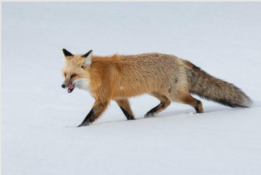
"FOX IN THE SNOW III"