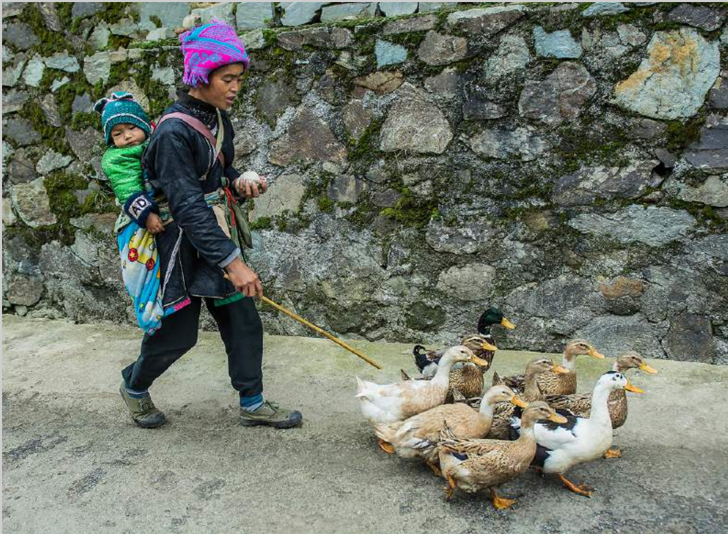
“DUCK-MARCH” © ALOIS BERNKOPF DR, EFIAP/S, GPU CR4 2019 S4C International Exhibition of Photography Photojournalism Human Interest