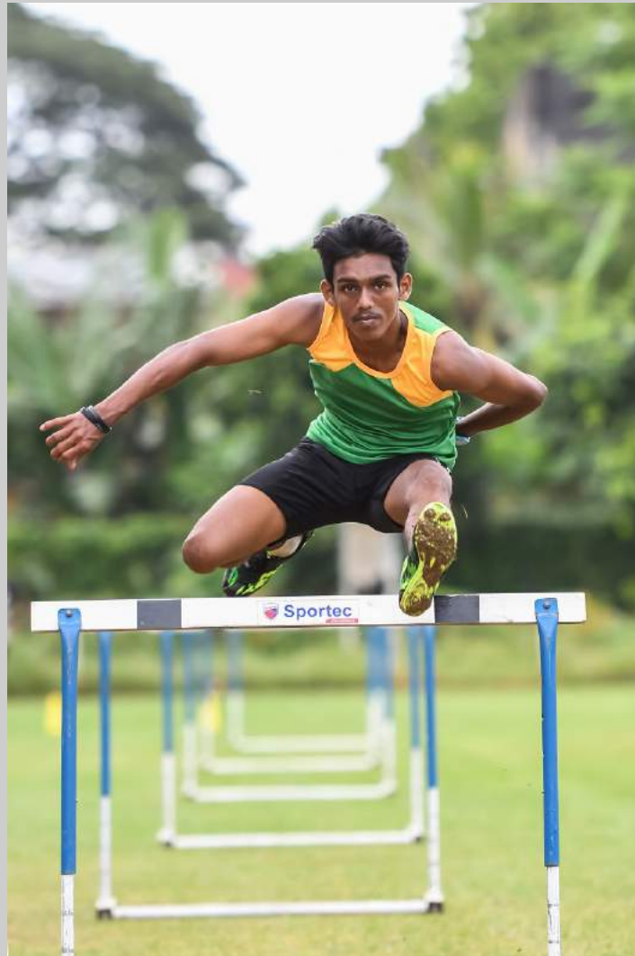
“FINAL JUMP” © WASIRI GAJAMAN, QPSA 2019 S4C International Exhibition of Photography Photojournalism General