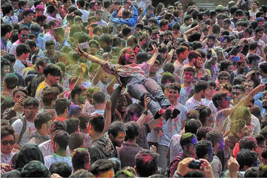
“JOYFUL FESTIVAL” © KA-PAK KONG, PPSA 2019 S4C International Exhibition of Photography Photojournalism Human Interest