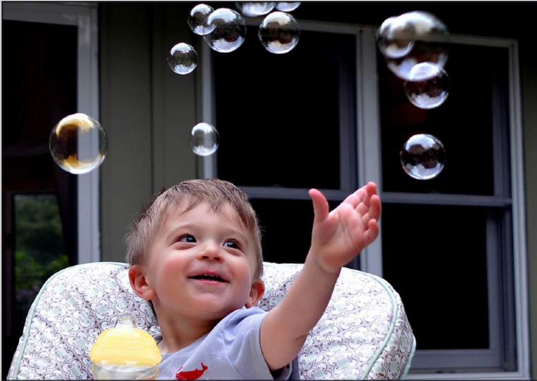
“STEPHEN” © JOHN BEISHKE 2019 S4C International Exhibition of Photography Photojournalism Human Interest S4C Bronze