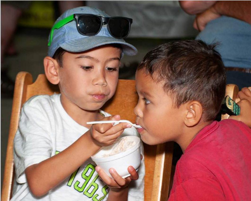
“BIG BROTHER ASSISTANCE 3733” © VIKI GAUL, APSA, PPSA 2019 S4C International Exhibition of Photography Photojournalism Human Interest