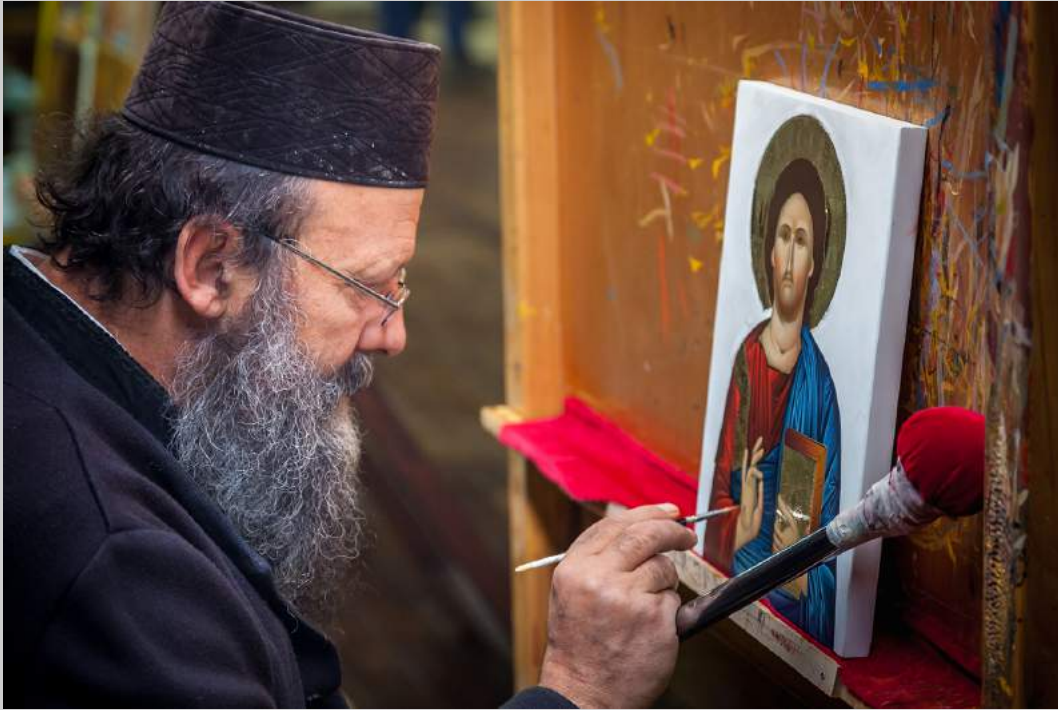
“PRIEST PAINTING” © DAVID THOMAS 2019 S4C International Exhibition of Photography Photojournalism General