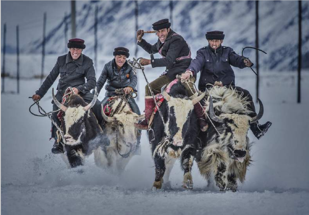
“YAK RACING 1” © XINXIN CHEN, GMPSA/B 2019 S4C International Exhibition of Photography Photojournalism General