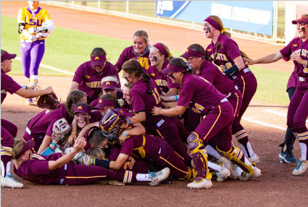
“WORLD SERIES BOUND” © KAREN LEONARD, PPSA 2019 S4C International Exhibition of Photography Photojournalism Human Interest