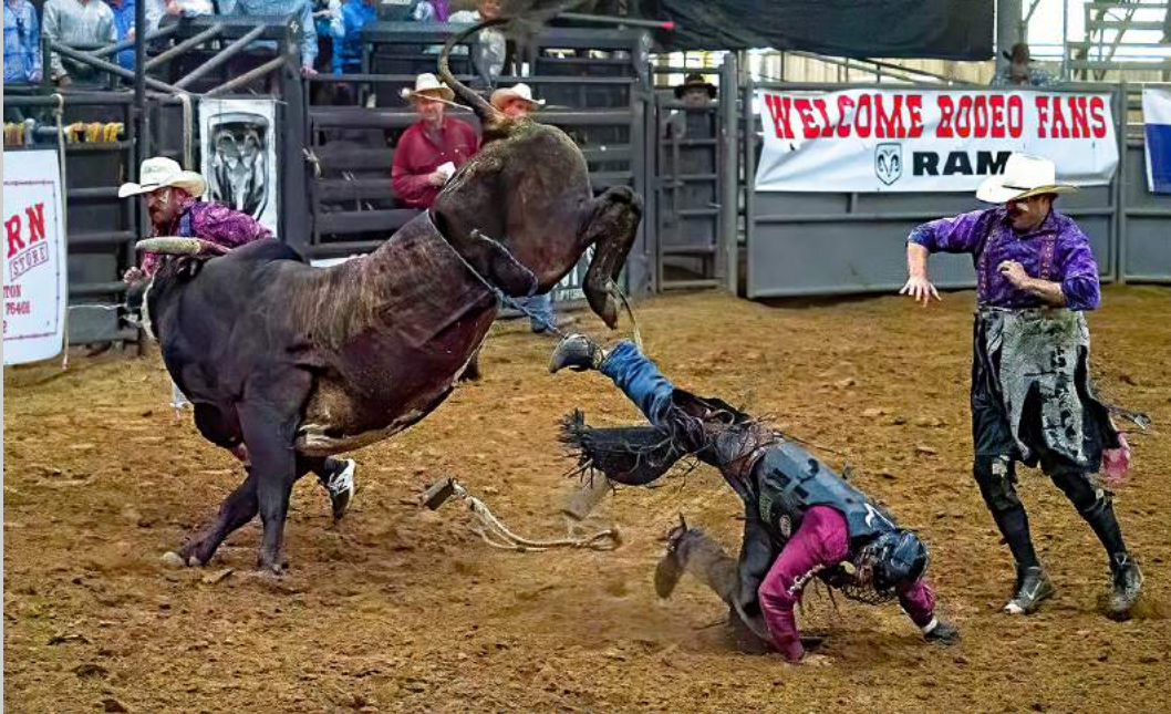
“HUNG ON HIS SPUR” 2019 S4C International Exhibition of Photography Photojournalism General