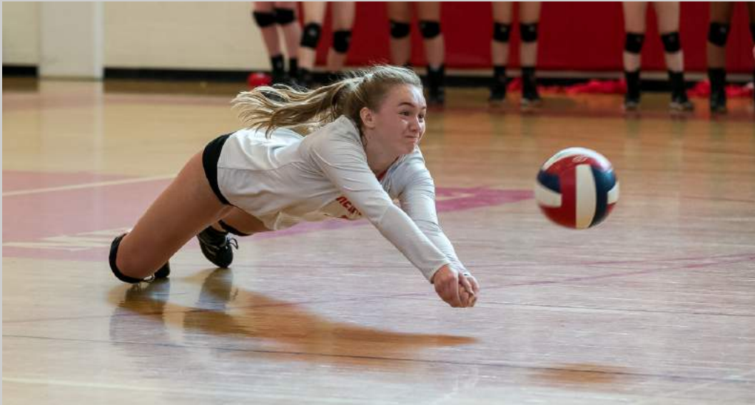
“MELROSE_2018(8269)” S4C International Exhibition of Photography Photojournalism General