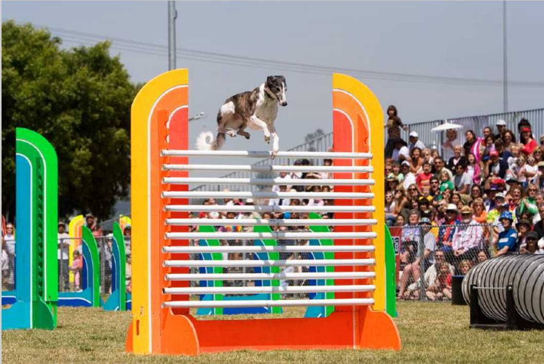
“HOW HIGH CAN I GO” S4C International Exhibition of Photography Photojournalism General