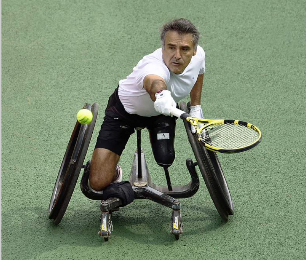
“LA FOUQUE DE STEPHANE” © GUY B. SAMOYVAULT, APSA, GMPSA 2019 S4C International Exhibition of Photography Photojournalism General