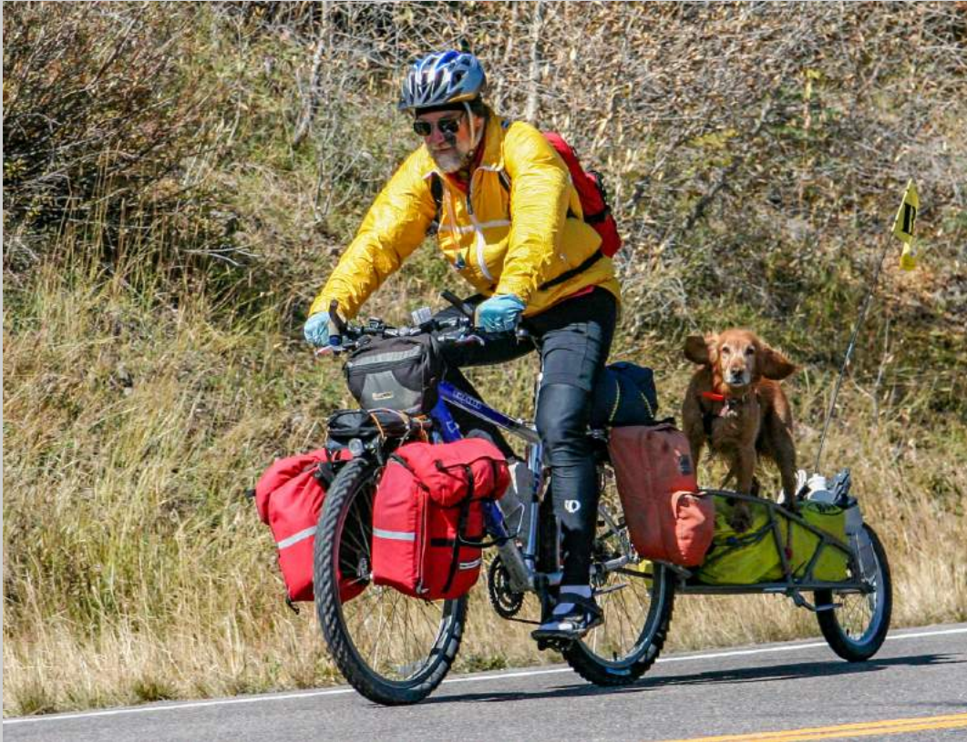
“WIND IN MY FACE” © DONNA OSBORNE, QPSA 2019 S4C International Exhibition of Photography Photojournalism Human Interest