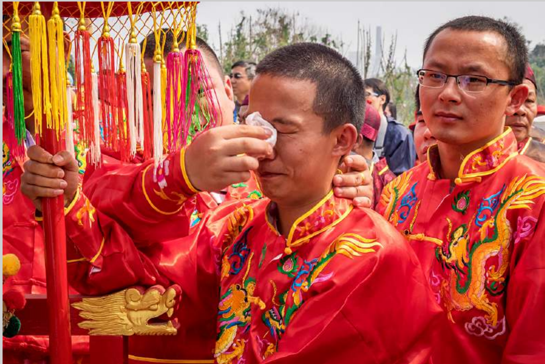
“BROTHERHOOD”, MP 2019 S4C International Exhibition of Photography Photojournalism Human Interest