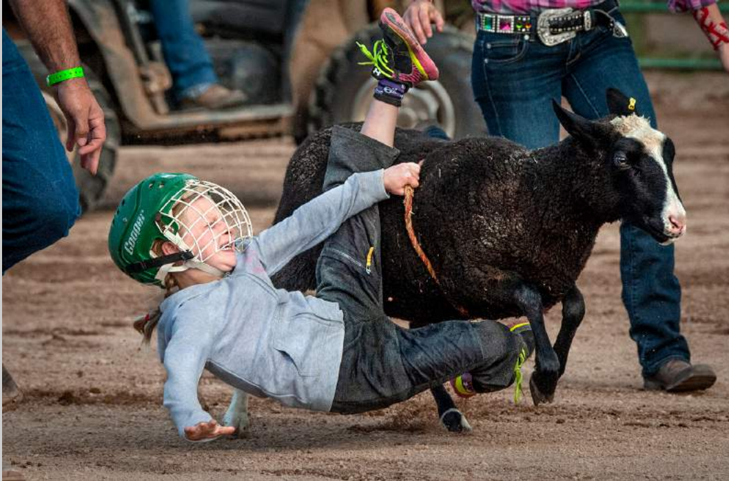
“JUST BEFORE TOUCHDOWN 5339” © VIKI GAUL, APSA, PPSA 2019 S4C International Exhibition of Photography Photojournalism General HM