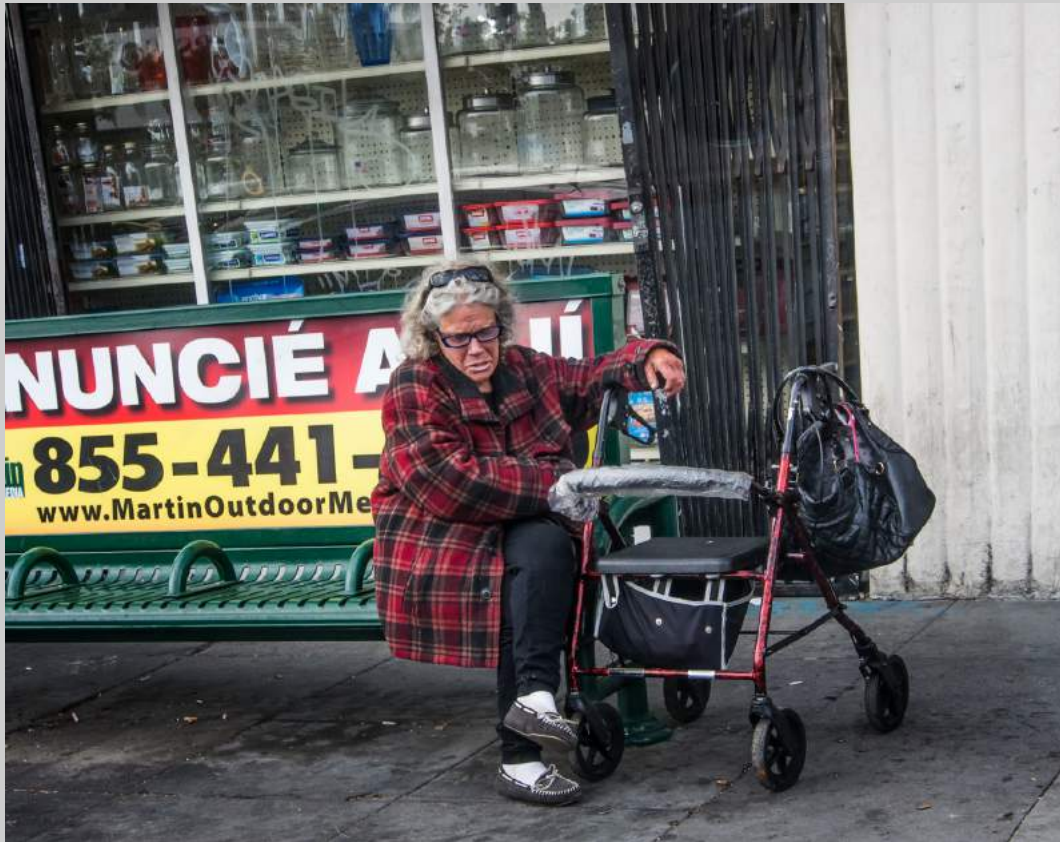
“ON A BENCH IN LA” © JUDY BURR, APSA, EPSA 2019 S4C International Exhibition of Photography Photojournalism Human Interest