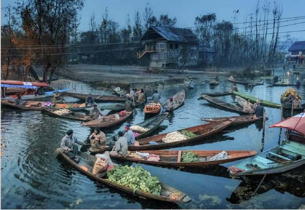
“FLOATING MARKET” © XINXIN CHEN, GMPA/B 2019 S4C International Exhibition of Photography Photojournalism General