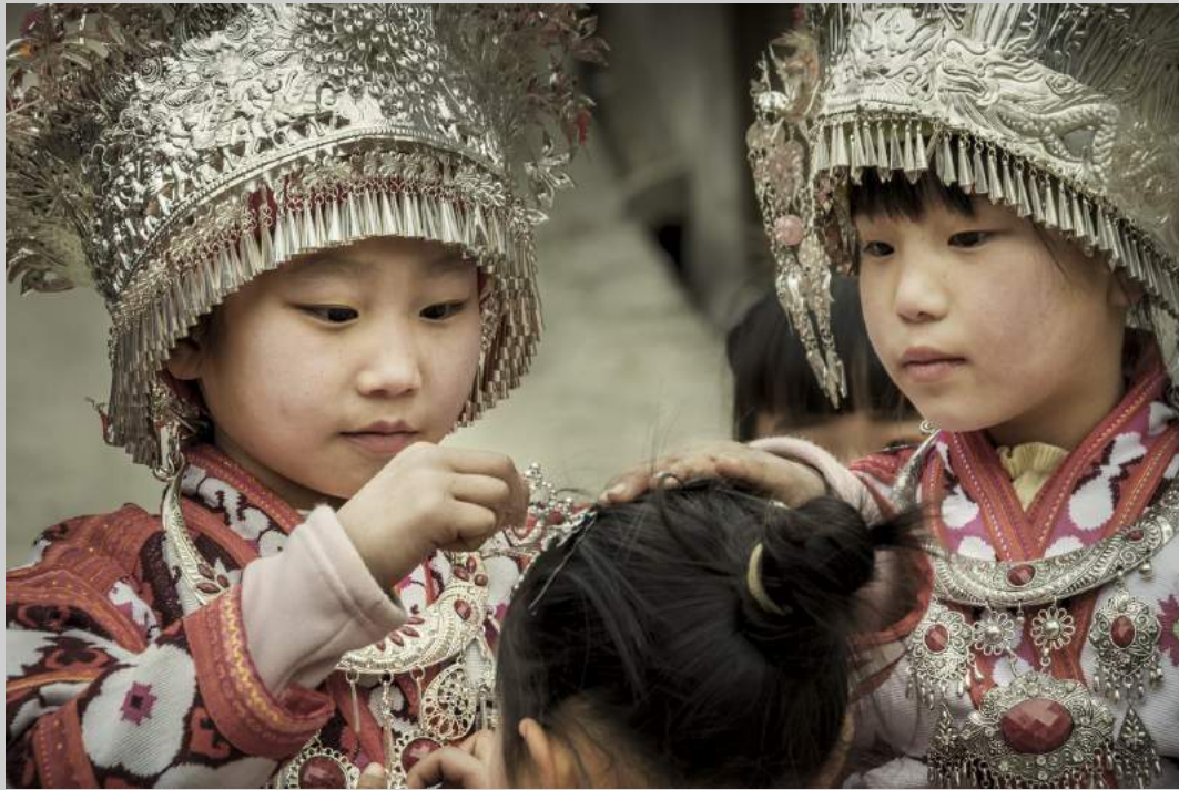
“DRESS UP” S4C International Exhibition of Photography Photojournalism Human Interest HM