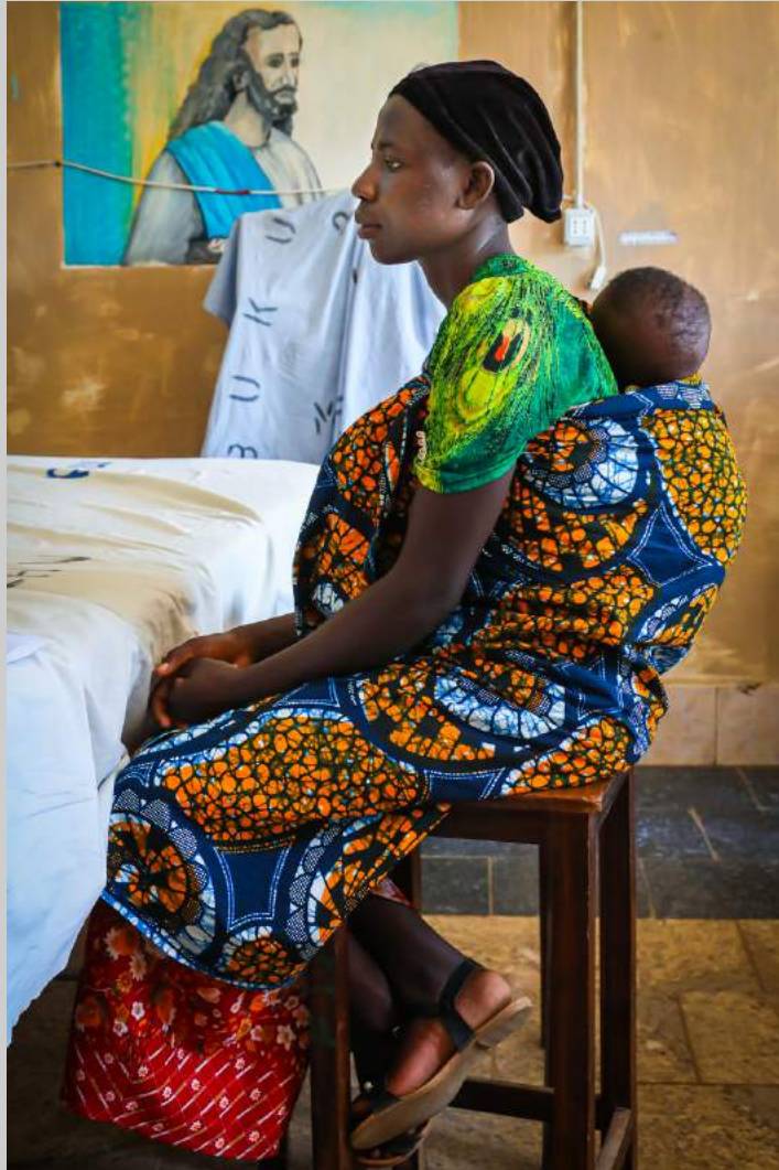
“WAITING” © GERALD FLEURY 2019 S4C International Exhibition of Photography Photojournalism General