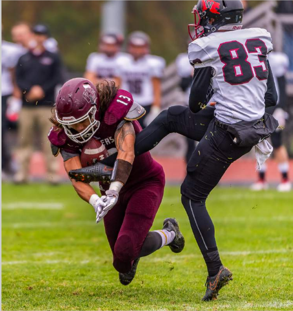
“BLOCKED PUNT” 2019 S4C International Exhibition of Photography Photojournalism General HM