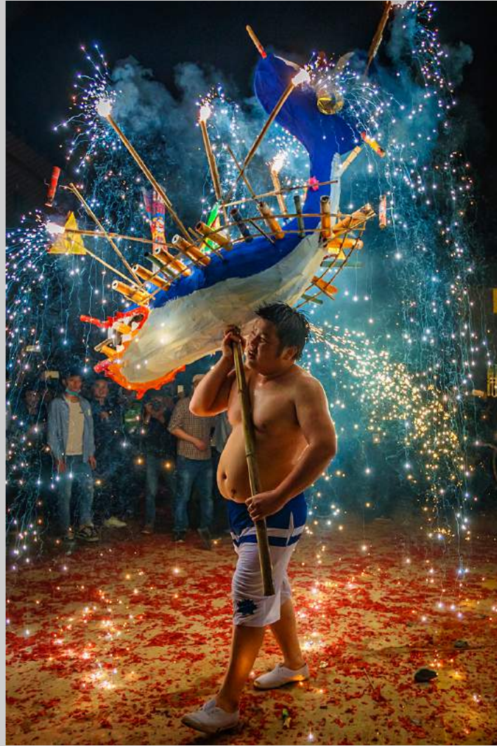
“WHALE MAN” © WOLFGANG LIN, MPSA 2019 S4C International Exhibition of Photography Photojournalism Human Interest HM