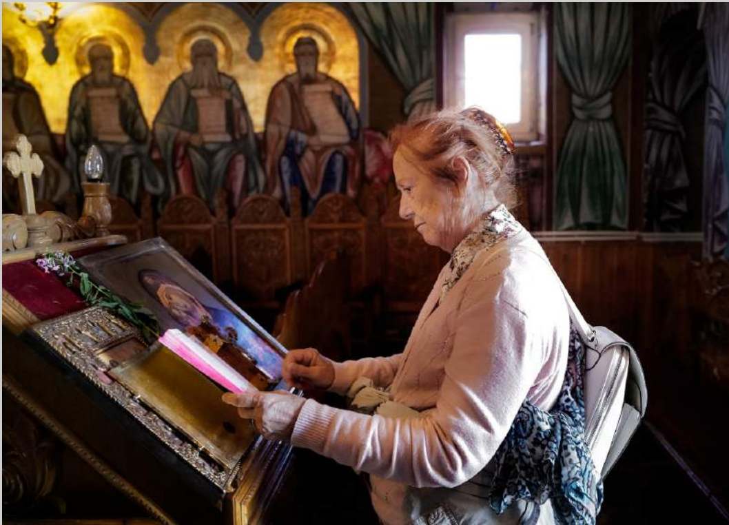
“PEACEFUL ROMANIA CHURCH” S4C International Exhibition of Photography Photojournalism Human Interest