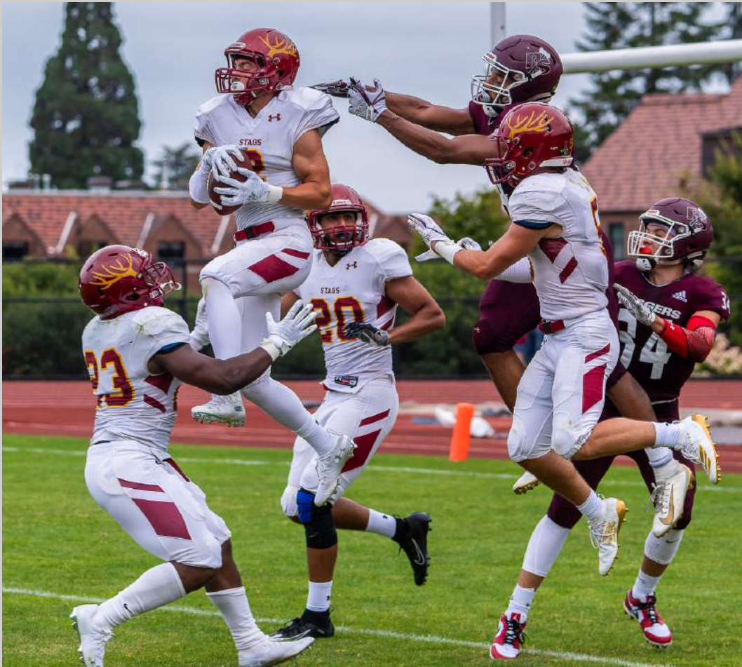
“FAILED HAIL MARY” © KURT DEVOE 2019 S4C International Exhibition of Photography Photojournalism General S4C Bronze