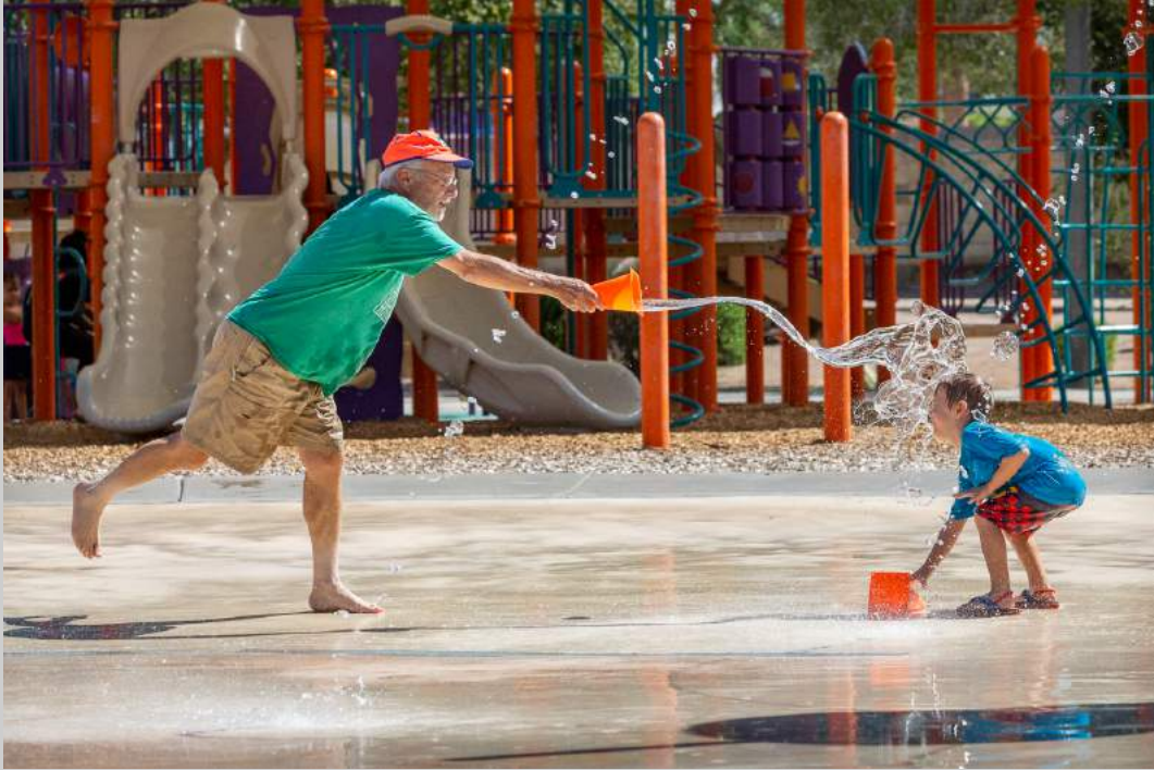
“GOT HIM” © DIANE ANDERSON 2019 S4C International Exhibition of Photography Photojournalism Human Interest