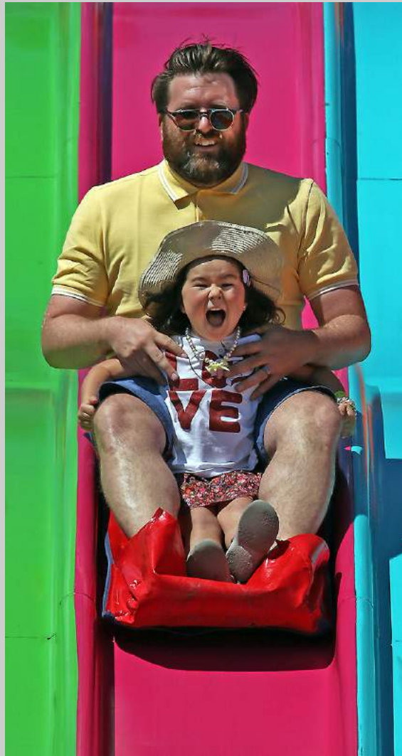
“TERRIFIED SACK SLIDER 0077” S4C International Exhibition of Photography Photojournalism Human Interest HM