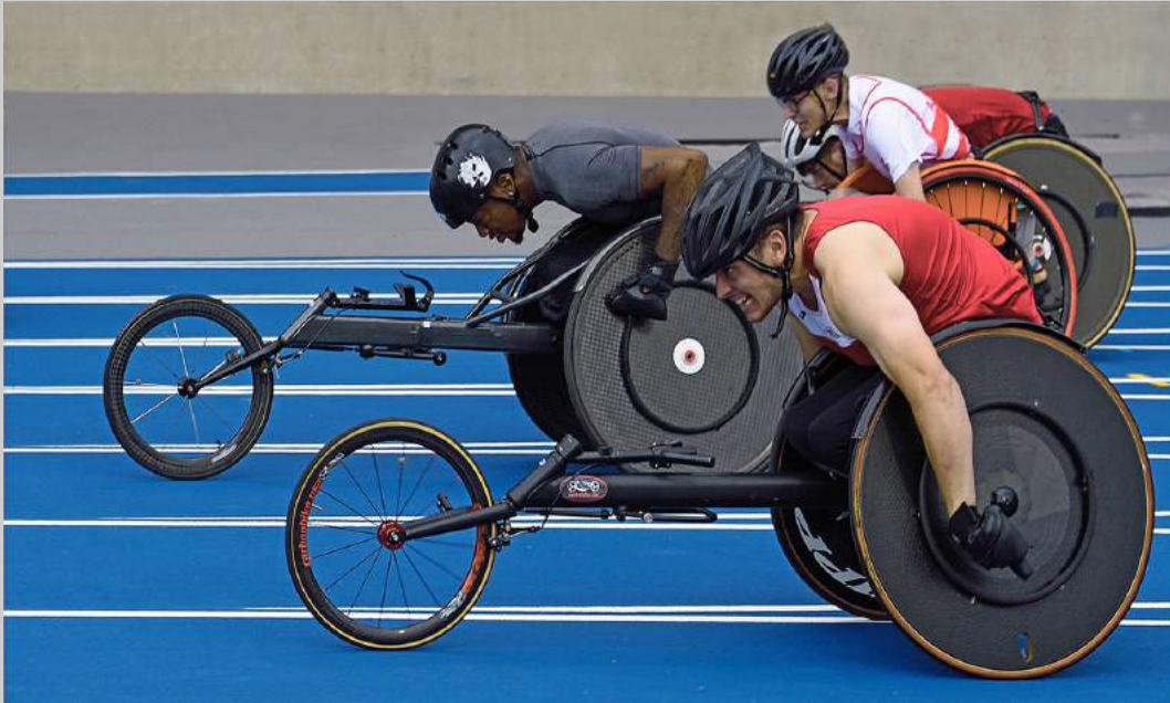
“DERNIERS EFFORTS” © GUY B. SAMOYAUULT, APSA, GMPSA 2019 S4C International Exhibition of Photography Photojournalism General S4C Bronze