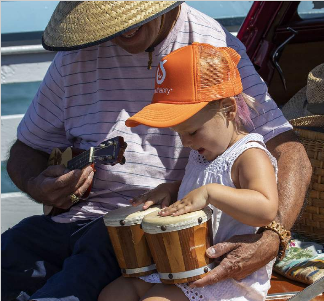
“CHILD LIKES DRUMS” © SANDRA CRANTZ 2019 S4C International Exhibition of Photography Photojournalism Human Interest HM