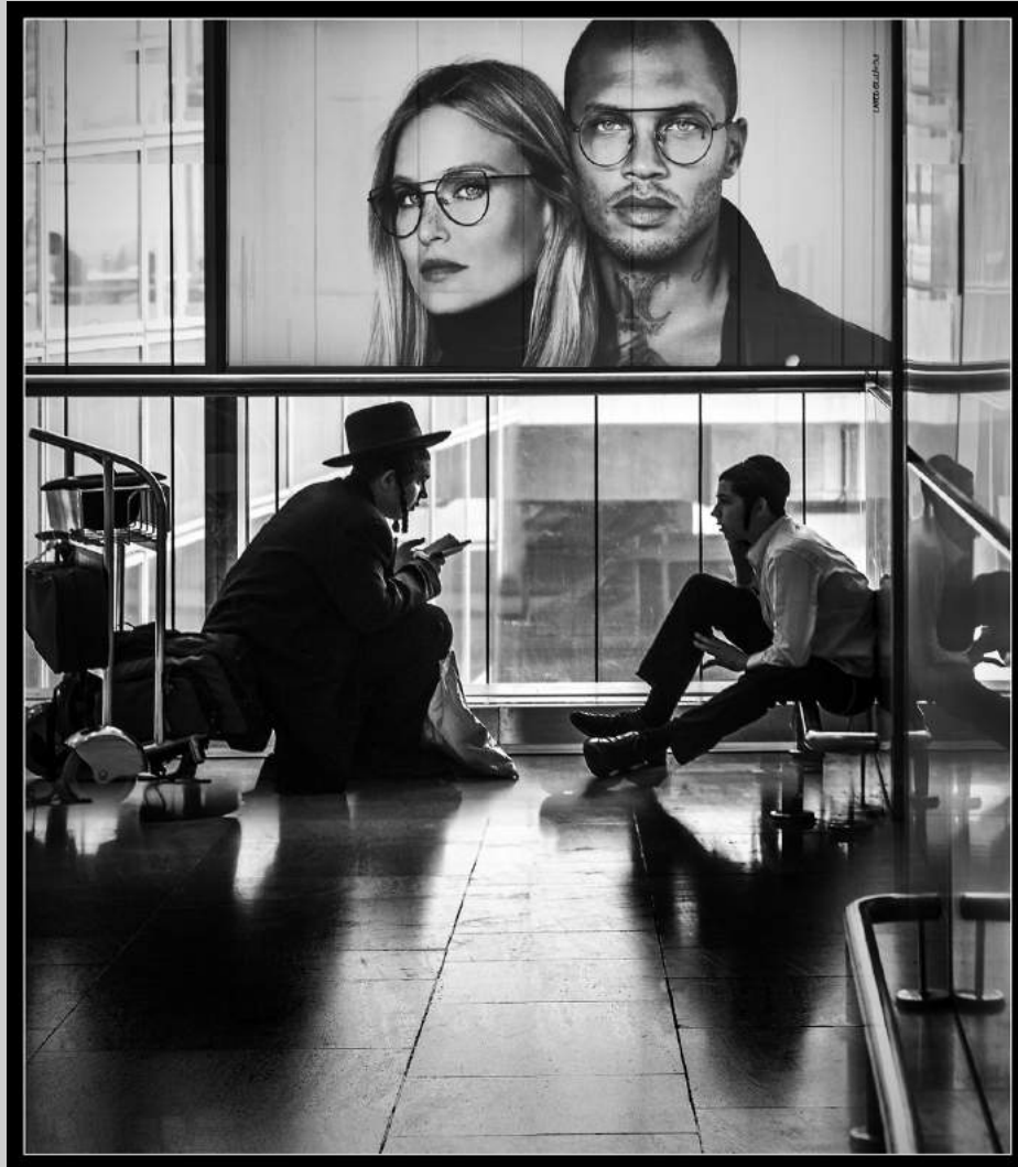
“FLIGHT DELAY” S4C International Exhibition of Photography Photojournalism General