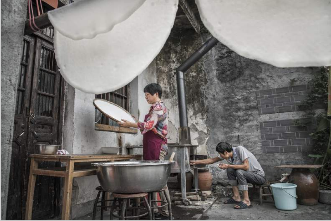
“LIFE IN PUJIANG17” © BEIMENG LIU 2019 S4C International Exhibition of Photography Photojournalism General