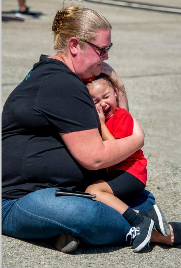
“CONSOLED” © TERRY DICKERSON, QPSA 2019 S4C International Exhibition of Photography Photojournalism Human Interest