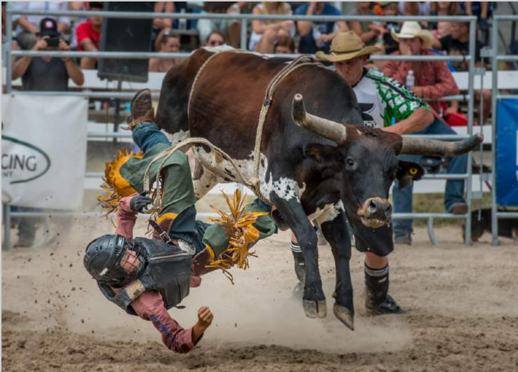
“YOUNG BULL RIDER” © FRANCIS KING, GMPA 2019 S4C International Exhibition of Photography Photojournalism General