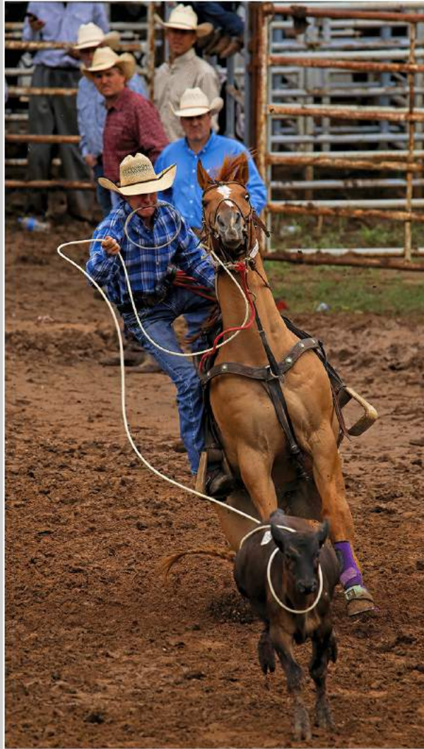
“CALF ROPER DISMOUNTING” © WARD CONAWAY, EPSA 2019 S4C International Exhibition of Photography Photojournalism General