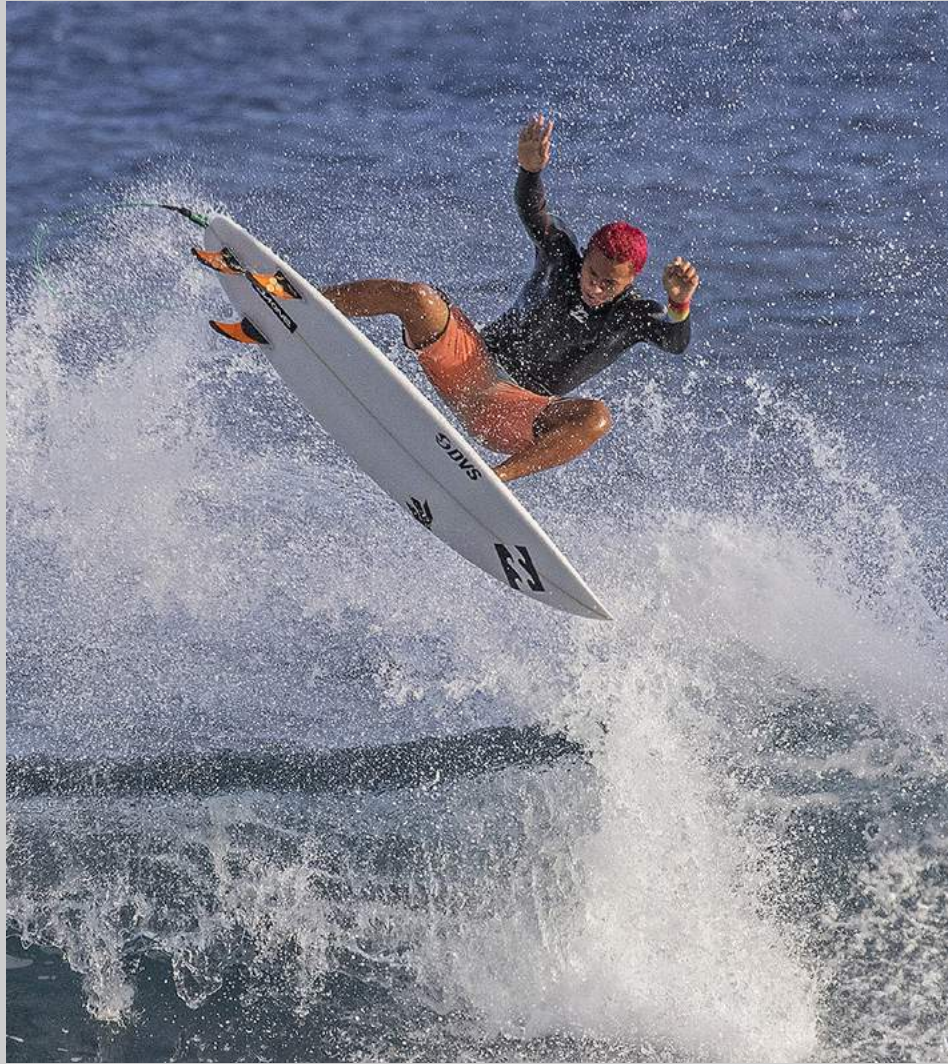
“FLYING DVS” 2019 S4C International Exhibition of Photography Photojournalism General