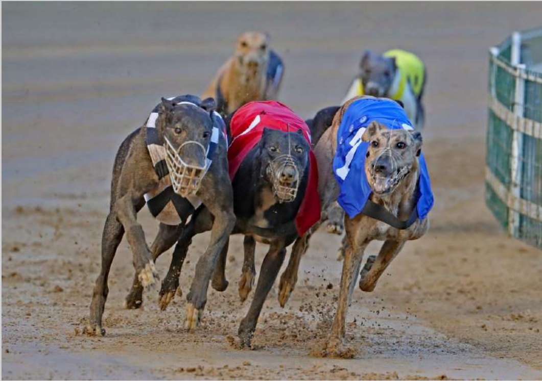
“SANDWICH” GMPA 2019 S4C International Exhibition of Photography Photojournalism General