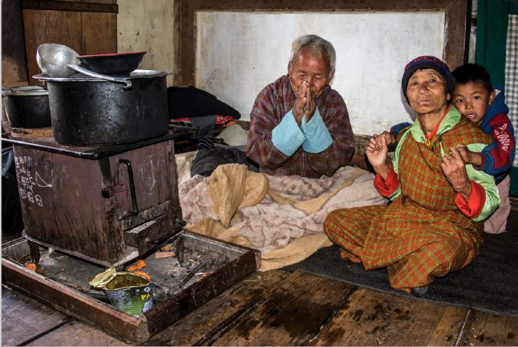
“PEACEFUL FAMILY” 2019 S4C International Exhibition of Photography Photojournalism Human Interest