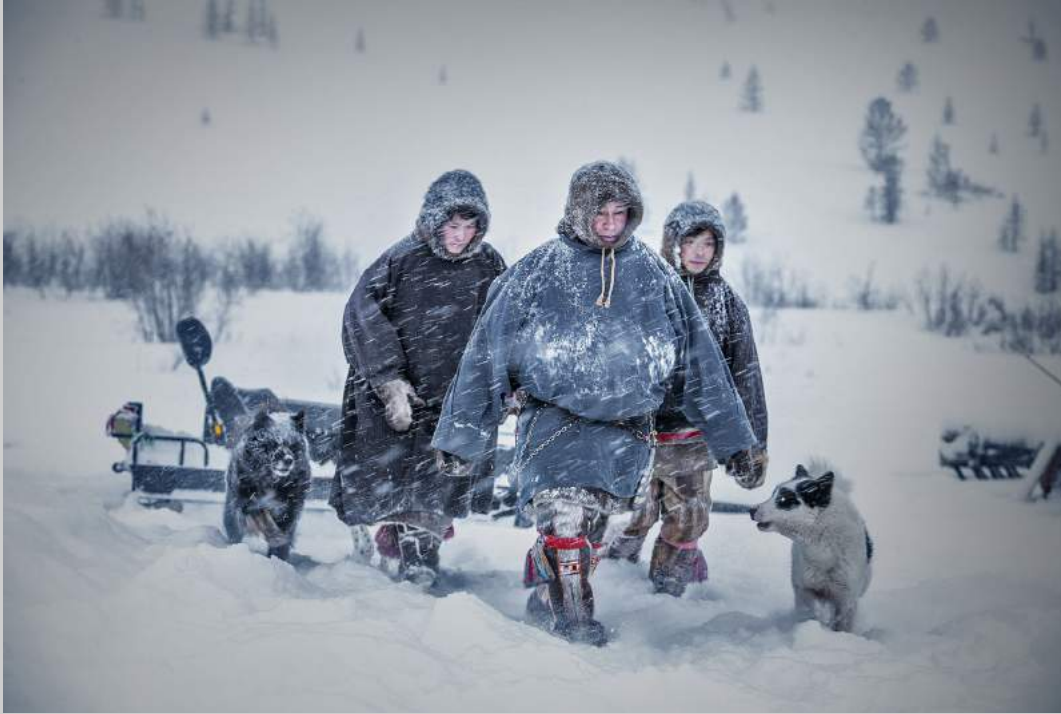
“THE NENETS45” © XINXIN CHEN, GMPSA/B 2019 S4C International Exhibition of Photography Photojournalism General