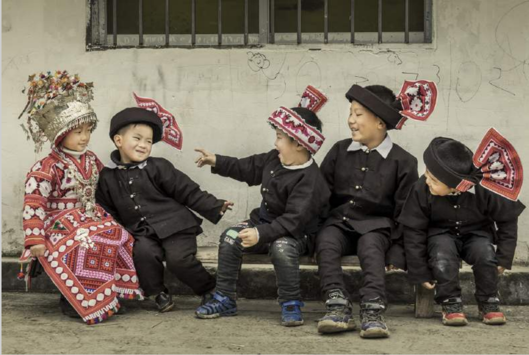
“CHILDREN'S FUN” S4C International Exhibition of Photography Photojournalism Human Interest S4C Gold