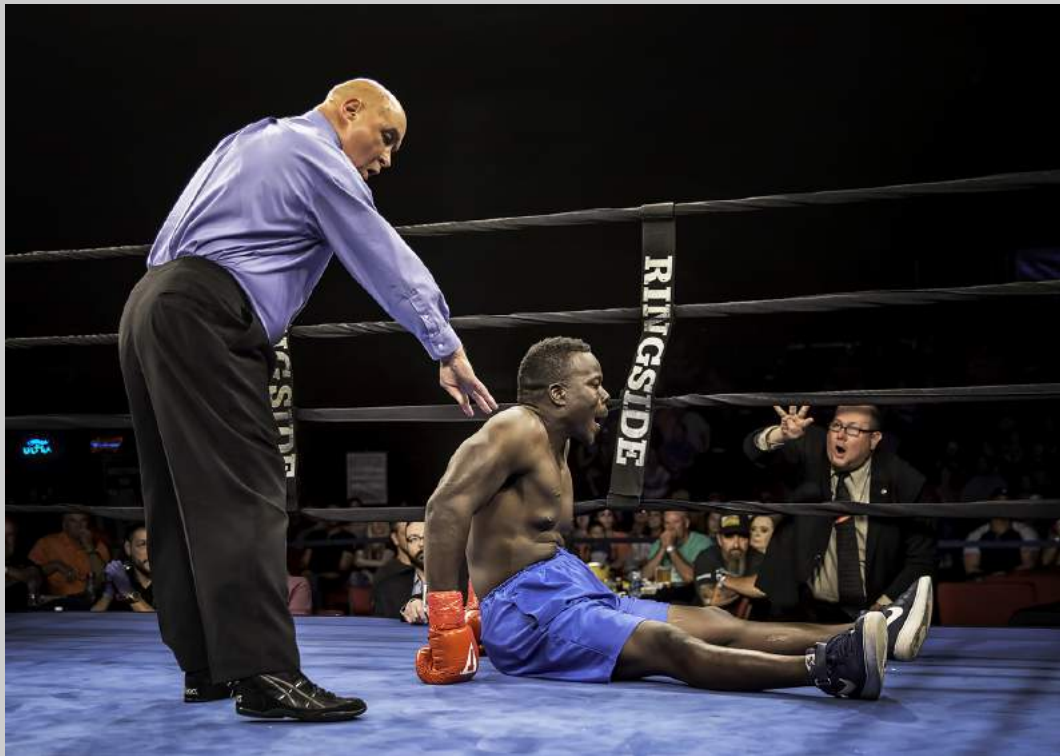
“WHERE AM I” © RANDY CARR, APSA, MPSA2 2019 S4C International Exhibition of Photography Photojournalism General HM