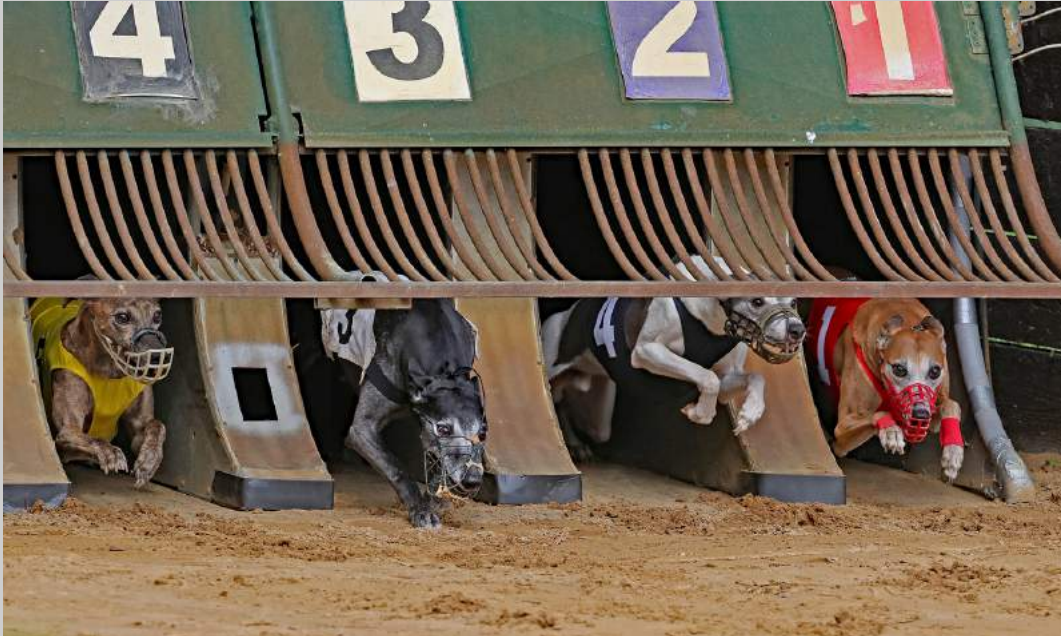
“HERE WE GO” © WOLFGANG KAEDING, GMPSA 2019 S4C International Exhibition of Photography Photojournalism General HM