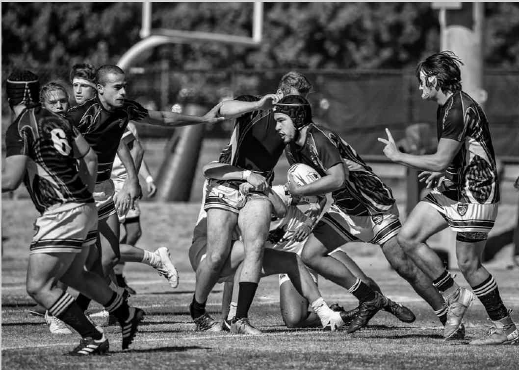
“RUGBY RUSH”2 2019 S4C International Exhibition of Photography Photojournalism General