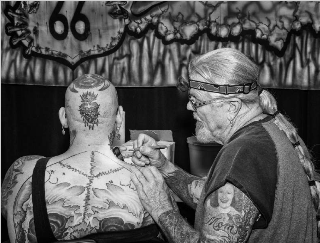
“ARTIST AND CANVAS” © SHARON PRISLIPSKY, APSA, PPSA 2019 S4C International Exhibition of Photography Photojournalism General