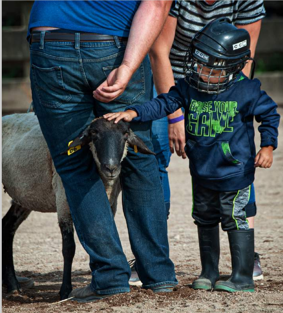
“MAKING FRIENDS WITH HIS RIDE 6041” 2019 S4C International Exhibition of Photography Photojournalism Human Interest HM