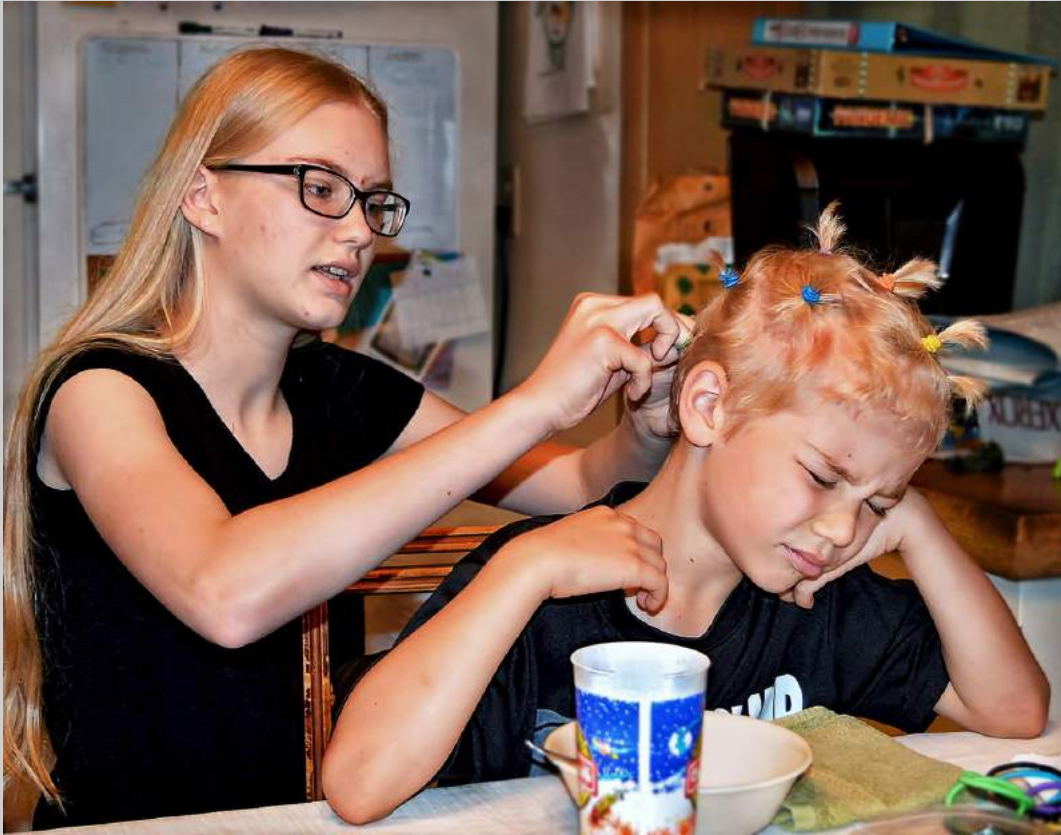
“FIXING A BAD-HAIR DAY-A” S4C International Exhibition of Photography Photojournalism Human Interest