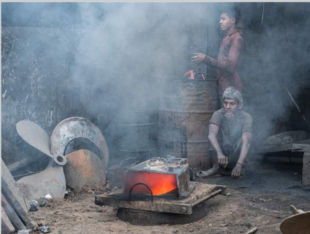
“PROPELLER REPAIR 01” © BARBARA SCHMIDT, EPSA 2019 S4C International Exhibition of Photography Photojournalism General