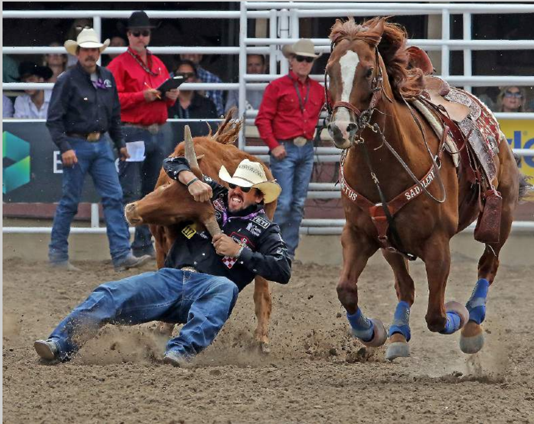
“MASTERFUL STEER WRANGLING 0288” S4C International Exhibition of Photography Photojournalism General PSA Best of Show Gold