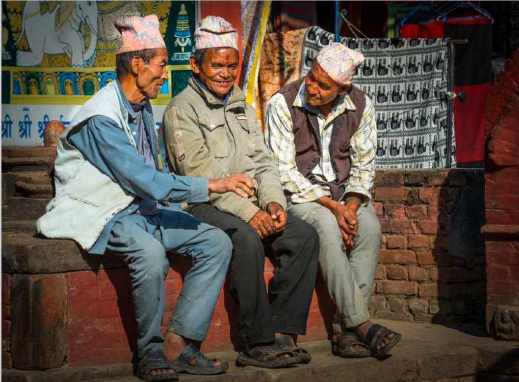
“CHATTING ABOUT GOOD OLD DAYS” © FRANCIS KING, GMPA 2019 S4C International Exhibition of Photography Photojournalism Human Interest