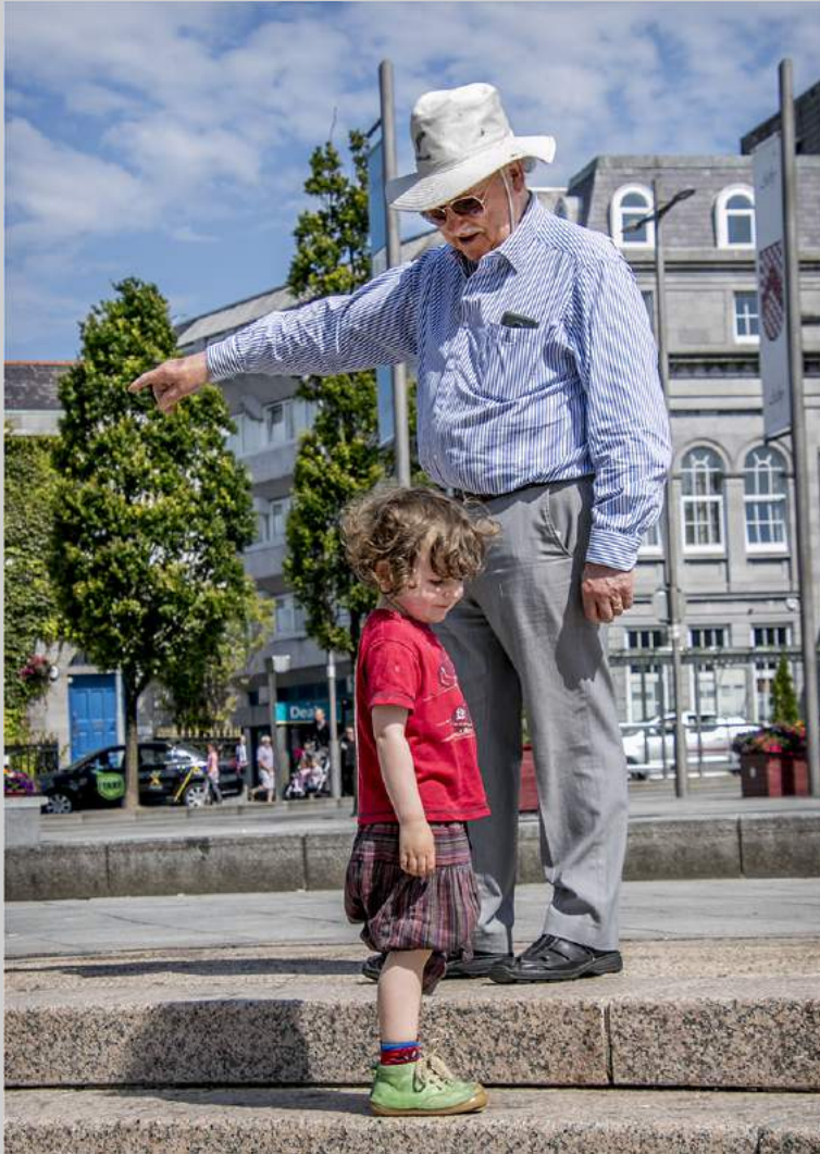
“LETS GO THIS WAY” © ELLA SCHREIBER 2019 S4C International Exhibition of Photography Photojournalism General