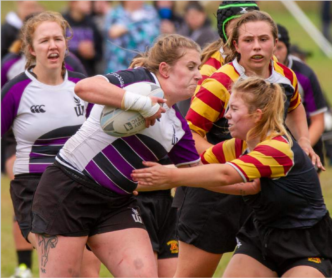
“WINONA WINS ALL-STATE” 2019 S4C International Exhibition of Photography Photojournalism General