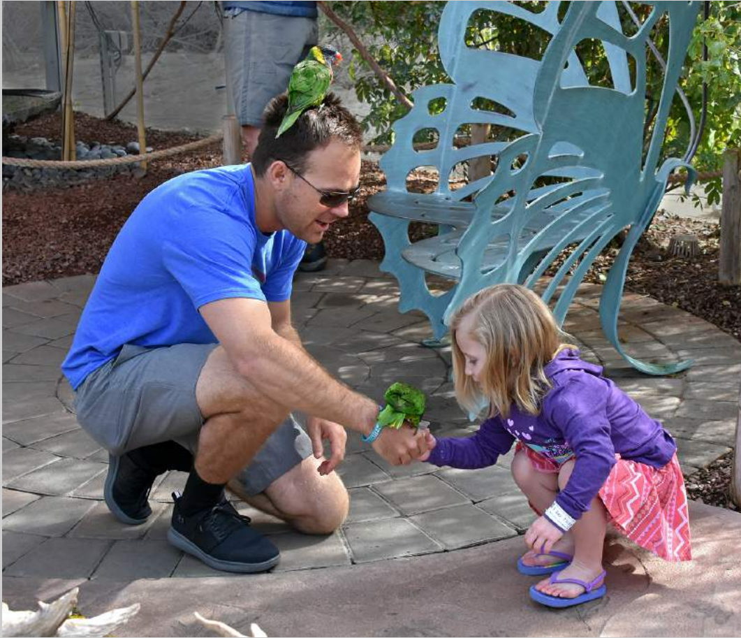
“DAD AND DAUGHTER FEED LORIKEETS” S4C International Exhibition of Photography Photojournalism Human Interest