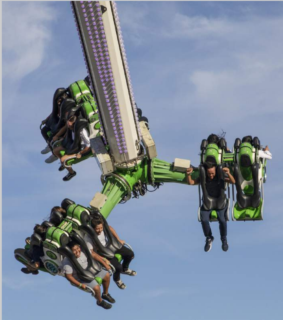
“INSANITY RIDE AIR” © SHIRL AIROV-BIELING, PPSA 2019 S4C International Exhibition of Photography Photojournalism General