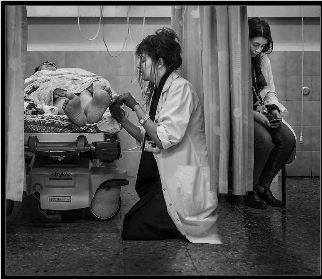
“NIGHT DUTY” S4C International Exhibition of Photography Photojournalism General HM