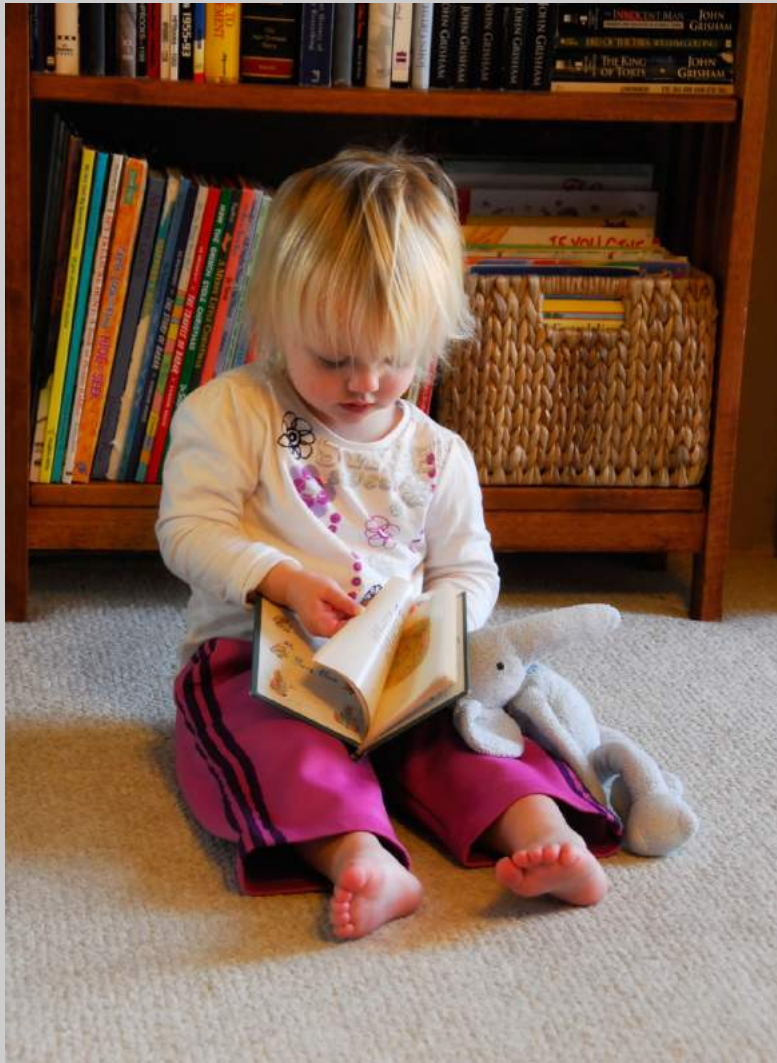
“LOOKING AT A BOOK” © JUDY BURR, APSA, EPSA 2019 S4C International Exhibition of Photography Photojournalism Human Interest