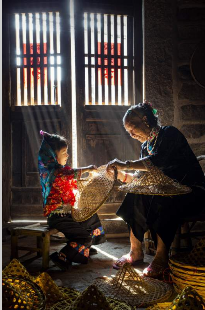
“GRANDPARENT AND GRANDCHILD” © CHAOYANG CAI 2019 S4C International Exhibition of Photography Photojournalism Human Interest