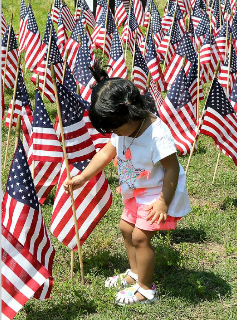
“PROUD TO BE A YOUNG AMERICAN” © KIEU-HANH VU 2019 S4C International Exhibition of Photography Photojournalism Human Interest