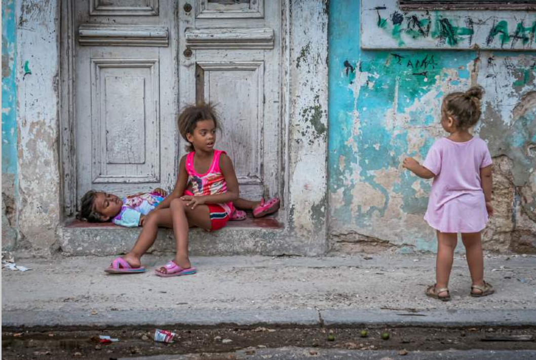
“STREET KIDS CUBA” © VICKI MORITZ, GMPA 2019 S4C International Exhibition of Photography Photojournalism Human Interest