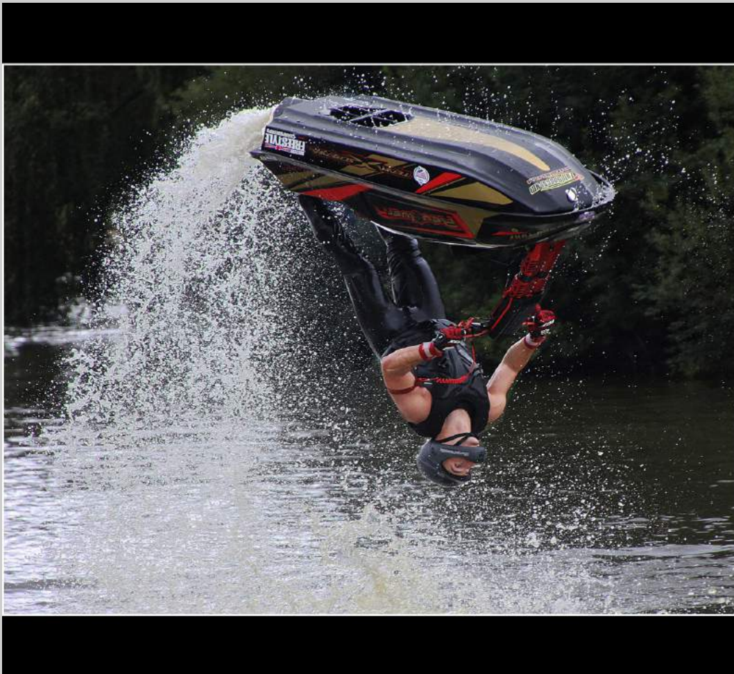
“JETSKI STUNT RIDER” S4C International Exhibition of Photography Photojournalism General S4C Gold