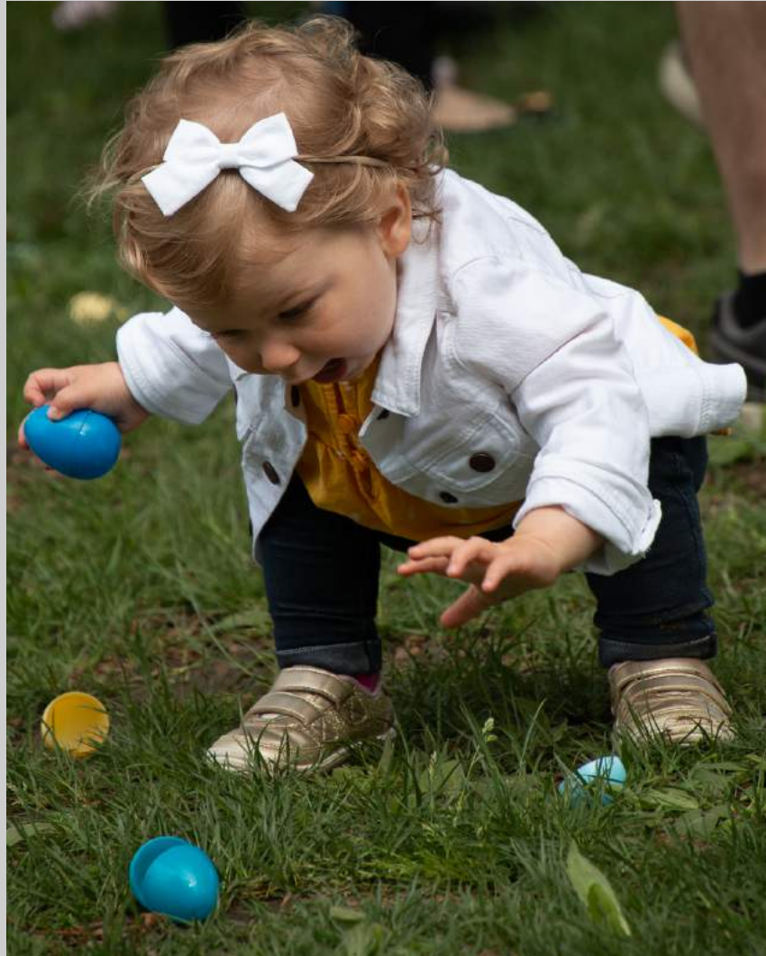
“EASTER GIRL” © VALENTINA SOKOLSKAYA, PPSA 2019 S4C International Exhibition of Photography Photojournalism Human Interest HM