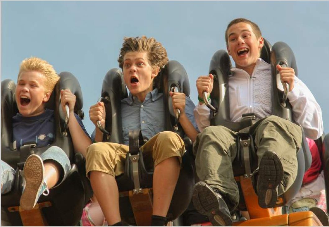
“GOOD GRIEF” © WILL CORNELL 2019 S4C International Exhibition of Photography Photojournalism General