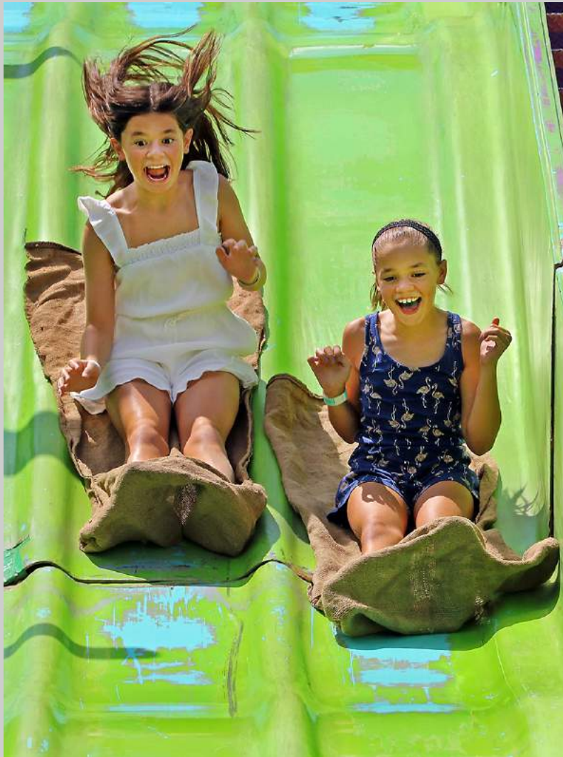
“EXHILARATING SLIDE RIDE 0738” S4C International Exhibition of Photography Photojournalism Human Interest S4C Bronze