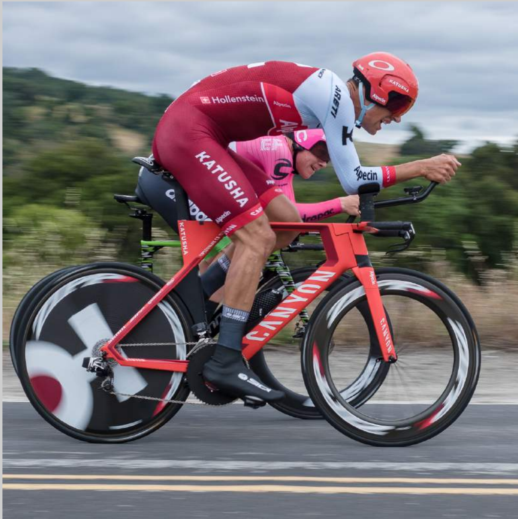
“NECK AND NECK TOC 2018” S4C International Exhibition of Photography Photojournalism General HM