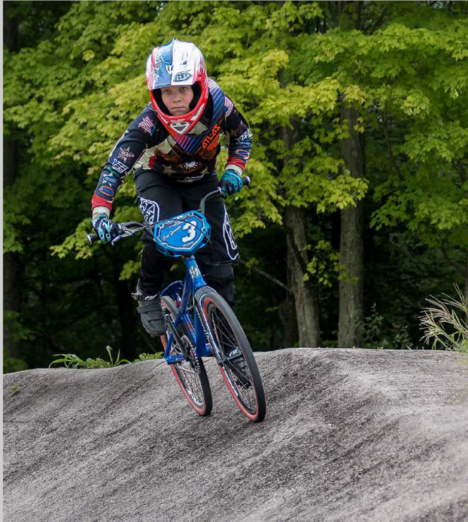
“DETERMINED RIDER” S4C International Exhibition of Photography Photojournalism General