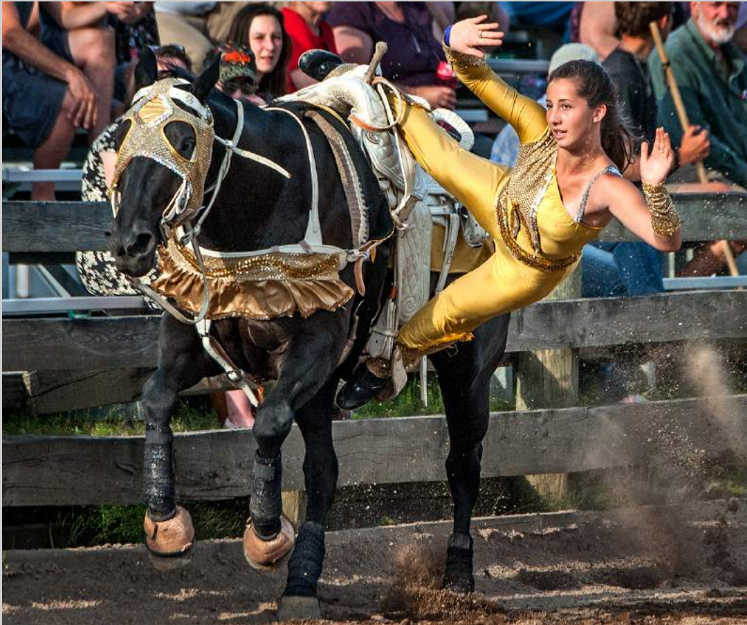
“GOLD SUIT TRICK RIDER 2602” 2019 S4C International Exhibition of Photography Photojournalism General