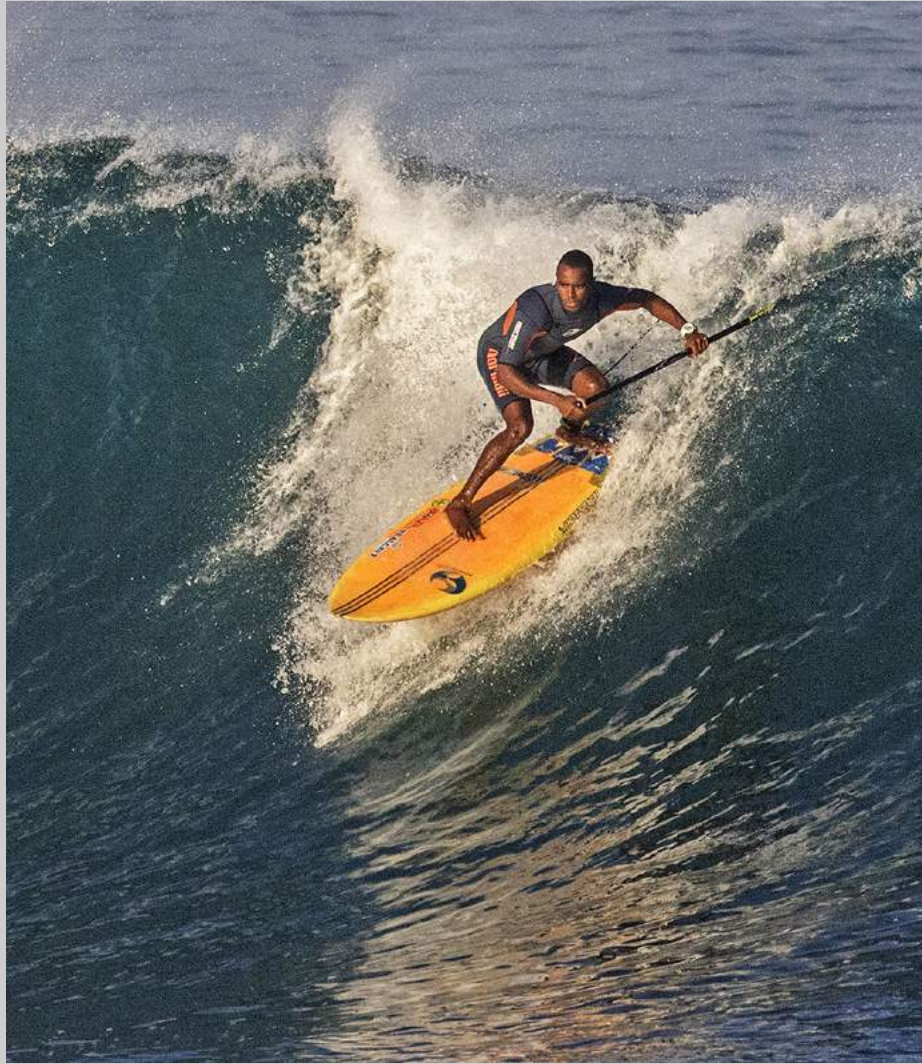
“PADDLING A BIG WAVE” 2019 S4C International Exhibition of Photography Photojournalism General