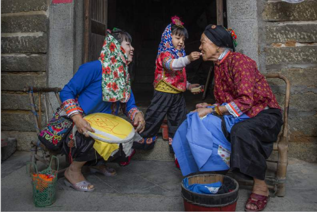
“WARMTH” © CHAOYANG CAI 2019 S4C International Exhibition of Photography Photojournalism Human Interest