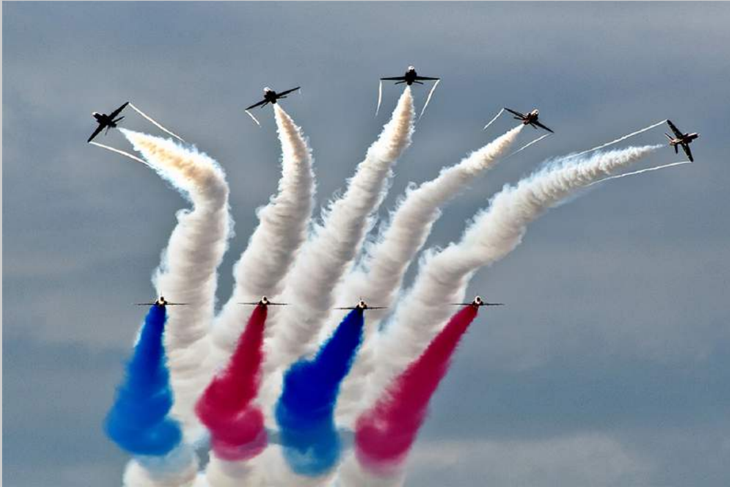
“RED ARROWS BREAK” S4C International Exhibition of Photography Photojournalism General