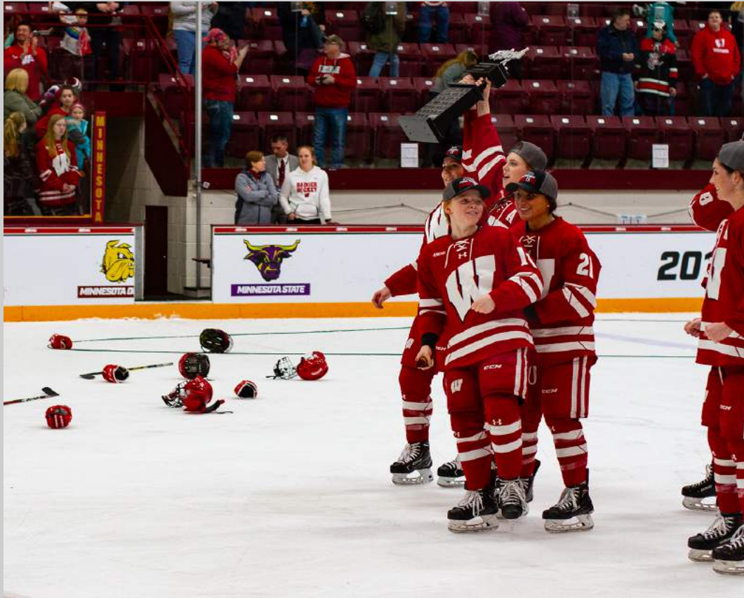
“BADGERS WIN WCHA” © KAREN LEONARD, PPSA 2019 S4C International Exhibition of Photography Photojournalism Human Interest