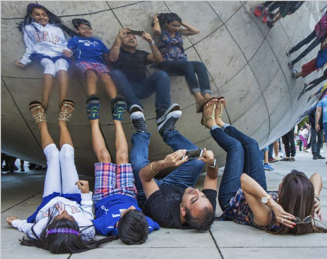
“REFLECTION PHOTO AT THE BEAN” 2019 S4C International Exhibition of Photography Photojournalism Human Interest S4C Silver