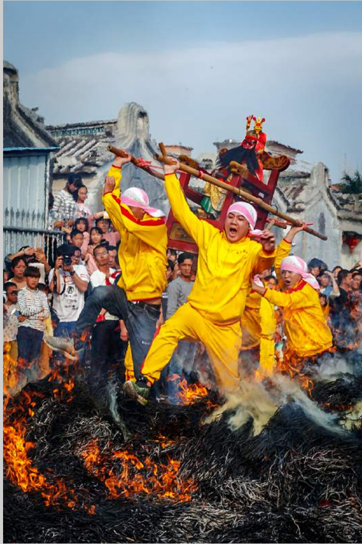
“THE GOD IS ON FIRE” © WOLFGANG LIN, MPSA 2019 S4C International Exhibition of Photography Photojournalism General