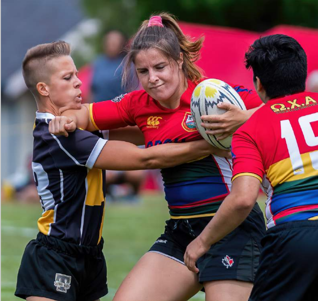
“STIFF ARM” © KURT DEVOE 2019 S4C International Exhibition of Photography Photojournalism General HM