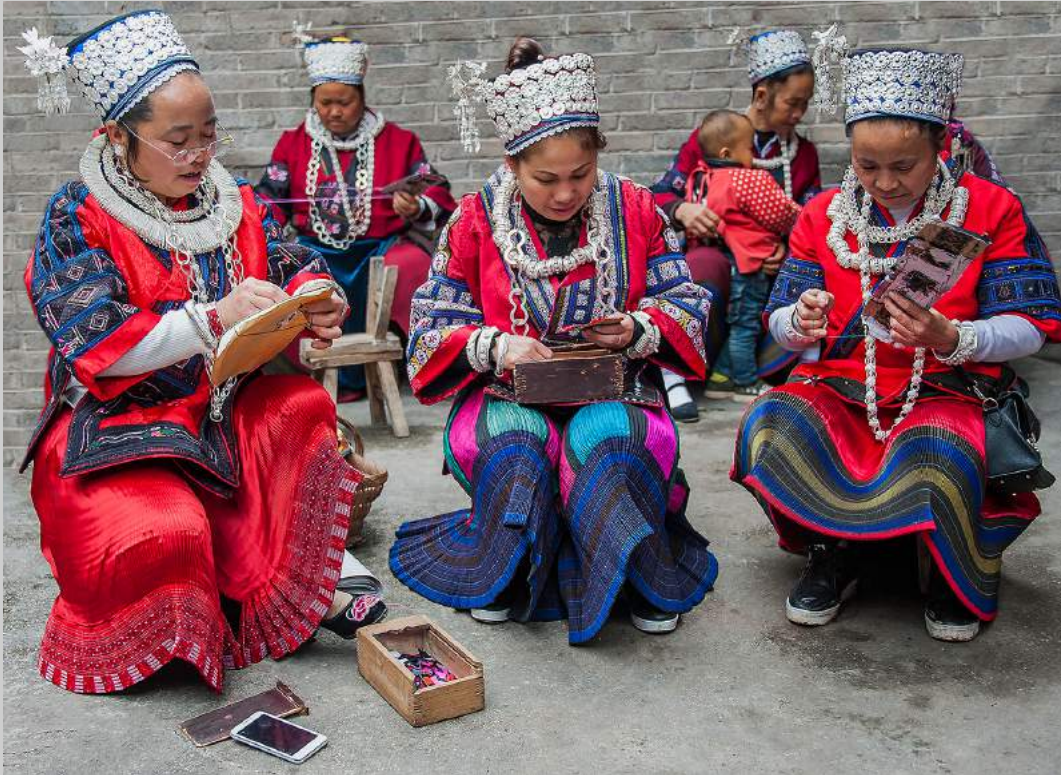
“HANDICRAFT” © ALOIS BERNKOPF DR, EFIAP/S, GPU CR4 2019 S4C International Exhibition of Photography Photojournalism Human Interest