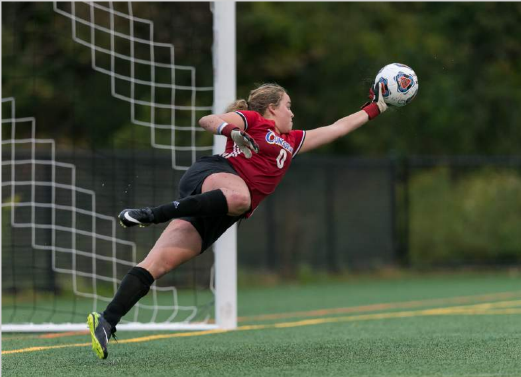
“CONCORDIA_2018(3110)” S4C International Exhibition of Photography Photojournalism General