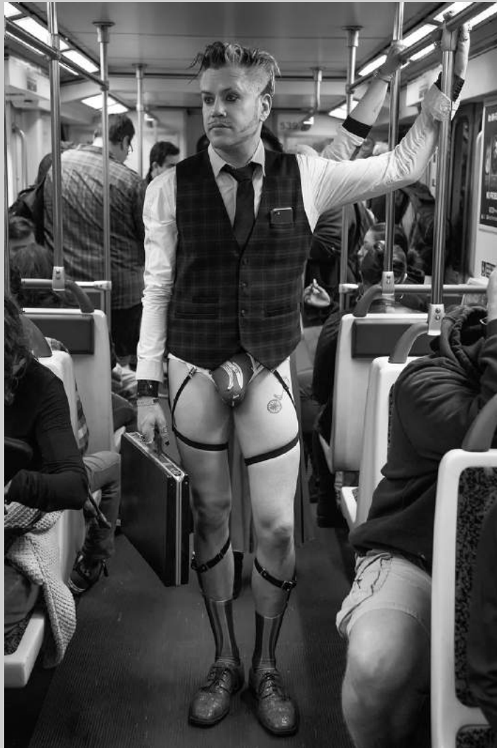
“DRESSED FOR SUCCESS” © LARRY WHITE 2019 S4C International Exhibition of Photography Photojournalism General