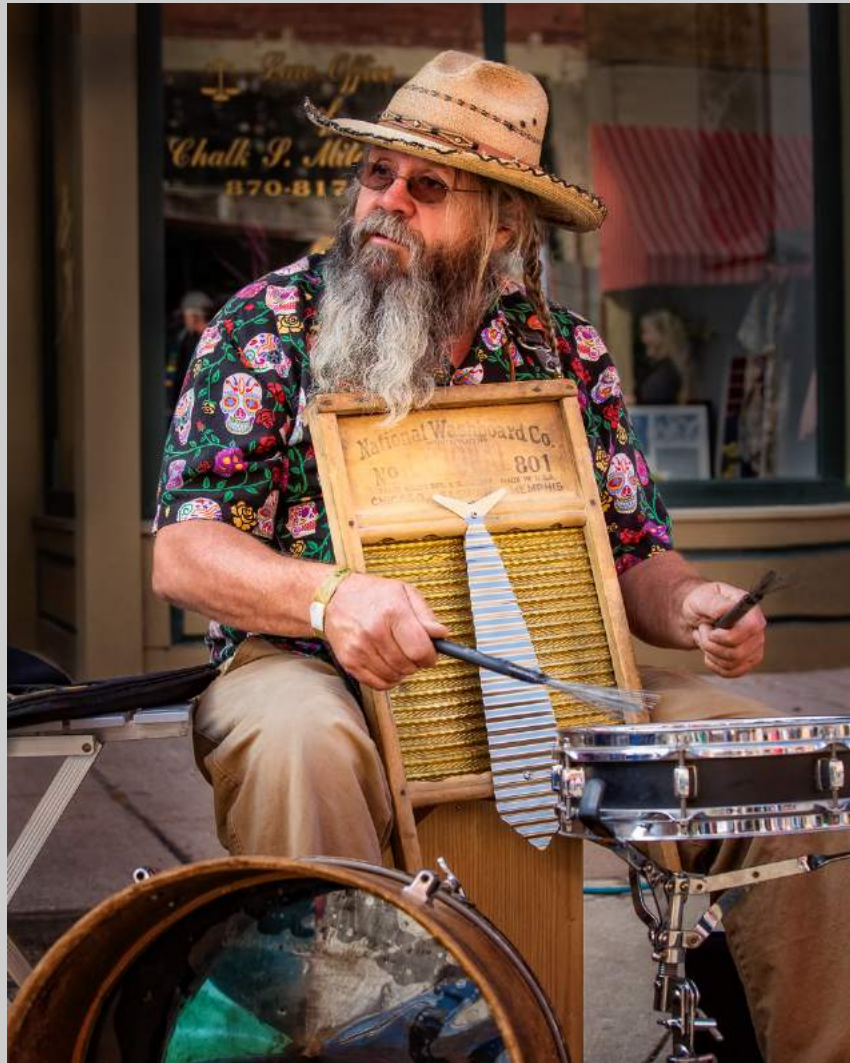
“ONE MAN BAND” 2019 S4C International Exhibition of Photography Photojournalism General