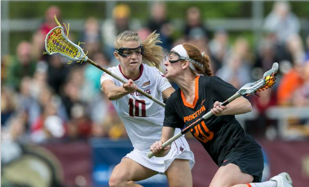
“BC_2018(7027)” S4C International Exhibition of Photography Photojournalism General HM