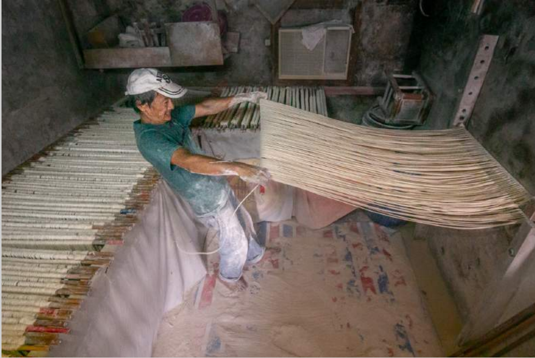
“NOODLE MAN 3” © CHIN LEONG TEO, EPSA 2019 S4C International Exhibition of Photography Photojournalism General