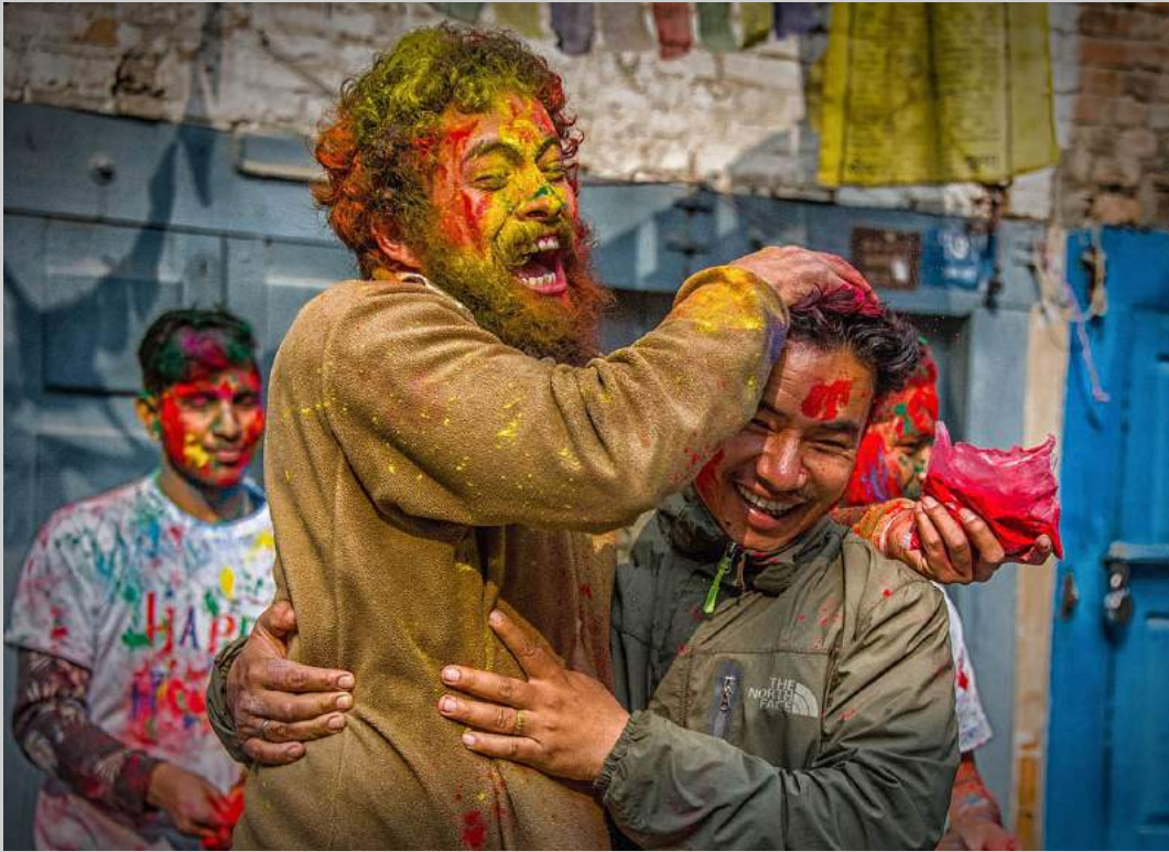
“COLOURFUL LAUGHTER” © KA-PAK KONG, PPSA 2019 S4C International Exhibition of Photography Photojournalism Human Interest