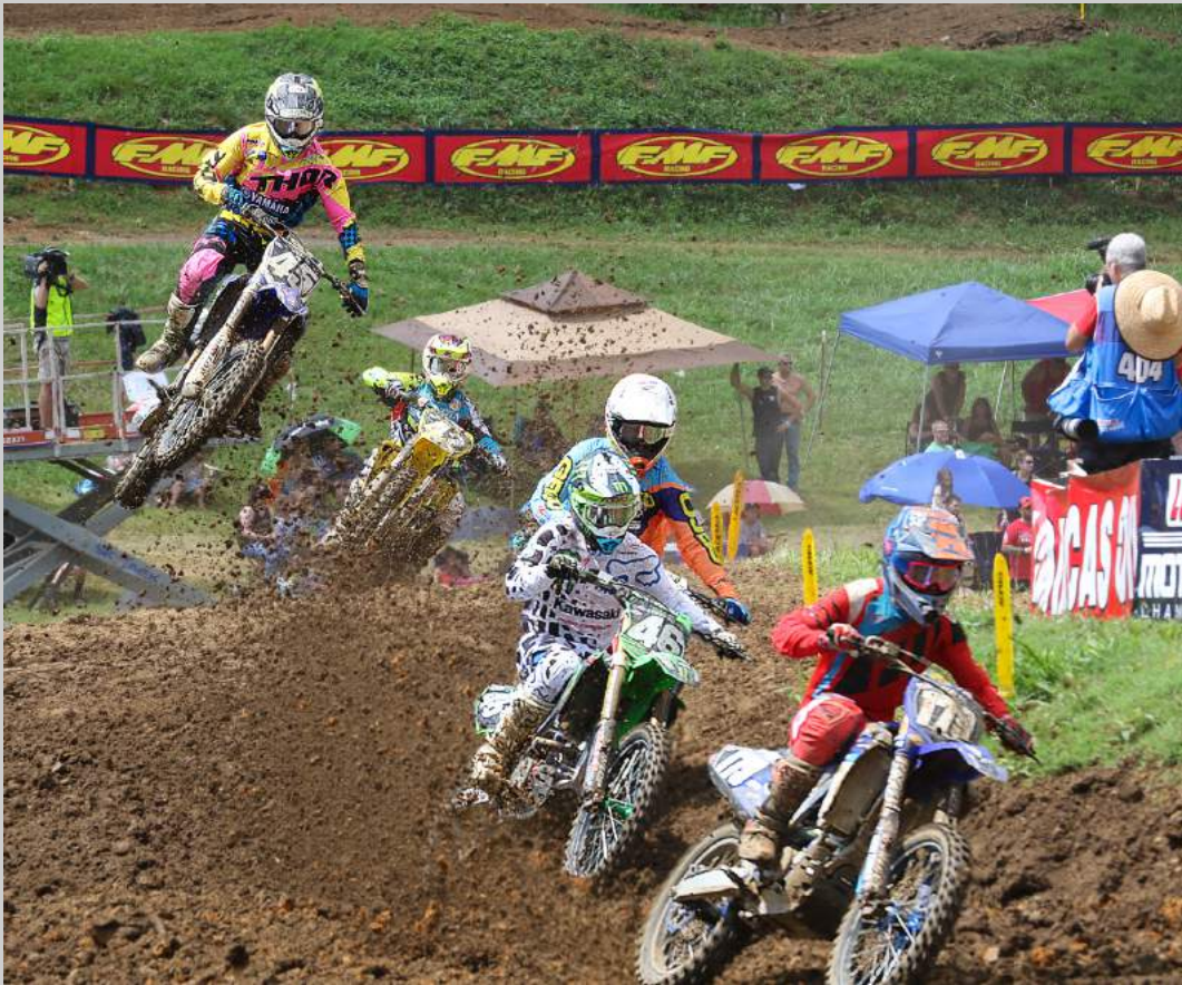
“FIVE IN A ROW” 2019 S4C International Exhibition of Photography Photojournalism General