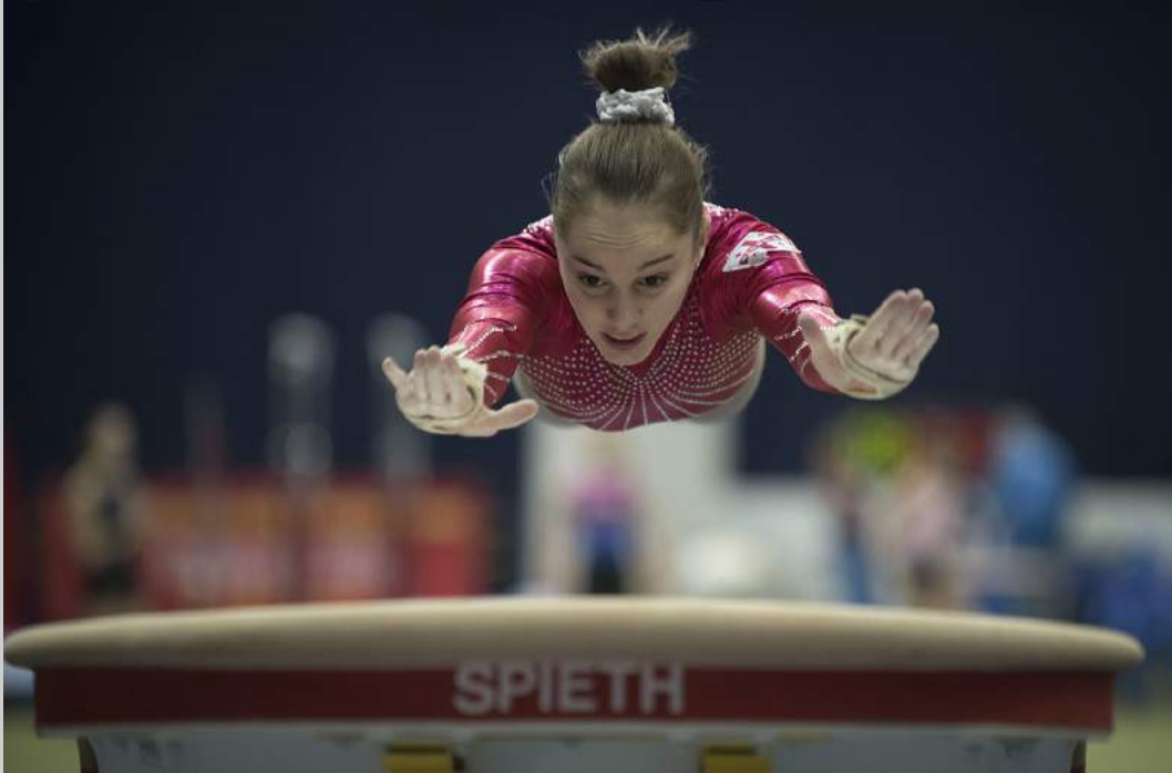
“FLIGHT” © SERGEY ARESHEV 2019 S4C International Exhibition of Photography Photojournalism General S4C Silver