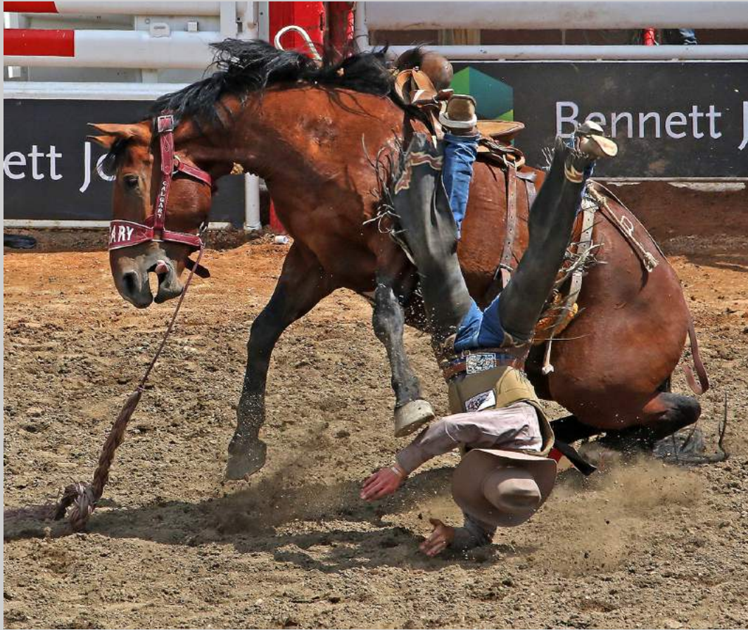
“COWBOY HEADER 8728” S4C International Exhibition of Photography Photojournalism General