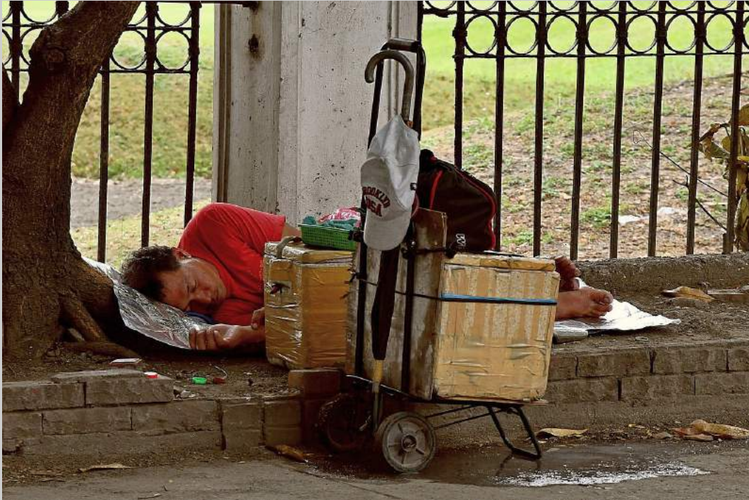
“UNFORTUNATE CIRCUMSTANCES” © THOMAS VAN LANGENHOVEN 2019 S4C International Exhibition of Photography Photojournalism Human Interest S4C Bronze