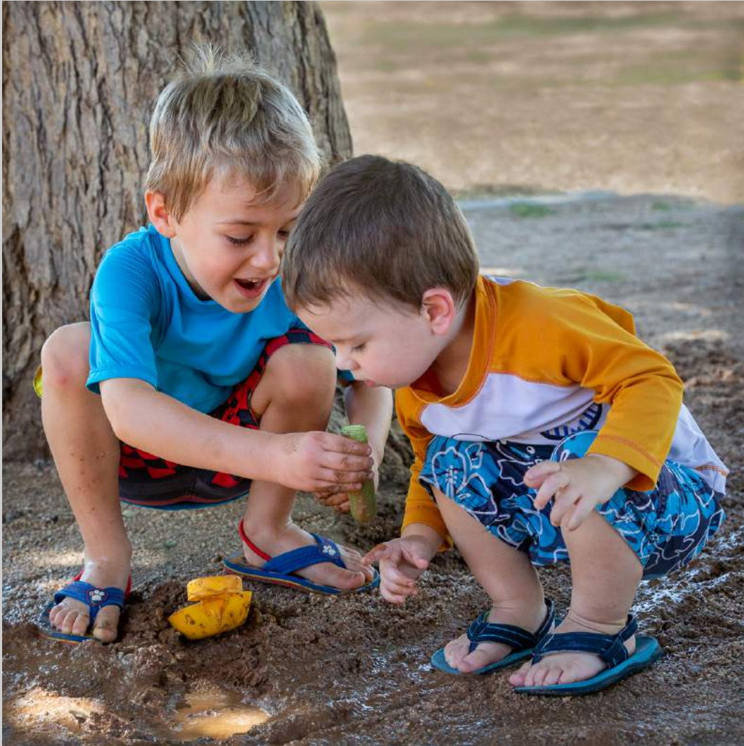
“LOOK AT THAT” © DIANE ANDERSON 2019 S4C International Exhibition of Photography Photojournalism Human Interest HM