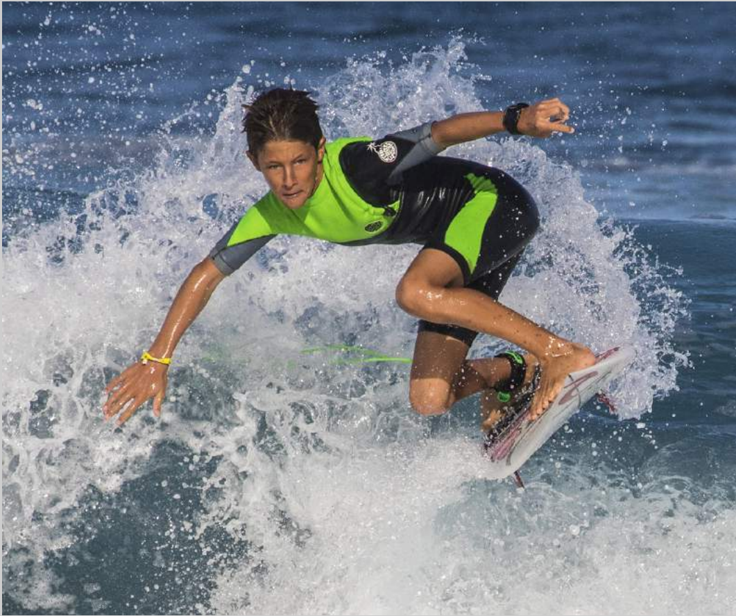
“WAVE RIDER IN GREEN” © GERALD H EMMERICH JR, HONFPSA, GMPSA/B 2019 S4C International Exhibition of Photography Photojournalism General