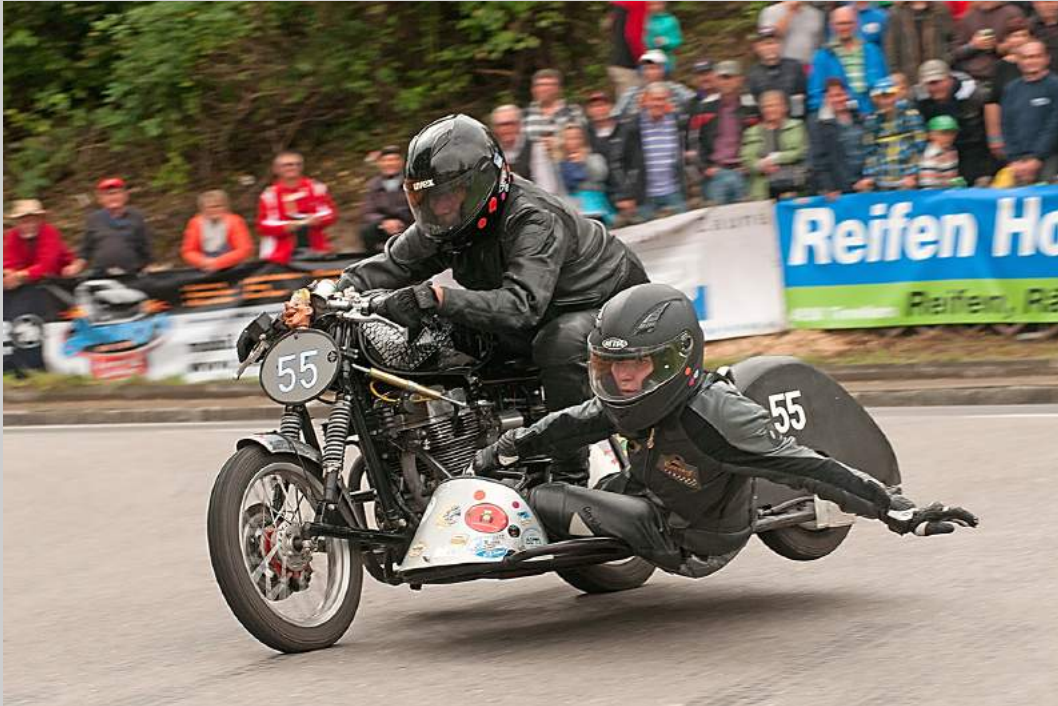
“SIDECAR 55” S4C International Exhibition of Photography Photojournalism General