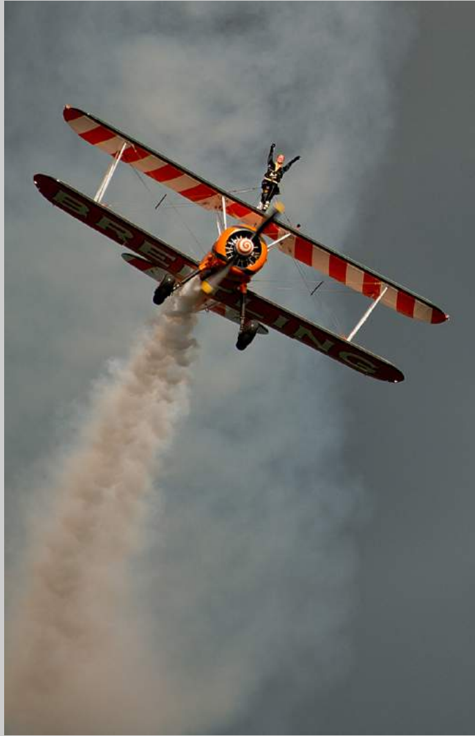
“WING WALKER IN AERIAL DISPLAY” S4C International Exhibition of Photography Photojournalism General