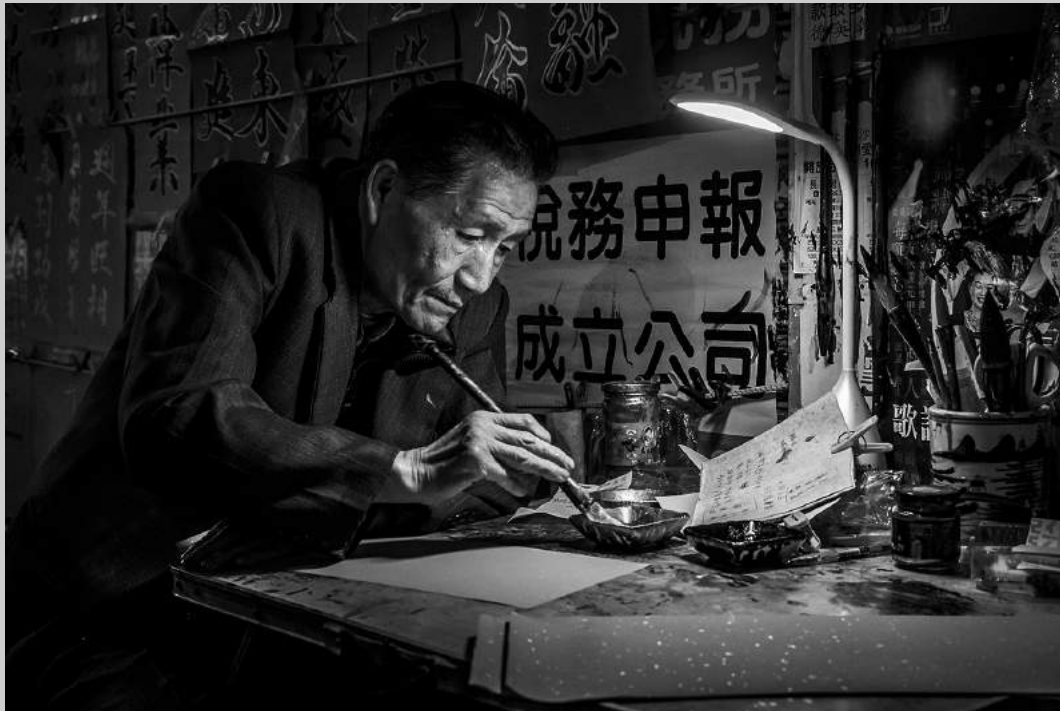
“WRITER 2” © WOLFGANG LIN, MPASA 2019 S4C International Exhibition of Photography Photojournalism Human Interest Judge’s Choice