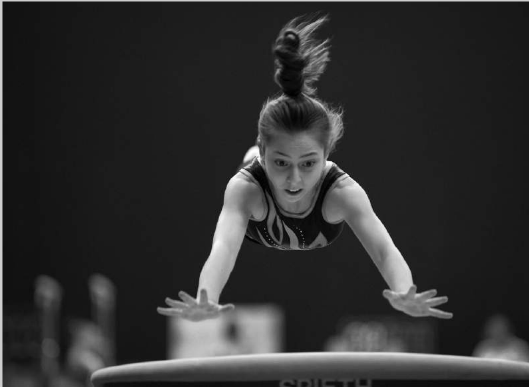
“FLYING OVER” S4C International Exhibition of Photography Photojournalism General