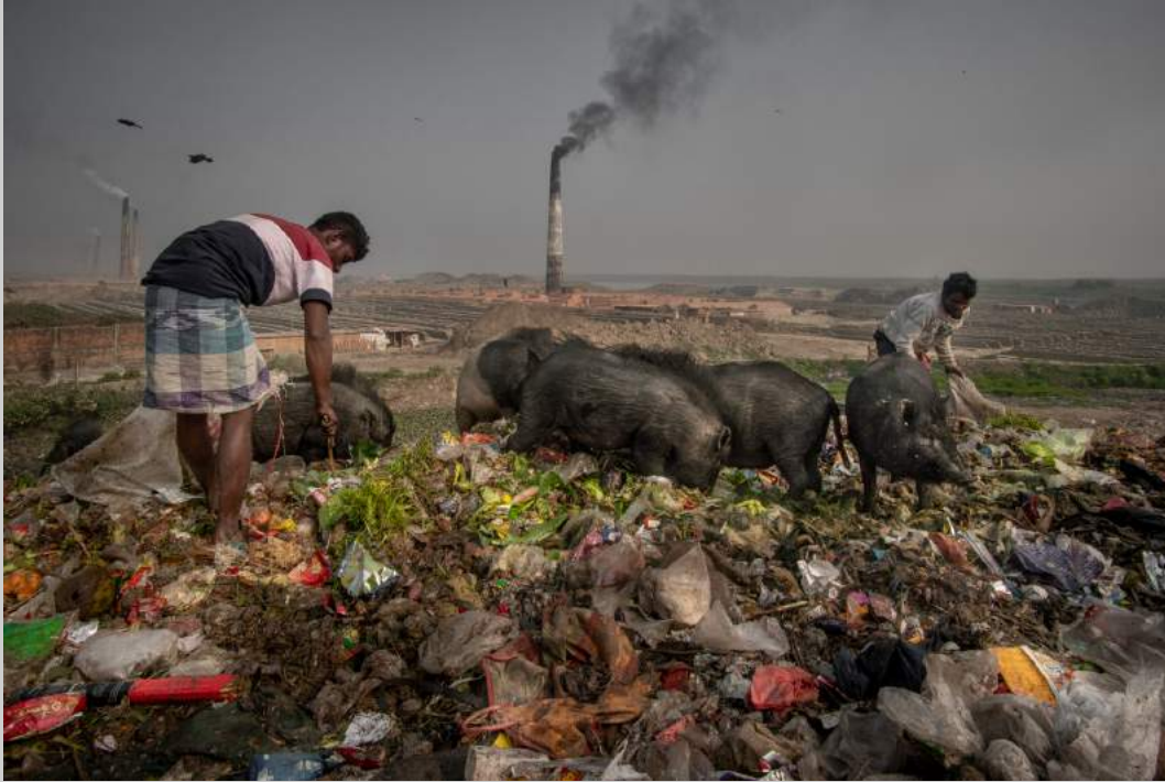
“RUBBISH SCAVENGERS 6” EPSA 2019 S4C International Exhibition of Photography Photojournalism Human Interest