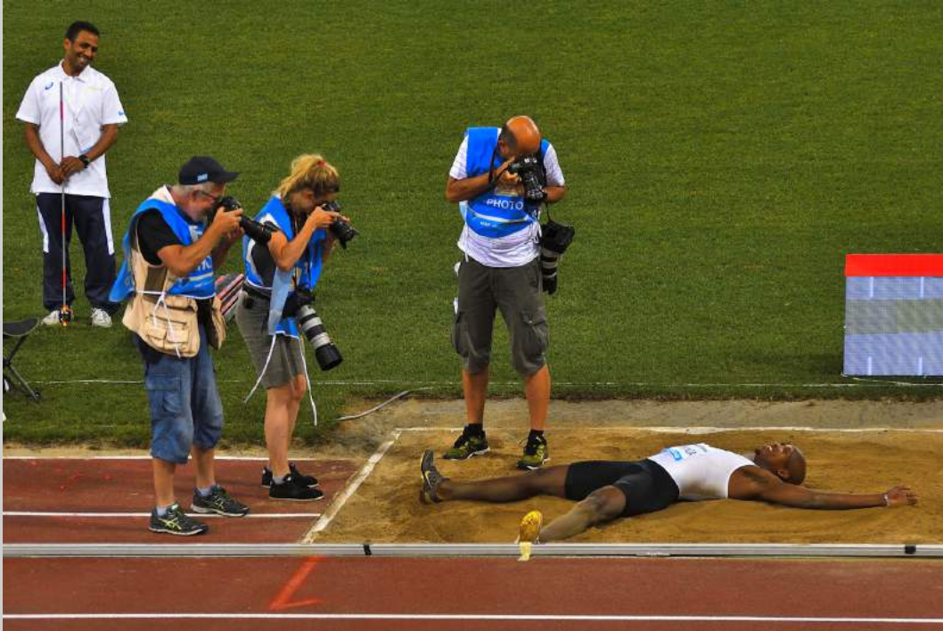
“THE WINNER” © WALTER GABERTHUEL, MPSA 2019 S4C International Exhibition of Photography Photojournalism General