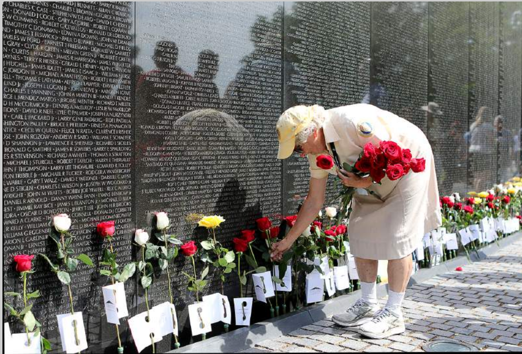
“RED ROSES FOR THE FALLEN SOLDIERS” © KIEU-HANH VU 2019 S4C International Exhibition of Photography Photojournalism General