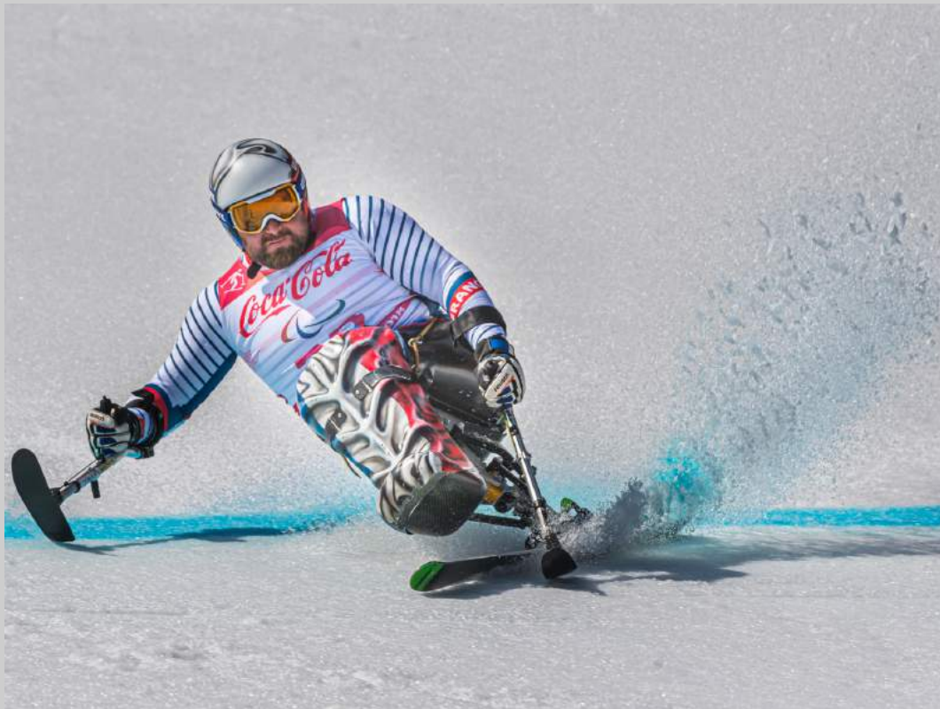
“PARALYMPIC SKIER 101” © FRANCIS KING, GMP 2019 S4C International Exhibition of Photography Photojournalism General