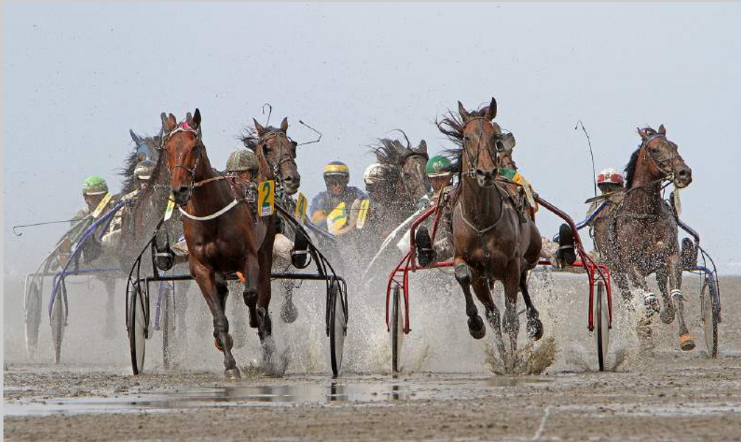
“HORSE FIGHTING IN MUD” © WOLFGANG KAEDING, GMP 2019 S4C International Exhibition of Photography Photojournalism General