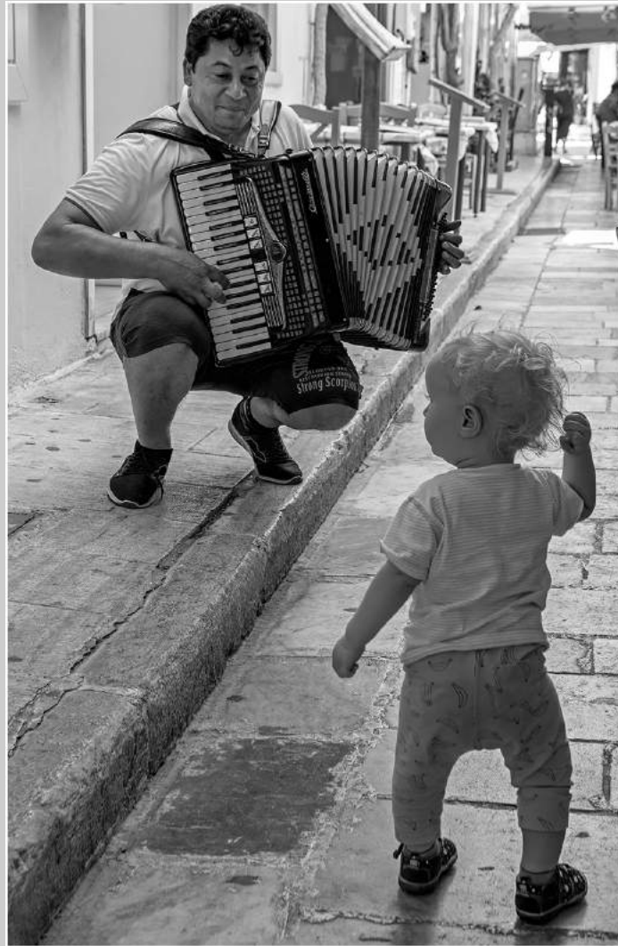
“PLAY IT AGAIN” © WARD CONAWAY, EPSA 2019 S4C International Exhibition of Photography Photojournalism Human Interest