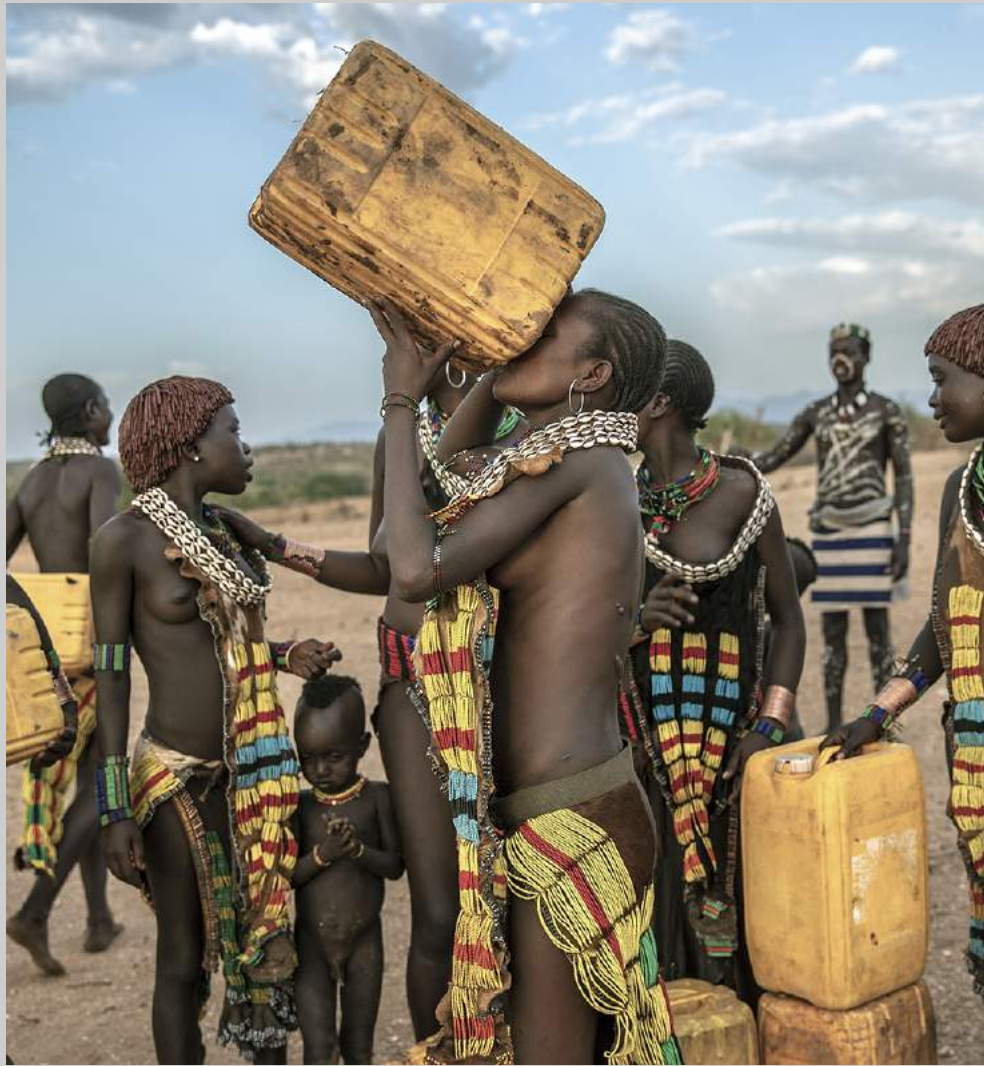
“SHUI” © JINGRU LUO, EPSA 2019 S4C International Exhibition of Photography Photojournalism General