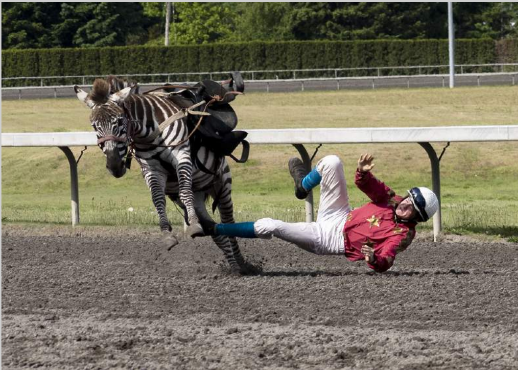
“SADDLE SLIP STAR DOWN” © STEVEN FISHER, FPSA, MPSA 2019 S4C International Exhibition of Photography Photojournalism General