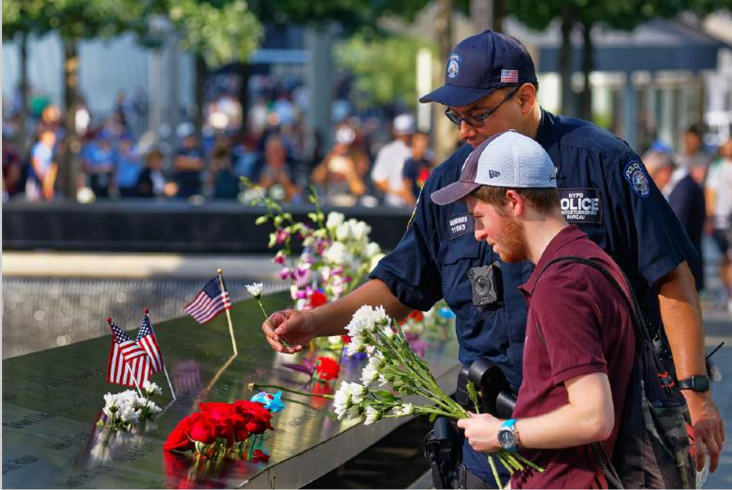
“9-11 MEMORIAL 105” © VOLKER MEINBERG, GMPA/B 2019 S4C International Exhibition of Photography Photojournalism Human Interest