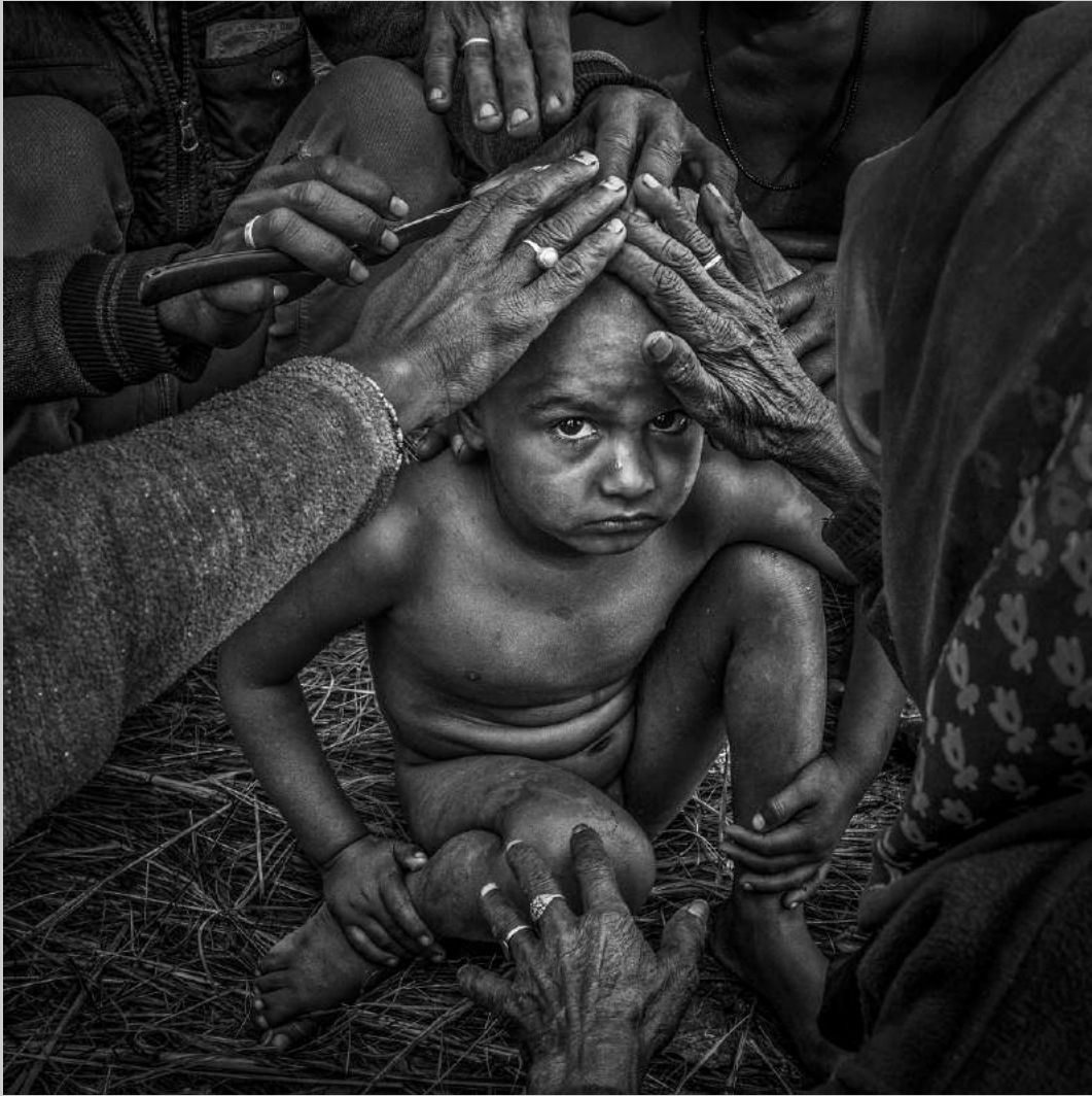
“WISHES” © BOB CHIU 2019 S4C International Exhibition of Photography Photojournalism General