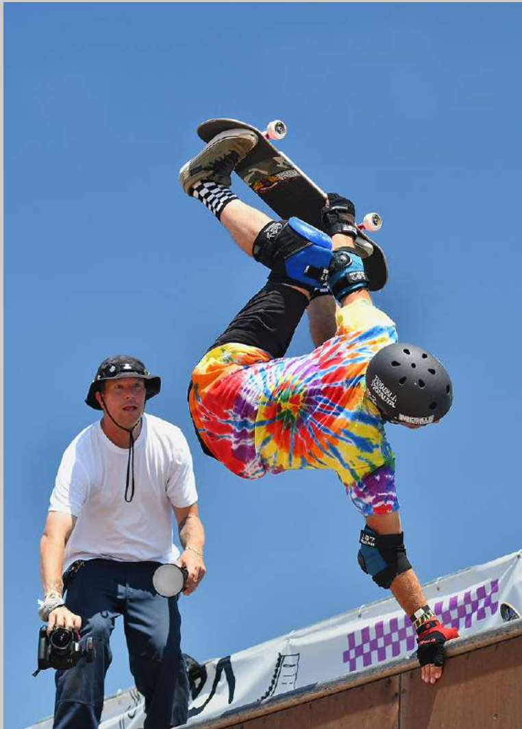
“GREAT SHOT” © GODFREY WONG, GMPA 2019 S4C International Exhibition of Photography Photojournalism General