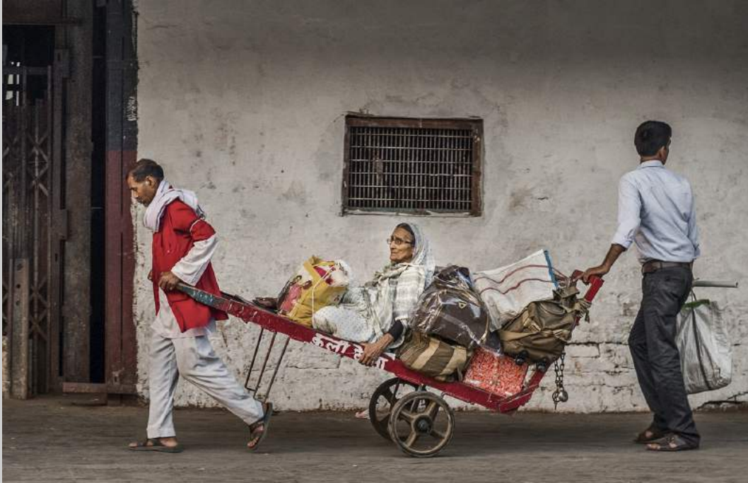
“TROLLEY” © XINXIN CHEN, GMPSA/B 2019 S4C International Exhibition of Photography Photojournalism Human Interest