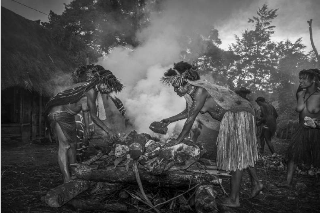
“TRIBE DINNER” © HUIQIAN YANG 2019 S4C International Exhibition of Photography Photojournalism General