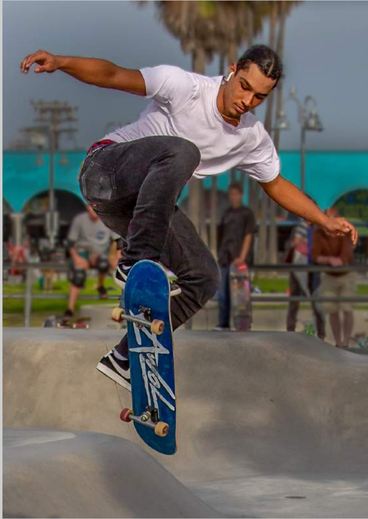
“VENICE SKATEBOARDING” S4C International Exhibition of Photography Photojournalism General HM