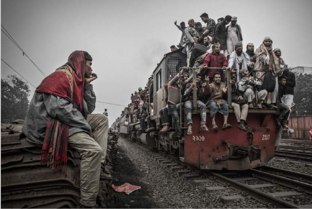
“CROWDED TRAIN2” S4C International Exhibition of Photography Photojournalism General