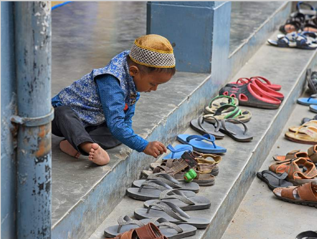
“MY TOY” © SUBHO SAHA, QPSA 2019 S4C International Exhibition of Photography Photojournalism Human Interest