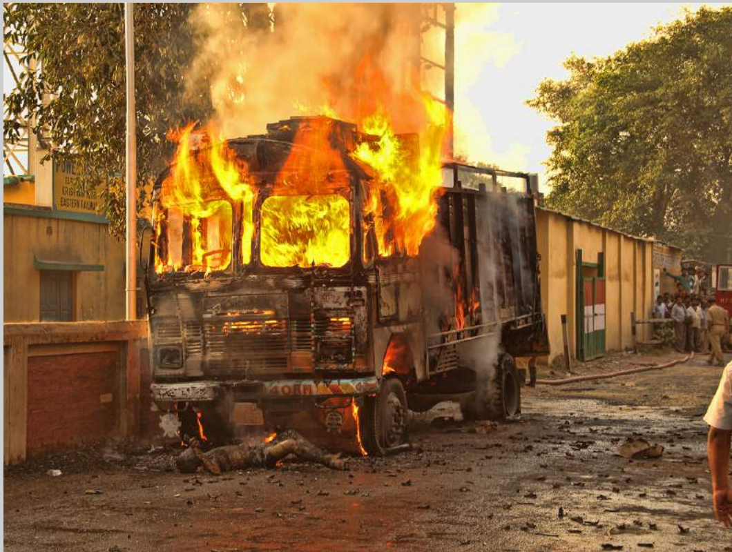
“BURNING TRUCK” © SUBHO SAHA, QPSA 2019 S4C International Exhibition of Photography Photojournalism General