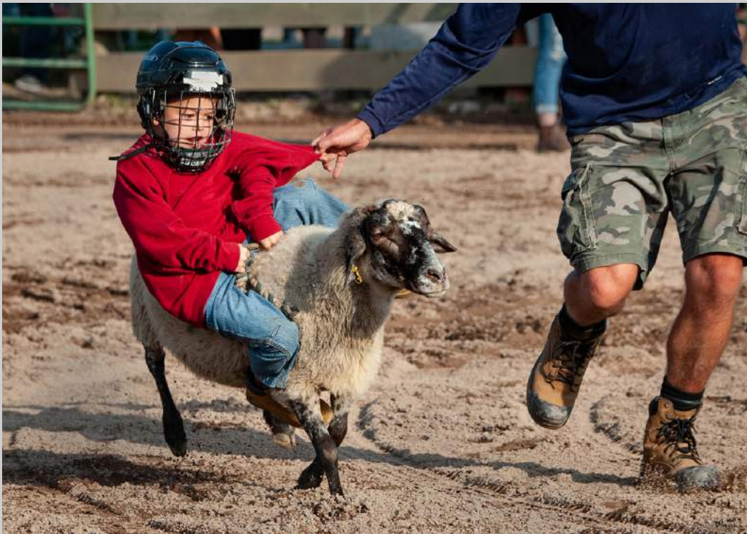
“HOLDING ON 5828” © VIKI GAUL, APSA, PPSA 2019 S4C International Exhibition of Photography Photojournalism General