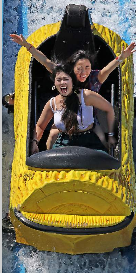
“MIXED EMOTIONS ON WATERFALL 0277” S4C International Exhibition of Photography Photojournalism Human Interest HM