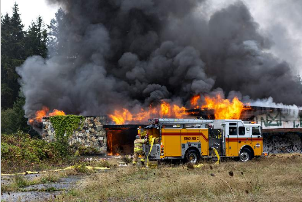
“COULD USE SOME HELP_ARSON” 2019 S4C International Exhibition of Photography Photojournalism General