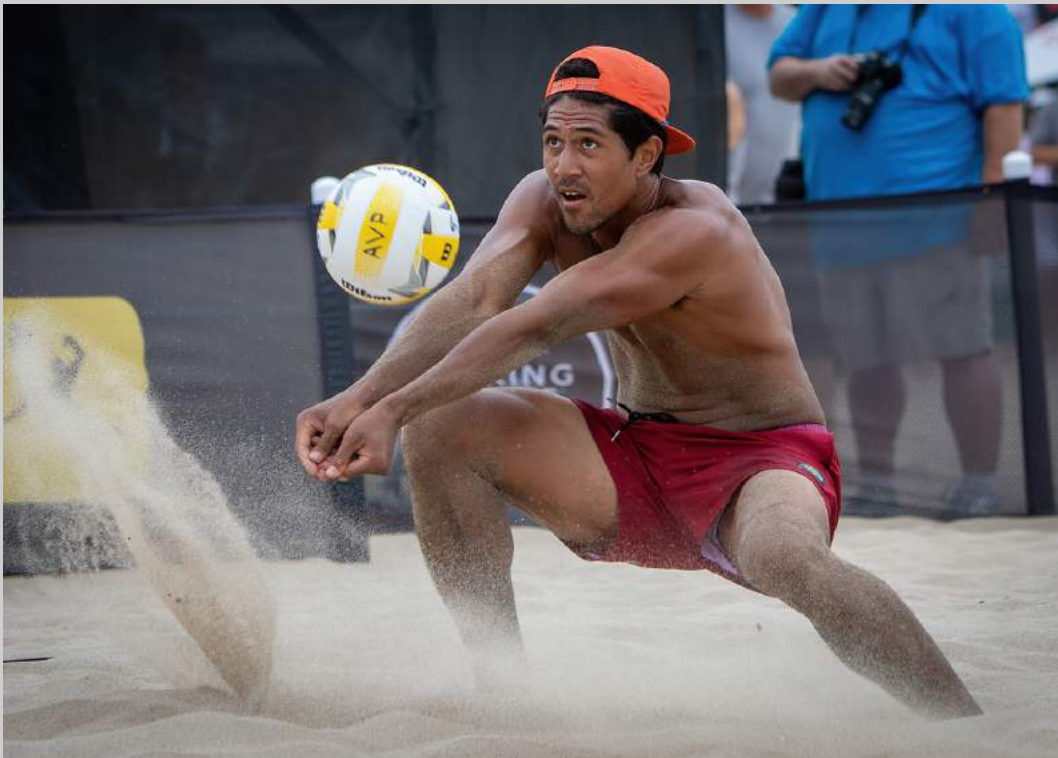
“DIGGER” S4C International Exhibition of Photography Photojournalism General Judge’s Choice