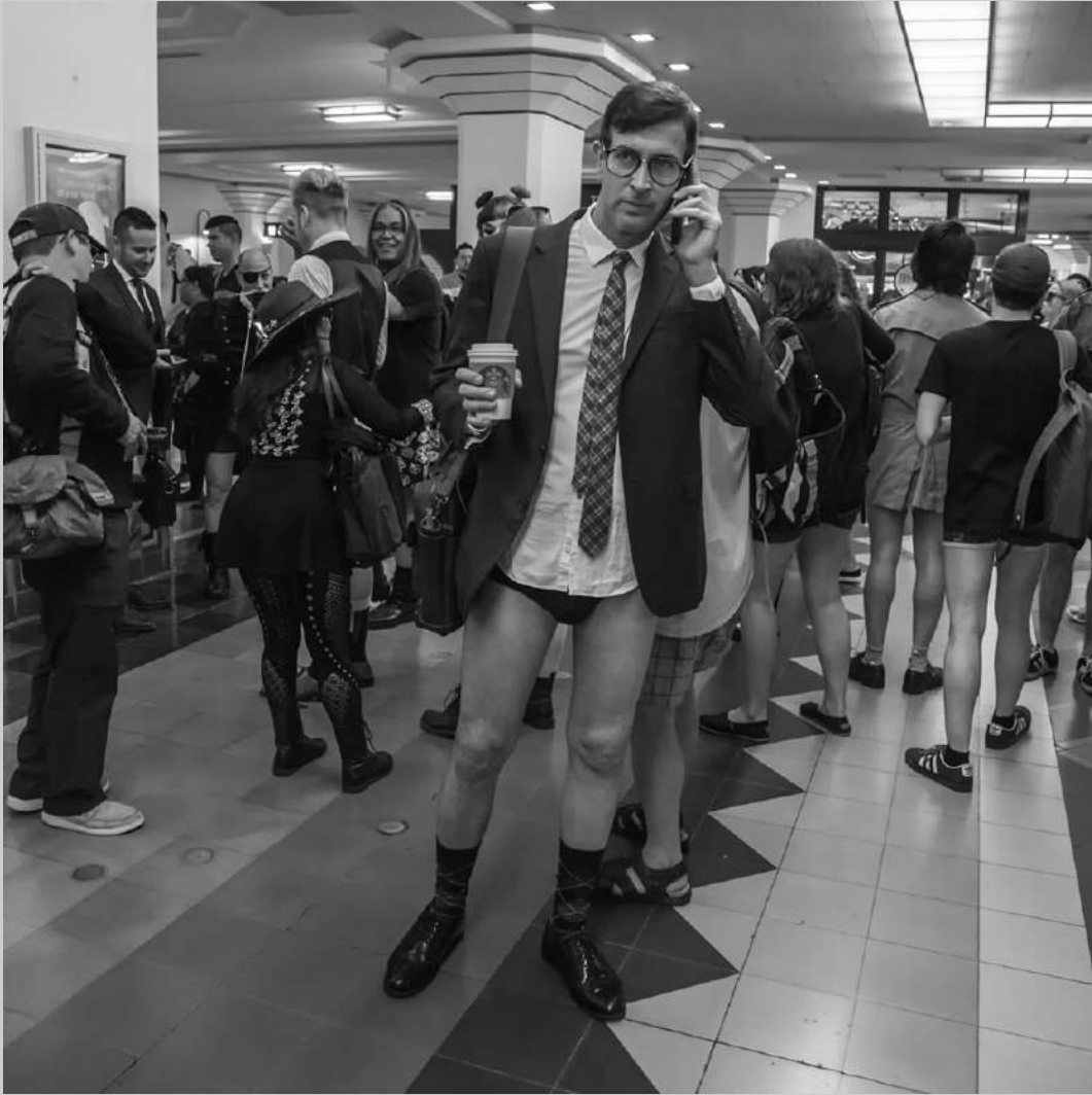
“FORGETFUL” © LARRY WHITE 2019 S4C International Exhibition of Photography Photojournalism General HM