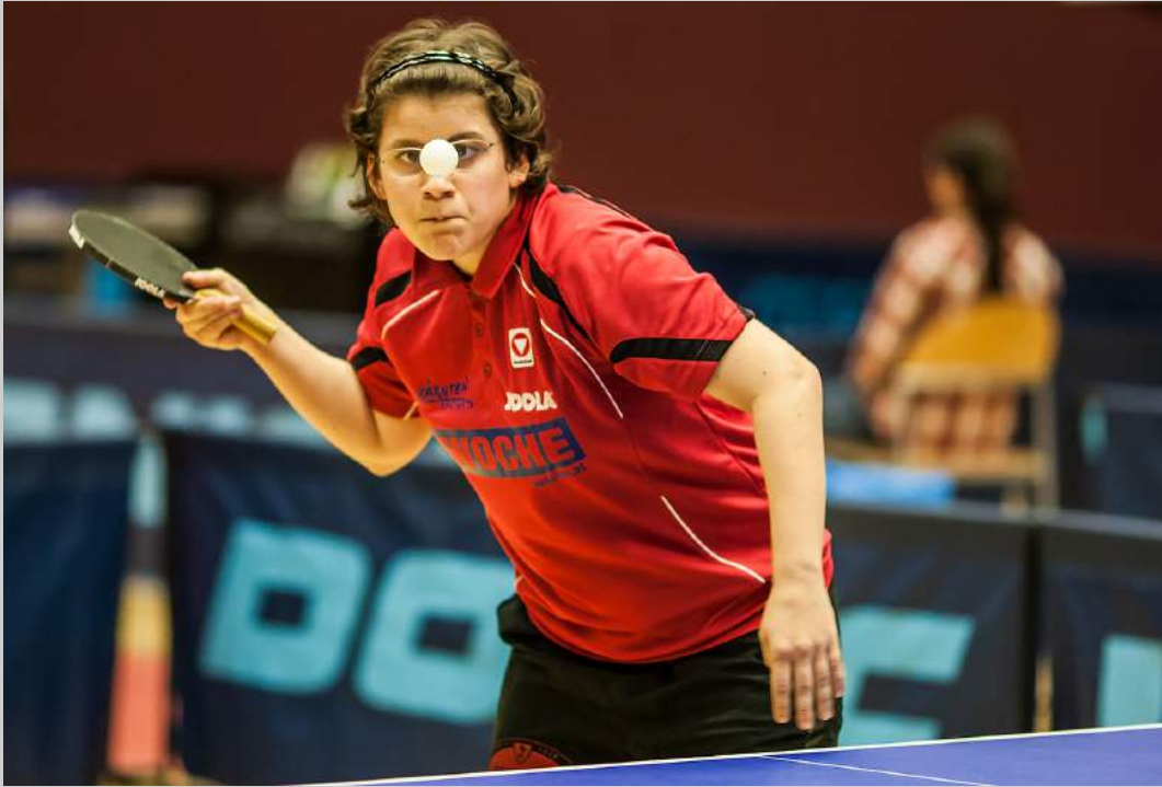
“AMELIE_2” © ALOIS BERNKOPF DR, EFIAP/S, GPU CR4 2019 S4C International Exhibition of Photography Photojournalism General