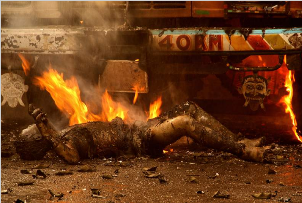
“FIRE DEATH DISASTER” © SUBHO SAHA, QPSA 2019 S4C International Exhibition of Photography Photojournalism General HM