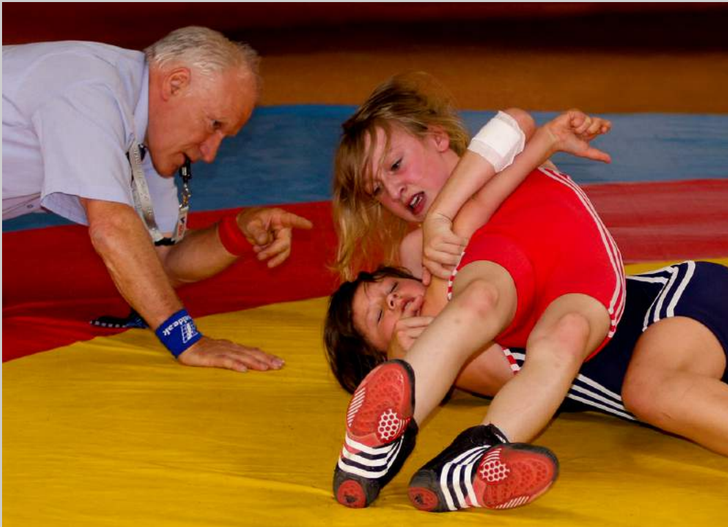
“AKTION ROT” © ALOIS BERNKOPF DR, EFIAP/S, GPU CR4 2019 S4C International Exhibition of Photography Photojournalism General Judge’s Choice