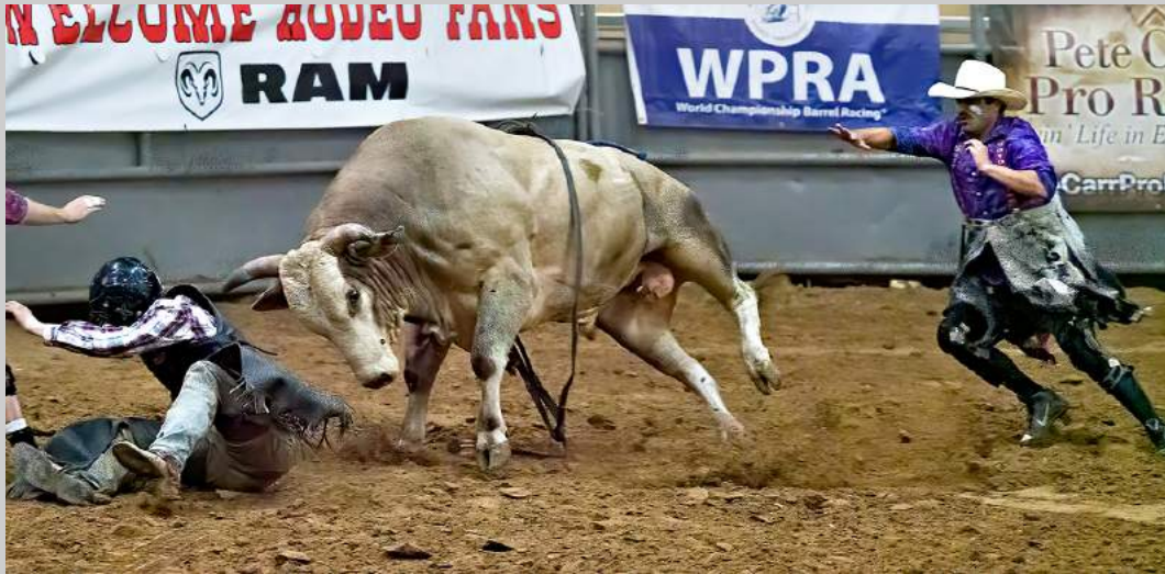
“BULL ATTACK” 2019 S4C International Exhibition of Photography Photojournalism General