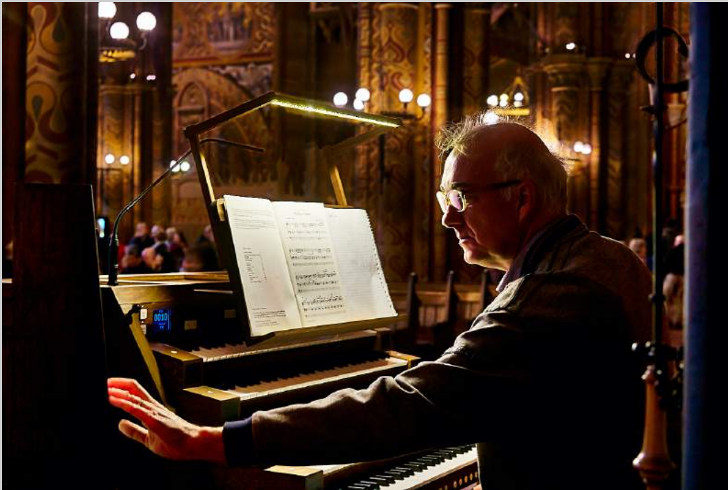
“THE ORGANIST” S4C International Exhibition of Photography Photojournalism Human Interest