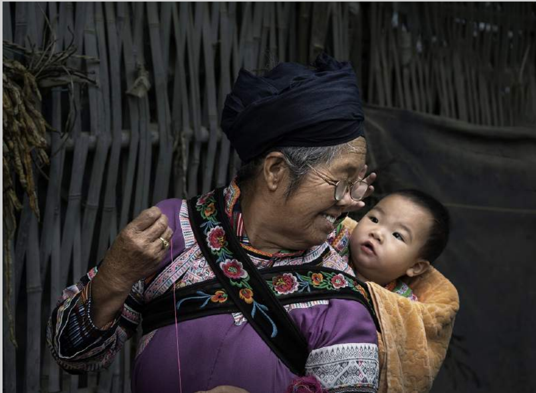
“HAPPY GRANDMOTHER AND GRANDSON” 2019 S4C International Exhibition of Photography Photojournalism Human Interest