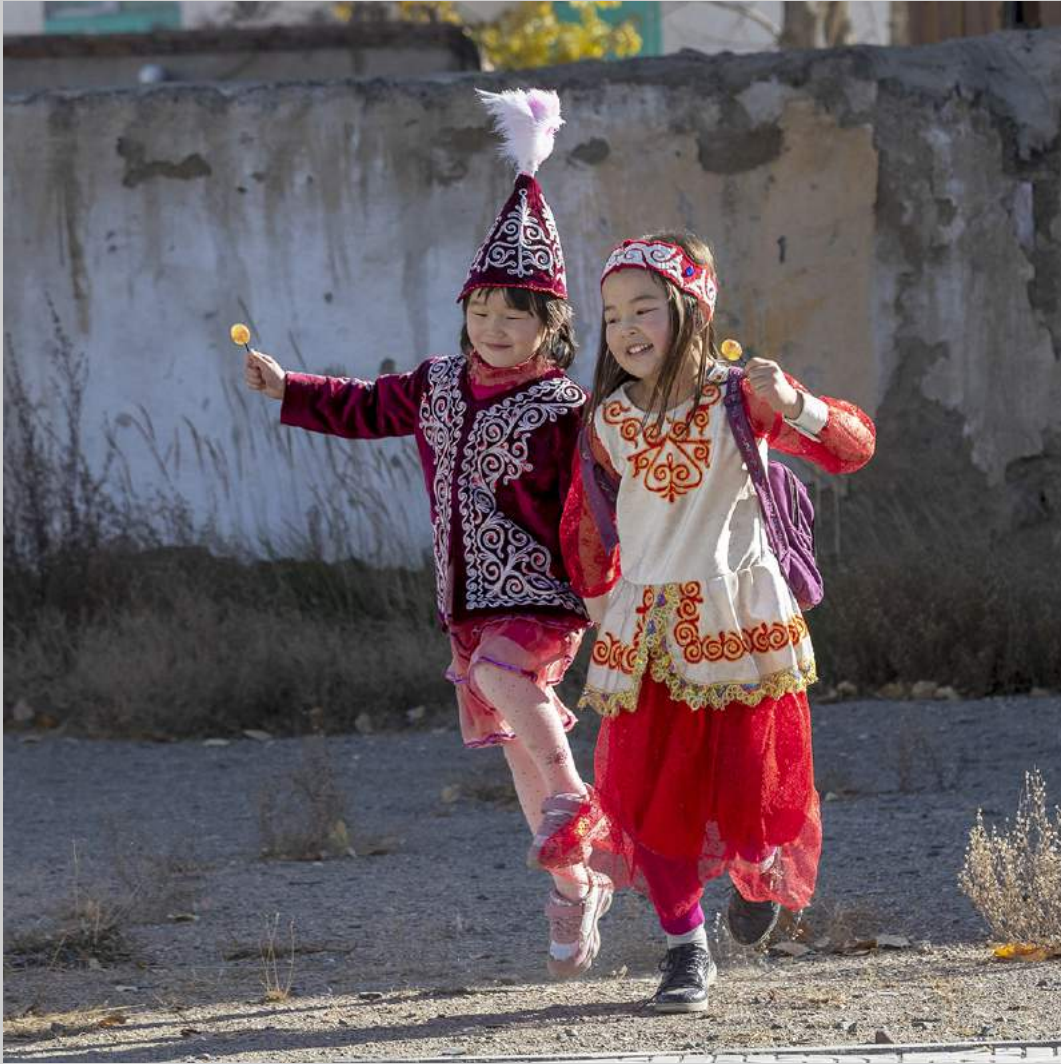
“GIRLS PLAYING” 2019 S4C International Exhibition of Photography Photojournalism General