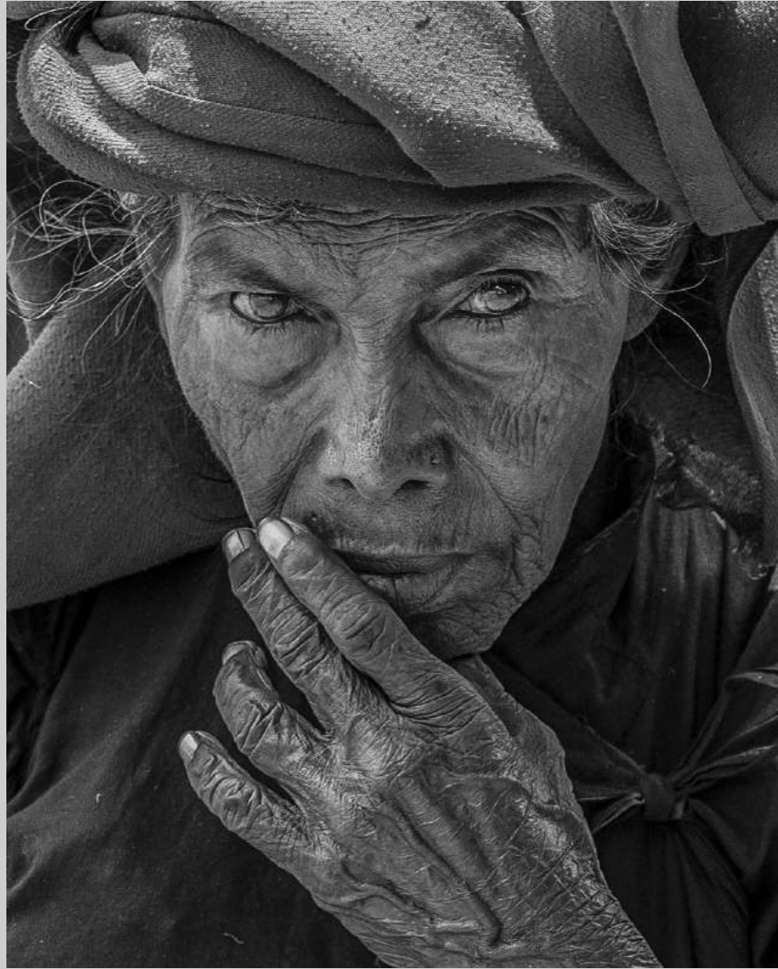
“HELPLESS” © WASIRI GAJAMAN, QPSA 2019 S4C International Exhibition of Photography Photojournalism Human Interest