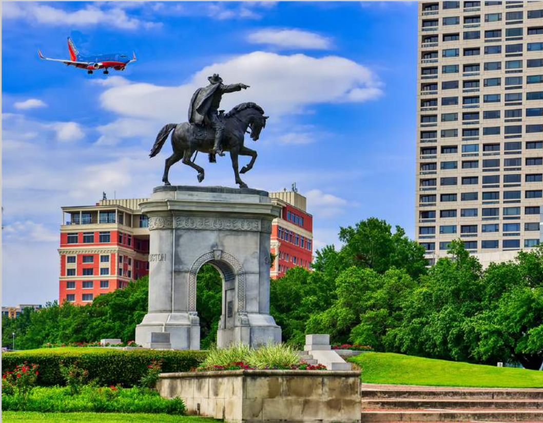
“IT’S OVER THERE” © ROBERT DAVIS, PPSA 2019 S4C International Exhibition of Photography Photojournalism General