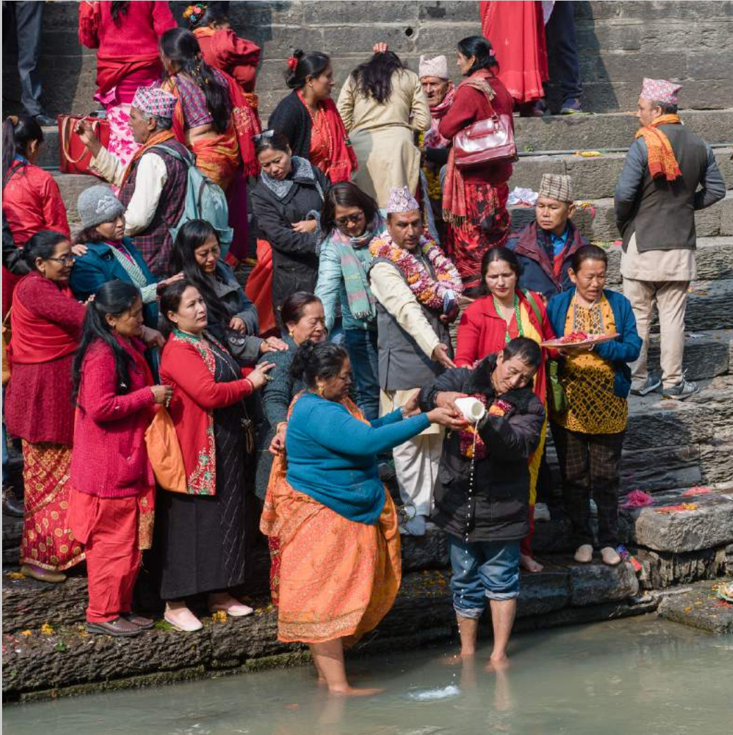
“FUNERARY RITUAL NEPAL” S4C International Exhibition of Photography Photojournalism Human Interest