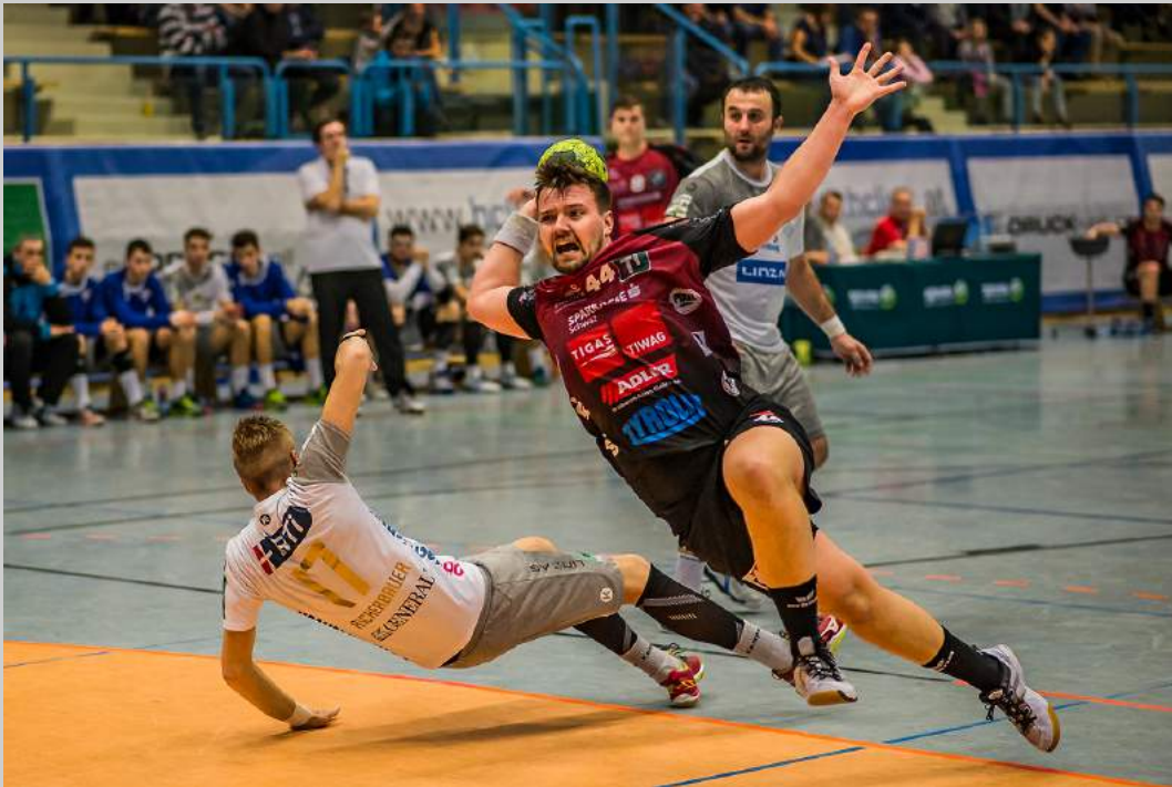
“DARIO_2” © ALOIS BERNKOPF DR, EFIAP/S, GPU CR4 2019 S4C International Exhibition of Photography Photojournalism General