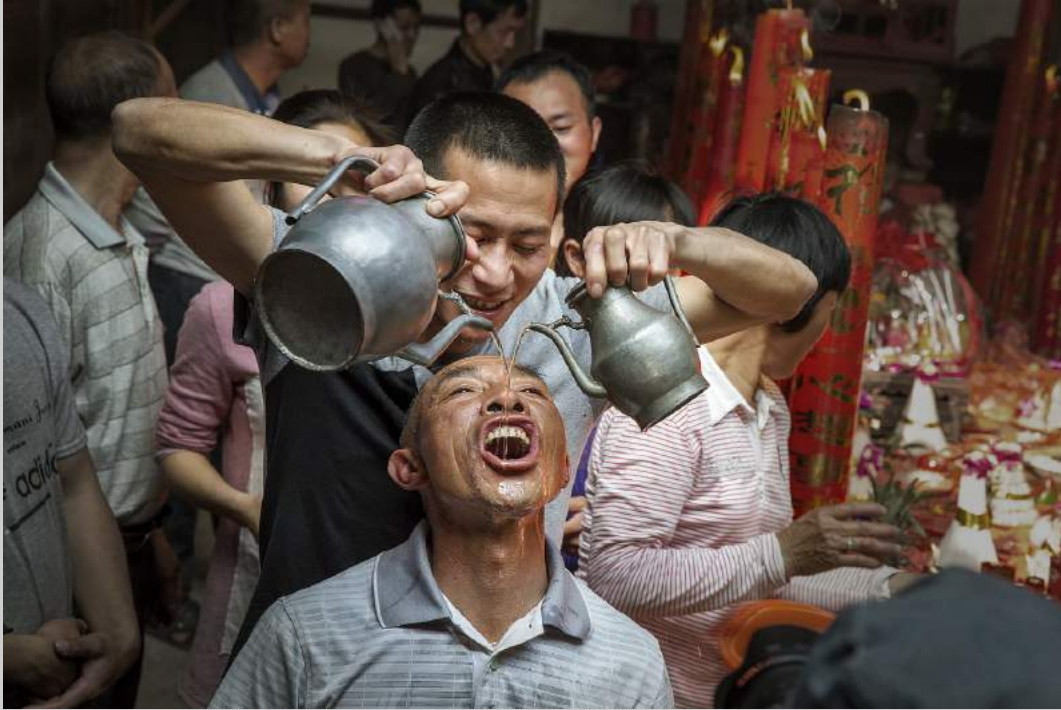
“DRINK” S4C International Exhibition of Photography Photojournalism Human Interest