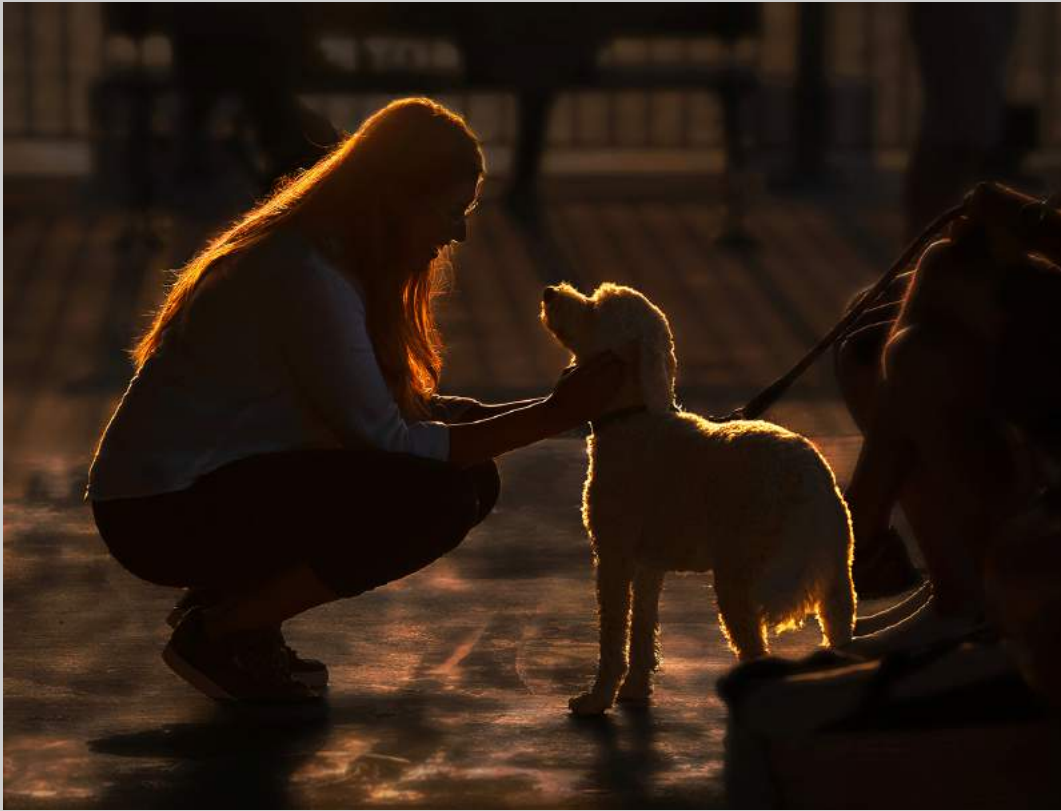
“STATION” © JIONGXIN PENG, PPSA 2019 S4C International Exhibition of Photography Photojournalism Human Interest