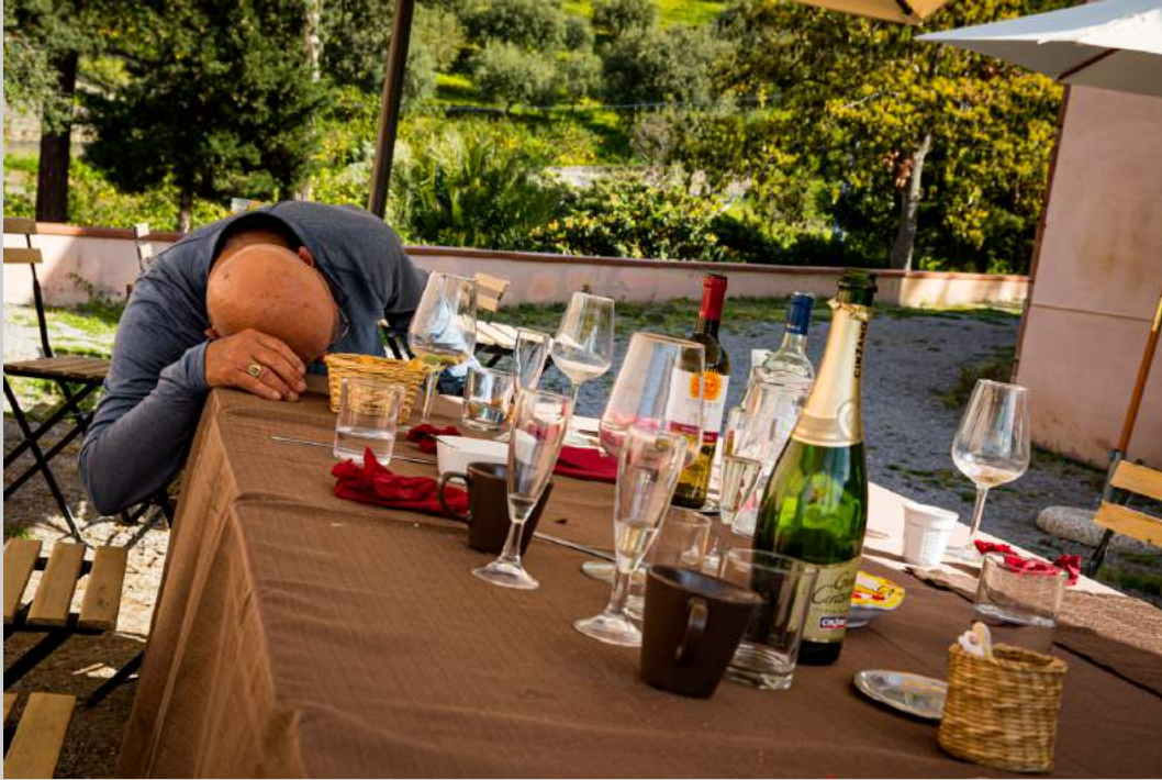
“ANOTHER DRINK?” S4C International Exhibition of Photography Photojournalism Human Interest