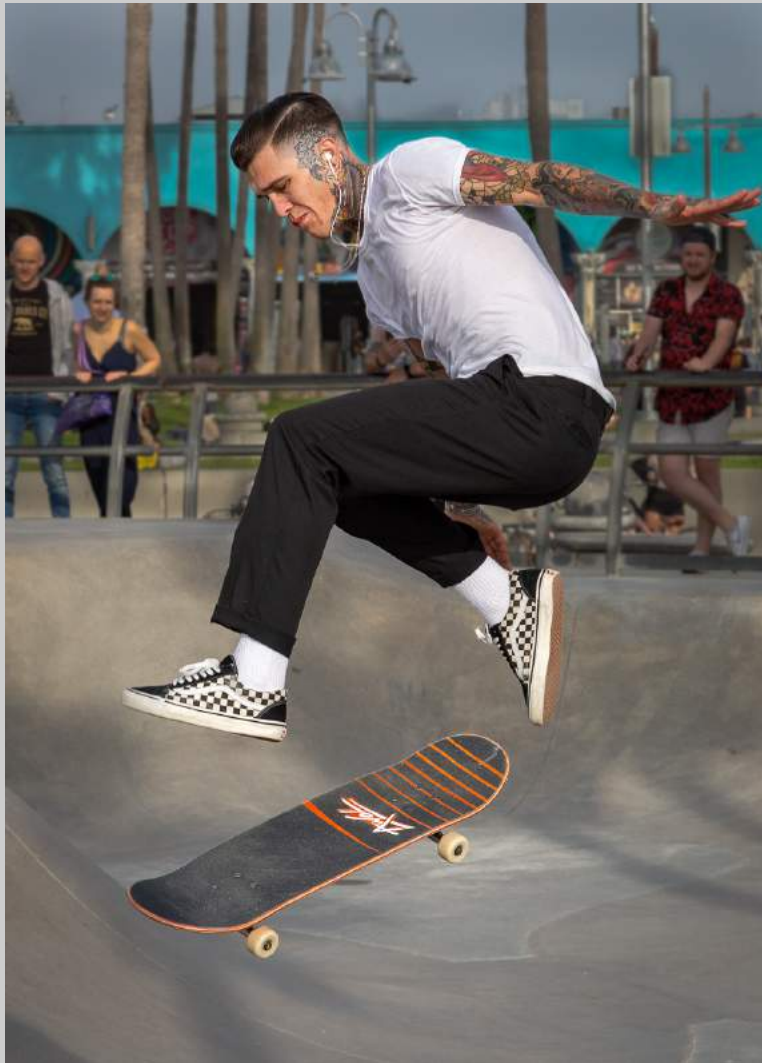
“SKATEBOARD JUMP” S4C International Exhibition of Photography Photojournalism General HM