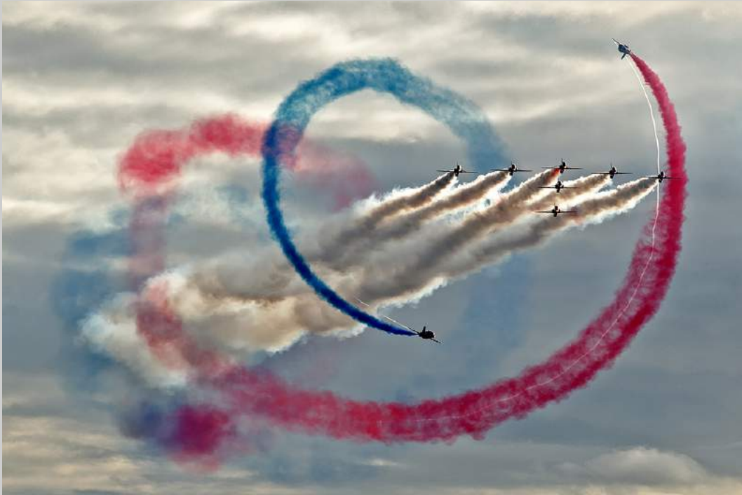
“RED ARROWS TORNADO” S4C International Exhibition of Photography Photojournalism General