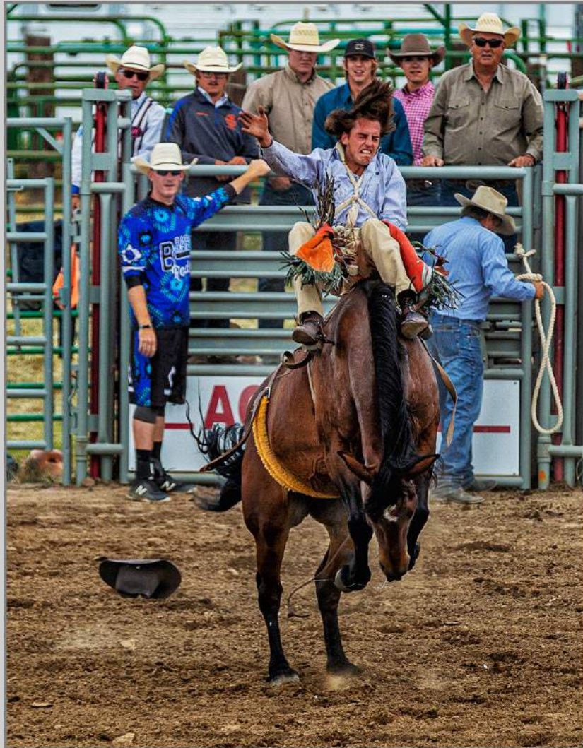
“HARNEY COUNTY RODEO BAREBACK-10” 2019 S4C International Exhibition of Photography Photojournalism General