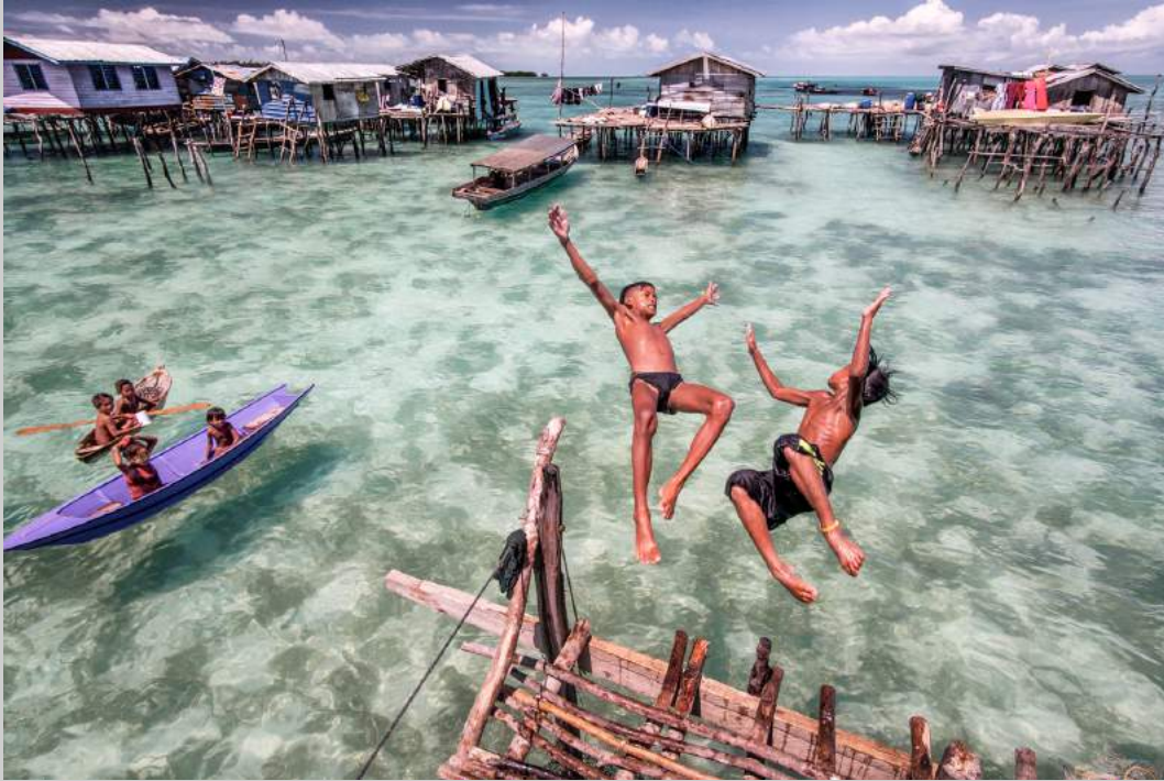
“CHILDREN HAPPY JUMP 5” EPSA 2019 S4C International Exhibition of Photography Photojournalism General