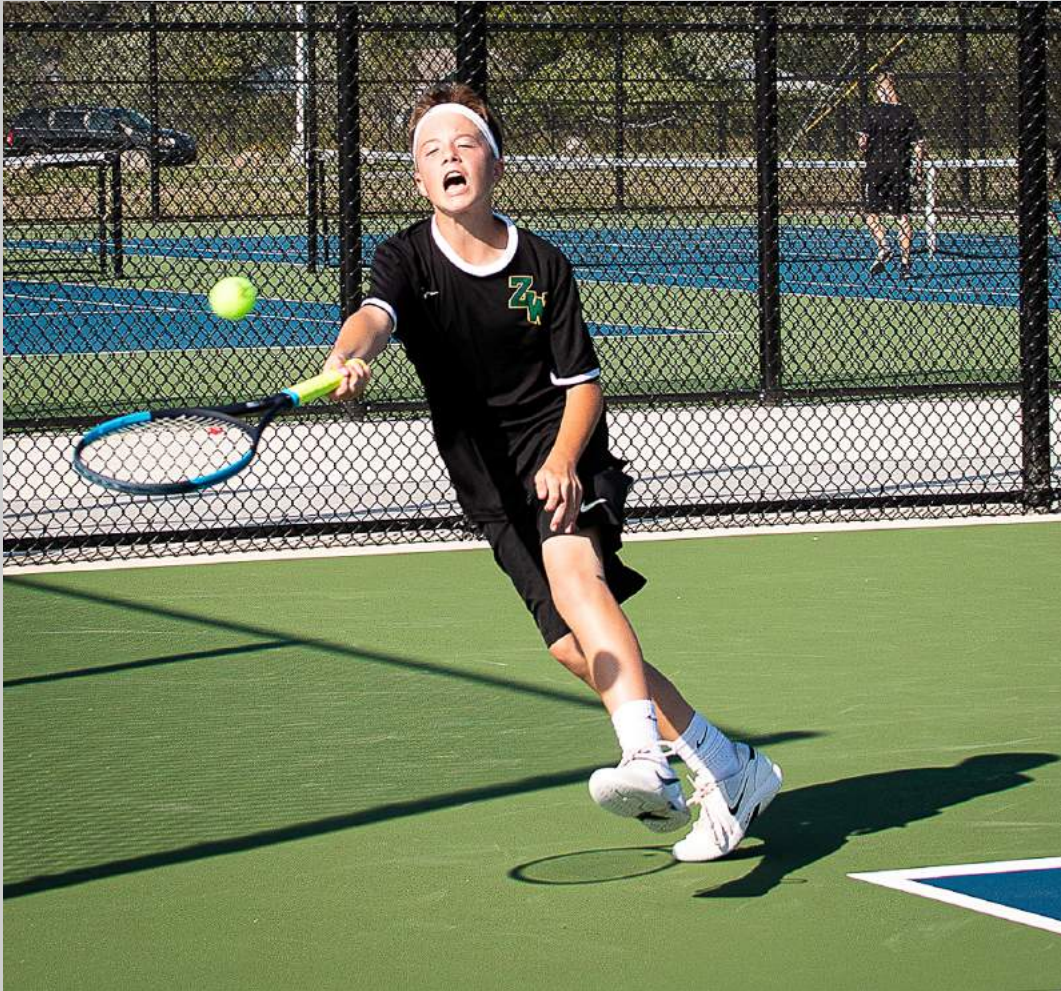
“THE STRETCH” © JEANNE QUILLAN 2019 S4C International Exhibition of Photography Photojournalism General