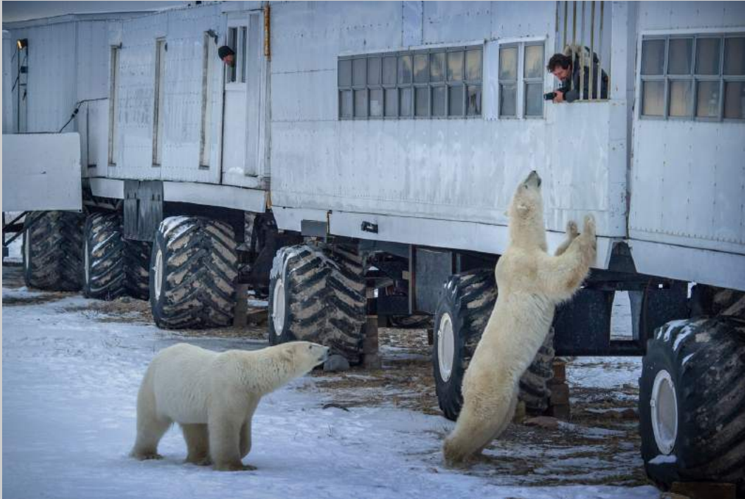
“LOOKING EACH OTHER” © XINXIN CHEN, GMPSA/B 2019 S4C International Exhibition of Photography Photojournalism Human Interest