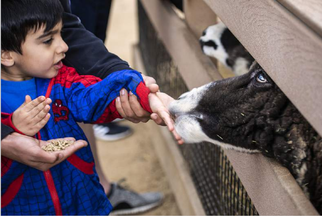
“FEEDING FEAR” S4C International Exhibition of Photography Photojournalism Human Interest