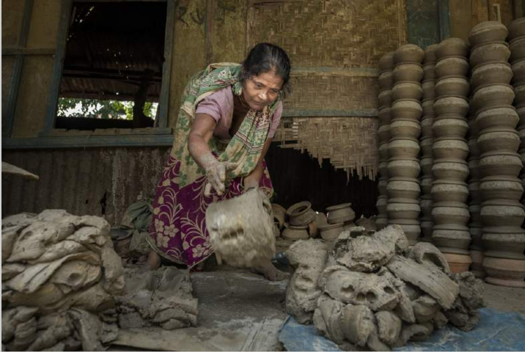
“WORKING IN BANGLADESH23” S4C International Exhibition of Photography Photojournalism General