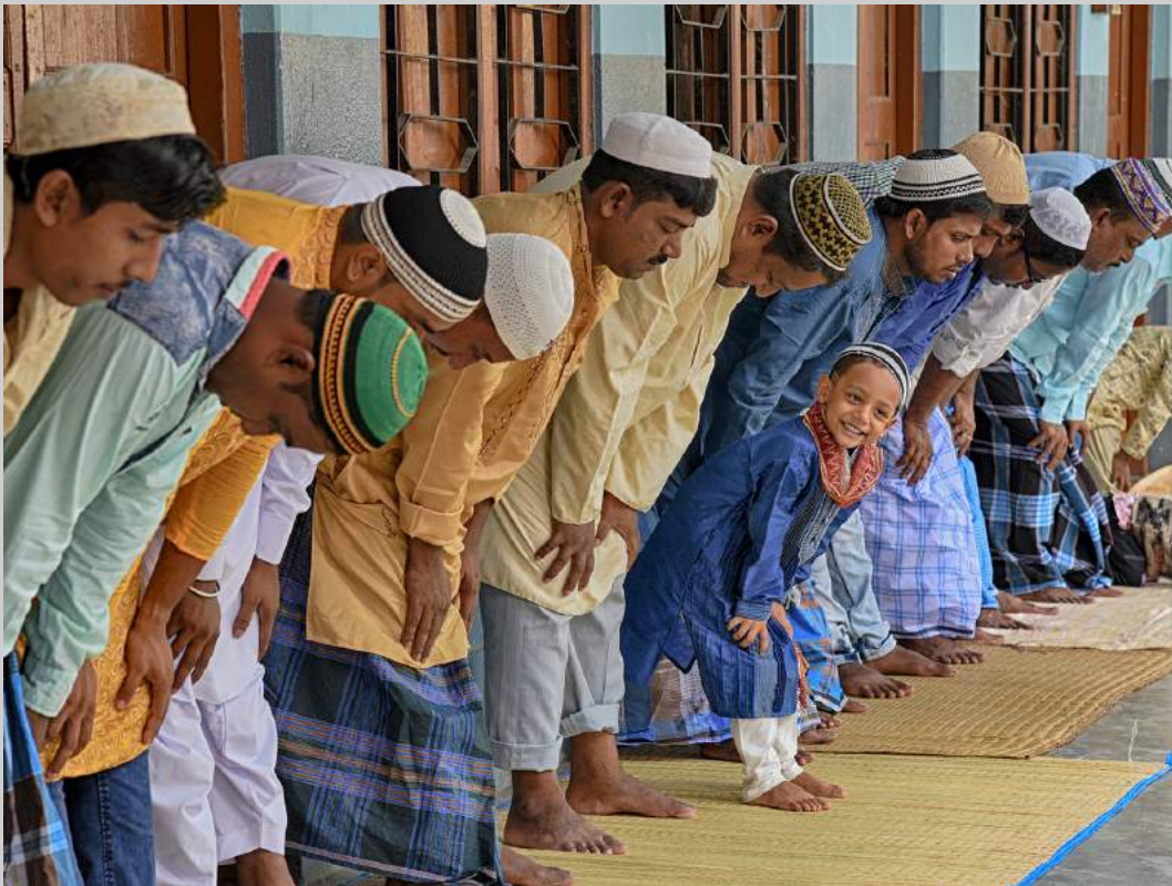
“INNOCENT LAUGH” © SUBHO SAHA, QPSA 2019 S4C International Exhibition of Photography Photojournalism Human Interest