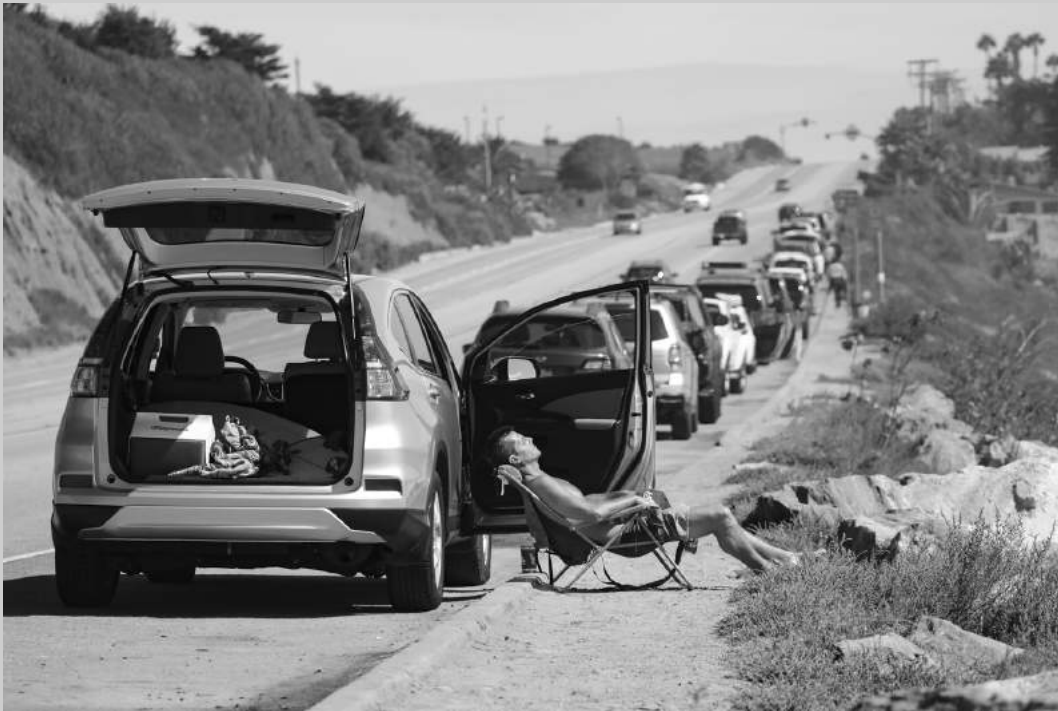
“ROADSIDE SUN” © TERRY MIRANDA 2019 S4C International Exhibition of Photography Photojournalism Human Interest