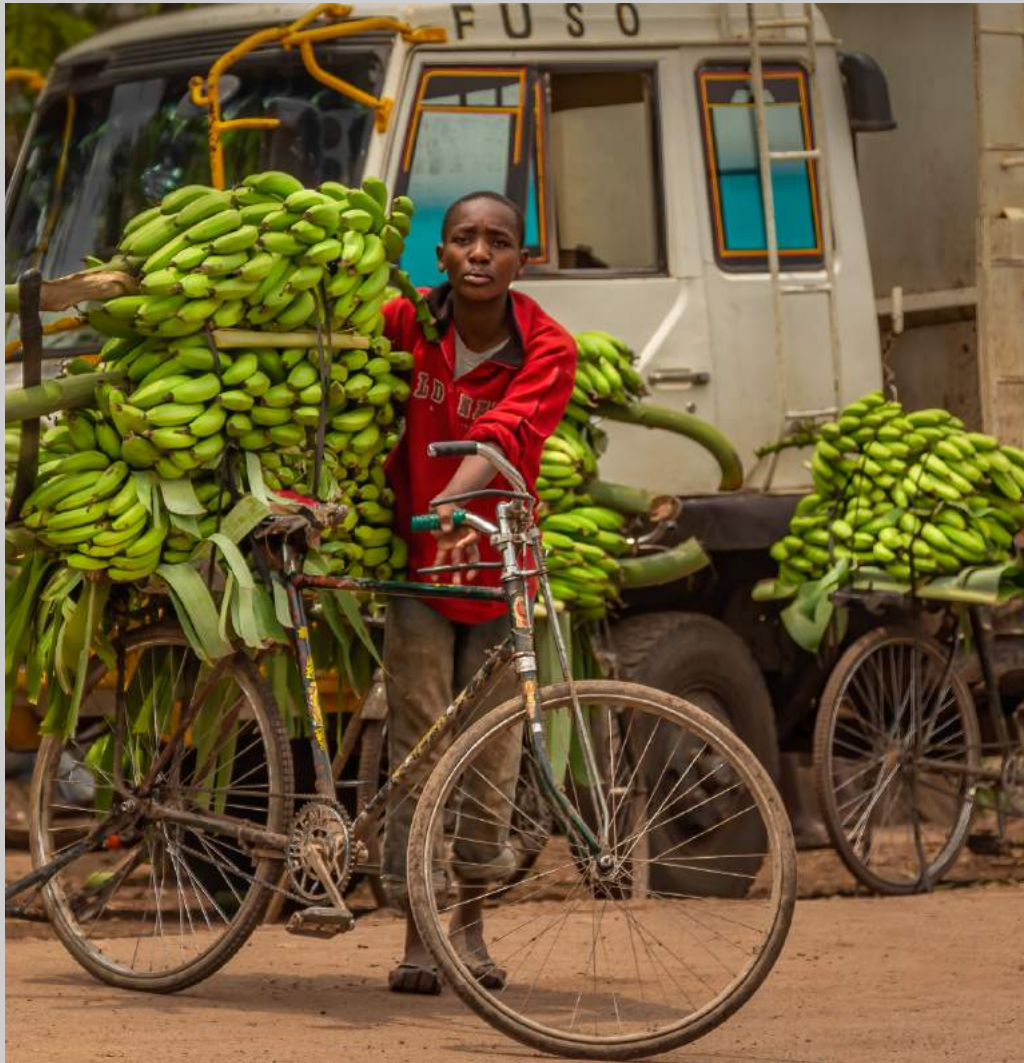
“BANANA VENDOR” © MARGARET HENNES, PPSA 2019 S4C International Exhibition of Photography Photojournalism General