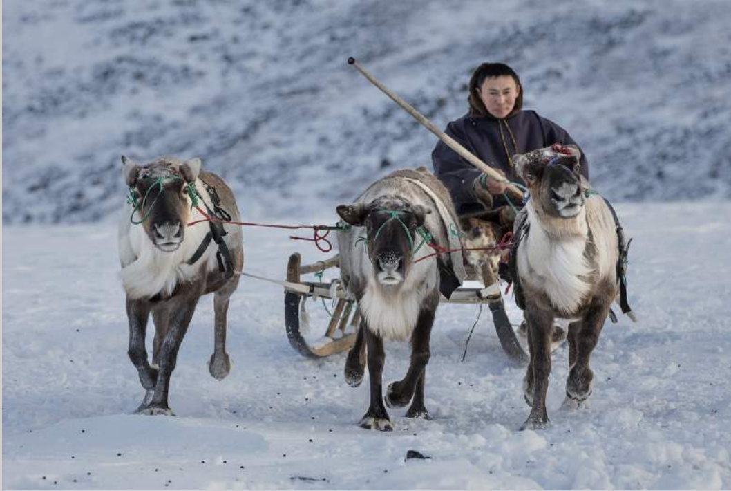
“THE NENETS55” S4C International Exhibition of Photography Photojournalism General