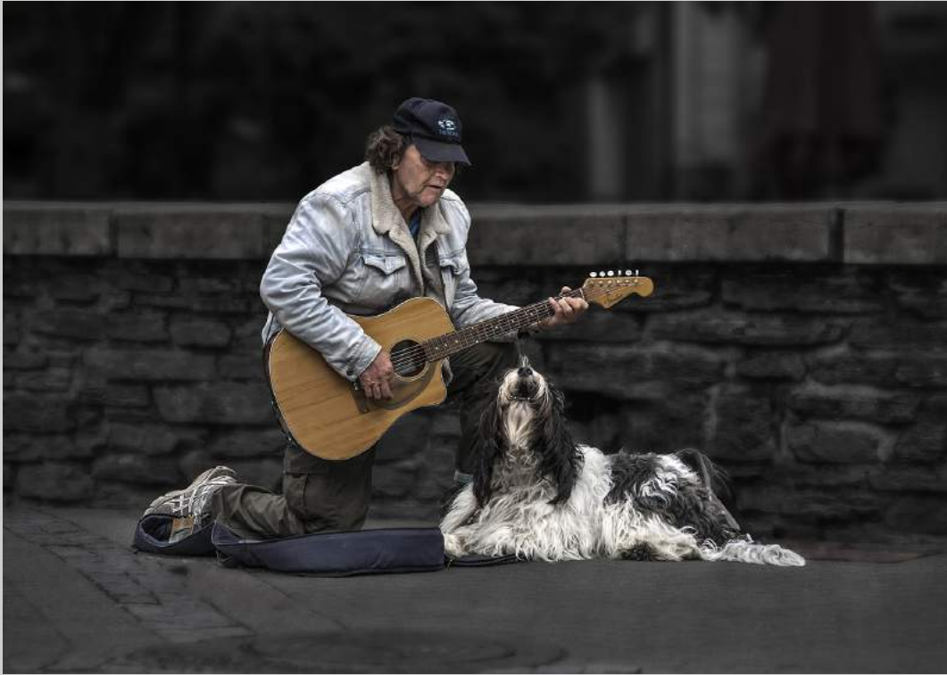
“PERFORM TOGETHER 2” © JIONGXIN PENG, PPSA 2019 S4C International Exhibition of Photography Photojournalism Human Interest S4C Silver