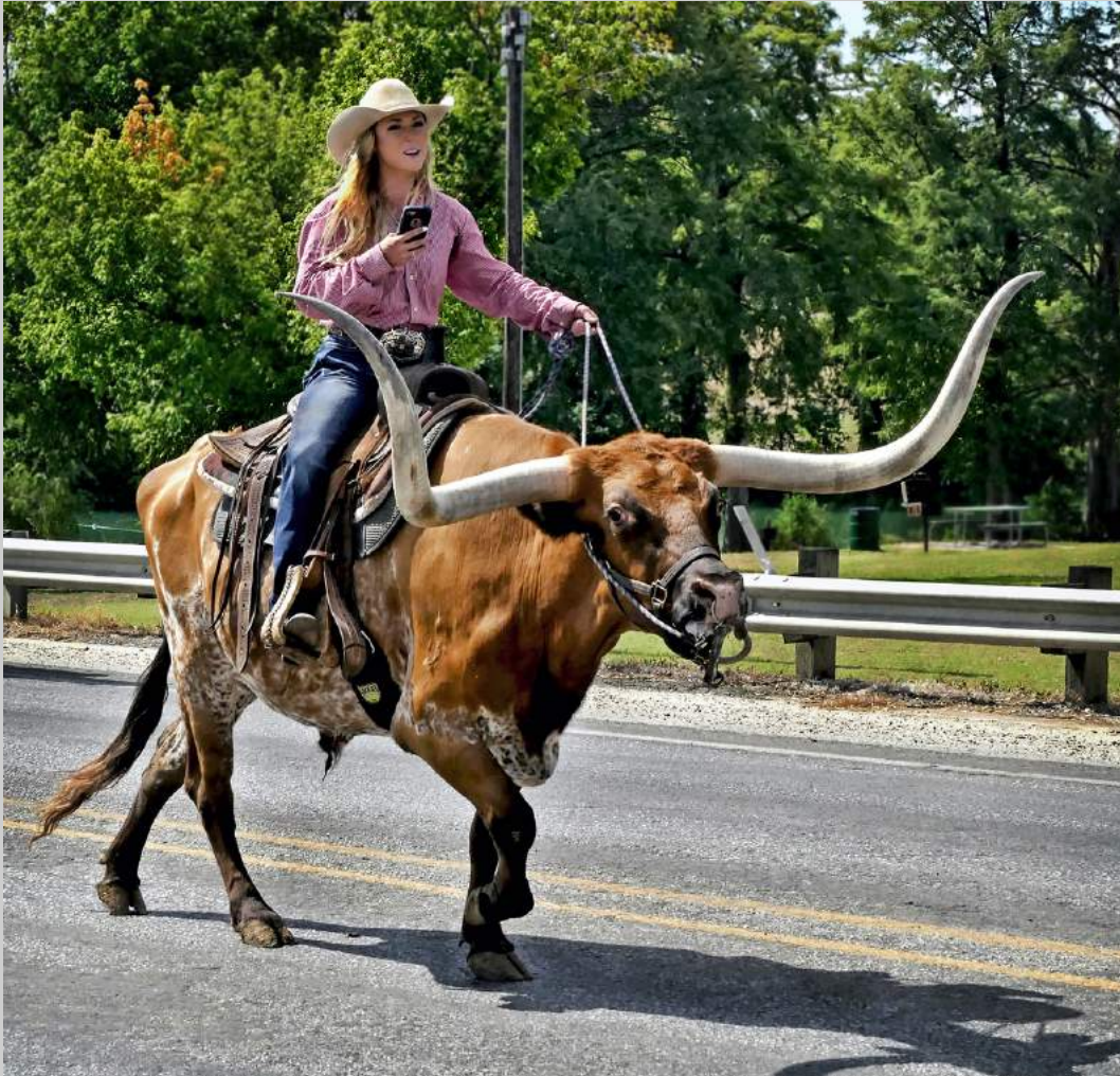
“GIRL RIDING LONG HORN-CELL PHONE” S4C International Exhibition of Photography Photojournalism Human Interest