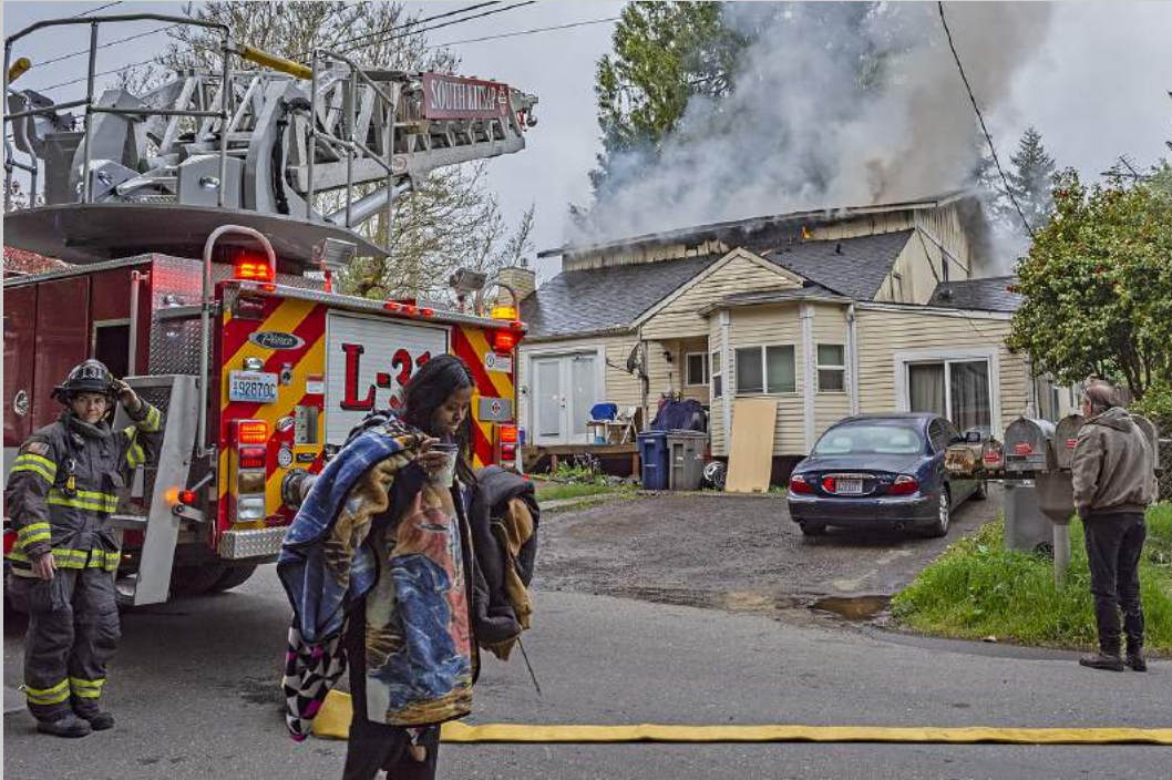
“BLANKETS FOR THE DISPLACED” © STEVEN FISHER, FPSA, MPSA 2019 S4C International Exhibition of Photography Photojournalism Human Interest Judge’s Choice