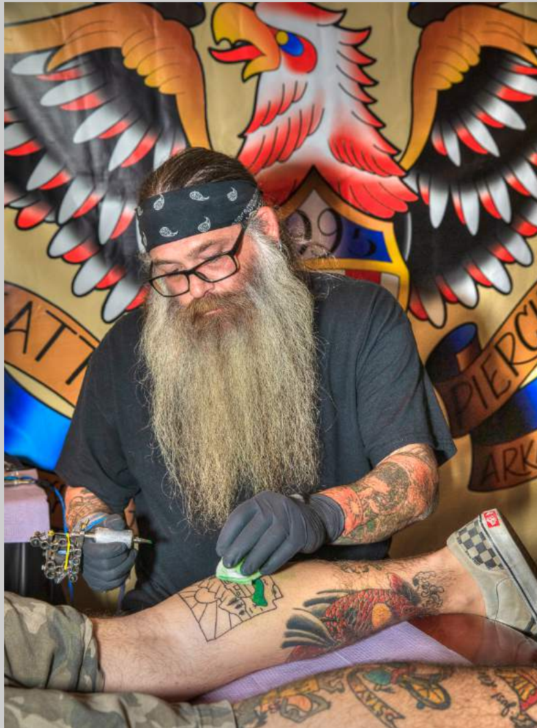
“A LIFESTYLE” 2019 S4C International Exhibition of Photography Photojournalism General