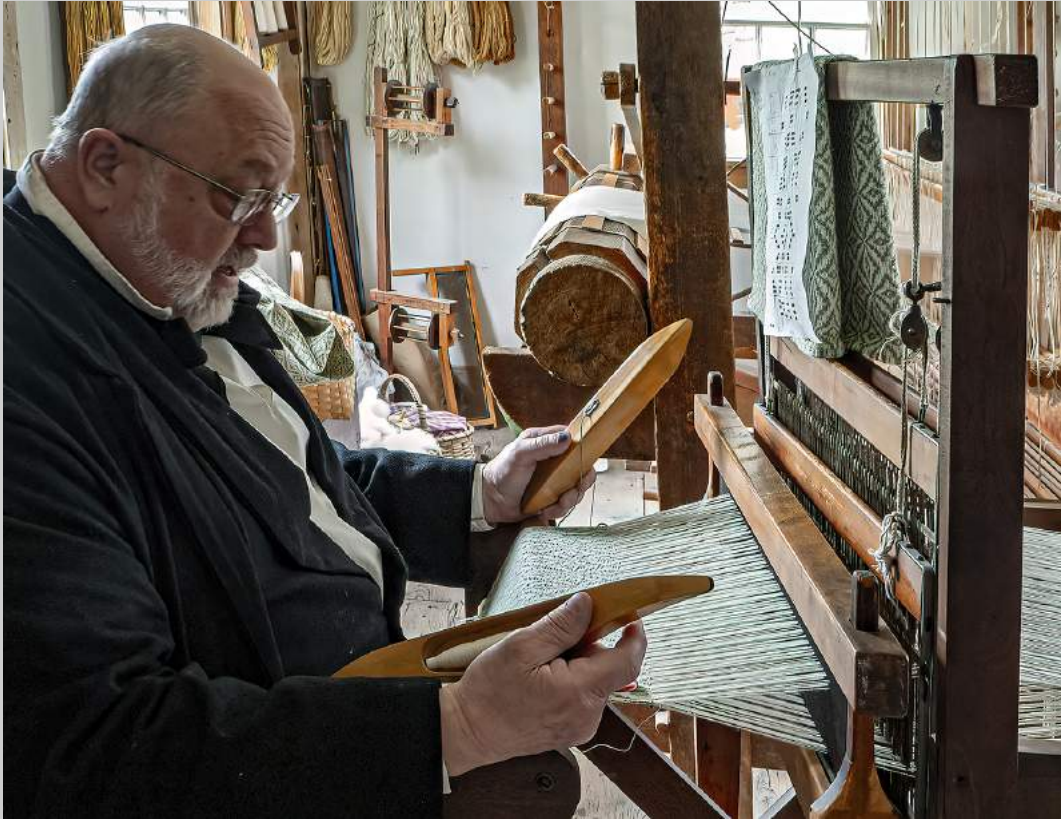
“WEAVER” © ALICE MARIE WAY 2019 S4C International Exhibition of Photography Photojournalism Human Interest