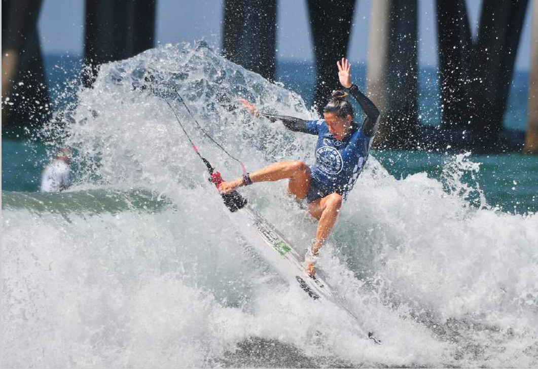
“QUICK TURN 2” © GODFREY WONG, GMP 2019 S4C International Exhibition of Photography Photojournalism General