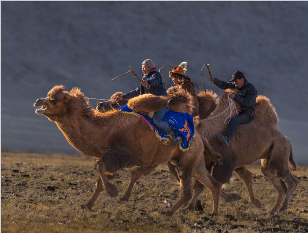
“KAZAK CAMEL RACE” © FRANCIS KING, GMP 2019 S4C International Exhibition of Photography Photojournalism General