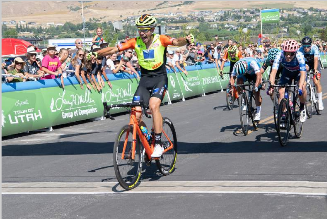
“THE WINNER” S4C International Exhibition of Photography Photojournalism General