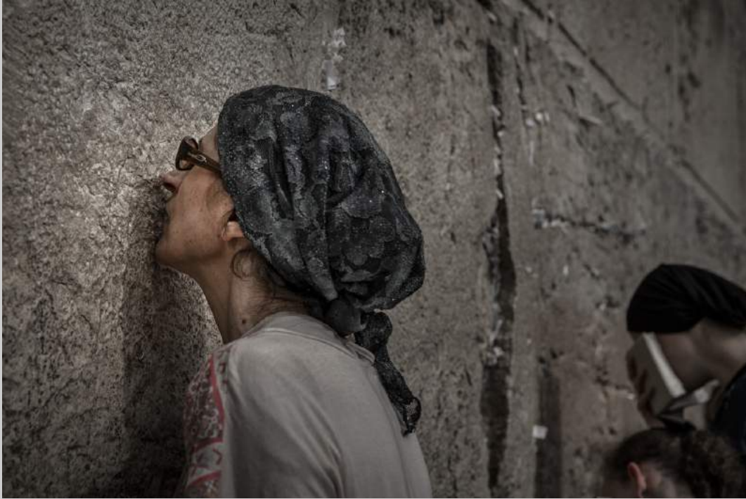
“DEVOUT KISS” S4C International Exhibition of Photography Photojournalism General