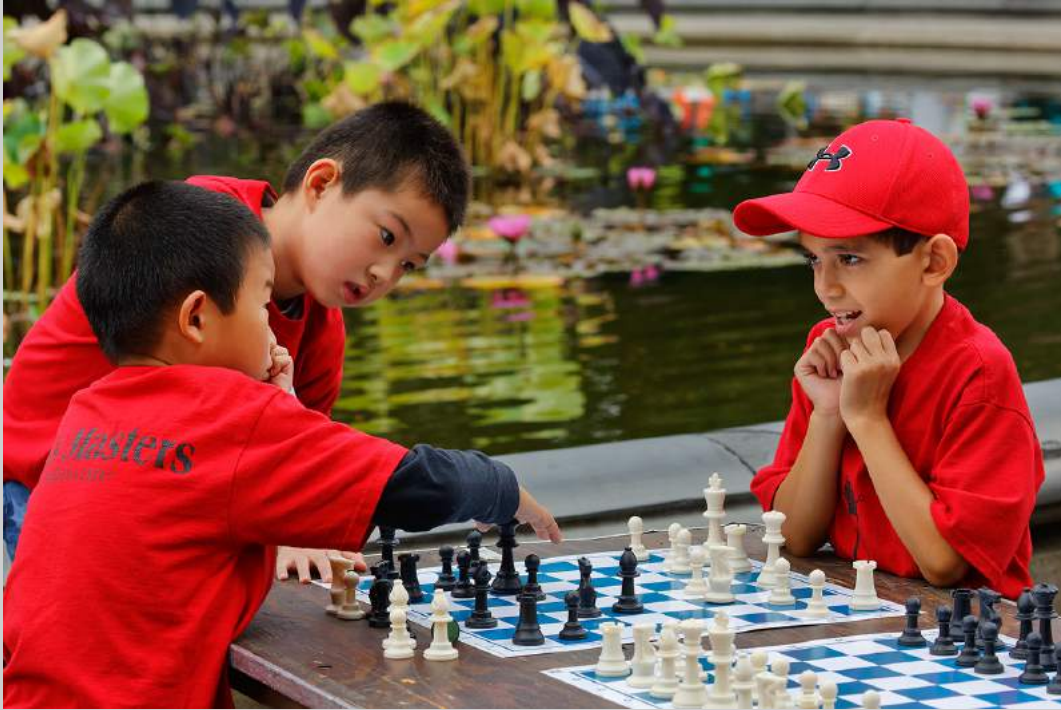
“CHESS IN THE PARK 2019-03” © VOLKER MEINBERG, GMPA/B 2019 S4C International Exhibition of Photography Photojournalism General HM