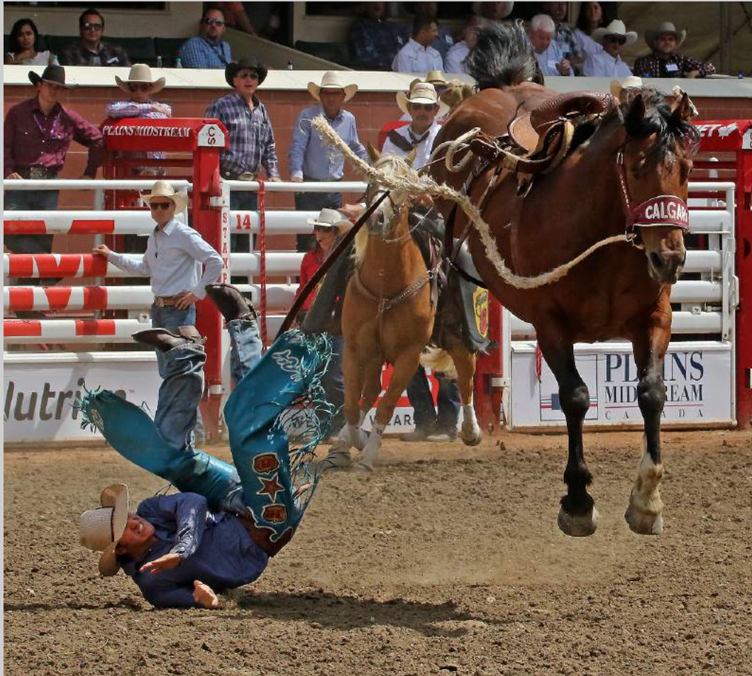
“BUCKED OFF COWBOY DOWN 3157” S4C International Exhibition of Photography Photojournalism General S4C Silver