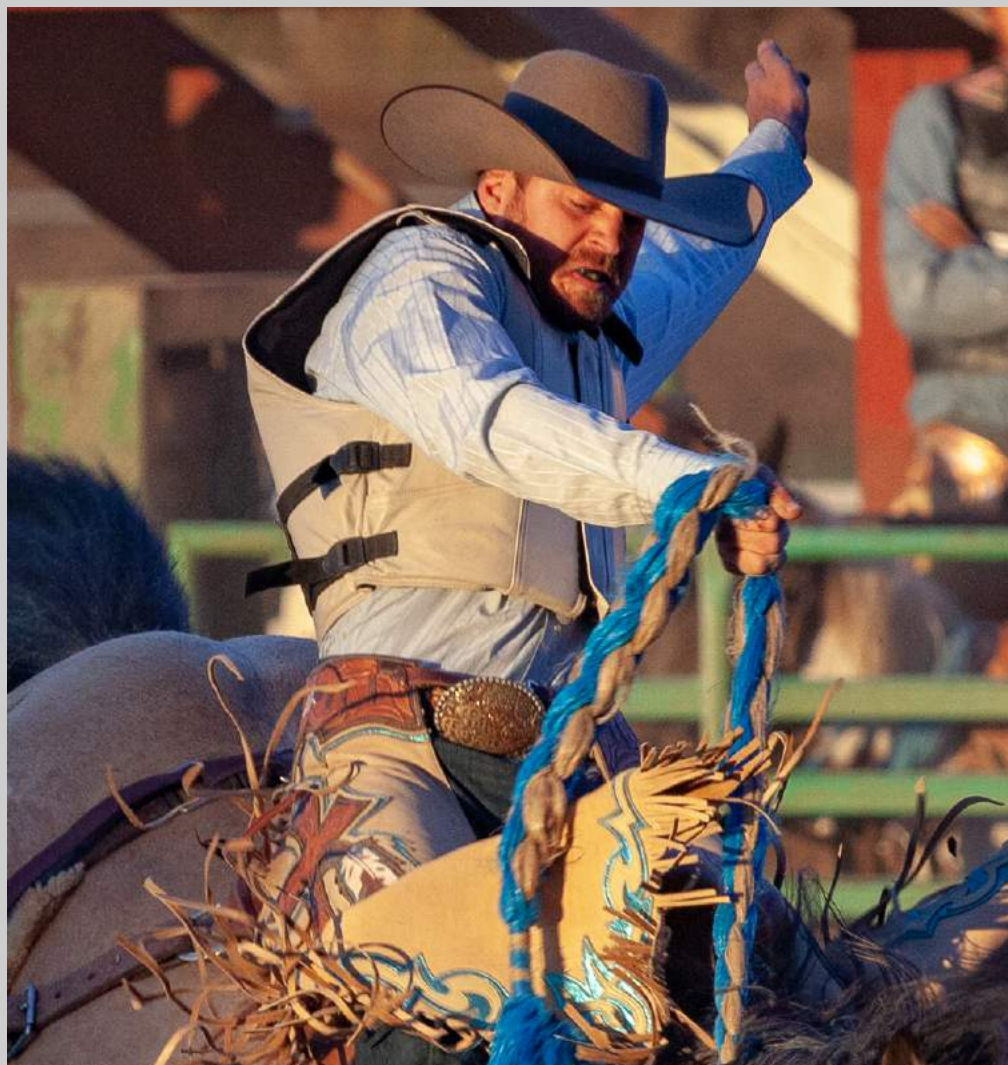
“JUST EIGHT SECONDS” © DONNA OSBORNE, QPSA 2019 S4C International Exhibition of Photography Photojournalism General