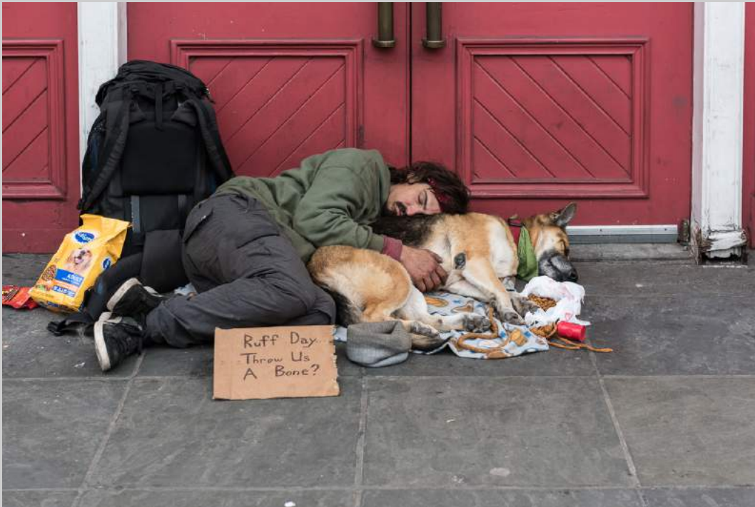
“RUFF DAY” S4C International Exhibition of Photography Photojournalism Human Interest PSA Best of Show Gold