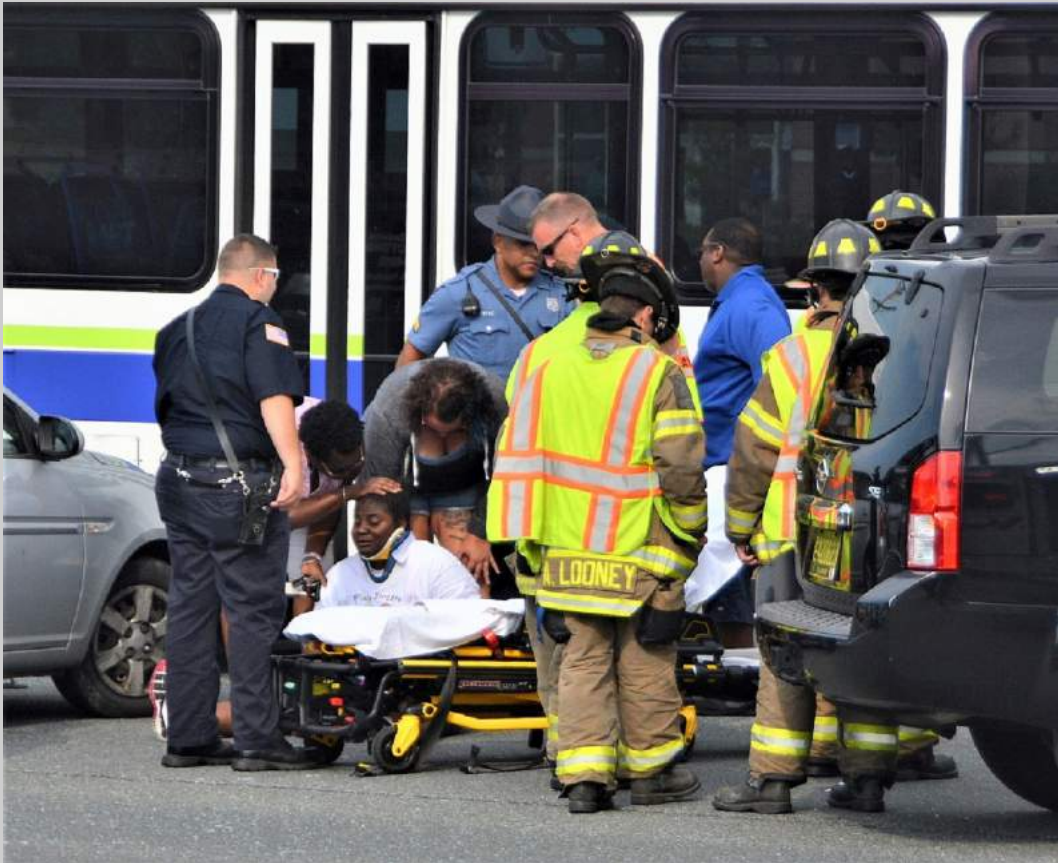
“HOT JOB 02” © ALEXANDER RASPUTNIS, PPSA 2019 S4C International Exhibition of Photography Photojournalism General