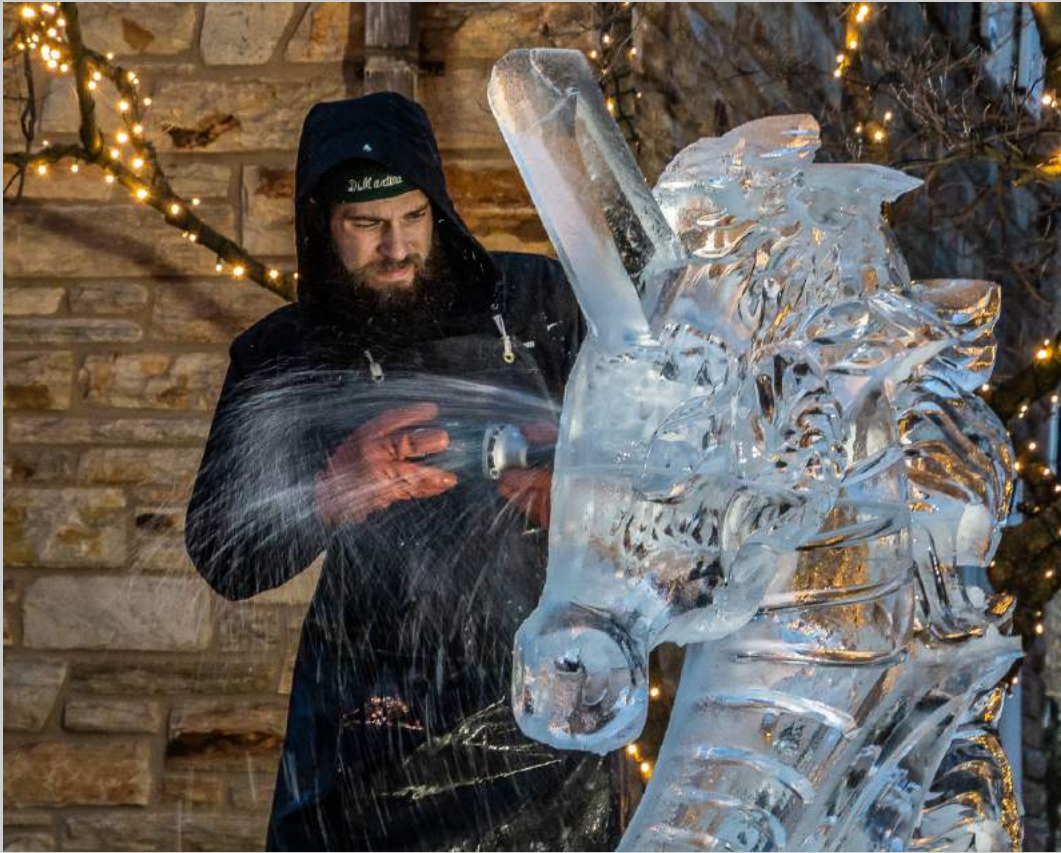
“FIRE AND ICE CARVING” © VALENTINA SOKOLSKAYA, PPSA 2019 S4C International Exhibition of Photography Photojournalism General