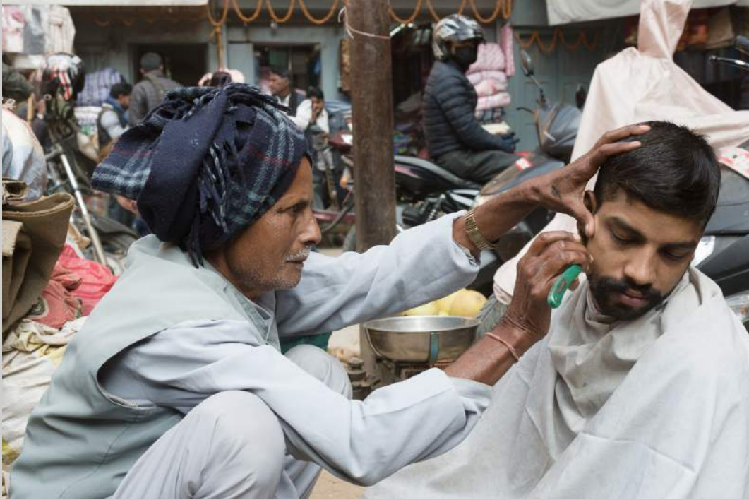
“STREET BARBER” S4C International Exhibition of Photography Photojournalism Human Interest