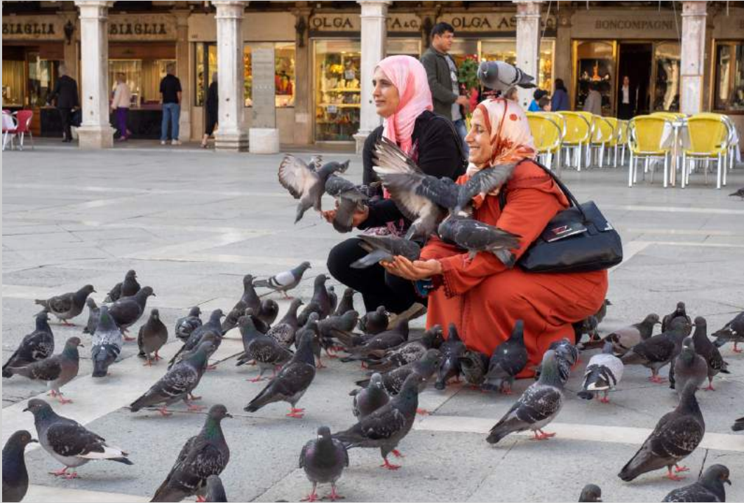
“ST MARKS PIGEONS” S4C International Exhibition of Photography Photojournalism Human Interest