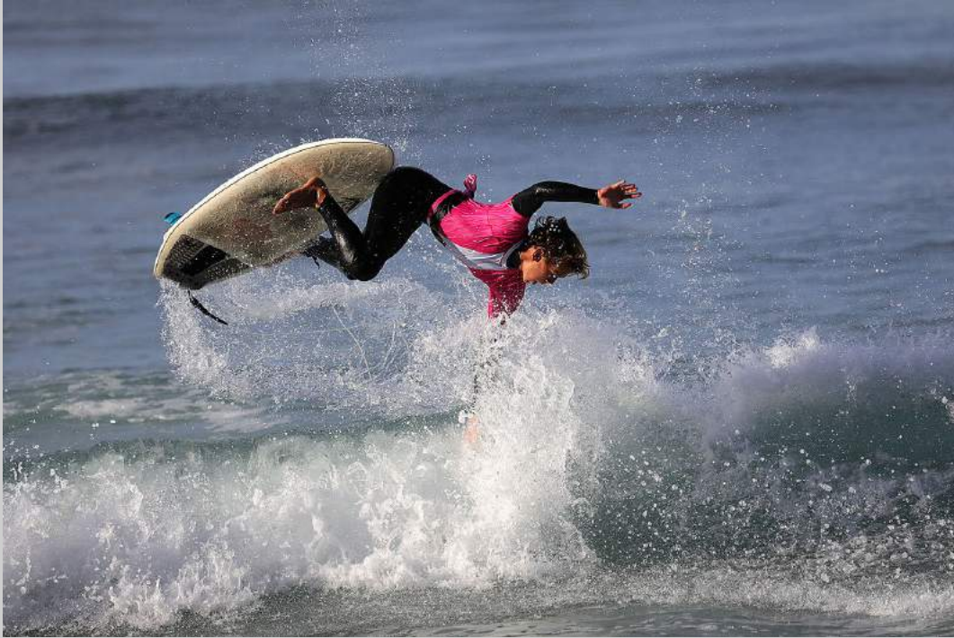
“SURFER GOING UPSIDE DOWN” © SANDRA CRANTZ 2019 S4C International Exhibition of Photography Photojournalism General