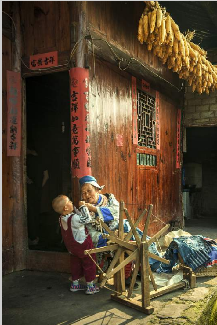
“GRANDPARENT AND GRANDCHILD” © LIANGJIN LIU 2019 S4C International Exhibition of Photography Photojournalism Human Interest