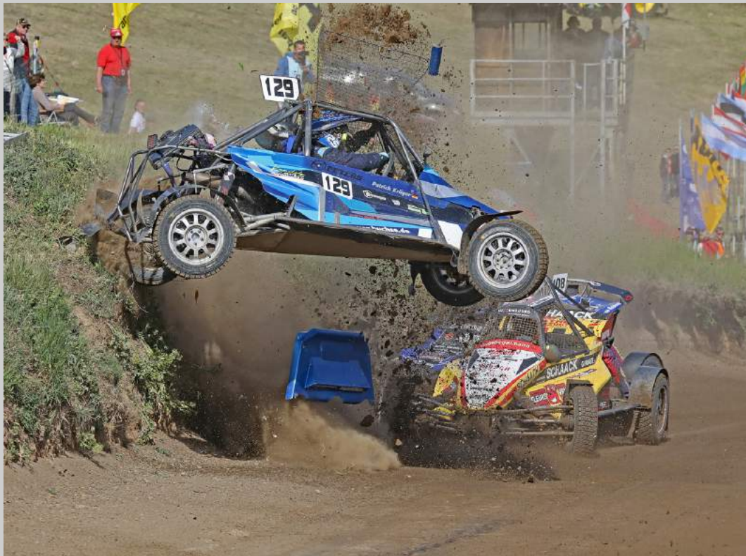
“AUTOCROSSER 129 IN THE AIR” 2019 S4C International Exhibition of Photography Photojournalism General HM