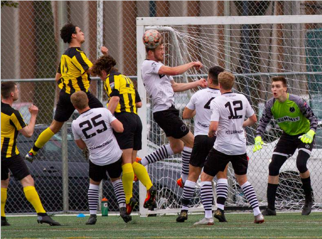
“MPLS CITY SAVE” 2019 S4C International Exhibition of Photography Photojournalism General