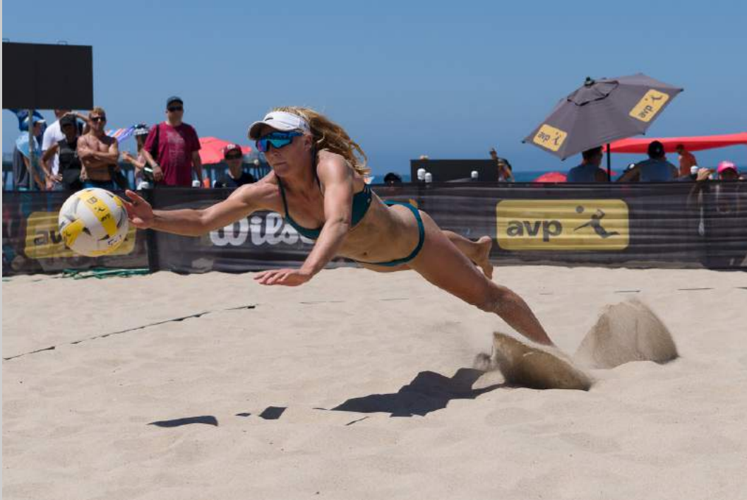
“KELLY'S DIG” S4C International Exhibition of Photography Photojournalism General