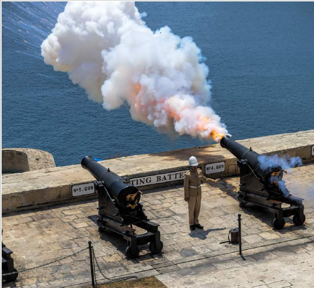
“VALLETA SALUTING BATTERY NOON” © WARD CONAWAY, EPSA 2019 S4C International Exhibition of Photography Photojournalism General