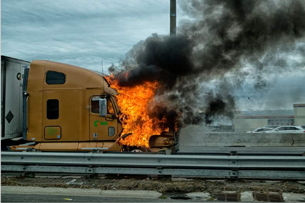
“BURNING TRUCK” © BARBARA SCHMIDT, EPSA 2019 S4C International Exhibition of Photography Photojournalism General