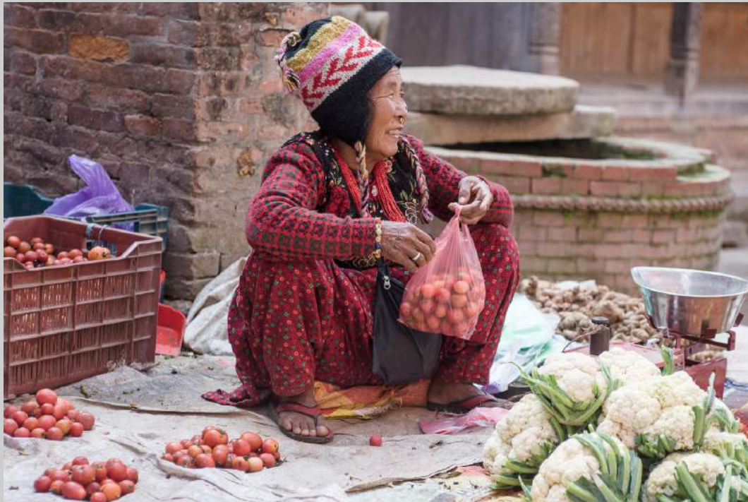
“KATHMANDU STREET VENDOR” © CHRISTINE WILKINS 2019 S4C International Exhibition of Photography Photojournalism Human Interest