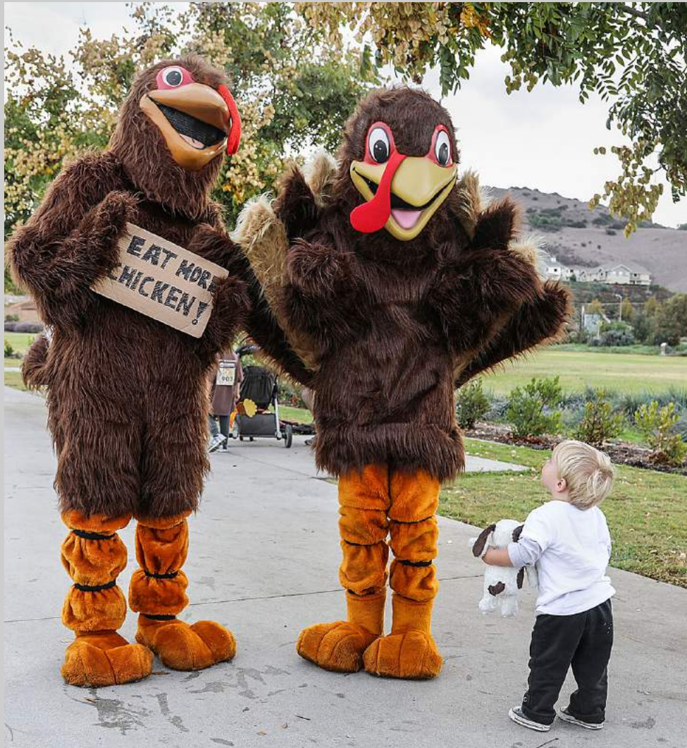
“WILD THING” S4C International Exhibition of Photography Photojournalism Human Interest