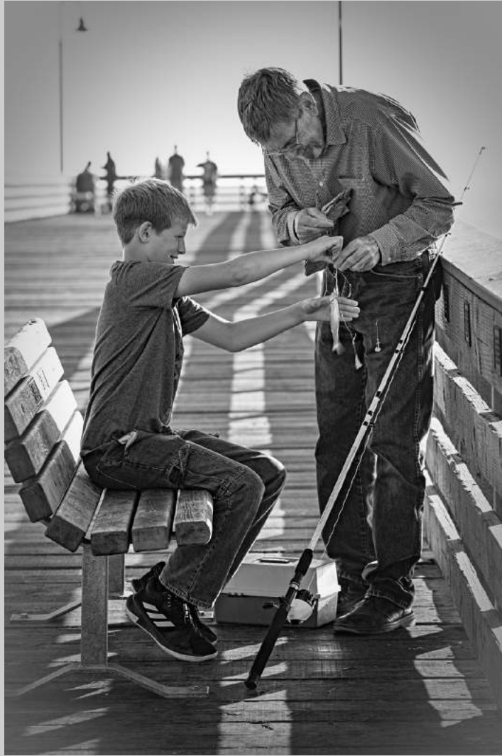
“WE CAUGHT ONE” S4C International Exhibition of Photography Photojournalism General