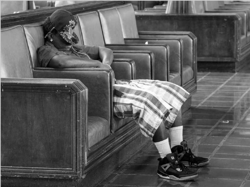
“NAPPING AT UNION STATION” S4C International Exhibition of Photography Photojournalism Human Interest