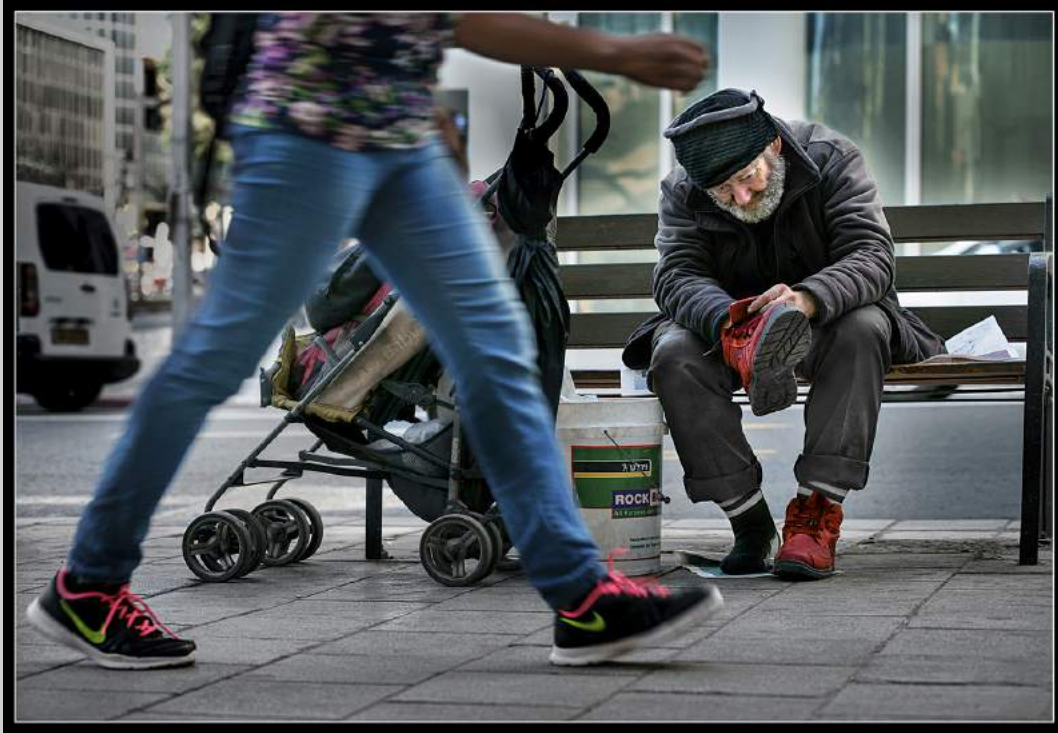
“RED SHOES” S4C International Exhibition of Photography Photojournalism Human Interest Judge’s Choice