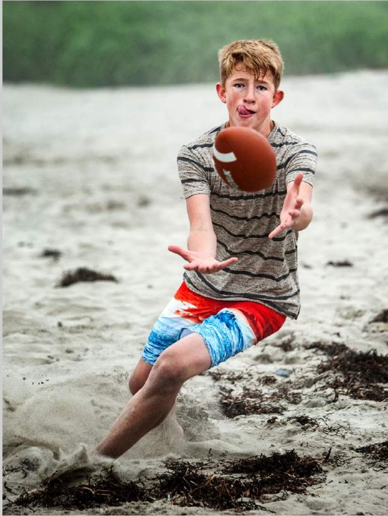
“EYE ON THE BALL 0973” © VIKI GAUL, APSA, PPSA 2019 S4C International Exhibition of Photography Photojournalism General