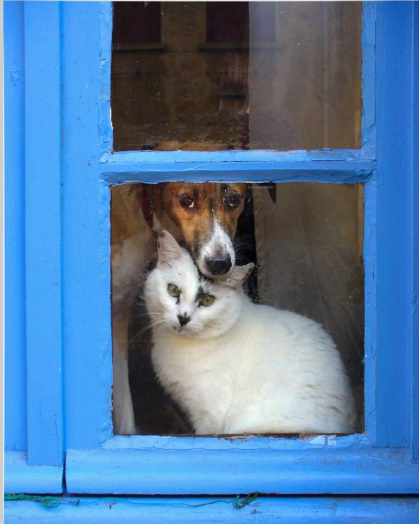
“FRIENDSHIP” © VALENTINA SOKOLSKAYA, PPSA 2019 S4C International Exhibition of Photography Photojournalism General