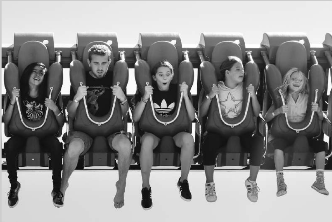
“RIDE AT THE FAIR” S4C International Exhibition of Photography Photojournalism Human Interest