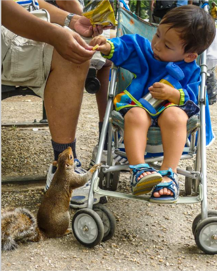
“FEEDING SQUIRREL” © VALENTINA SOKOLSKAYA, PPSA 2019 S4C International Exhibition of Photography Photojournalism Human Interest