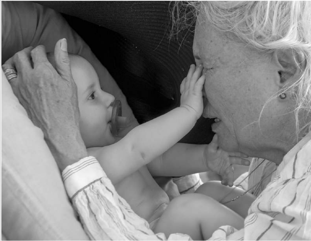
“MARCELLO AND MIMI” © WARD CONAWAY, EPSA 2019 S4C International Exhibition of Photography Photojournalism Human Interest HM