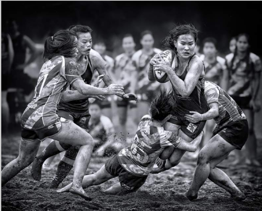
“TACKLE 3” 2019 S4C International Exhibition of Photography Photojournalism General