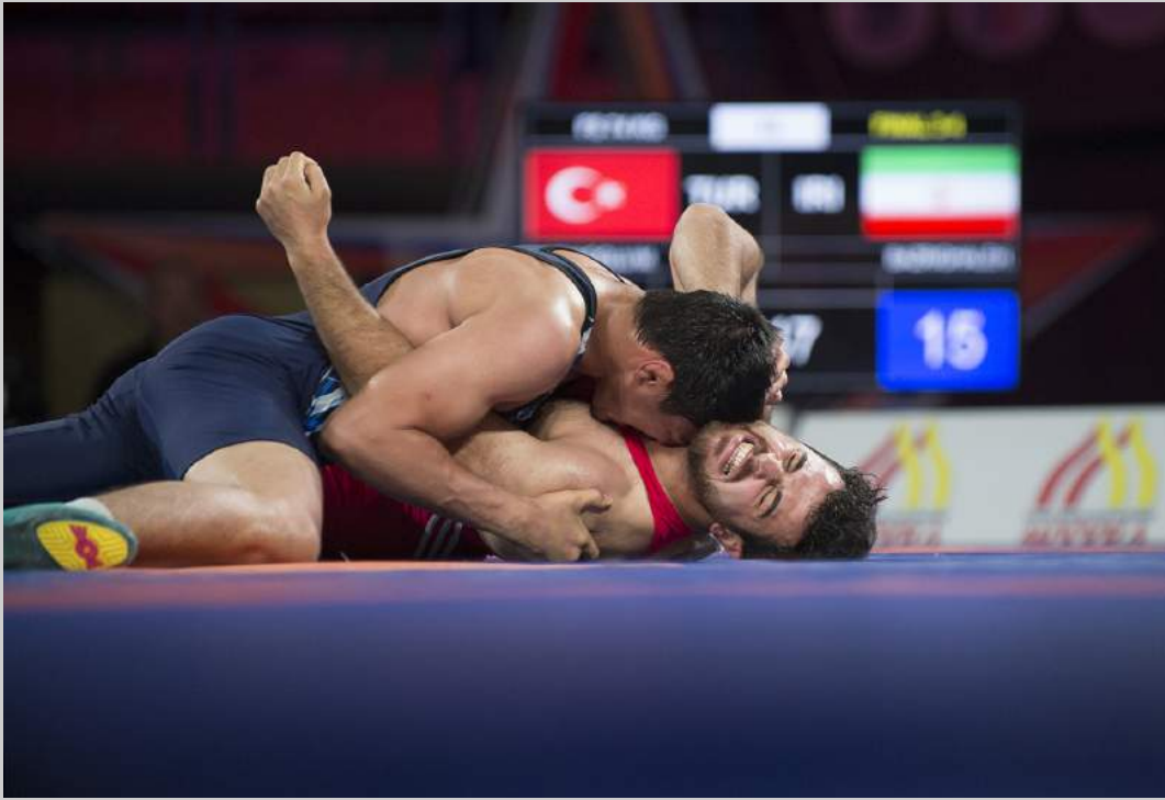
“BITTERNESS OF DEFEAT”  S4C International Exhibition of Photography Photojournalism General