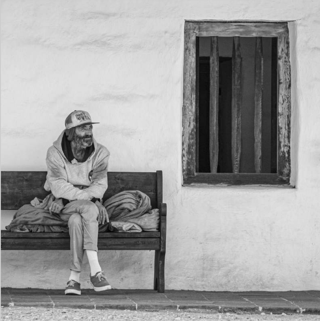
“KILLING TIME” © TERRY MIRANDA 2019 S4C International Exhibition of Photography Photojournalism Human Interest