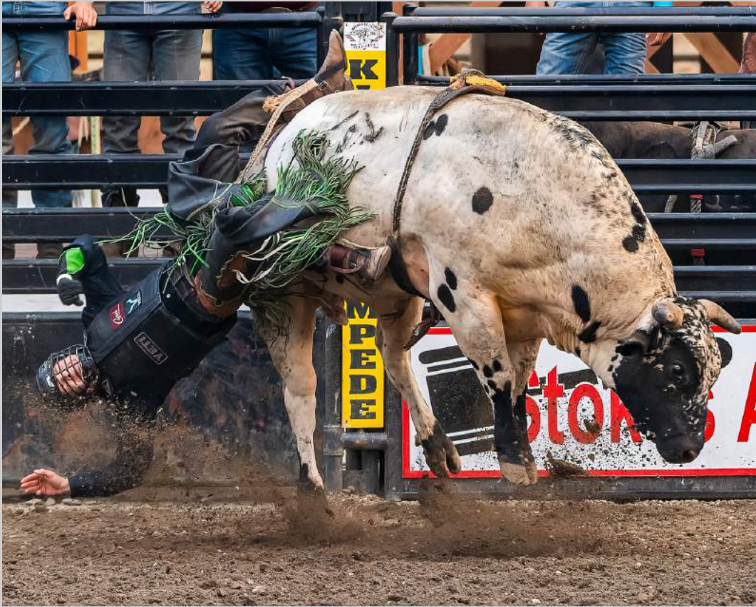
“REAR EXIT” S4C International Exhibition of Photography Photojournalism General S4C Bronze