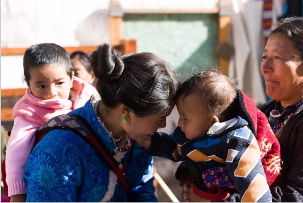
“FAMILY INTERACTION” S4C International Exhibition of Photography Photojournalism Human Interest