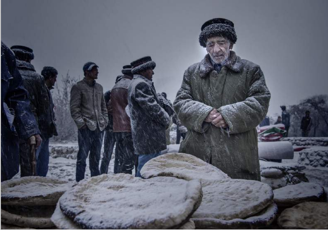
“FESTIVAL OF SHOGUN BAHAR1” © XINXIN CHEN, GMPSA/B 2019 S4C International Exhibition of Photography Photojournalism General