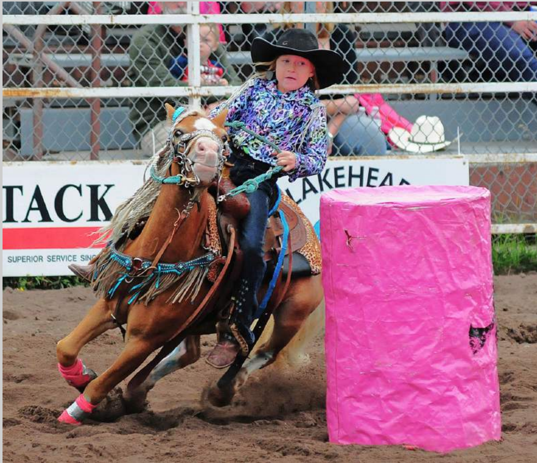
“FUTURE RODEO QUEEN” 2019 S4C International Exhibition of Photography Photojournalism General