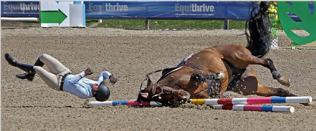
“EPIC FAIL AT EQUESTRIAN EVENT 3159” © CHARLES STRICKER 2019 S4C International Exhibition of Photography Photojournalism General