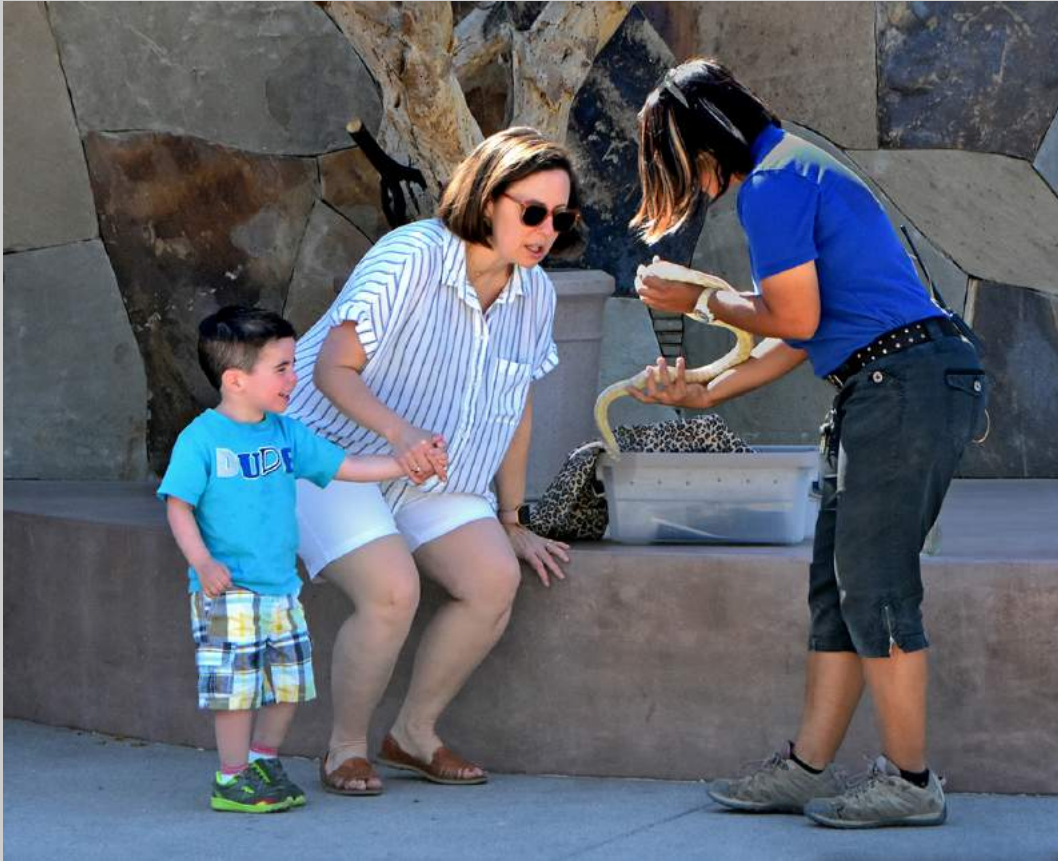
“OH MY WORD IT'S ALIVE” S4C International Exhibition of Photography Photojournalism Human Interest