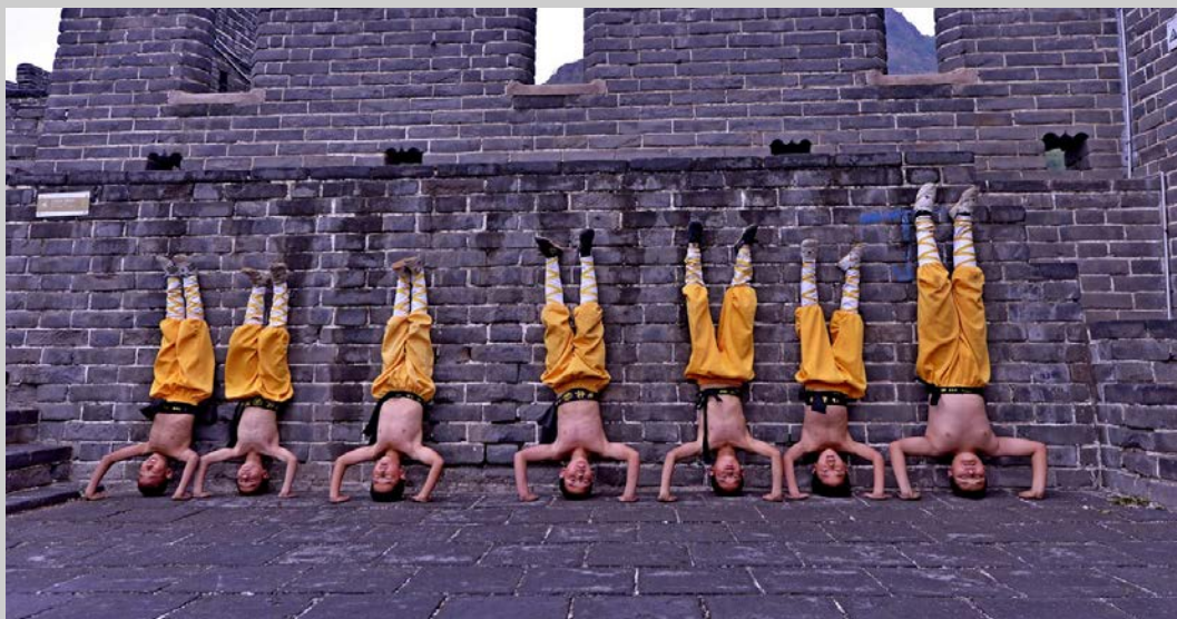
“MORNING EXERCISE OF THE CHILDREN” S4C International Exhibition of Photography Photojournalism Human Interest