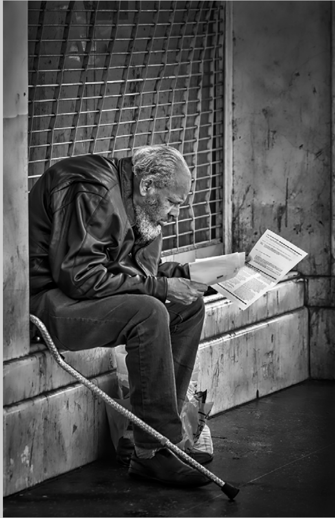
“A CONCERNING LETTER” © INGE VAUTRIN 2017 S4C International Exhibition of Photography Photojournalism Human Interest HM