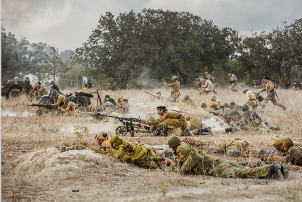
“ONWARDS-HISTORICAL RE-ENACTMEN” S4C International Exhibition of Photography Photojournalism Human Interest