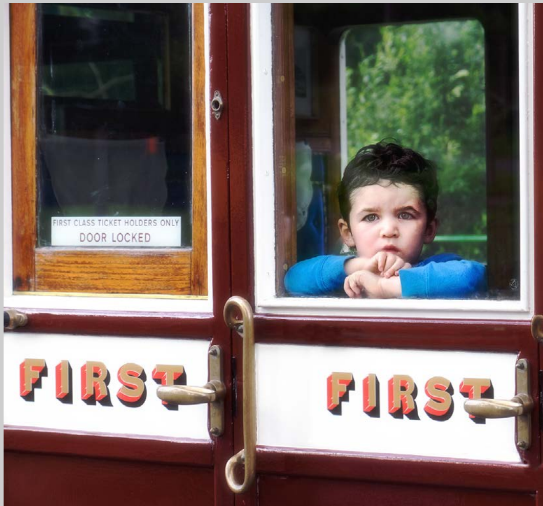
“FIRST CLASS TRAVELLER” S4C International Exhibition of Photography Photojournalism Human Interest