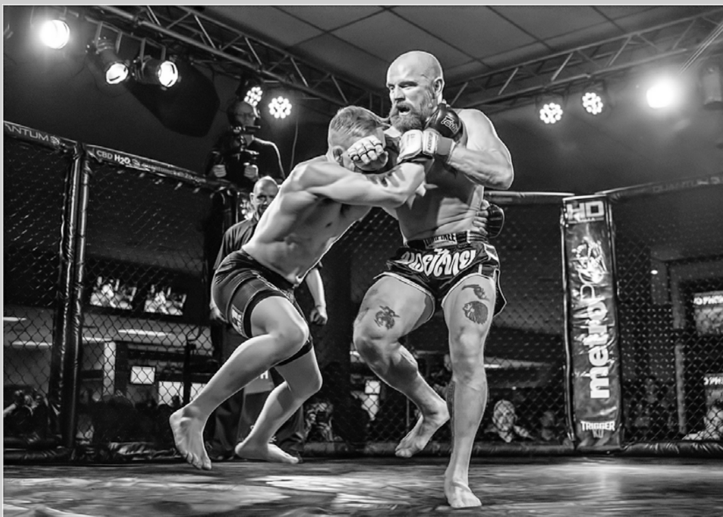
“CHOKE HOLD” 2017 S4C International Exhibition of Photography Photojournalism General