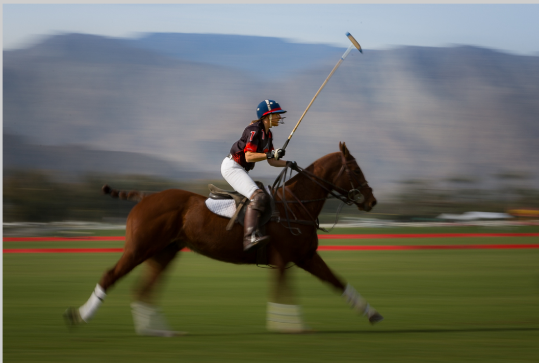
“POLO RIDER IN MOTION” S4C International Exhibition of Photography Photojournalism General