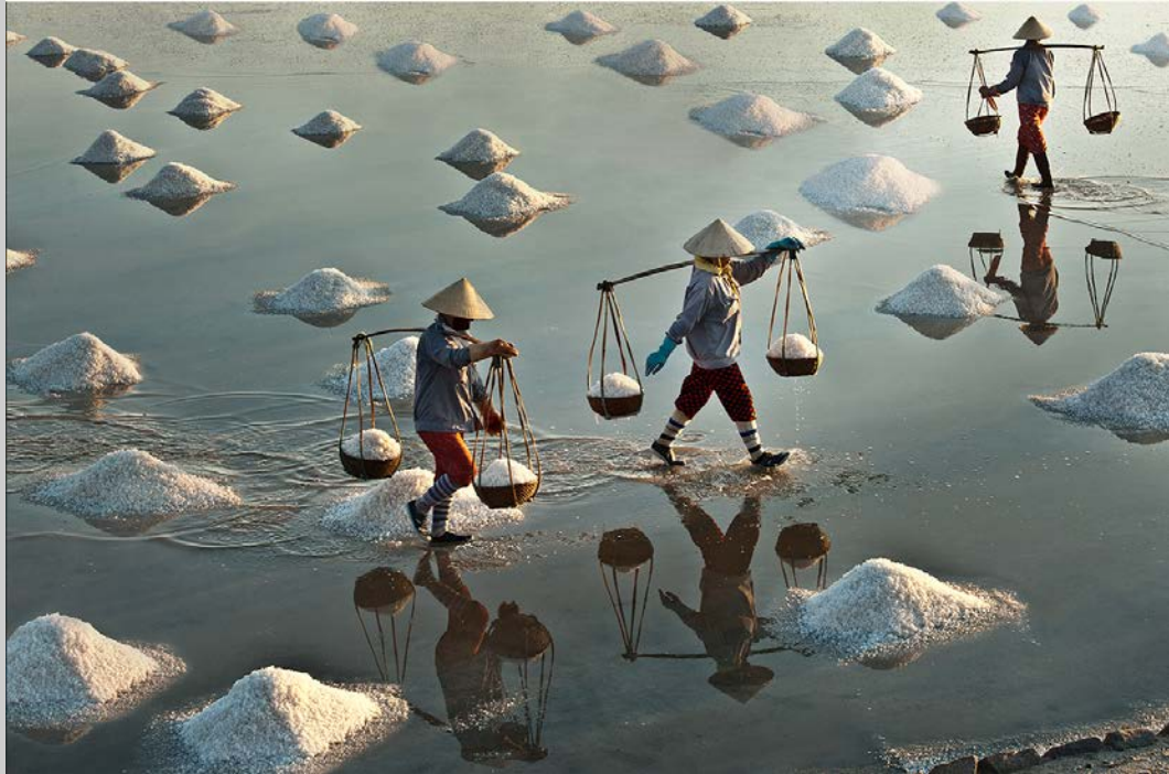
“HARVEST SALT 2” © DUY TUONG NGUYEN, EPSA 2017 S4C International Exhibition of Photography Photojournalism Human Interest