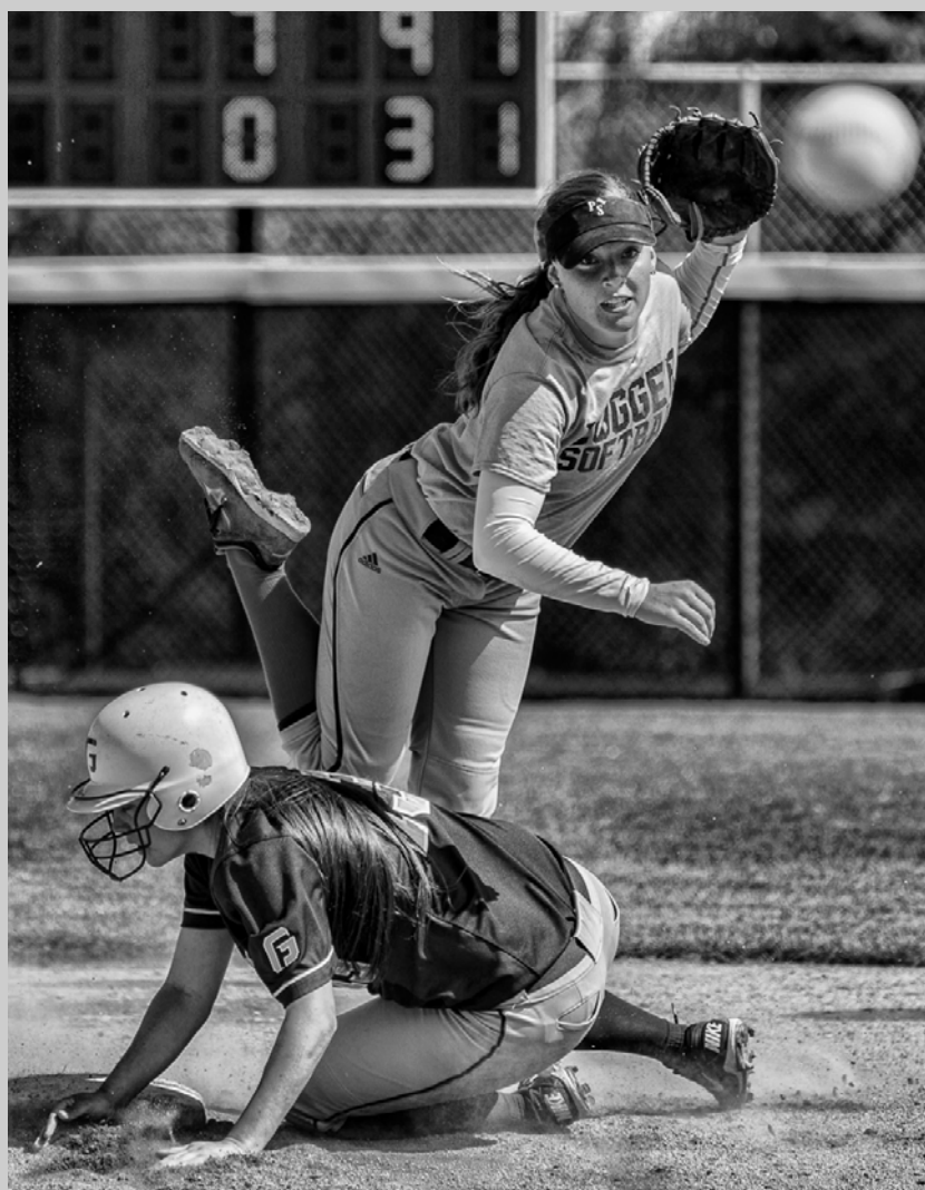
“TURNING THE DOUBLE” S4C International Exhibition of Photography Photojournalism General