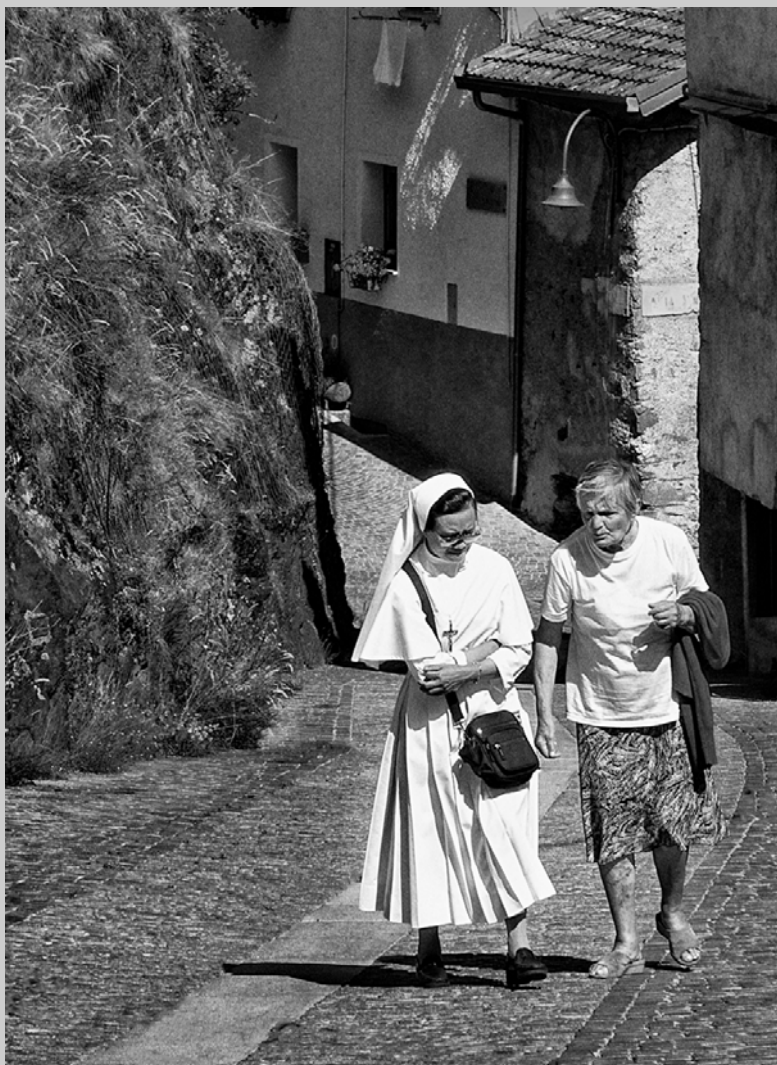
“SERIOUS CONVERSATION” © DIANA MAGOR, MPSA 2017 S4C International Exhibition of Photography Photojournalism Human Interest