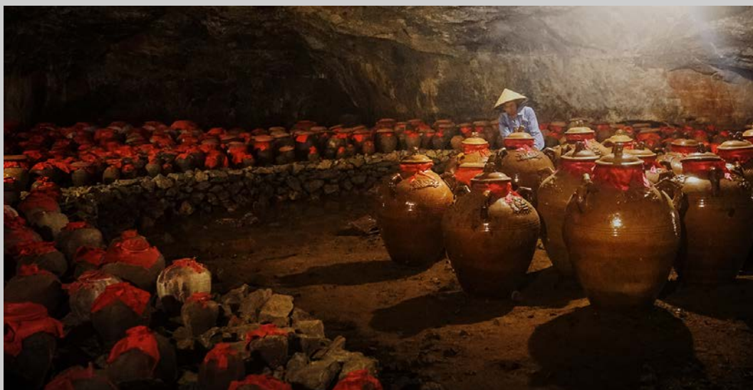
“ACOHOL” © DUY TUONG NGUYEN, EPSA 2017 S4C International Exhibition of Photography Photojournalism Human Interest