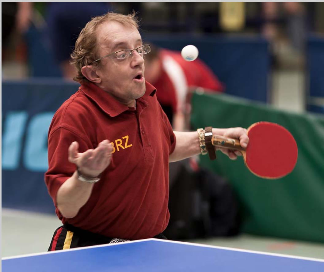
“SURPRISE” © ALOIS BERNKOPF 2017 S4C International Exhibition of Photography Photojournalism General PSA Best of Show Gold