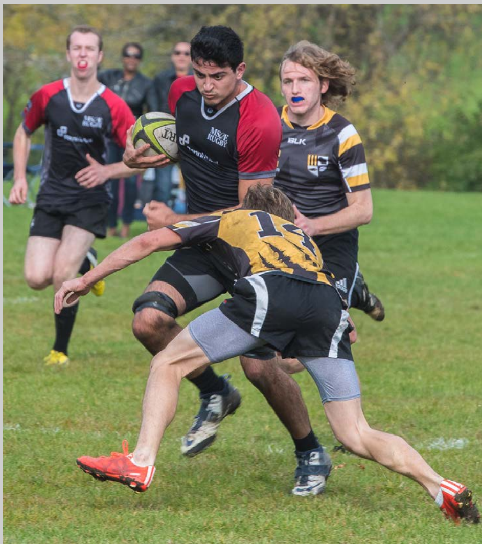
“RUGBY TACKLER SETS” © KARL HOKANSON, PPSA 2017 S4C International Exhibition of Photography Photojournalism General