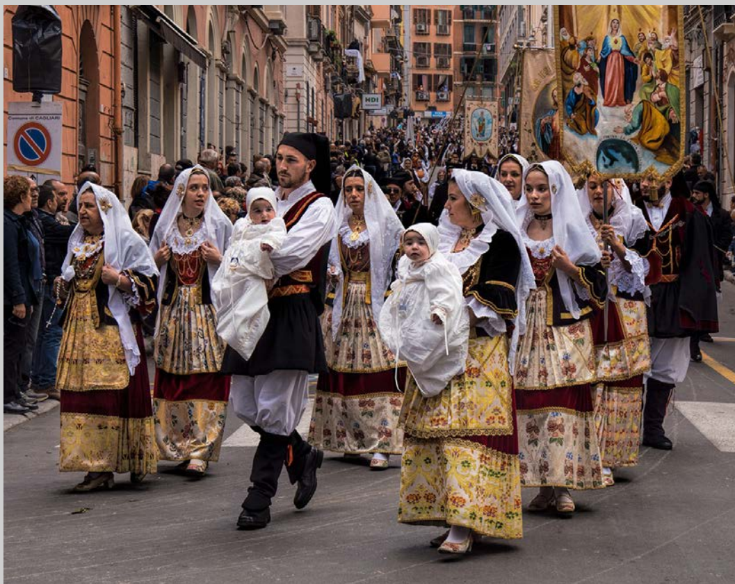
“ST. EFIZIO 1” EPSA 2017 S4C International Exhibition of Photography Photojournalism Human Interest