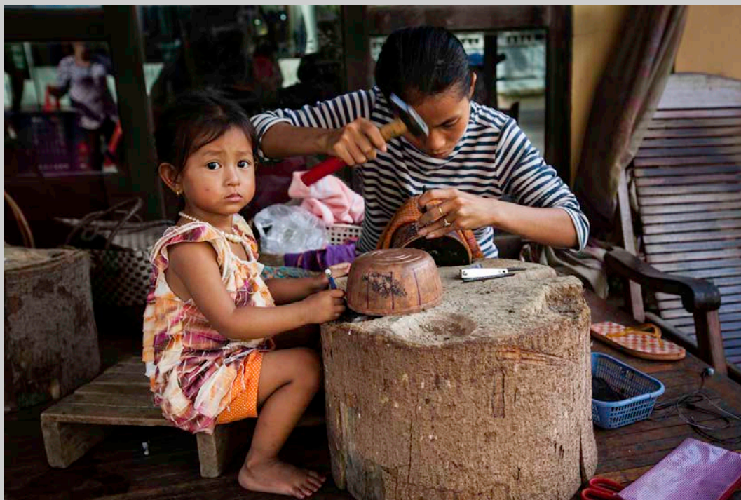
“HELPER” © GERALD FLEURY 2017 S4C International Exhibition of Photography Photojournalism Human Interest