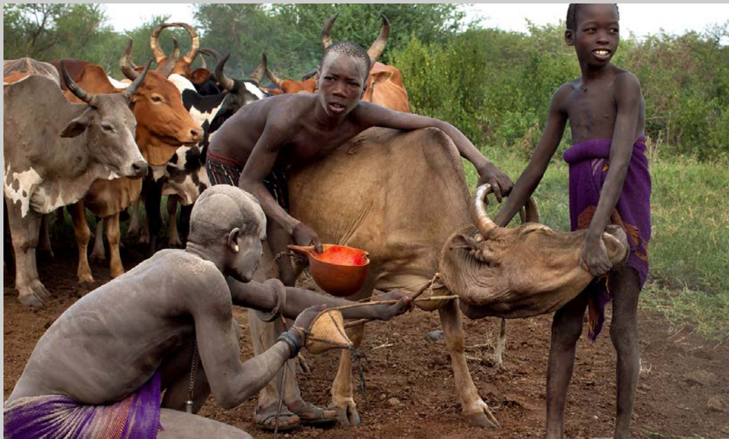
“RITUAL OF TAKING BLOOD” © SERGEY AGAPOV 2017 S4C International Exhibition of Photography Photojournalism General