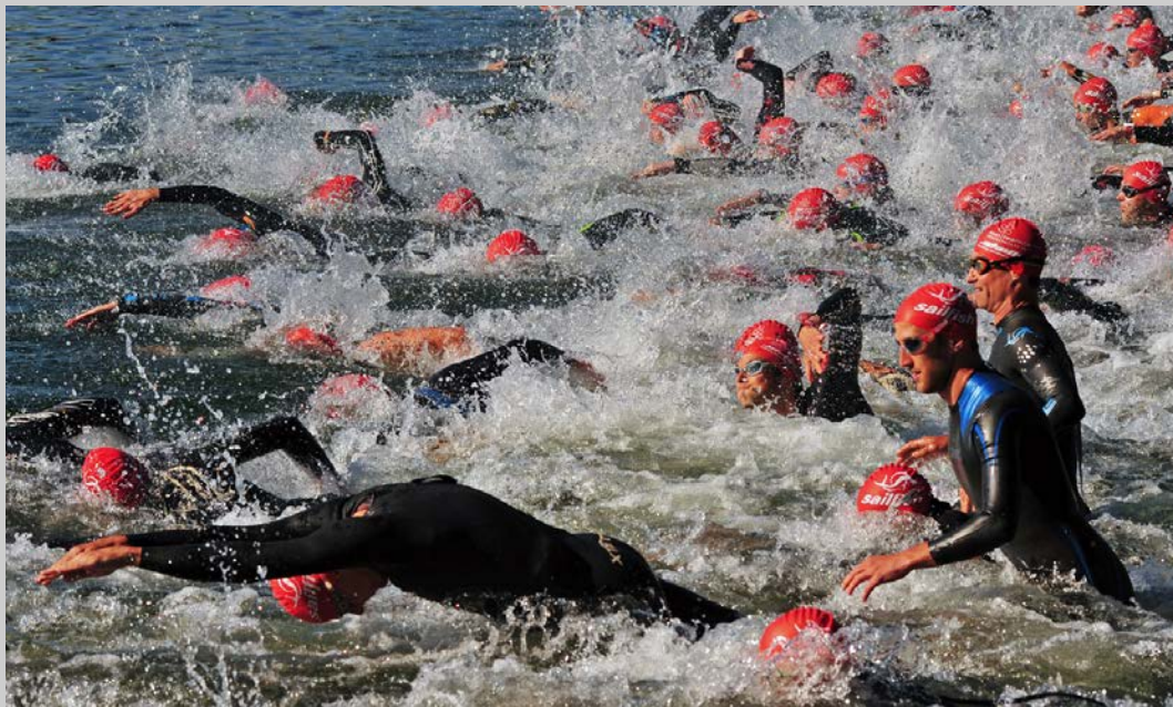
“TRIATHLON START” © GERHARD BOEHM, GMPSA 2017 S4C International Exhibition of Photography Photojournalism General