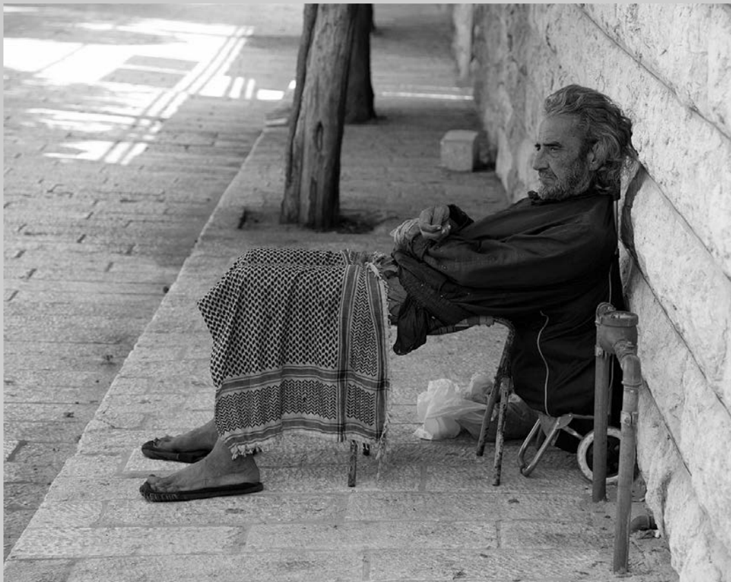
“I LIVE, I’M HERE” © GENADI BRODSKY 2017 S4C International Exhibition of Photography Photojournalism Human Interest