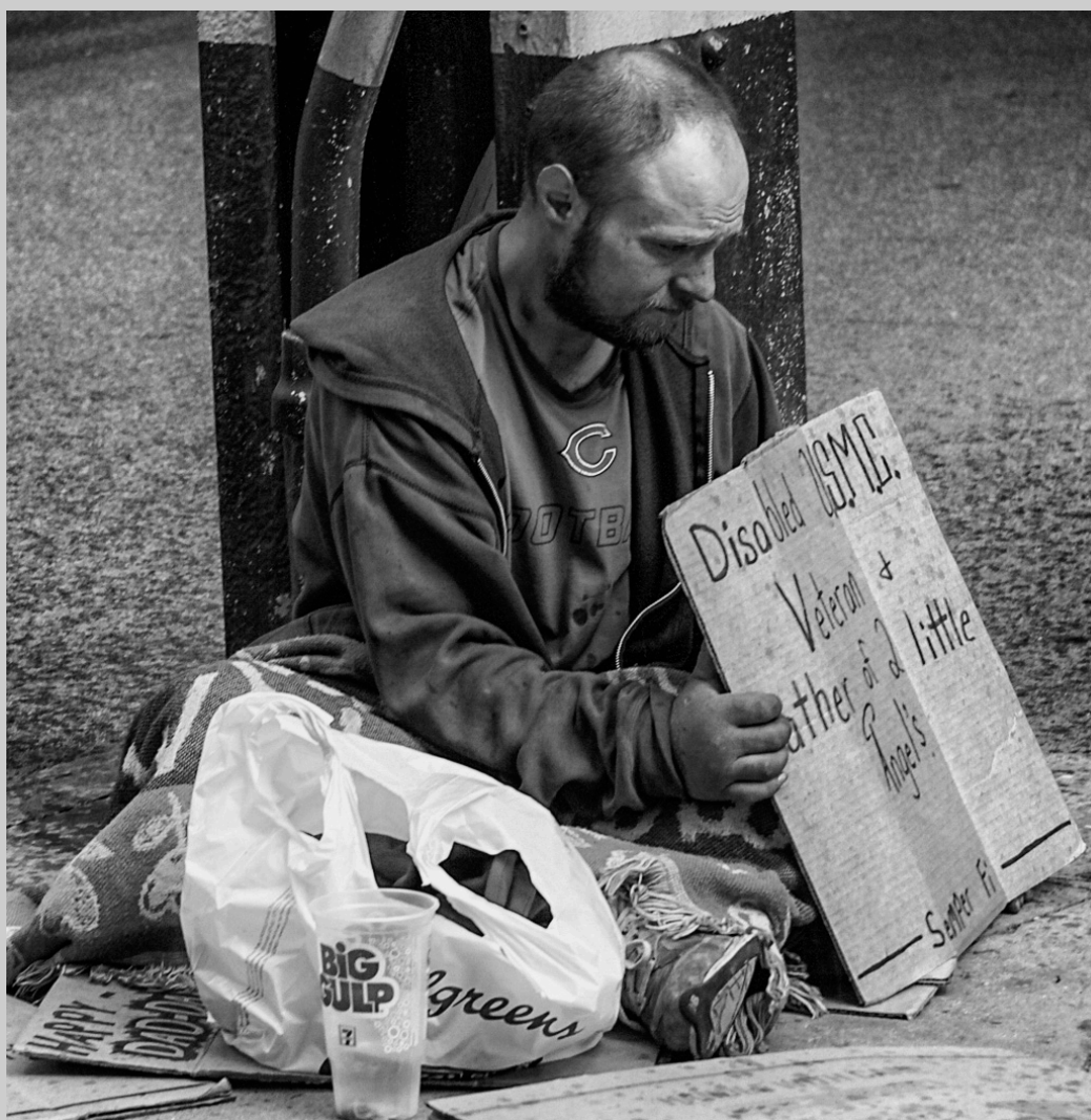
“HOMELESS IN CHICAGO” S4C International Exhibition of Photography Photojournalism Human Interest