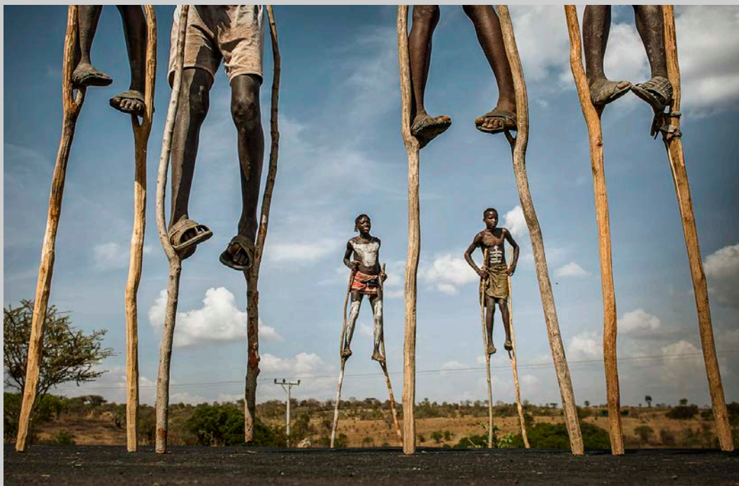
“WALK ON STILTS” © XINXIN CHEN, MPSA 2017 S4C International Exhibition of Photography Photojournalism Human Interest HM