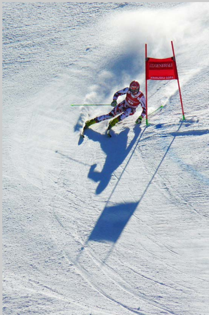
“SKIER WITH SHADDOW” © BOGDAN BRICELJ, MPSA 2017 S4C International Exhibition of Photography Photojournalism General