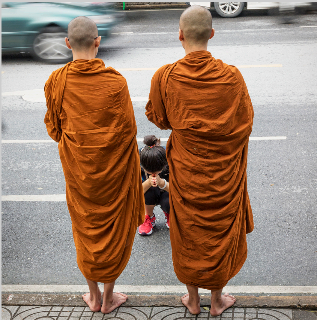
“PRAYING” S4C International Exhibition of Photography Photojournalism Human Interest HM