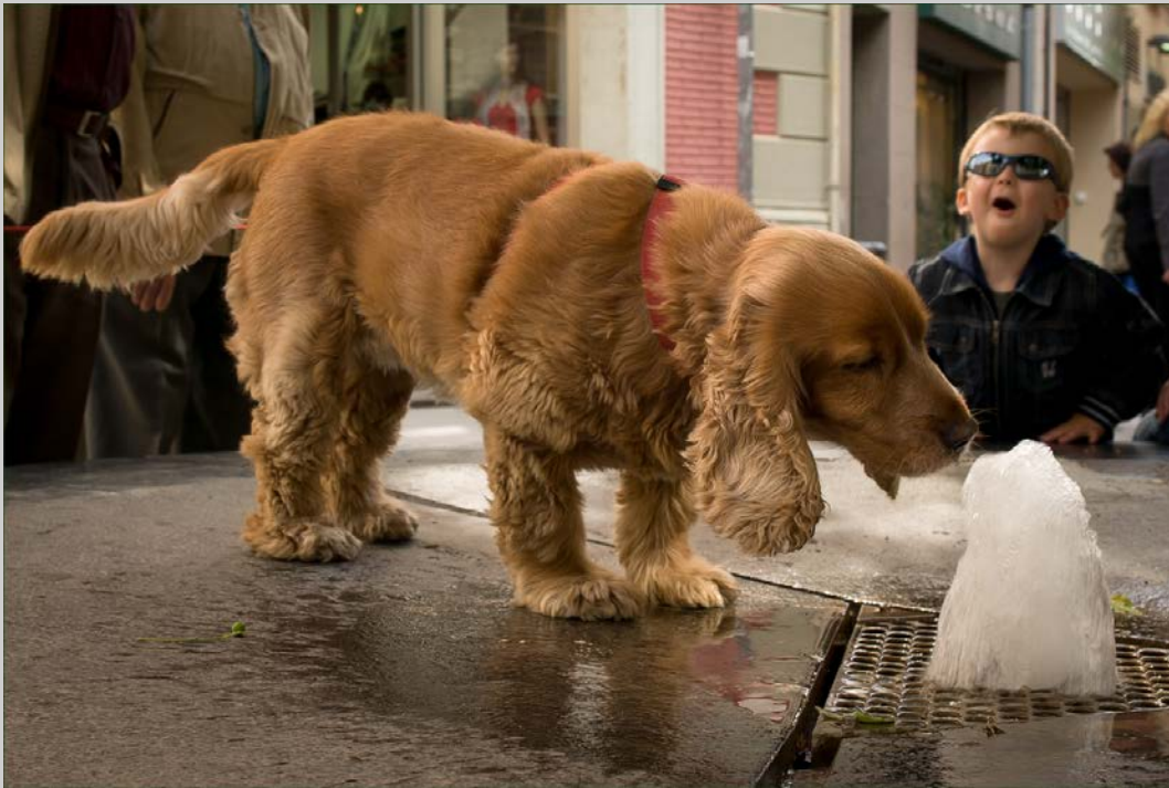
“FOUNTAIN FOR DOGS” © SALVADOR ATANCE, PPSA 2017 S4C International Exhibition of Photography Photojournalism Human Interest