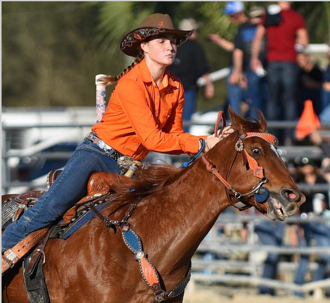
“JUDGED AT THE GALLOP” © BRIAN GRANT, PPSA 2017 S4C International Exhibition of Photography Photojournalism General