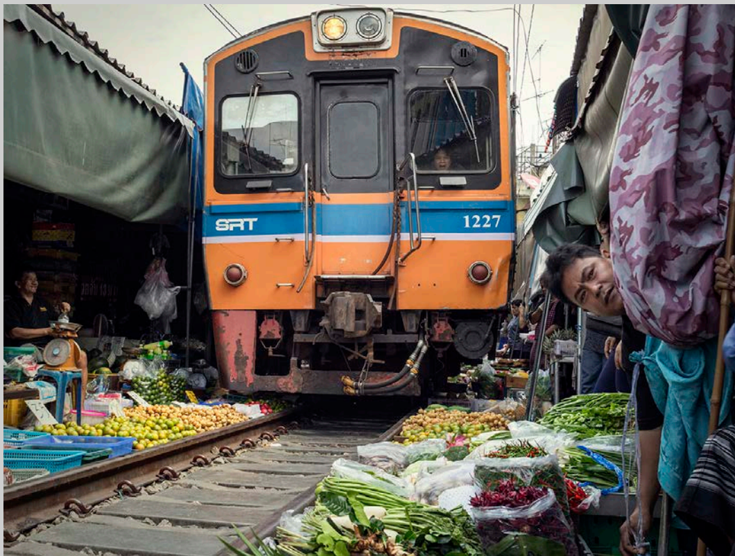
“WATCH YOUR HEAD” S4C International Exhibition of Photography Photojournalism Human Interest