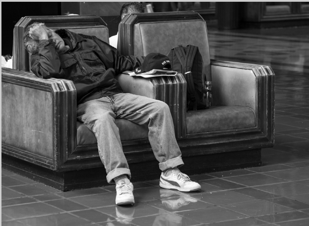
“NY TO LA” S4C International Exhibition of Photography Photojournalism Human Interest