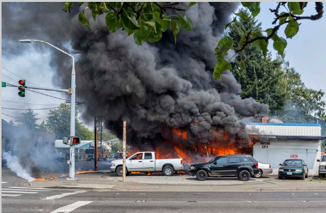
“MOTOR CITY FIRE” 2017 S4C International Exhibition of Photography Photojournalism General