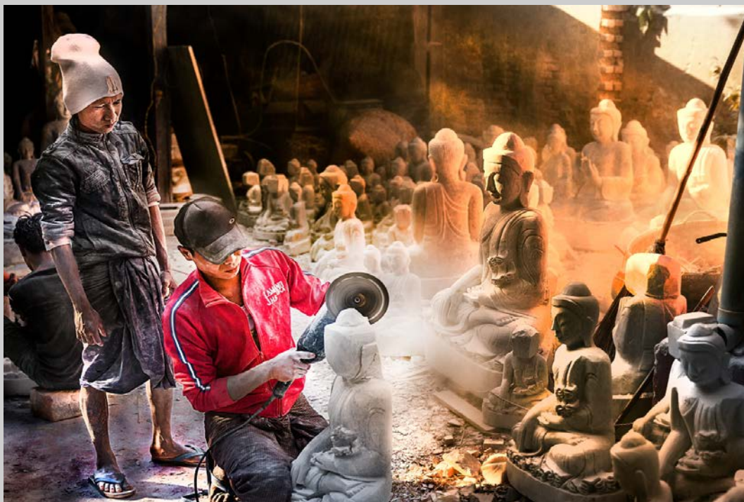
“BUDDHA MAKERS” © WENDY WAI MAN LAM 2017 S4C International Exhibition of Photography Photojournalism Human Interest