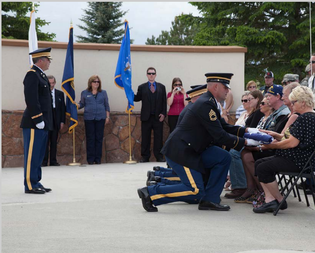
“SIX LAID TO REST” © KEN MURPHY, APSA, EPSA 2017 S4C International Exhibition of Photography Photojournalism Human Interest