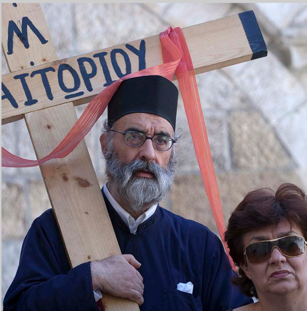
“CARRY YOUR CROSS” S4C International Exhibition of Photography Photojournalism General