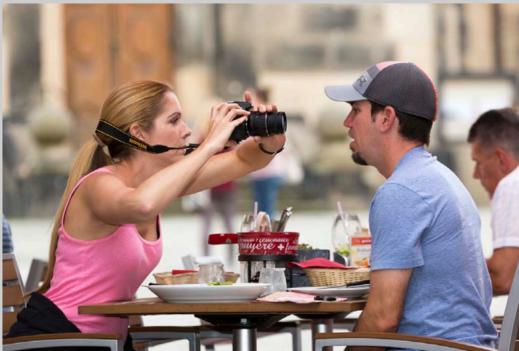
“PHOTOGRAPH” S4C International Exhibition of Photography Photojournalism Human Interest