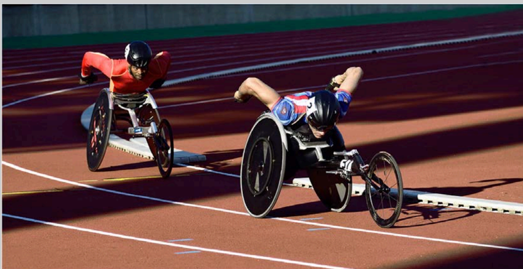
“LAST TURN” © GUY B. SAMOYAUULT, APSA, GMPSA 2017 S4C International Exhibition of Photography Photojournalism General