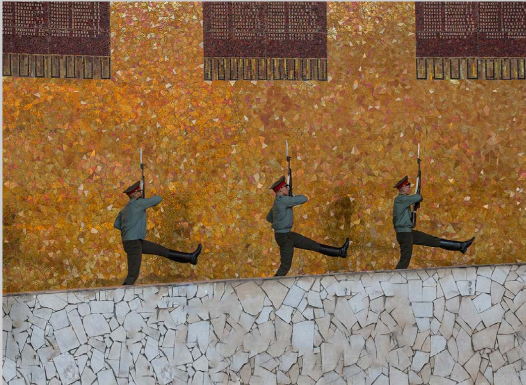
“CEREMONY” © ALOIS BERNKOPF 2017 S4C International Exhibition of Photography Photojournalism General