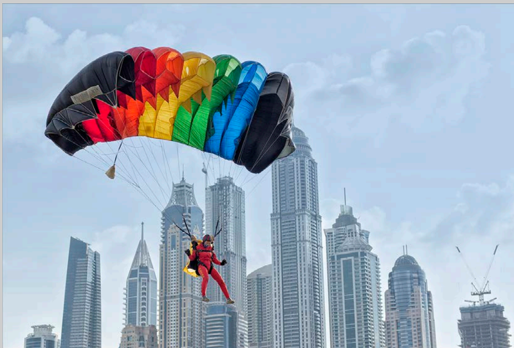
“SKYDIVE DUBAI 3” EPSA 2017 S4C International Exhibition of Photography Photojournalism General HM