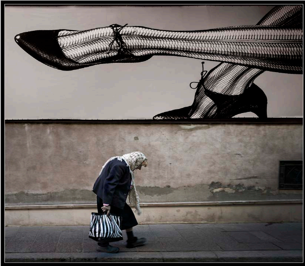
“FASHIONABLE SHOE” S4C International Exhibition of Photography Photojournalism Human Interest PSA Best of Show Gold