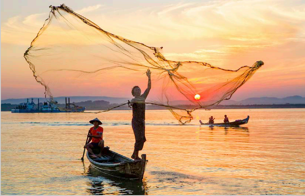
“NET CASTING 4” © PHILLIP KWAN, GMPSA/B 2017 S4C International Exhibition of Photography Photojournalism General