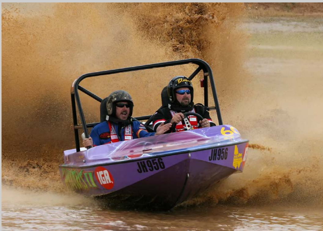
“THAT WAY” © ANN SMALLEGANGE 2017 S4C International Exhibition of Photography Photojournalism General