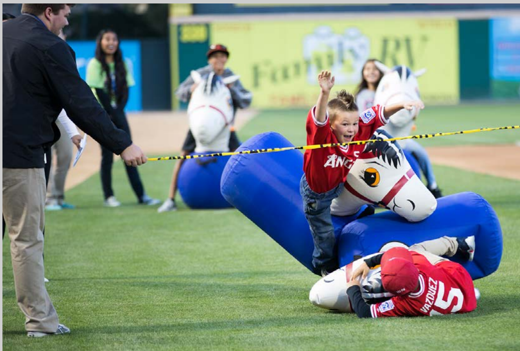
“PONY RACE AT THE BASEBALL FIELD” © DEBORAH VERHOLTZ 2017 S4C International Exhibition of Photography Photojournalism General