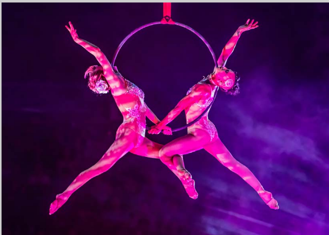
“PERFORMERS 7B17” S4C International Exhibition of Photography Photojournalism General HM