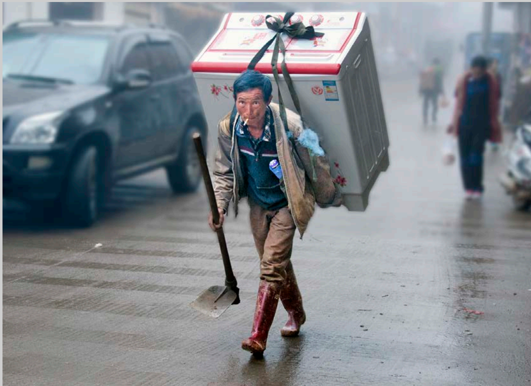
“PORTER” © ZEE KEK HENG, GMPA 2017 S4C International Exhibition of Photography Photojournalism General