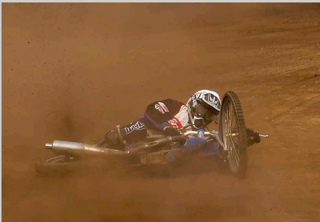
“STOFFIGE VAL” © JHONY VANDEBROECK, MPSA 2017 S4C International Exhibition of Photography Photojournalism General