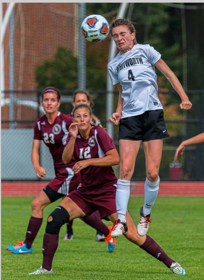
“GRIMACING HEADER” S4C International Exhibition of Photography Photojournalism General