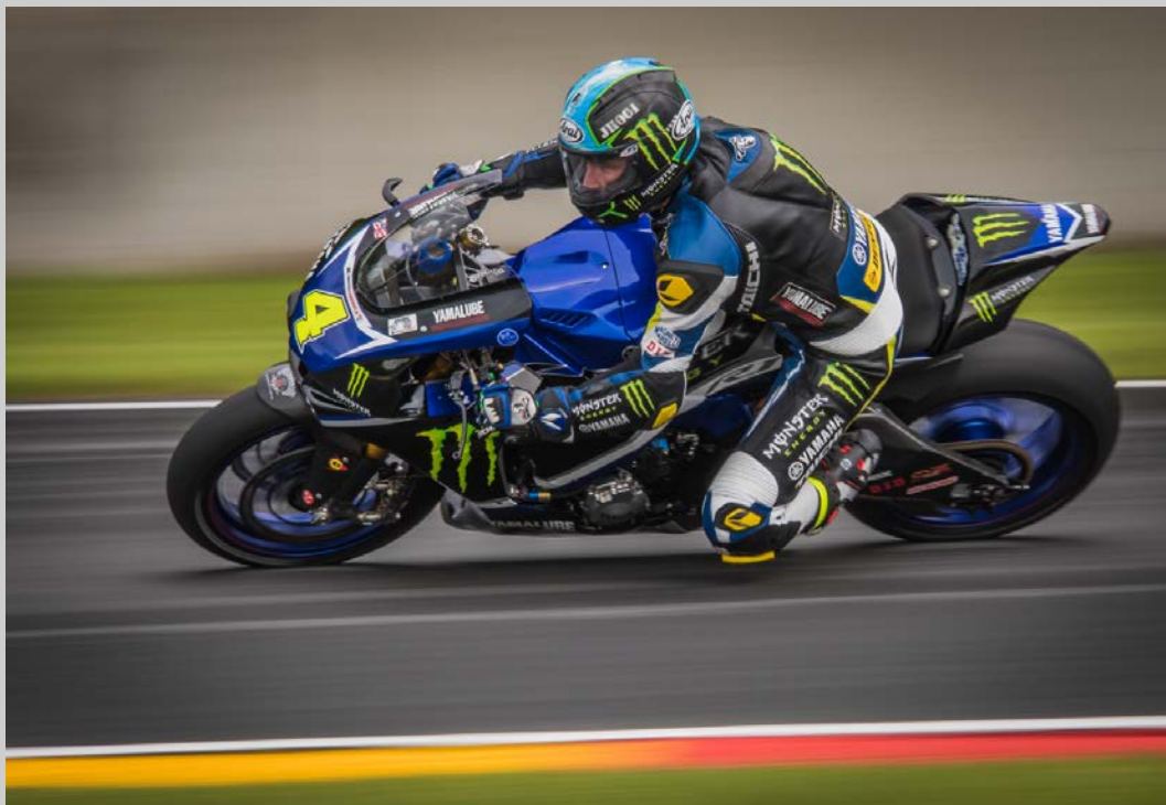
“BIKE 4” S4C International Exhibition of Photography Photojournalism General