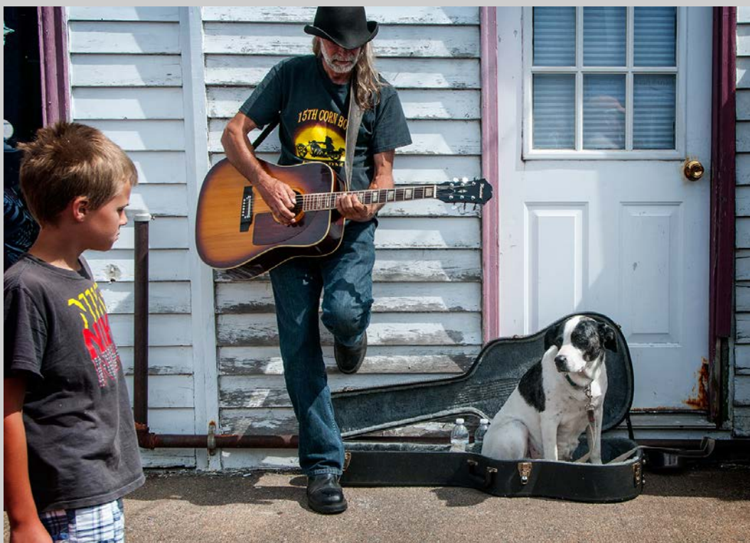
“MUSICIAN AND POOCH 9726” 2017 S4C International Exhibition of Photography Photojournalism Human Interest