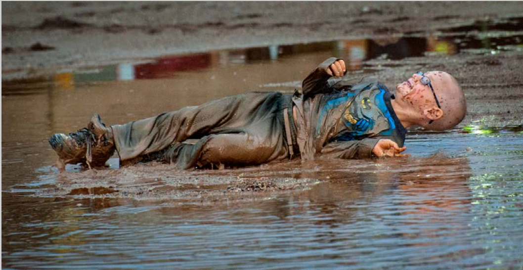
“BATH IN CENTRE RING 9779” © VIKI GAUL, APSA, PPSA 2017 S4C International Exhibition of Photography Photojournalism Human Interest Judge’s Choice