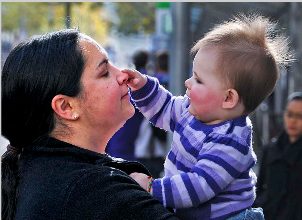
“TENDER TOUCH” 2017 S4C International Exhibition of Photography Photojournalism General