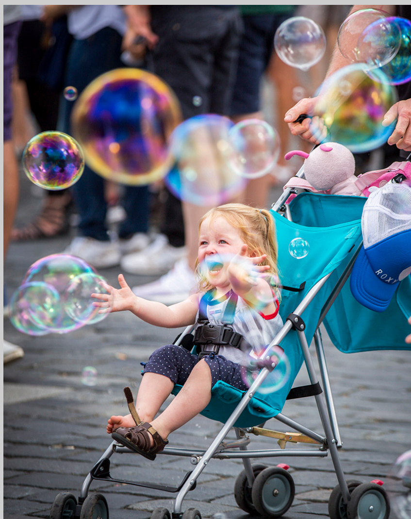
“HAPPY” © XUEZHONG DUAN 2017 S4C International Exhibition of Photography Photojournalism Human Interest S4C Bronze