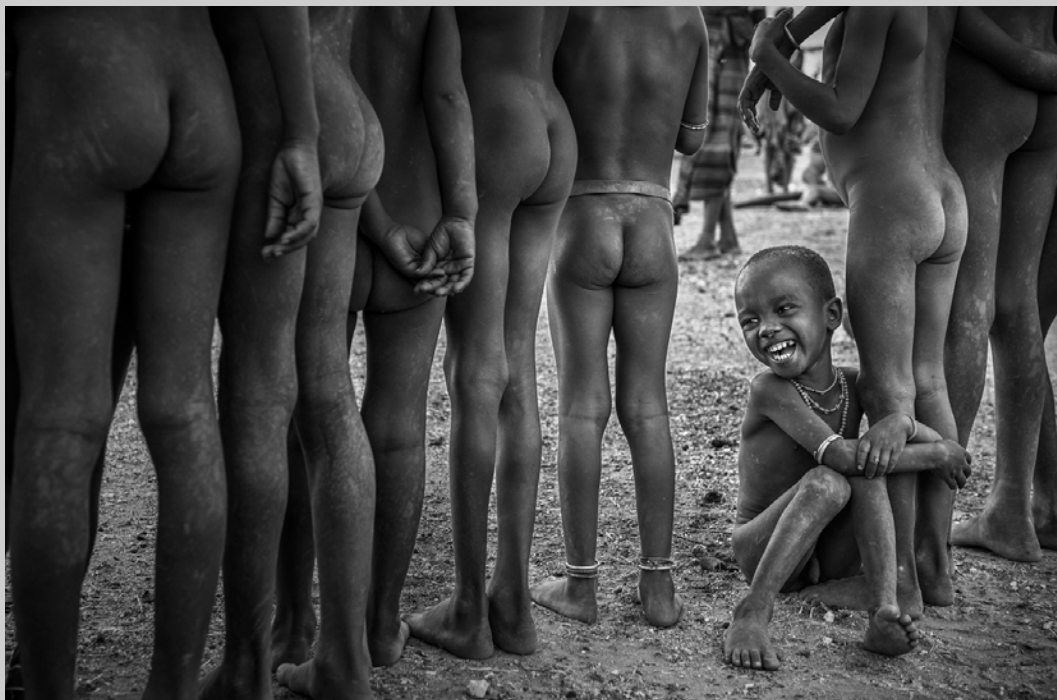
“A BROAD SMILE” © XINXIN CHEN, MPSA 2017 S4C International Exhibition of Photography Photojournalism Human Interest S4C Gold