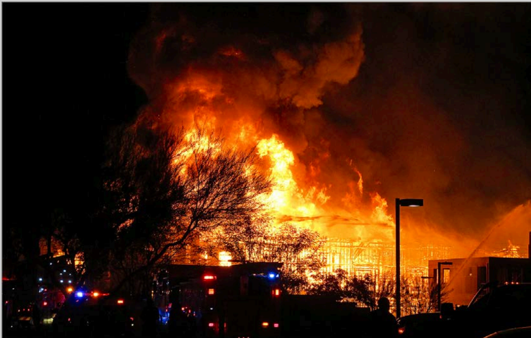
“FULLY INVOLVED_0157” S4C International Exhibition of Photography Photojournalism General