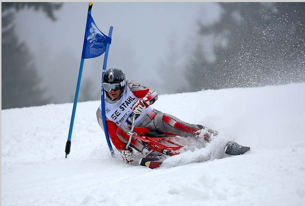
"MICHAEL" S4C International Exhibition of Photography Photojournalism General S4C Bronze