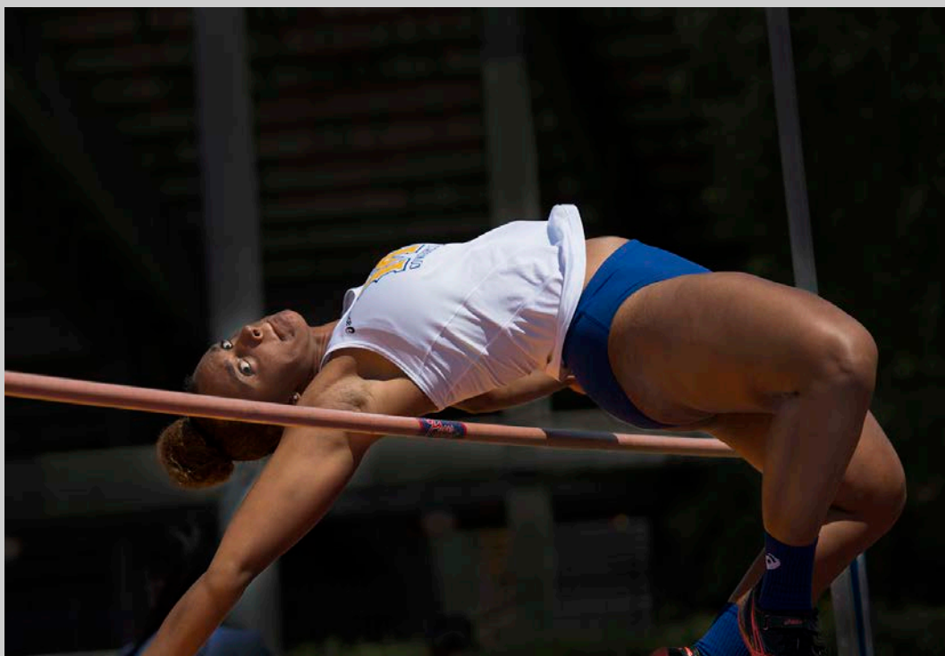
“BAR FIXATION” © SHU CHEUK, MPSA 2017 S4C International Exhibition of Photography Photojournalism General