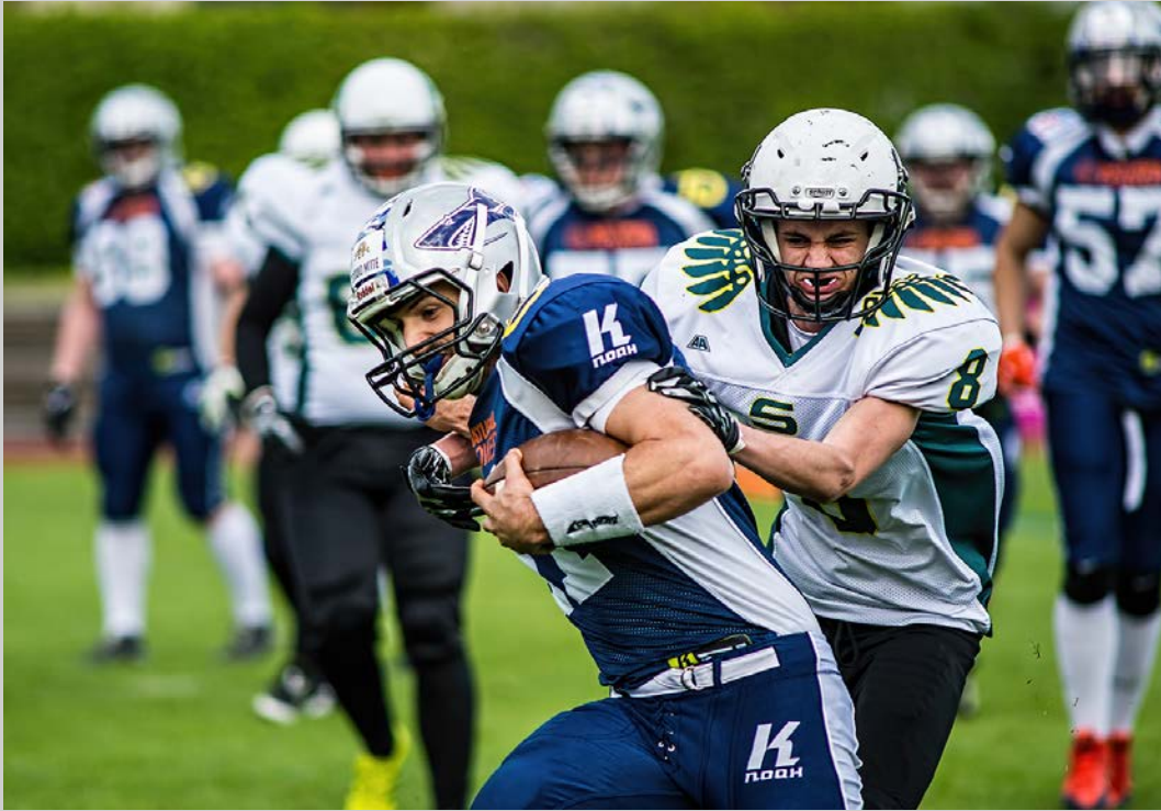
“AMERICAN FOOTBALL_1” S4C International Exhibition of Photography Photojournalism General