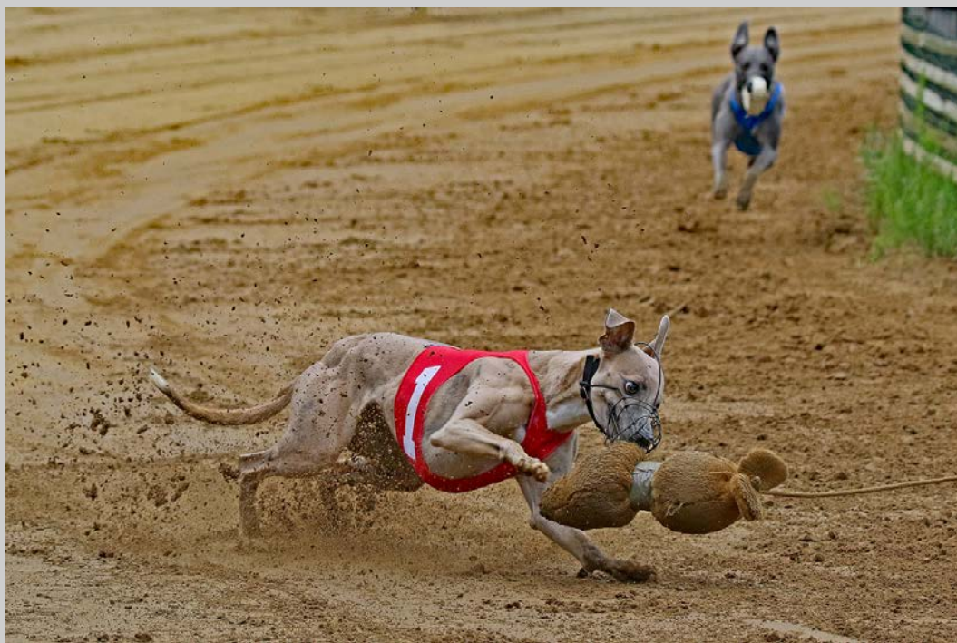
“NO ONE TAKES ME THE RABBIT” © WOLFGANG KAEDING, GMP 2017 S4C International Exhibition of Photography Photojournalism General