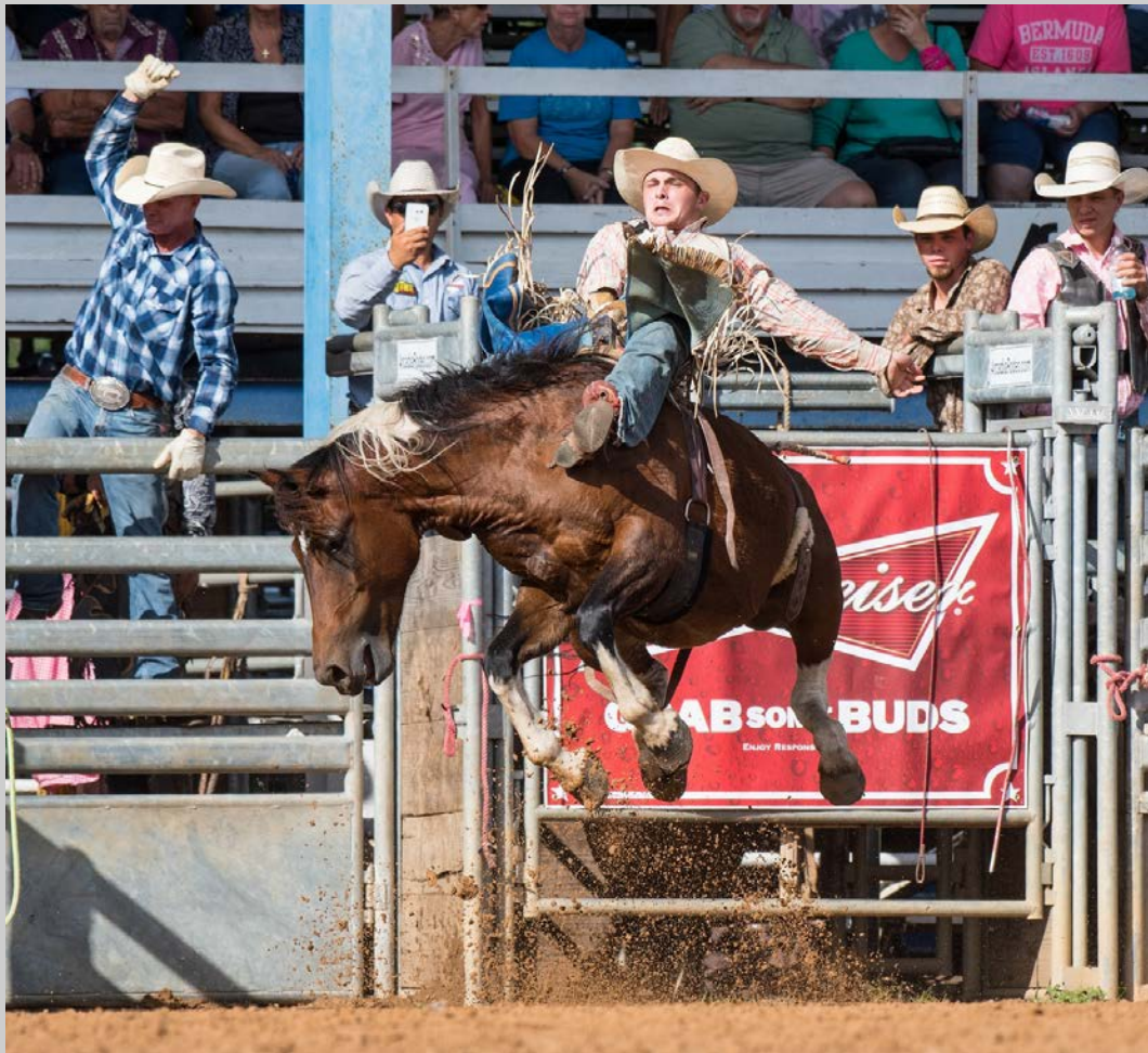
“BAREBACK BRONC RIDER 51” © BRIAN GRANT, PPSA 2017 S4C International Exhibition of Photography Photojournalism General HM