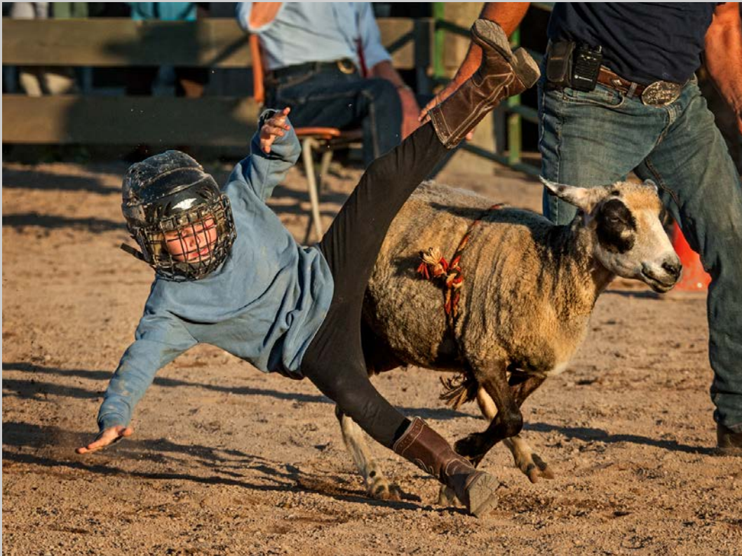
“MISS BROWN BOOTS TAKES A DIVE 2807” © VIKI GAUL, APSA, PPSA 2017 S4C International Exhibition of Photography Photojournalism General