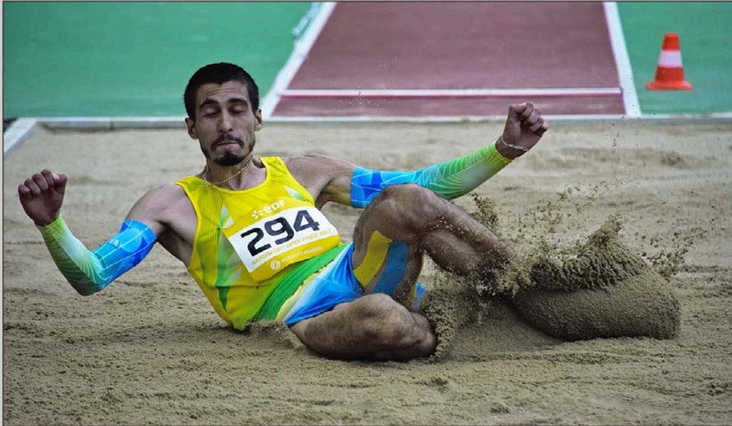
“LONG JUMP 294” © GUY B. SAMOYAUULT, APSA, GMPSA 2017 S4C International Exhibition of Photography Photojournalism General