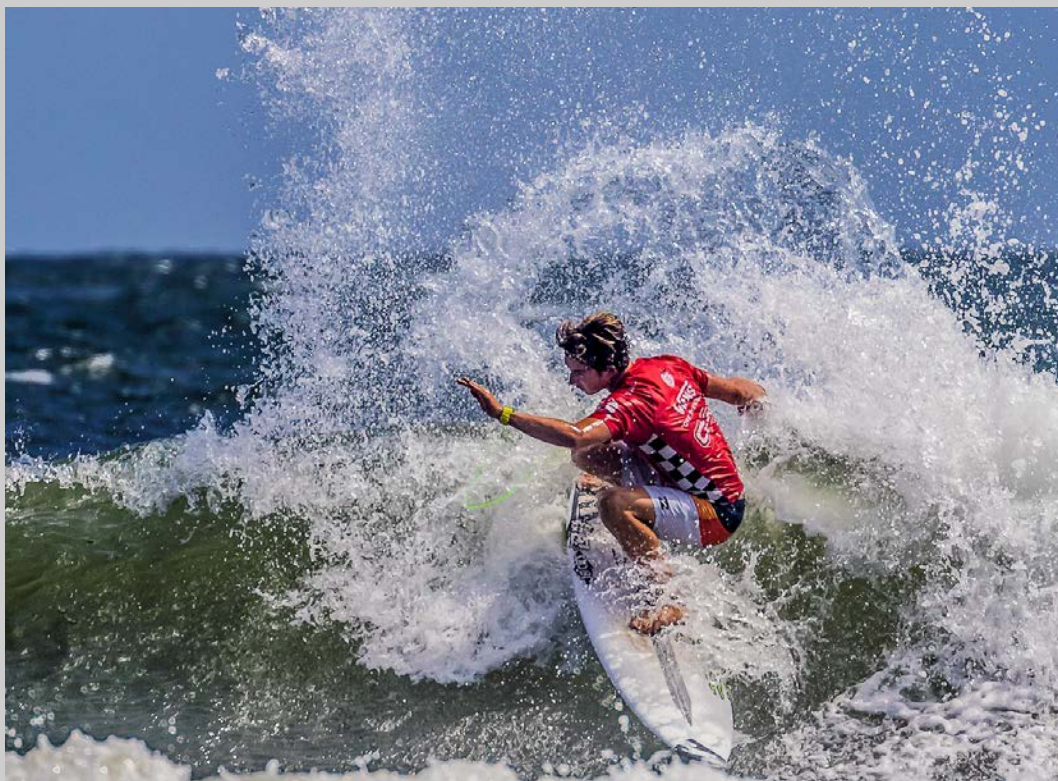
“SURFING VA BEACH 6B07” S4C International Exhibition of Photography Photojournalism General Judge’s Choice