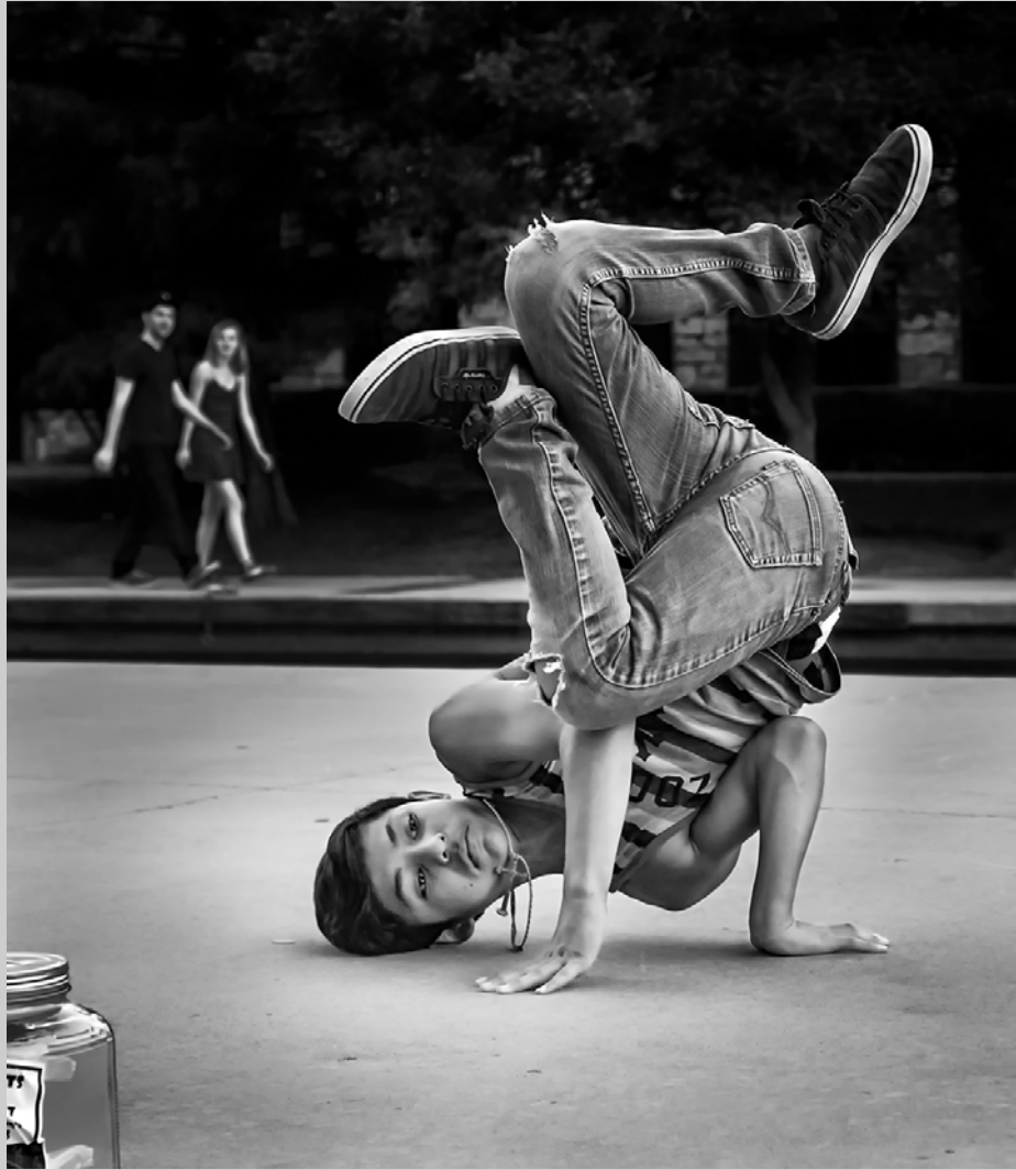
“BREAKDANCING II” © INGE VAUTRIN 2017 S4C International Exhibition of Photography Photojournalism General