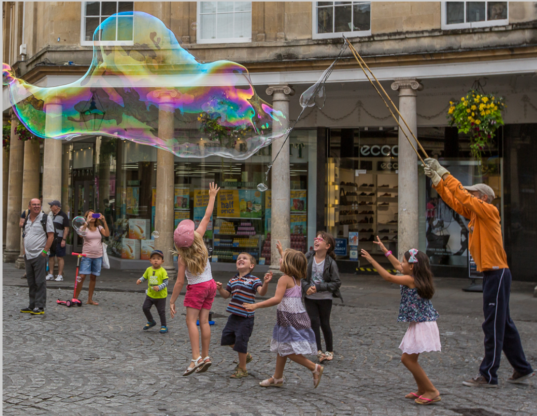
“BUBBLE MAN” S4C International Exhibition of Photography Photojournalism Human Interest