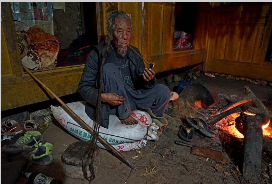
“LIANGSHAN MAN” © LANFENG CHEN 2017 S4C International Exhibition of Photography Photojournalism General