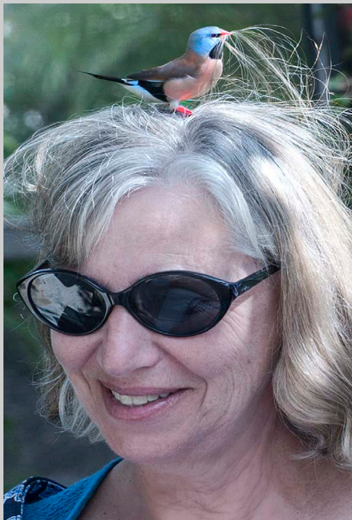
“GATHERING NESTING MATERIAL” 2017 S4C International Exhibition of Photography Photojournalism Human Interest