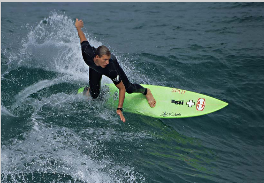
“TWISTED SURFER” © DAVID MEISENHEIMER, FPSA, GMPSA 2017 S4C International Exhibition of Photography Photojournalism General