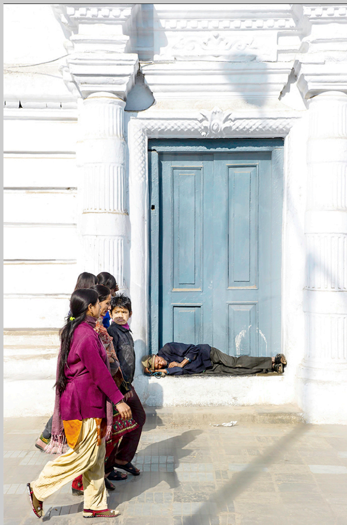
“YOU OUTDOOR IS MY HOME” S4C International Exhibition of Photography Photojournalism Human Interest