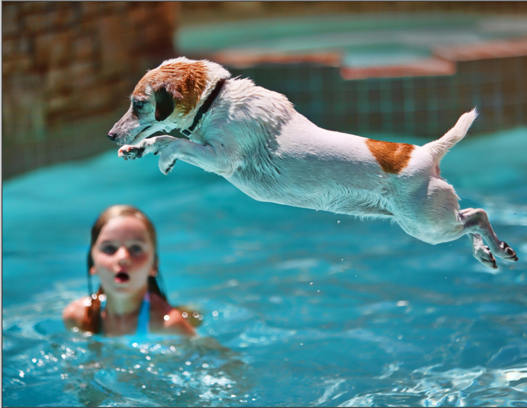
“WOW” S4C International Exhibition of Photography Photojournalism Human Interest