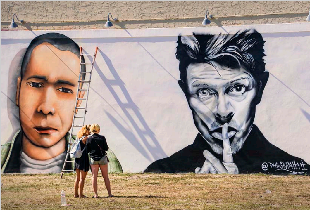
“OUTDOOR ART” 2017 S4C International Exhibition of Photography Photojournalism General