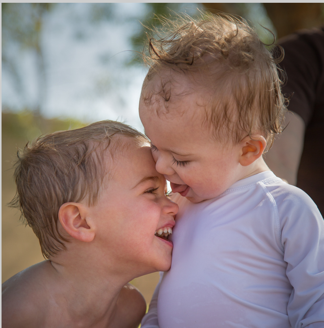
“COUSINS PLAY” S4C International Exhibition of Photography Photojournalism Human Interest