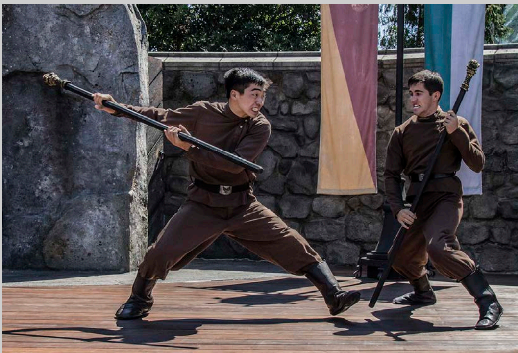
“TOURNAMENT OF CHAMPION GUYS” S4C International Exhibition of Photography Photojournalism General