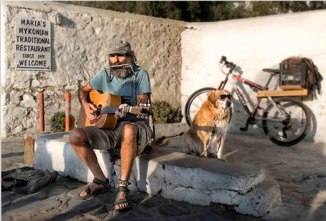
“MUSICIAN W HIS PATRON” © JAMES WAT 2017 S4C International Exhibition of Photography Photojournalism Human Interest S4C Bronze