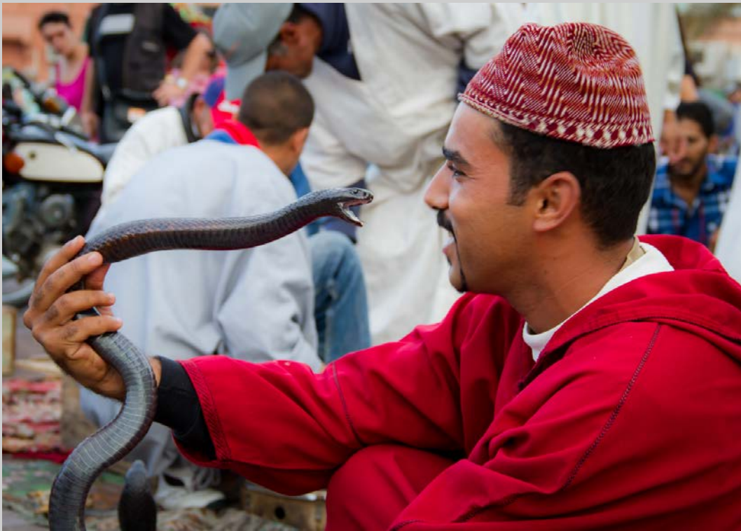
“VIS A VIS” © JANOS DEMETER, PPSA 2017 S4C International Exhibition of Photography Photojournalism General