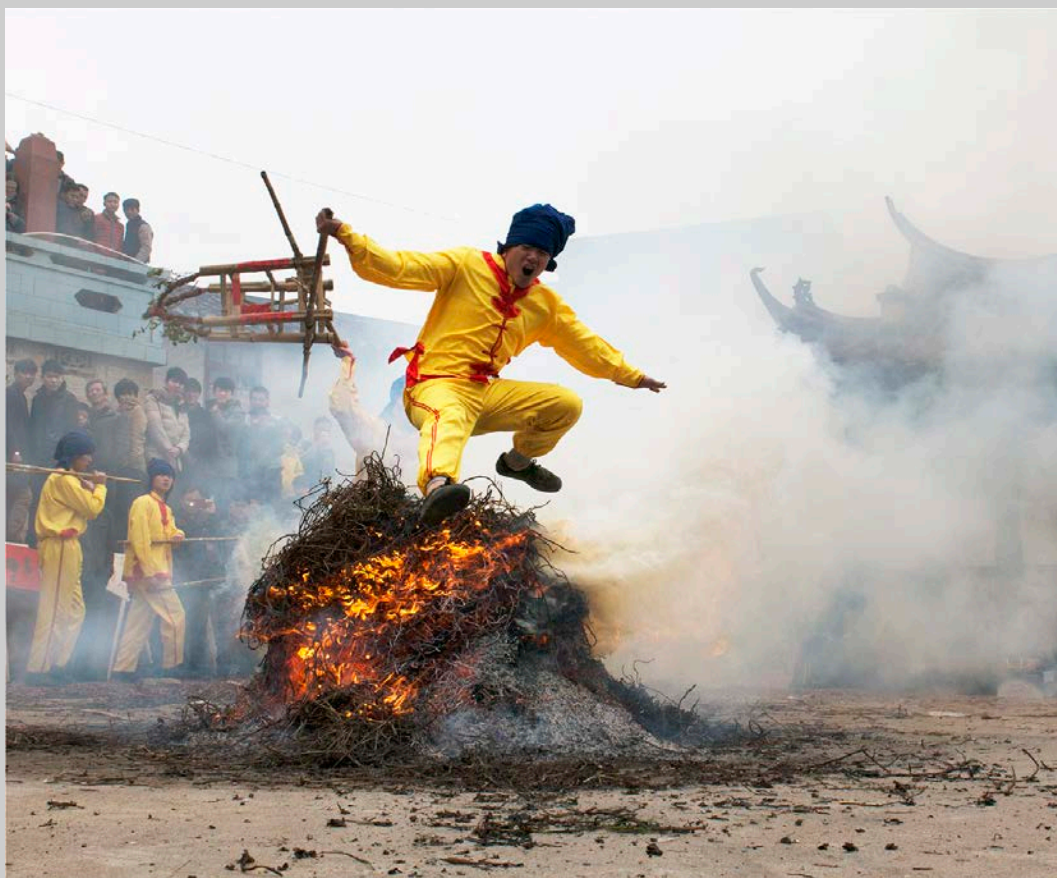
“JUMP FIRE 39” © YI WAN, MPSA 2017 S4C International Exhibition of Photography Photojournalism General