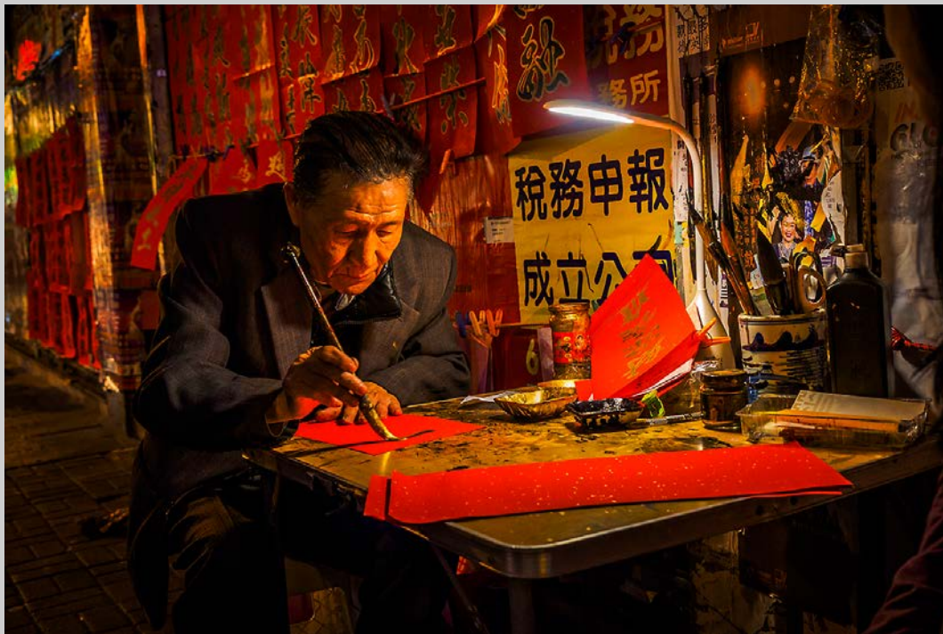
“FAI CHUN WRITING 1” © WOLFGANG LIN, PPSA 2017 S4C International Exhibition of Photography Photojournalism General