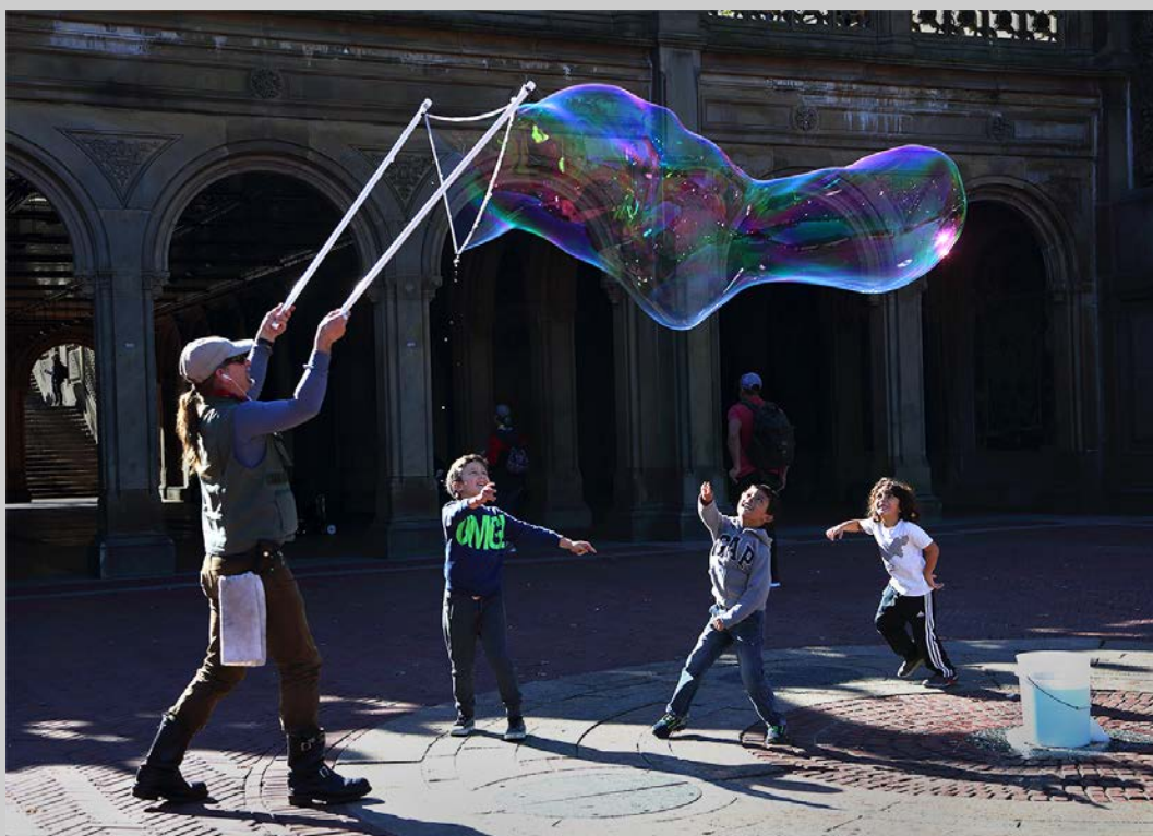
“BOYS PLAYING” © WENYUAN LI, EPSA 2017 S4C International Exhibition of Photography Photojournalism General