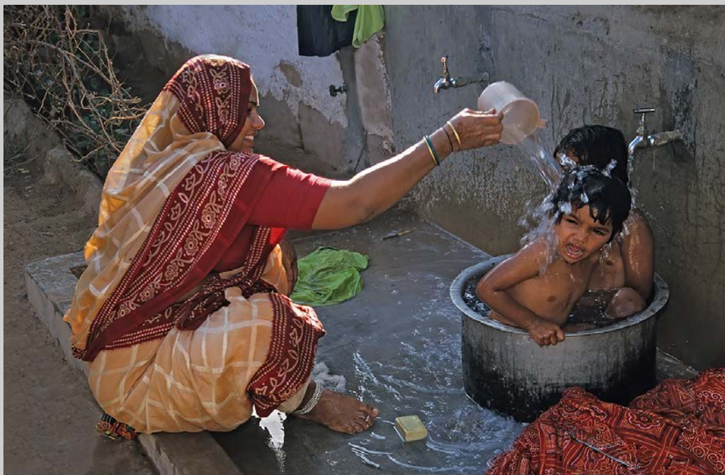
“RINSING MY HAIR” © DAVID MEISENHEIMER, FPSA, GMPA 2017 S4C International Exhibition of Photography Photojournalism Human Interest