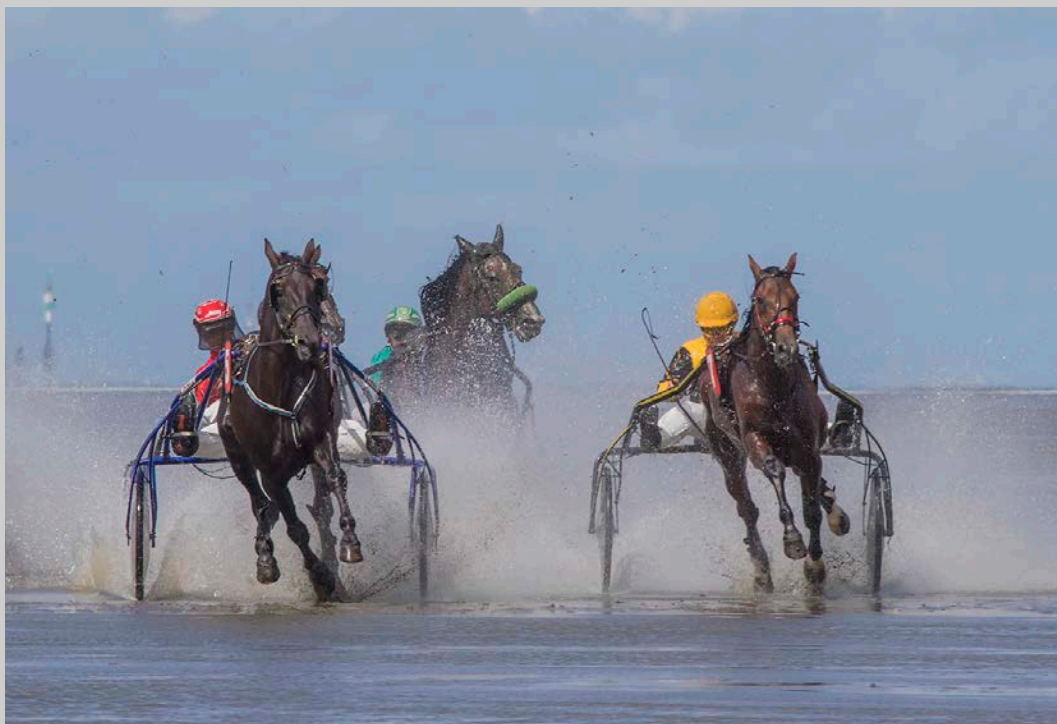
“SPRINT IN WATER” 2017 S4C International Exhibition of Photography Photojournalism General