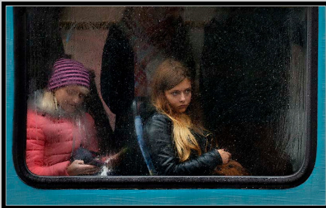
“DAILY TRAIN” © LEONID GOLDIN 2017 S4C International Exhibition of Photography Photojournalism Human Interest HM