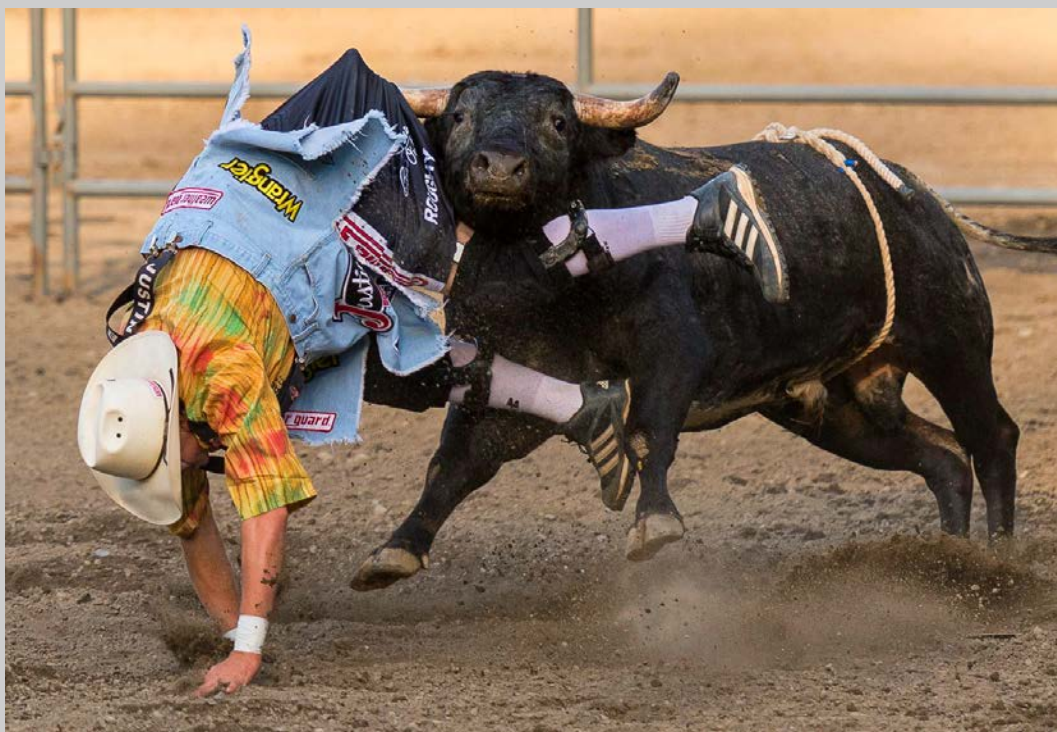
"IN THE SHORTS" © KURT DEVOE 2017 S4C International Exhibition of Photography Photojournalism General HM