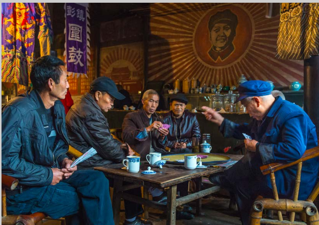
“HERE IS MY ACE” © FRANCIS KING, MPSA 2017 S4C International Exhibition of Photography Photojournalism Human Interest