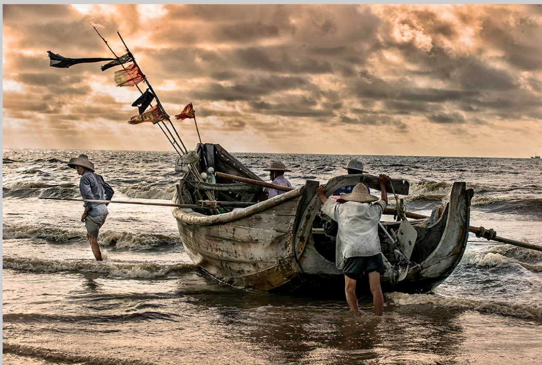
“WORKING HARD SINCE DAWN” S4C International Exhibition of Photography Photojournalism Human Interest