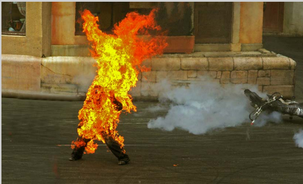
“MAN ON FIRE” © JOHN LARRY 2017 S4C International Exhibition of Photography Photojournalism General S4C Gold