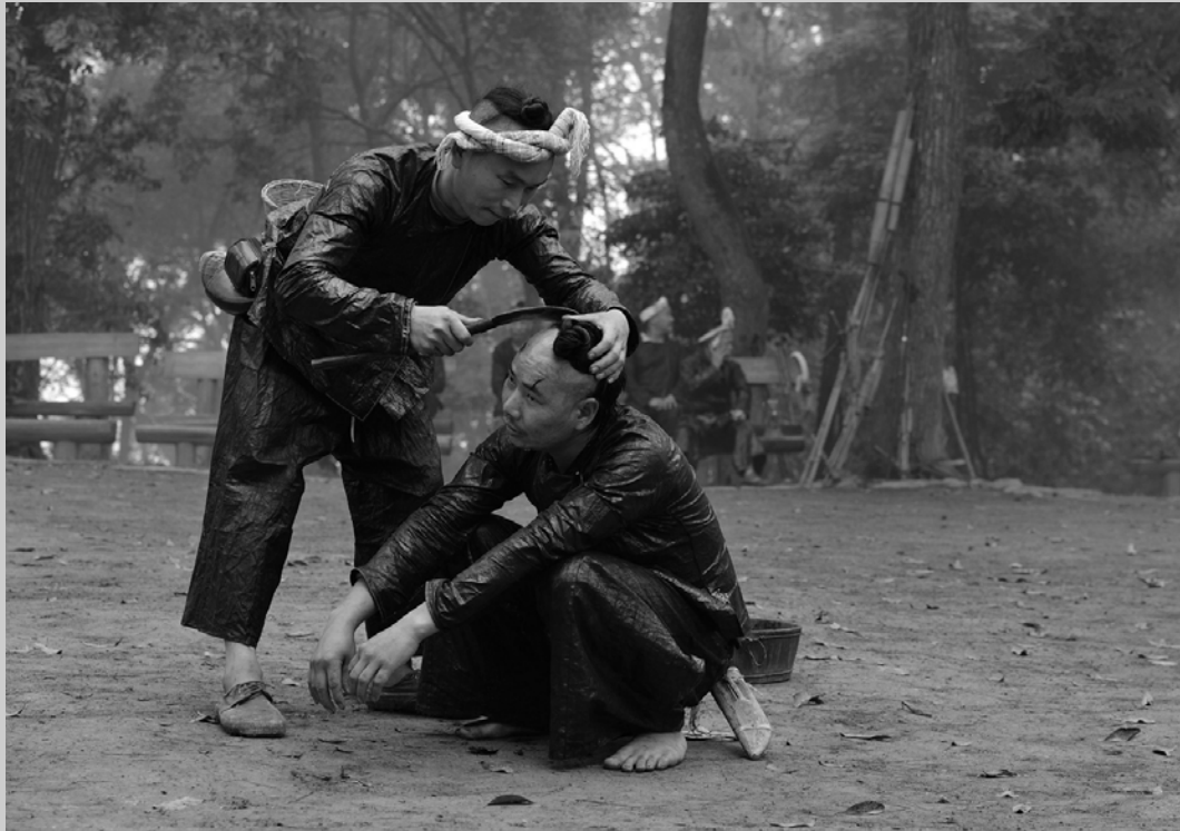
“SICKLE HAIRCUT” © LANFENG CHEN 2017 S4C International Exhibition of Photography Photojournalism General