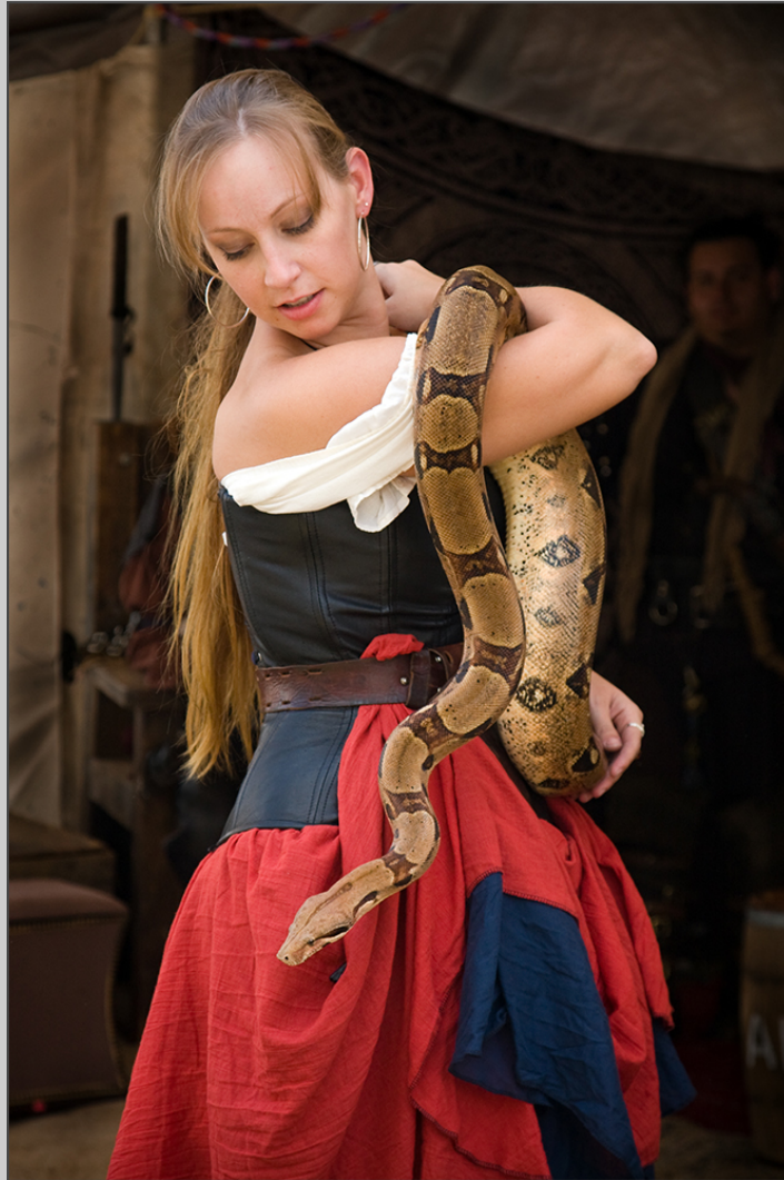
“SNAKE CHARMER” © GEORGE HUTCHISON 2017 S4C International Exhibition of Photography Photojournalism Human Interest