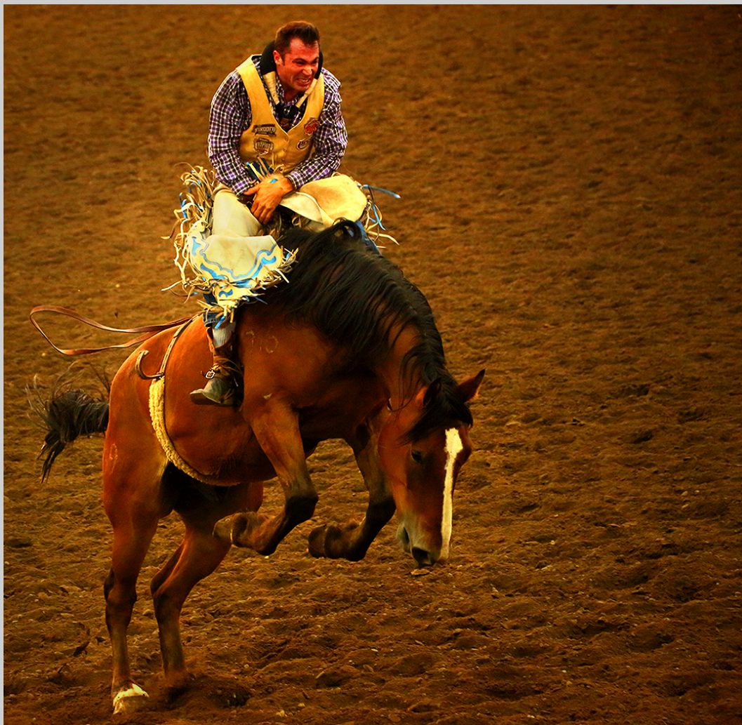
“HIGH UP” EPSA 2017 S4C International Exhibition of Photography Photojournalism General