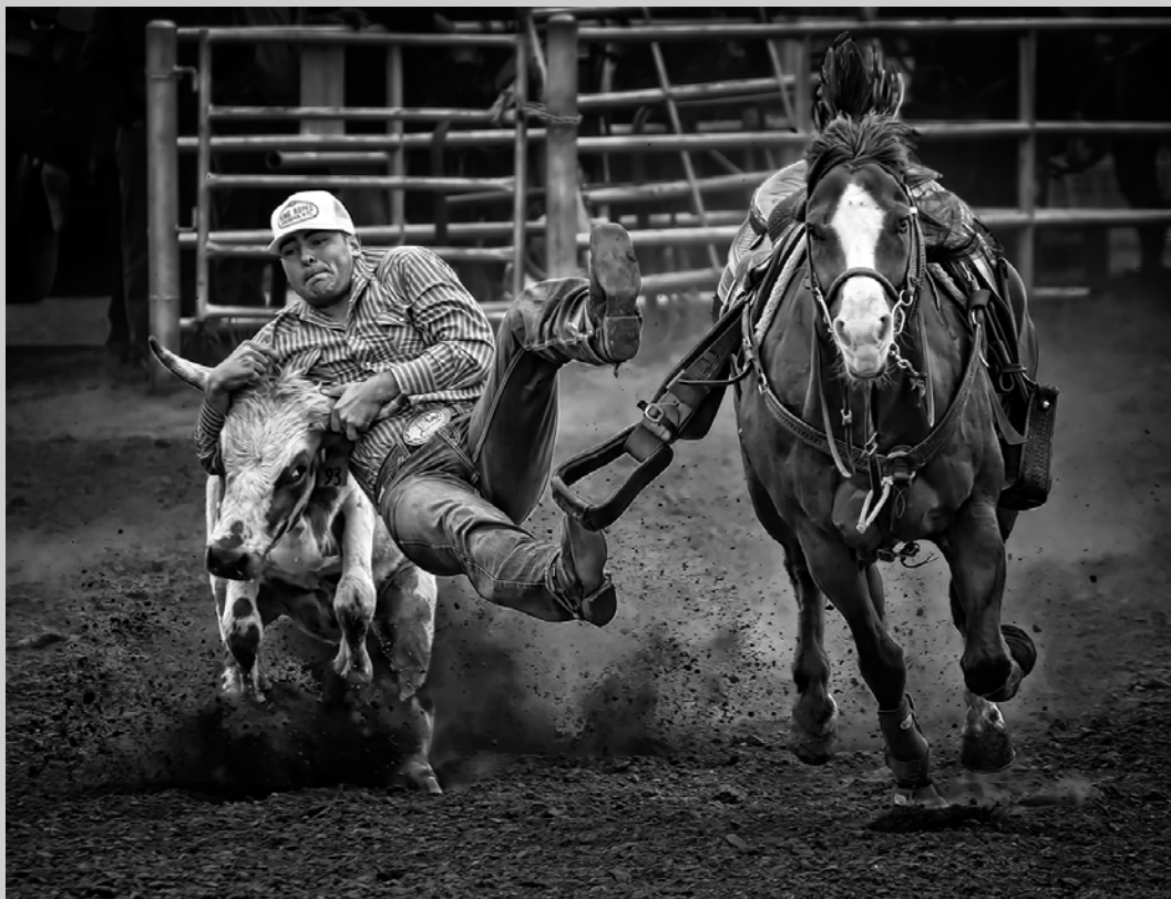
“HOLDING ON” S4C International Exhibition of Photography Photojournalism General S4C Silver