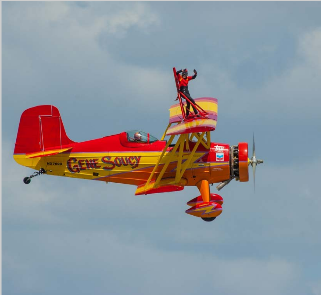
“WINGWALKER 54” 2017 S4C International Exhibition of Photography Photojournalism General