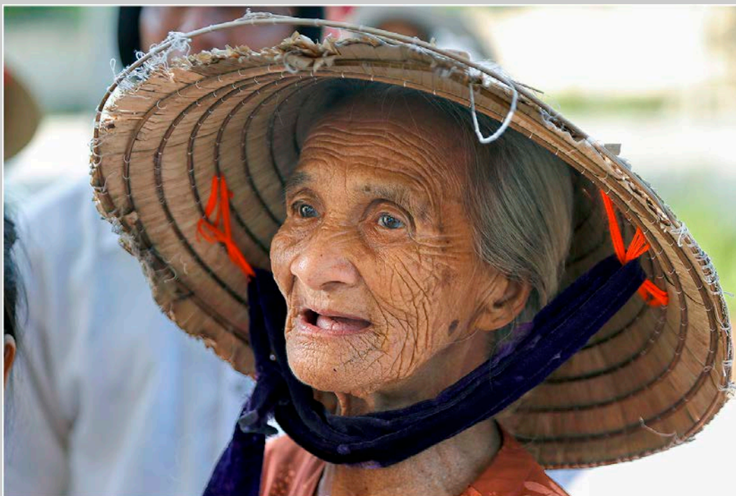
“WAITING FOR FOOD DONATION” © HIEN VU 2017 S4C International Exhibition of Photography Photojournalism General