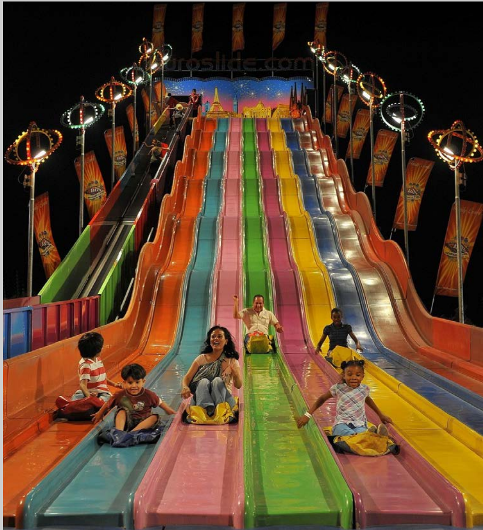
“THE BIG SLIDE” S4C International Exhibition of Photography Photojournalism Human Interest