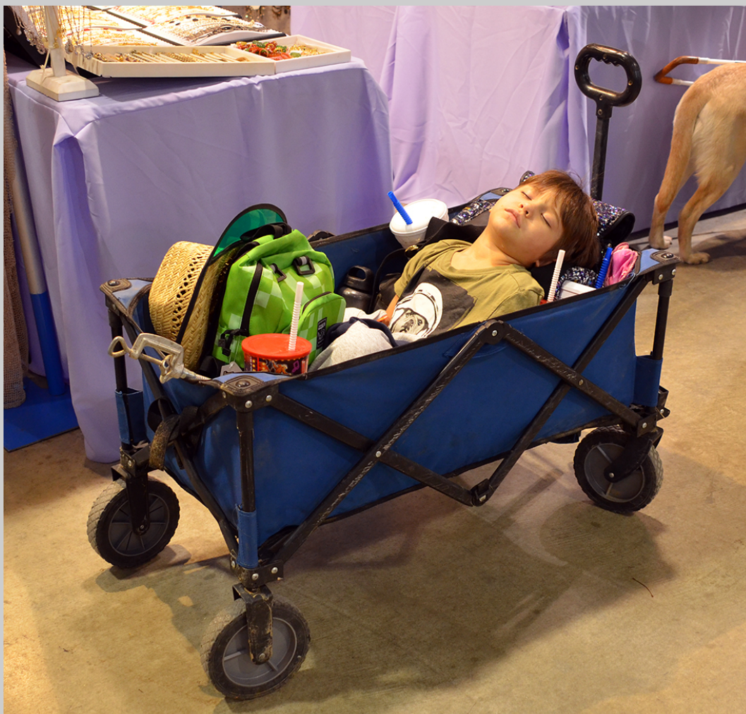
“BUSY DAY AT THE FAIR” S4C International Exhibition of Photography Photojournalism Human Interest