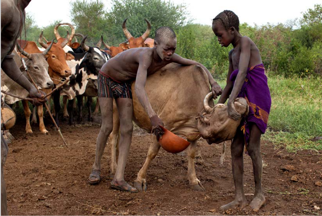
“RITUAL OF TAKING BLOOD 2” © SERGEY AGAPOV 2017 S4C International Exhibition of Photography Photojournalism General HM