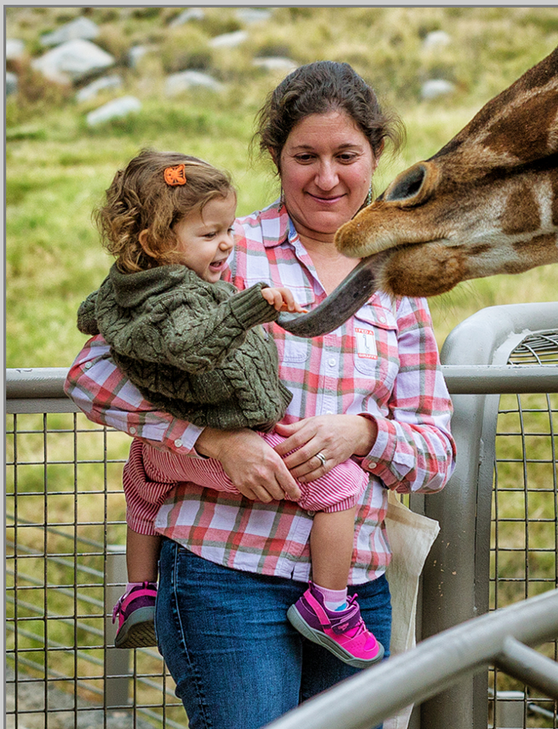
“FEEDING GIRAFFES-01” © PAUL SPEAKER 2017 S4C International Exhibition of Photography Photojournalism General