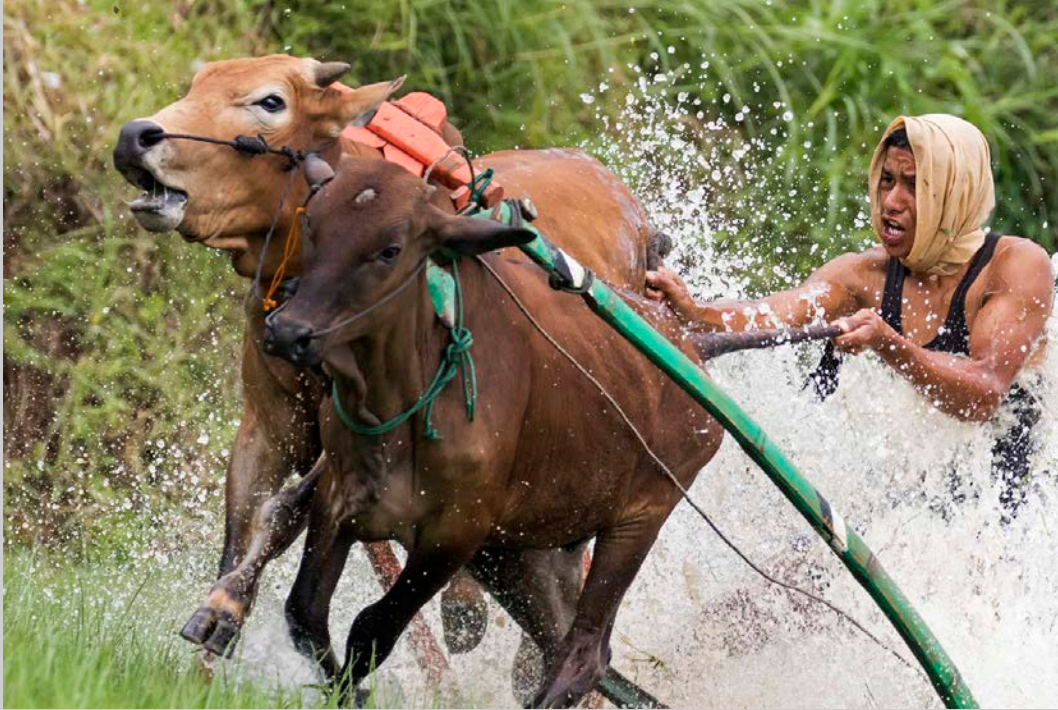
“RUN” S4C International Exhibition of Photography Photojournalism General