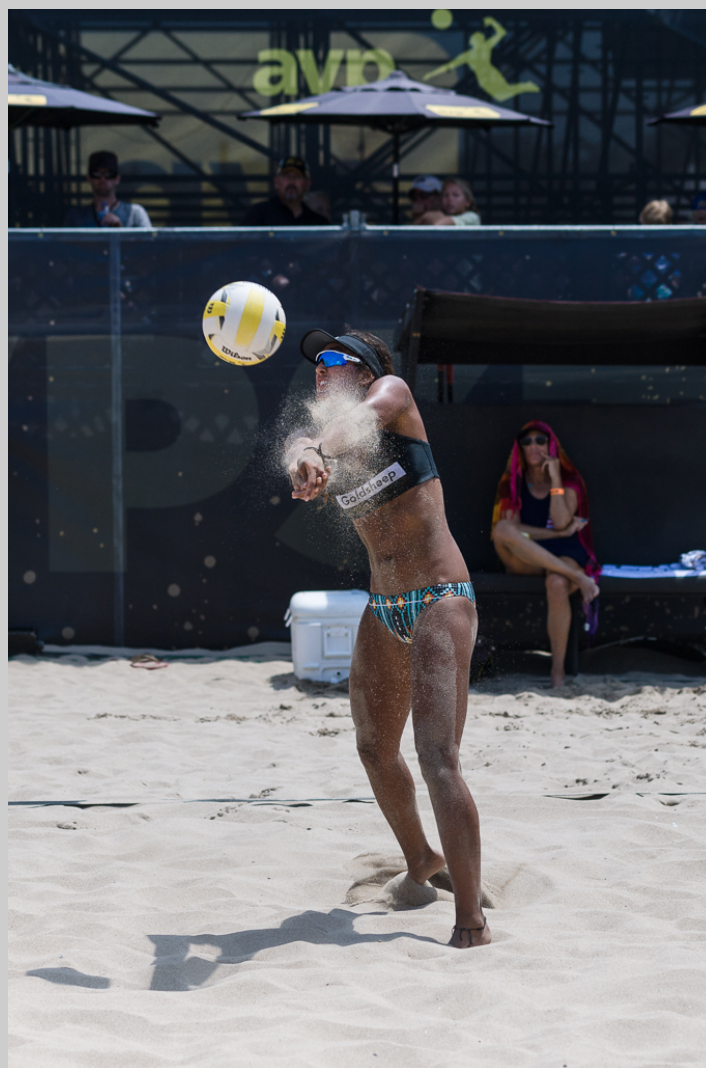
“SAND BOUNCE” © DAVID WILKINS 2017 S4C International Exhibition of Photography Photojournalism General