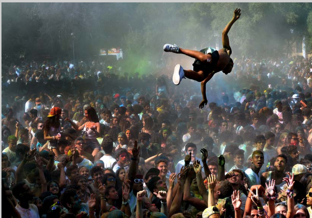
“THE FLYING MAN” © JOAO TABORDA, PPSA 2017 S4C International Exhibition of Photography Photojournalism General Judge’s Choice