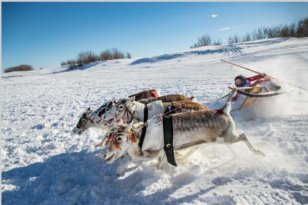
“DANGEROUS TURN-YAMA” © ALEXEY SULOEV 2017 S4C International Exhibition of Photography Photojournalism General