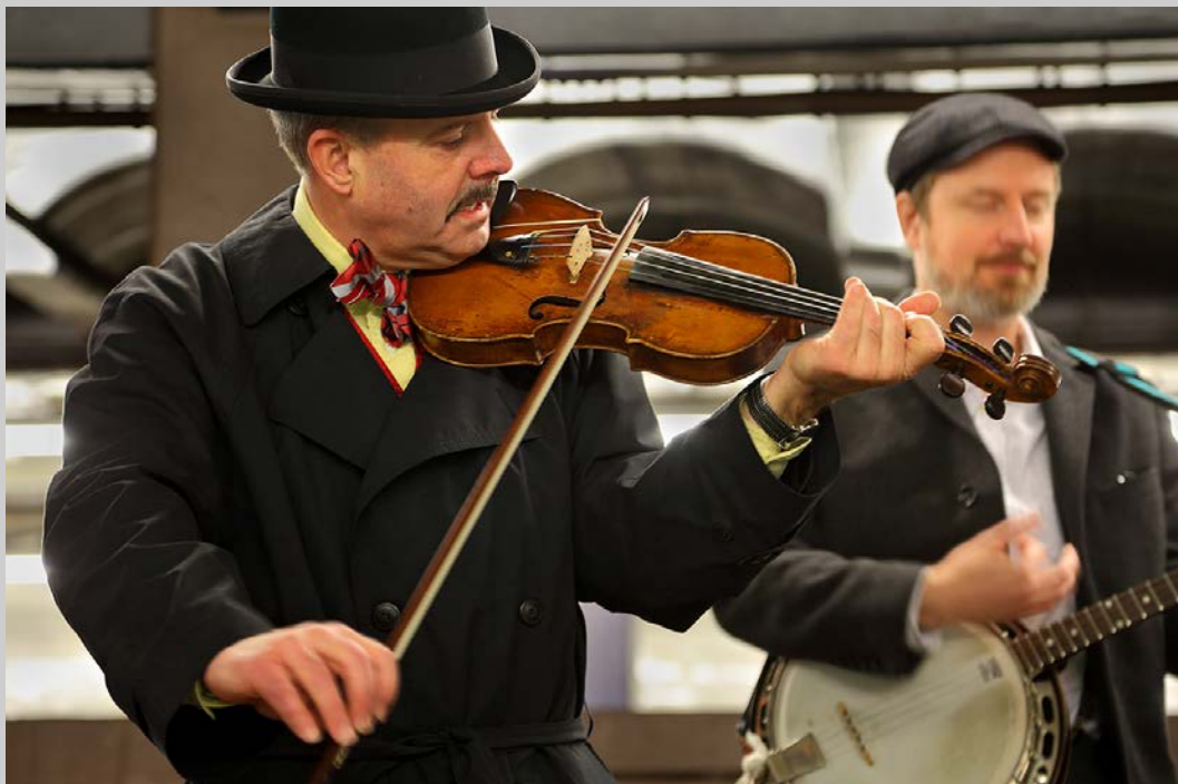
“PLAYING VIOLIN IN SUBWAY” EPSA 2017 S4C International Exhibition of Photography Photojournalism Human Interest