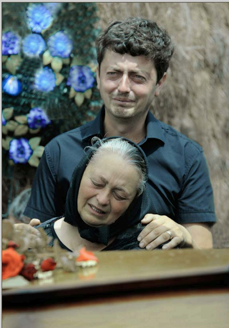
“DESPERATES” © GUY B. SAMOYULT, APSA, GMPSA 2017 S4C International Exhibition of Photography Photojournalism Human Interest S4C Bronze