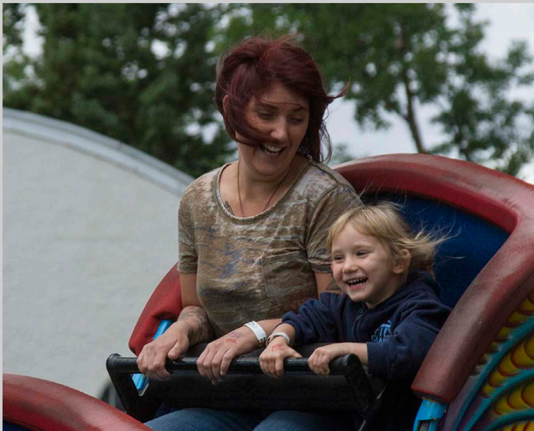
“FUN WITH MOM” 2017 S4C International Exhibition of Photography Photojournalism Human Interest