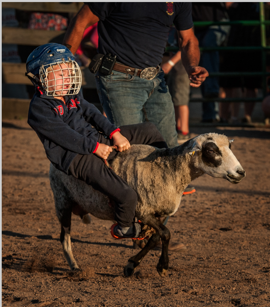
“DONT CRY LITTLE GUY 2850” © VIKI GAUL, APSA, PPSA 2017 S4C International Exhibition of Photography Photojournalism General