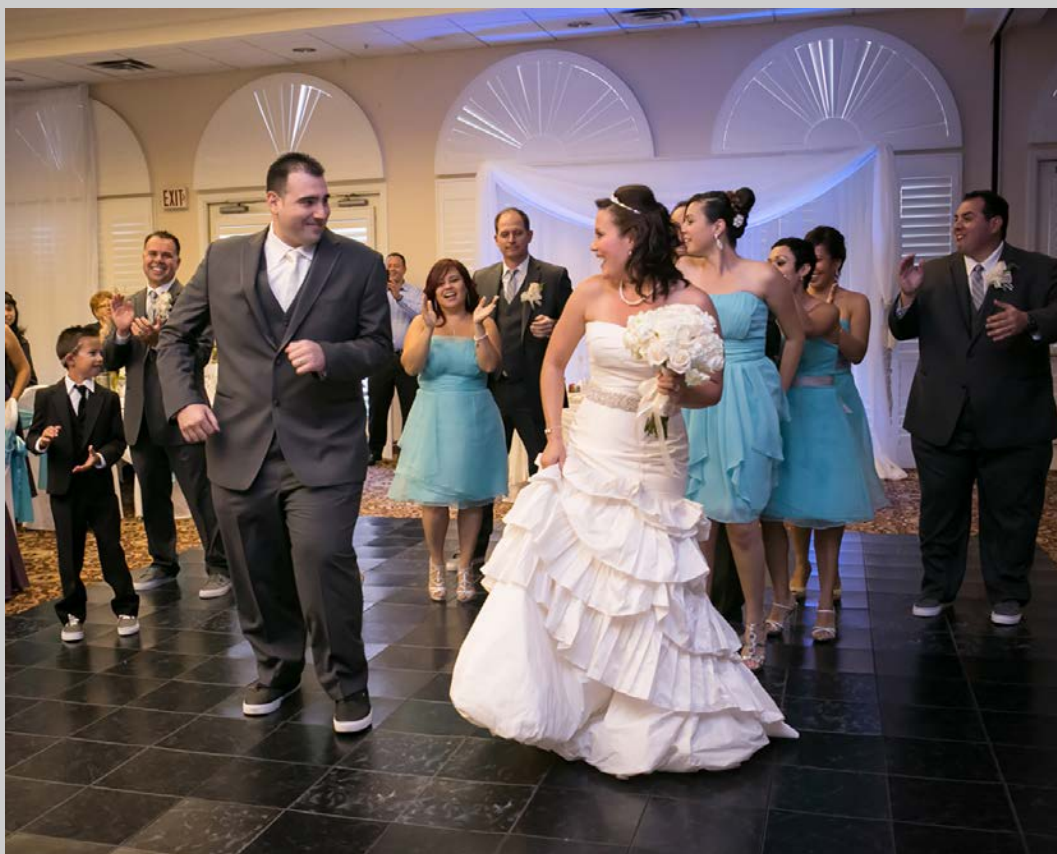
“DANCE LIKE NOBODY'S WATCHING” S4C International Exhibition of Photography Photojournalism Human Interest