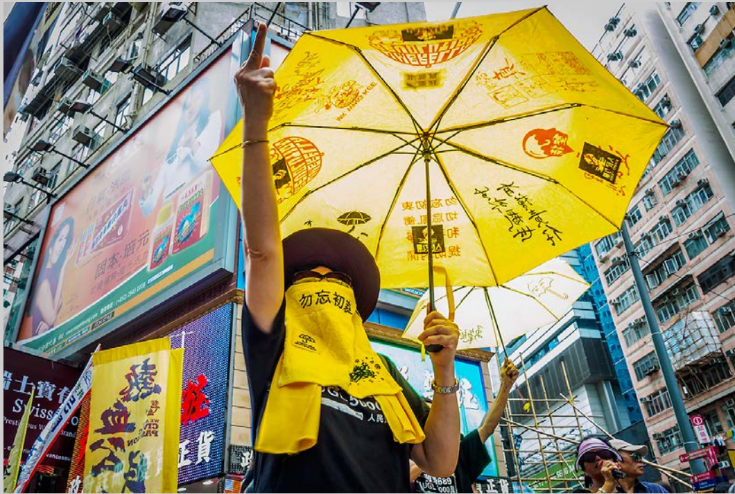
“THE MIDDLE FINGER” 2017 S4C International Exhibition of Photography Photojournalism Human Interest HM