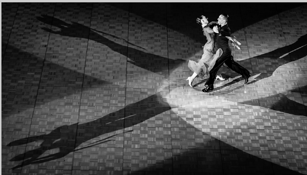
“DANCE DANCE” © WOLFGANG LIN, PPSA 2017 S4C International Exhibition of Photography Photojournalism General