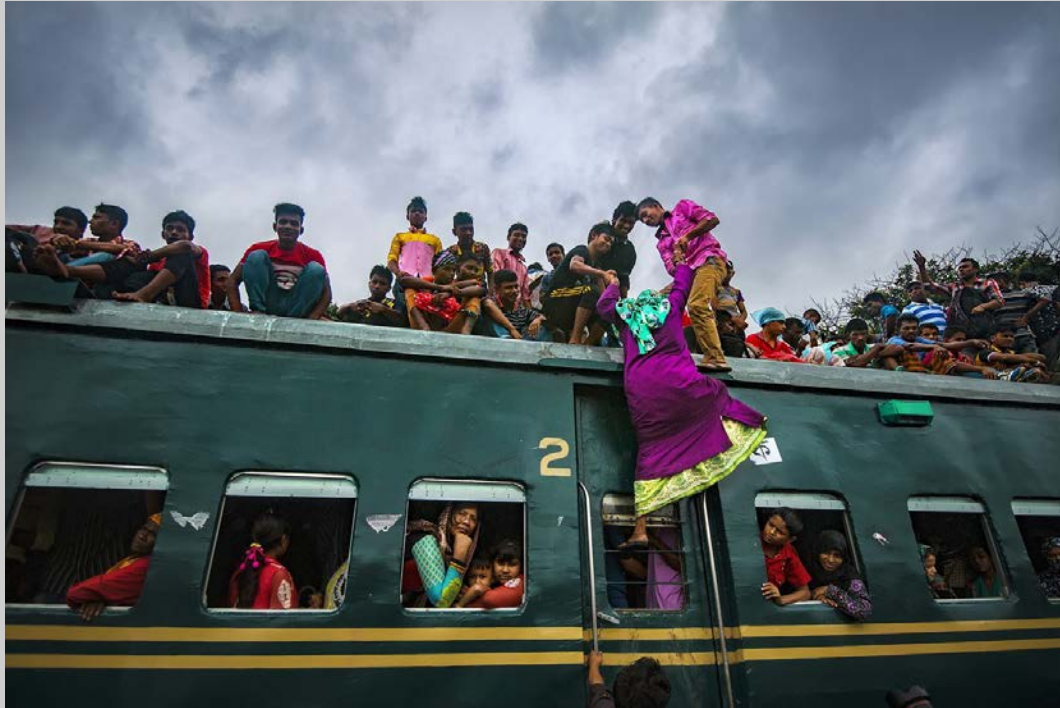
“HOPE HOME 3” S4C International Exhibition of Photography Photojournalism General