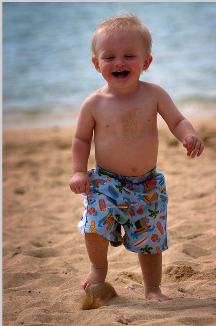
“KICKING UP SAND-2” 2017 S4C International Exhibition of Photography Photojournalism Human Interest