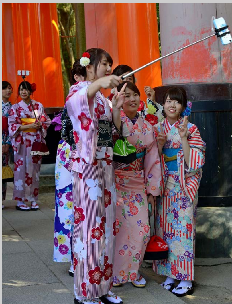
“KIMONO SELFIES - JAPAN” © THOMAS VAN LANGENHOVEN 2017 S4C International Exhibition of Photography Photojournalism Human Interest HM