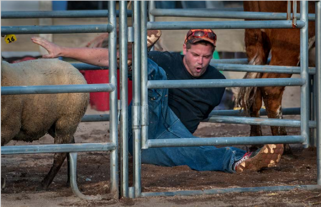
“RODEO HELPER DOWN” © VIKI GAUL, APSA, PPSA 2017 S4C International Exhibition of Photography Photojournalism Human Interest