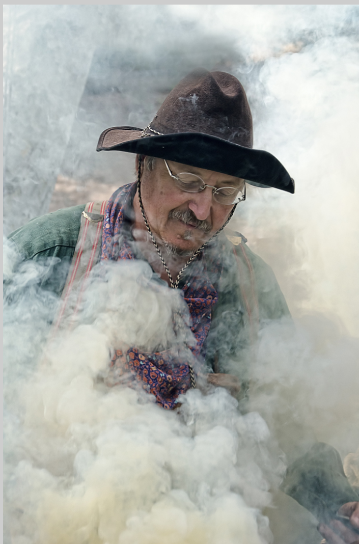
“BLACKSMITH STOKES HIS FIRE” © NORMA WARDEN 2017 S4C International Exhibition of Photography Photojournalism Human Interest