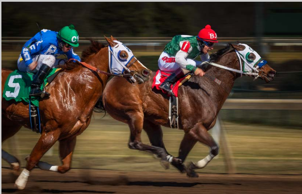
“HORSE RACING” S4C International Exhibition of Photography Photojournalism General