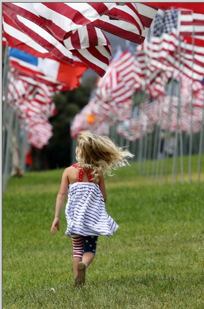
“MATCHING OUTFIT” © GEORGE HUTCHISON 2017 S4C International Exhibition of Photography Photojournalism Human Interest HM