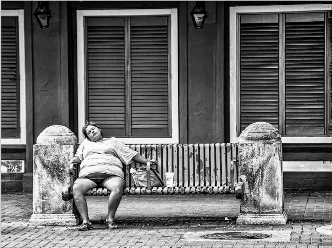
“SNOOZE TIME” 2017 S4C International Exhibition of Photography Photojournalism Human Interest