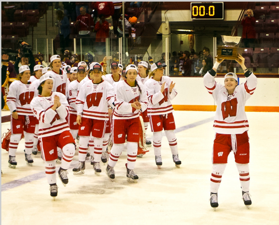
“LIFTING THE TROPHY” S4C International Exhibition of Photography Photojournalism Human Interest