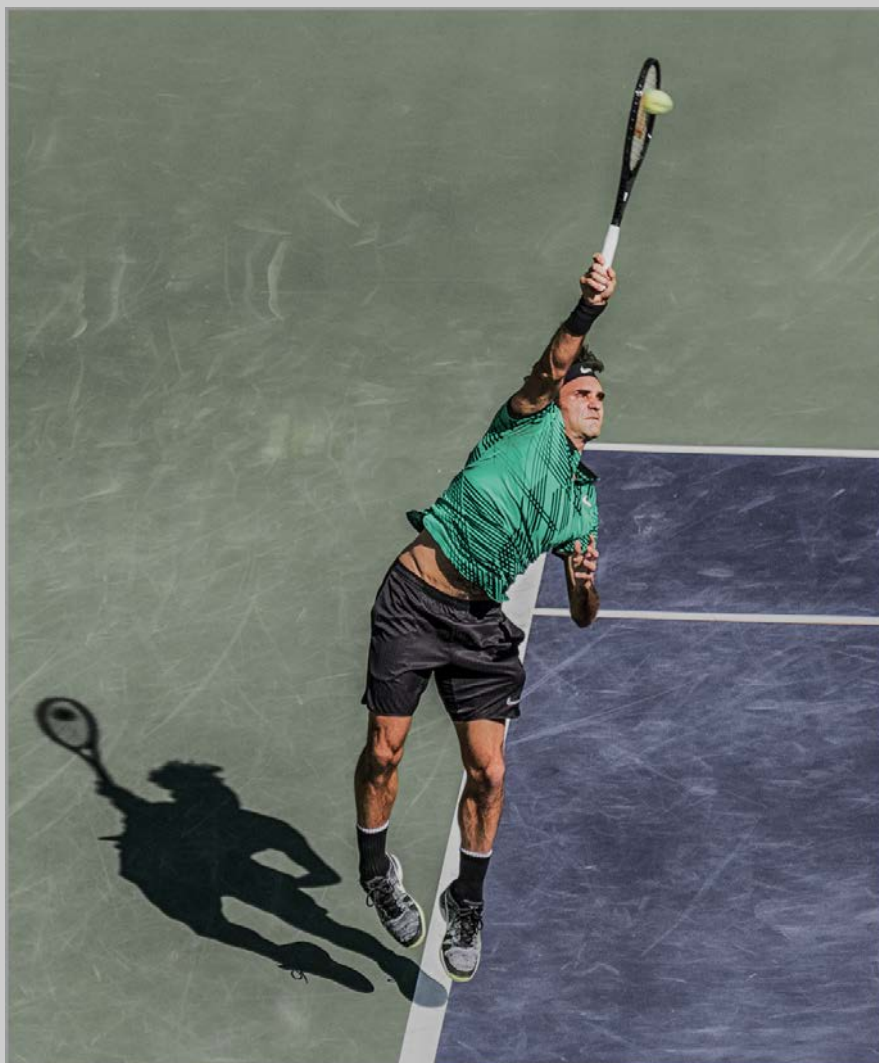
“ROGER 7516” S4C International Exhibition of Photography Photojournalism General