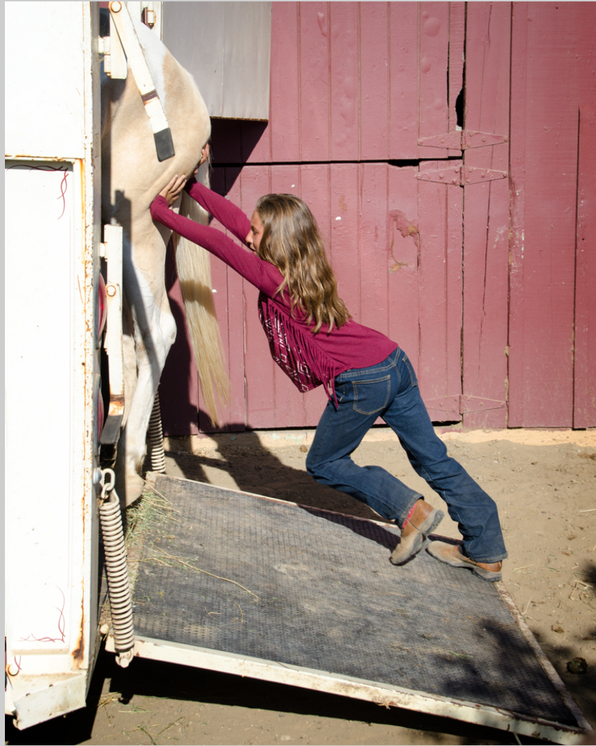
“GET IN THERE!” S4C International Exhibition of Photography Photojournalism Human Interest