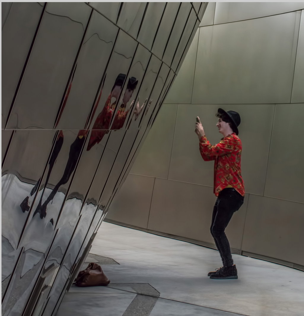
“WOW. WAIT ‘TIL THEY SEE THIS” © ALICE MARIE WAY 2017 S4C International Exhibition of Photography Photojournalism Human Interest