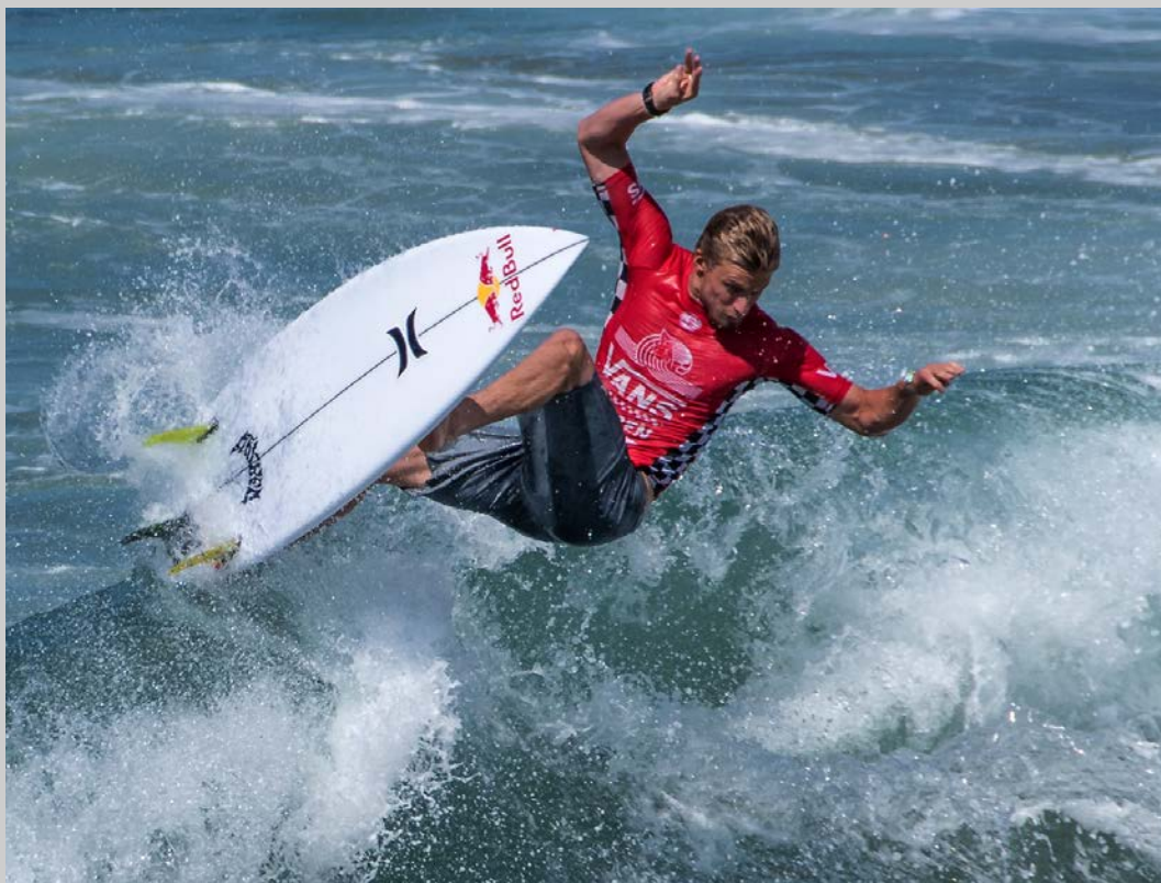
“RED BULL SURFER” © KEN CORDAS, APSA 2017 S4C International Exhibition of Photography Photojournalism General