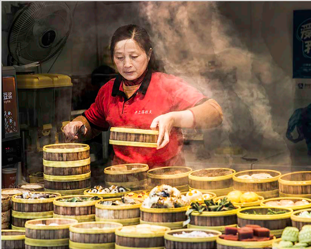
“SERVING LUNCH” © RANDY CARR, APSA, MPSA 2017 S4C International Exhibition of Photography Photojournalism Human Interest HM