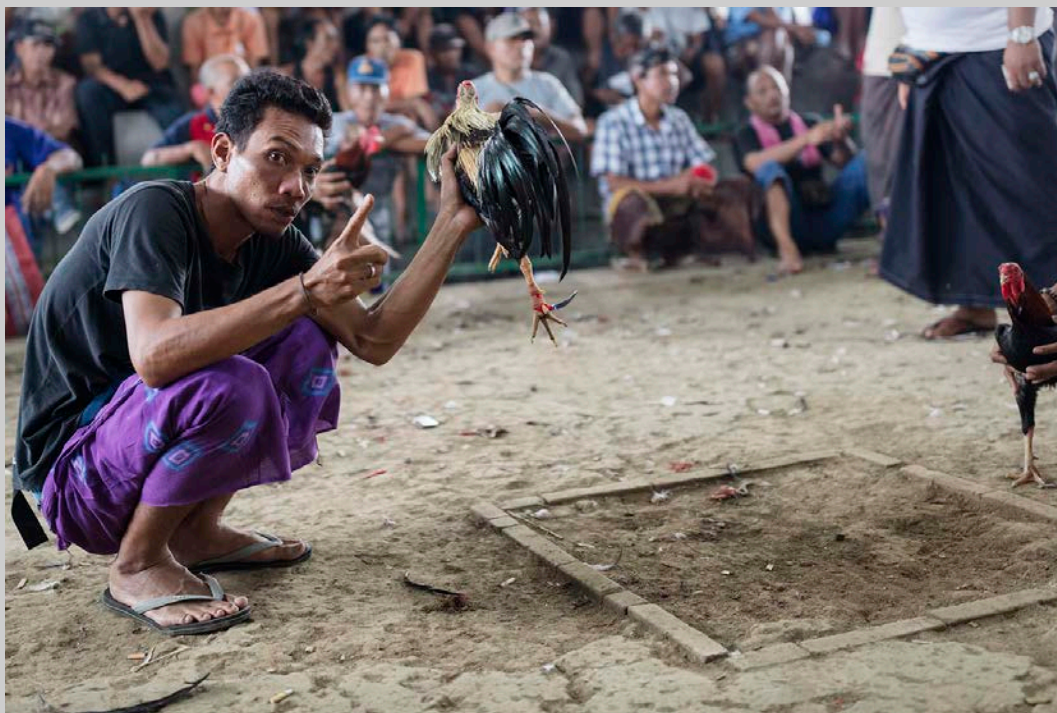
“BET ON ME” S4C International Exhibition of Photography Photojournalism General