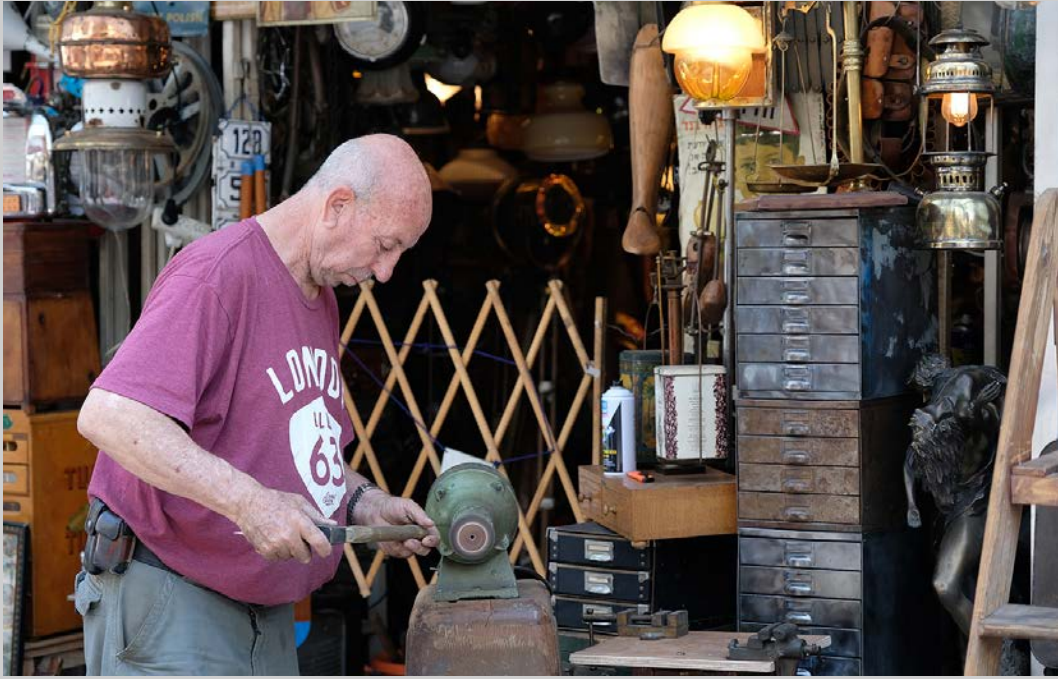
“FIX ANTIQUES” EPSA 2017 S4C International Exhibition of Photography Photojournalism Human Interest