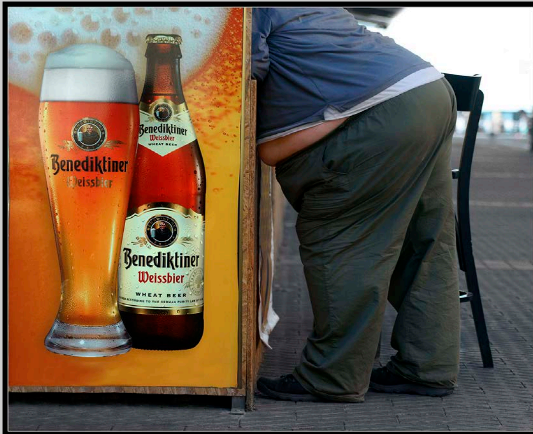
“I LOVE MY BEER” S4C International Exhibition of Photography Photojournalism Human Interest HM