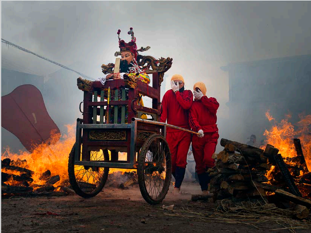
“SACRIFICE SERIES 250” © YI WAN, MPSA 2017 S4C International Exhibition of Photography Photojournalism General