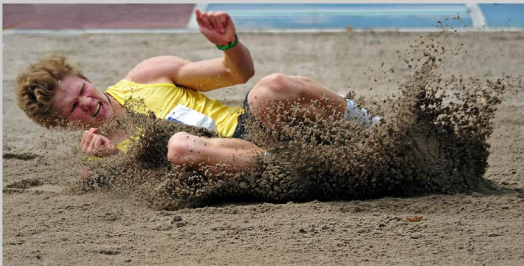
“LONG JUMP 2017” © GERHARD BOEHM, GMPSA 2017 S4C International Exhibition of Photography Photojournalism General HM