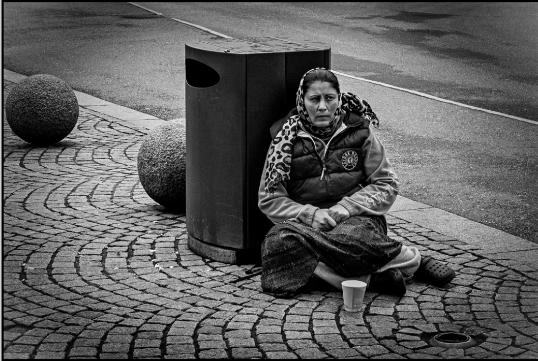
“IMMIGRANT” S4C International Exhibition of Photography Photojournalism Human Interest