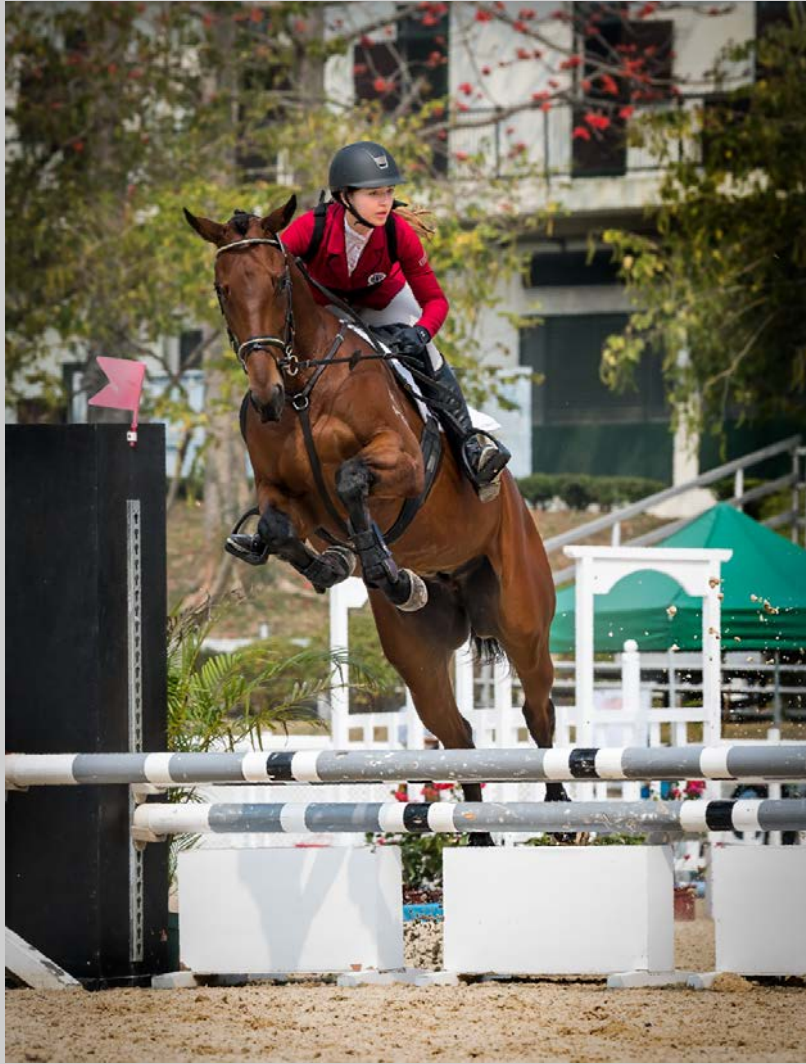
“JUMP” © WENDY WAI MAN LAM 2017 S4C International Exhibition of Photography Photojournalism General HM