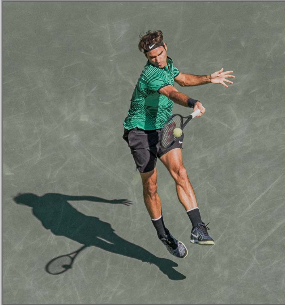
“ROGER 7628 COLOR” © JOHN WHITE 2017 S4C International Exhibition of Photography Photojournalism General