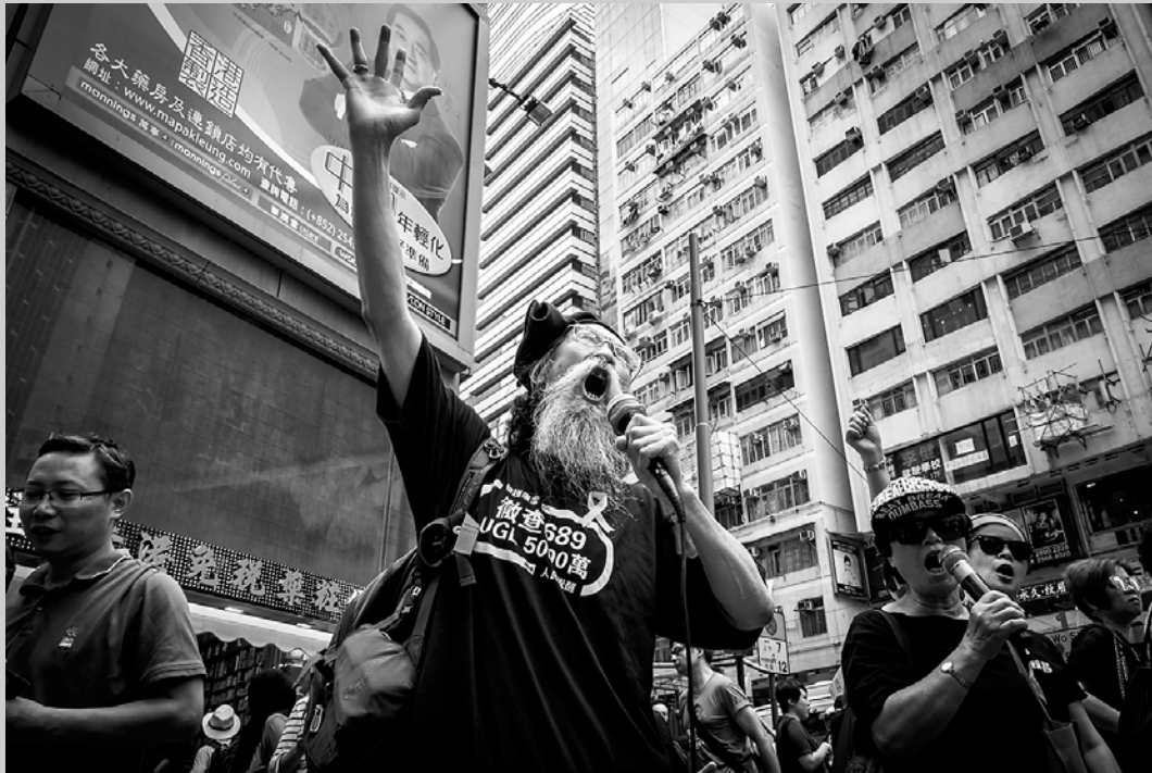
“VOICE OF PEOPLE” © WOLFGANG LIN, PPSA 2017 S4C International Exhibition of Photography Photojournalism Human Interest