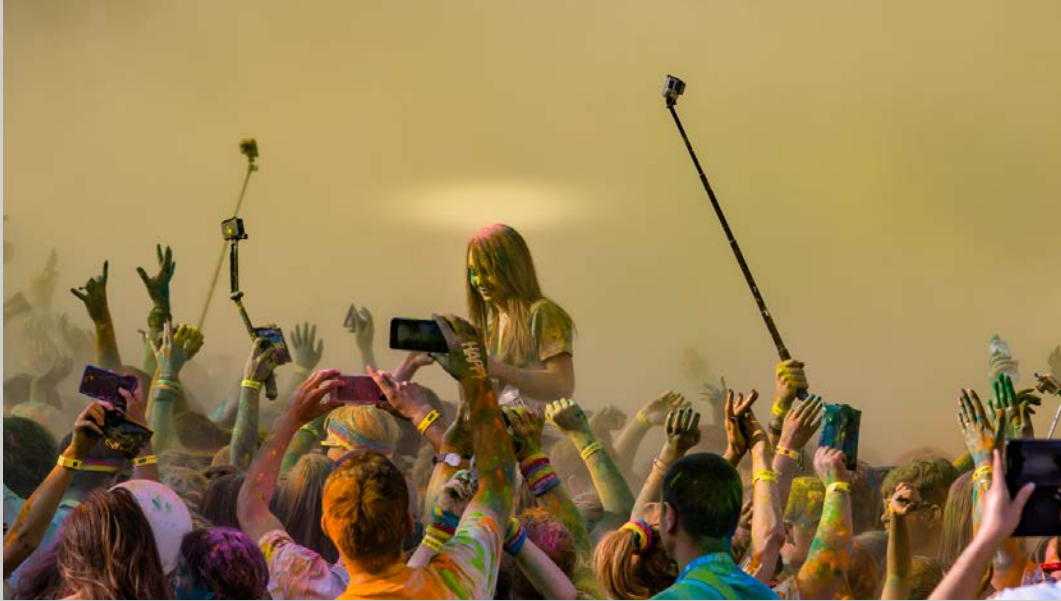
“WANNA BE CELEBRITY” © JANOS DEMETER, PPSA 2017 S4C International Exhibition of Photography Photojournalism Human Interest