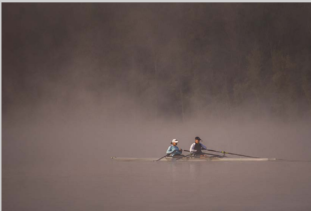
“INTO THE FOG” S4C International Exhibition of Photography Photojournalism General