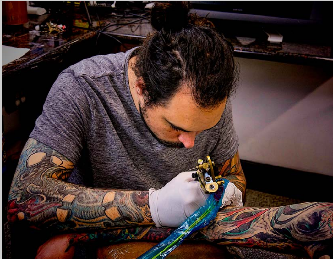
“TATTOO MAN” © JOHN LIVOTI 2017 S4C International Exhibition of Photography Photojournalism General Judge’s Choice