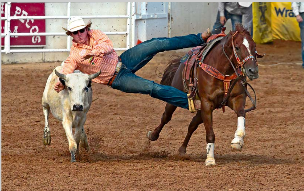
“WEARING MY SUNGLASSES” © TOM SAVAGE, APSA, MPSA 2017 S4C International Exhibition of Photography Photojournalism General