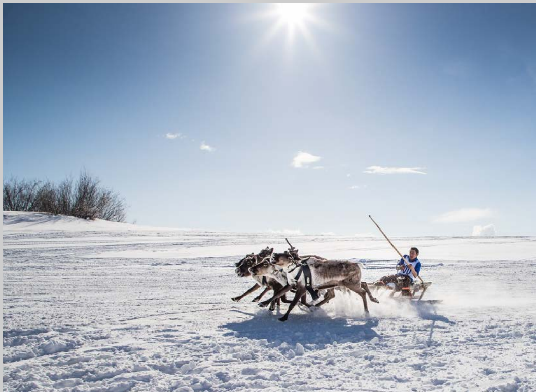
“RACER -YAMA” © ALEXEY SULOEV 2017 S4C International Exhibition of Photography Photojournalism General