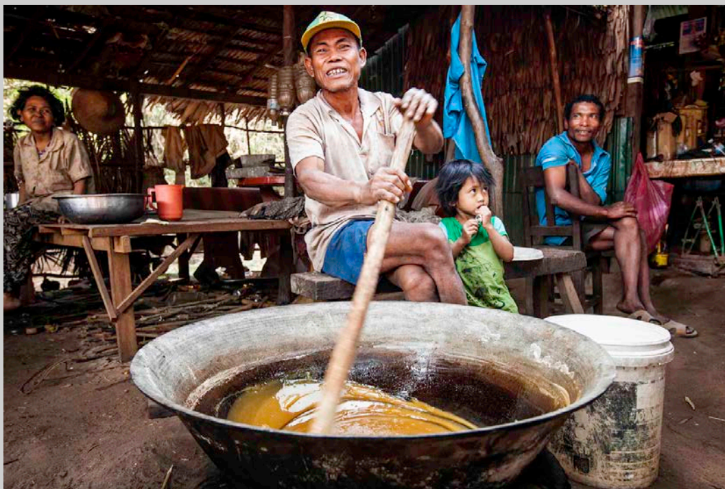
“STIRRING” S4C International Exhibition of Photography Photojournalism Human Interest