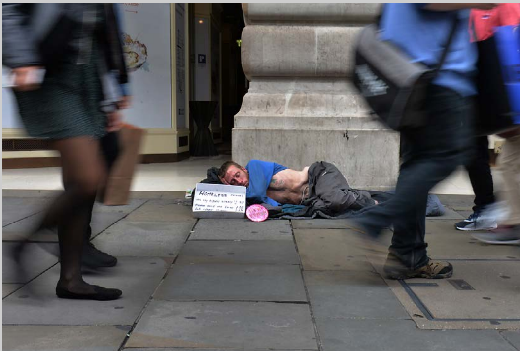
"HOMELESS" © JOAO TABORDA, PPSA 2017 S4C International Exhibition of Photography Photojournalism Human Interest Judge's Choice