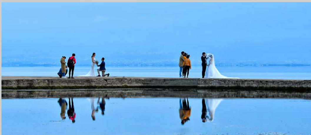
“WEDDING REFLECTION” S4C International Exhibition of Photography Photojournalism General