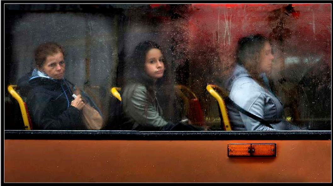
“MORNING TRAIN” © LEONID GOLDIN 2017 S4C International Exhibition of Photography Photojournalism Human Interest HM