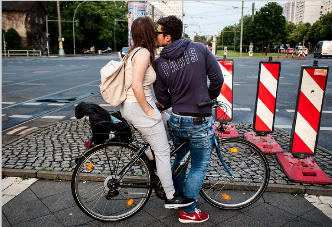
"STREET-LOVE" S4C International Exhibition of Photography Photojournalism Human Interest