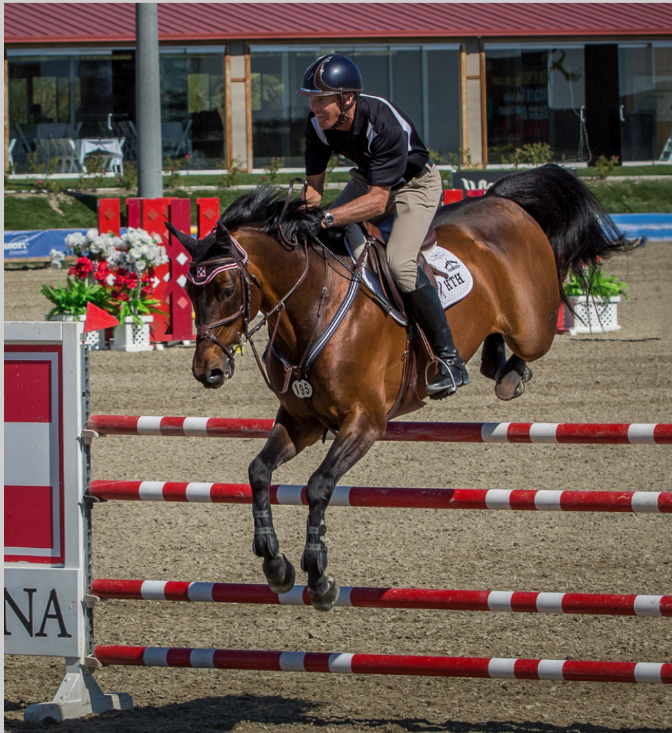
“EQUESTRIAN RIDER” © DIANE ANDERSON 2017 S4C International Exhibition of Photography Photojournalism General