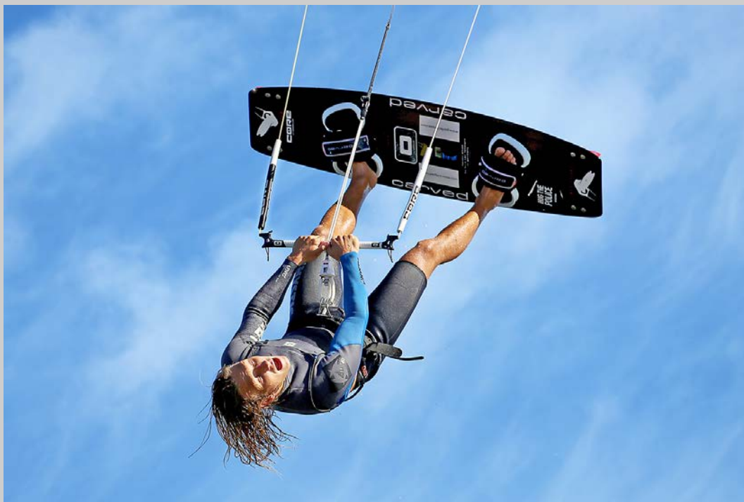
“MARIUS 3” S4C International Exhibition of Photography Photojournalism General HM