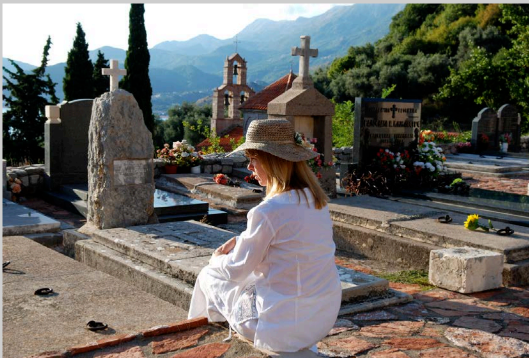
"TIME TO REMEMBRANCE" 2017 S4C International Exhibition of Photography Photojournalism Human Interest