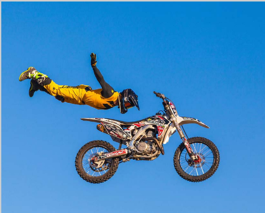
“FLOATING IN AIR” © KEN MURPHY, APSA, EPSA 2017 S4C International Exhibition of Photography Photojournalism General