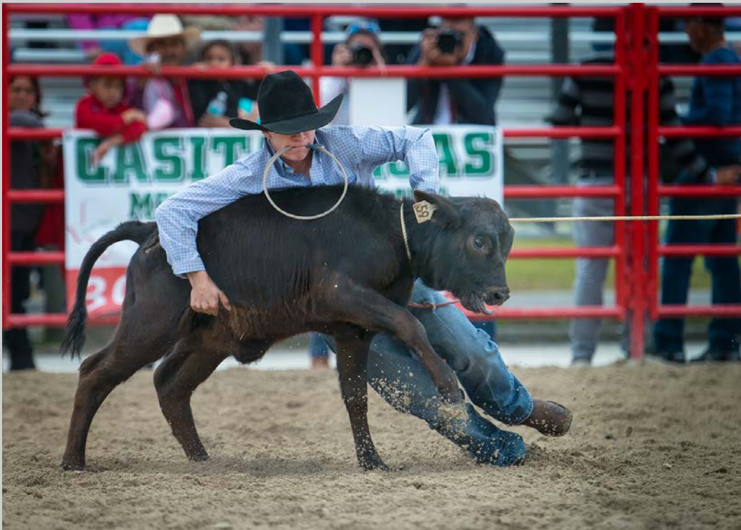
“GOTCHA” © ELENA MCTIGHE, FPSA, MPSA 2017 S4C International Exhibition of Photography Photojournalism General