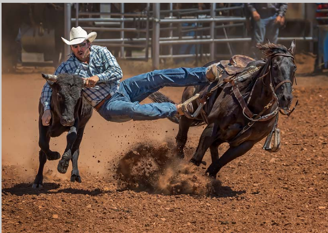
“RODEO COWBOY” S4C International Exhibition of Photography Photojournalism General