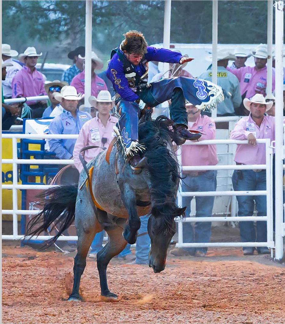
"GRAY HORSE BAREBACK" © TOM SAVAGE, APSA, MPSA 2017 S4C International Exhibition of Photography Photojournalism General