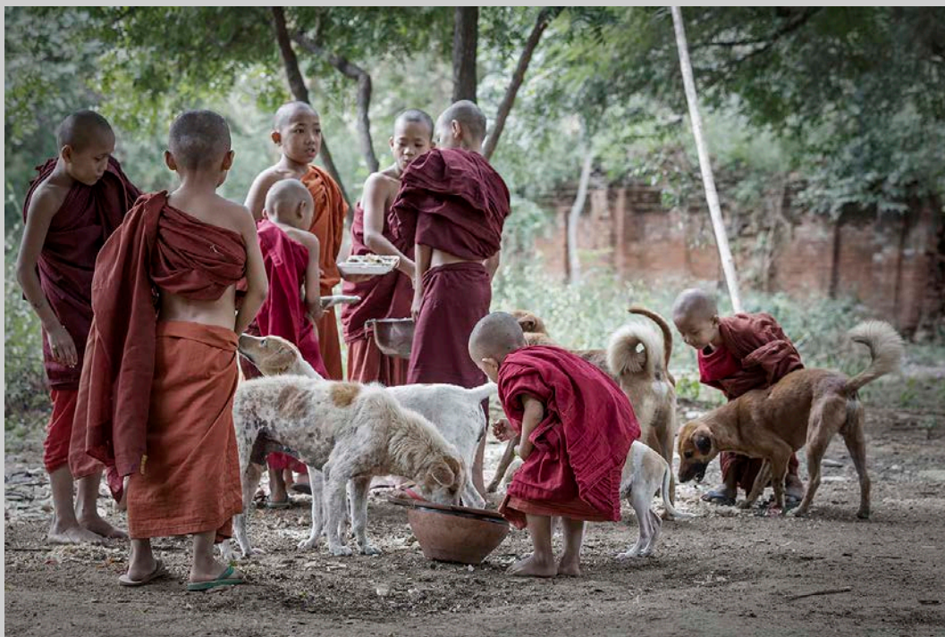
“FEED DOGS” © WEI FU 2017 S4C International Exhibition of Photography Photojournalism Human Interest HM