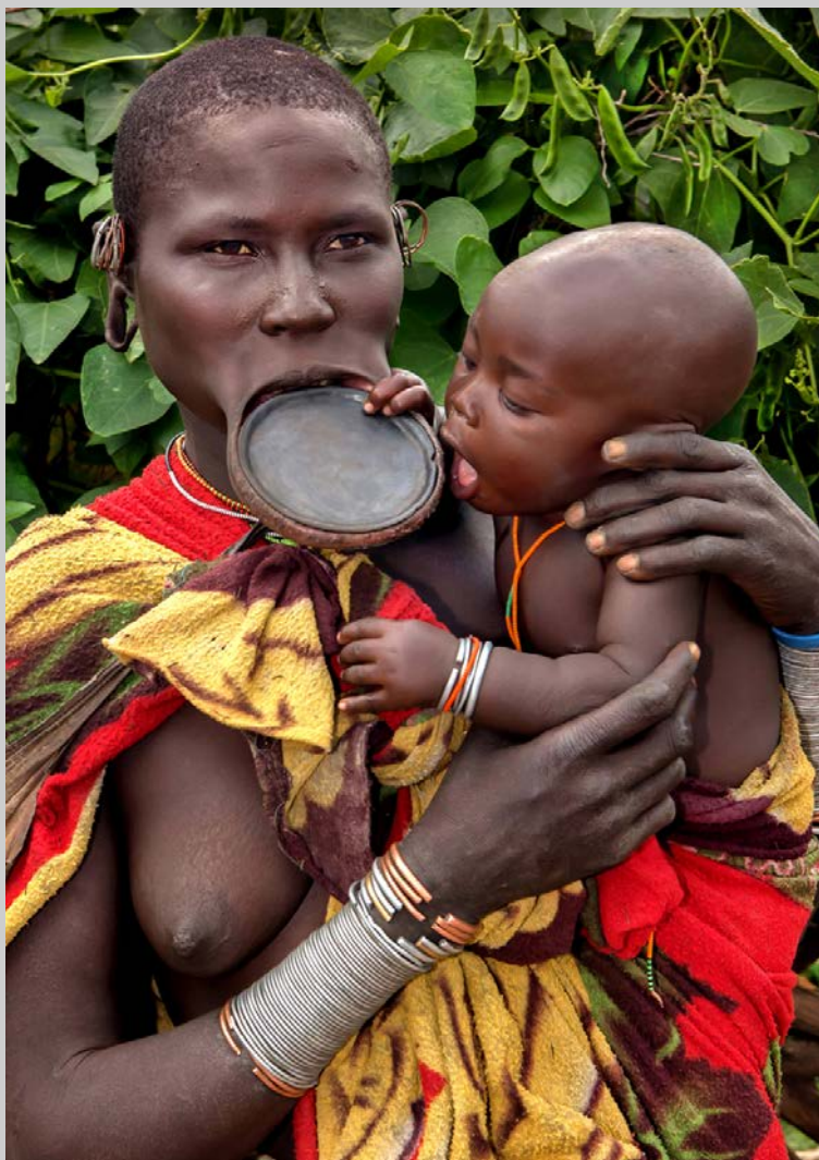
“MURSI FAMILY” S4C International Exhibition of Photography Photojournalism General