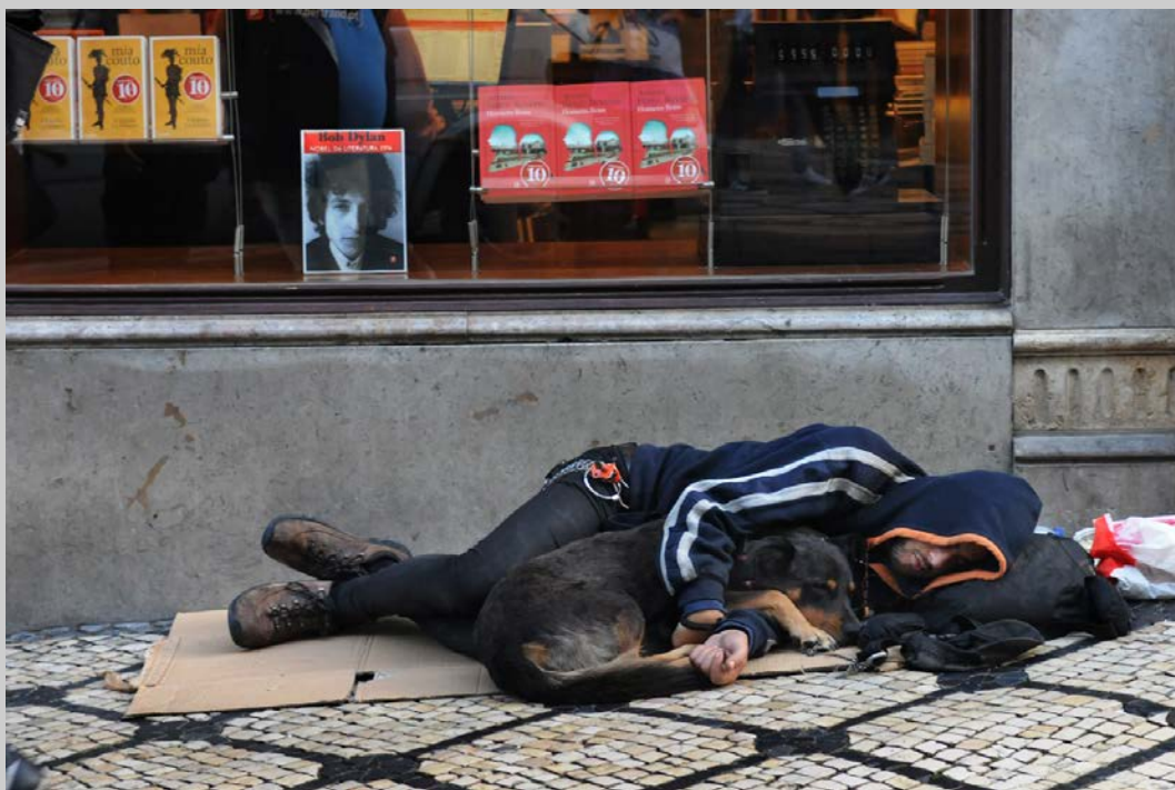
“INSEPARABLES FRIENDS” © JOAO TABORDA, PPSA 2017 S4C International Exhibition of Photography Photojournalism Human Interest