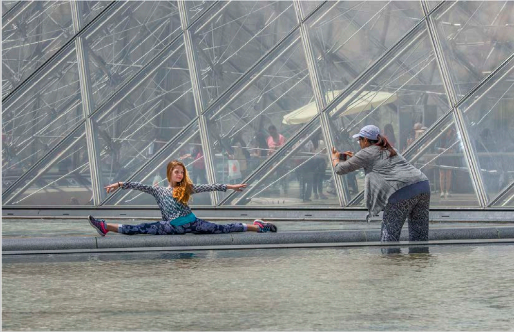
“TAKE PHOTOS 4” © YI WAN, MPSA 2017 S4C International Exhibition of Photography Photojournalism Human Interest