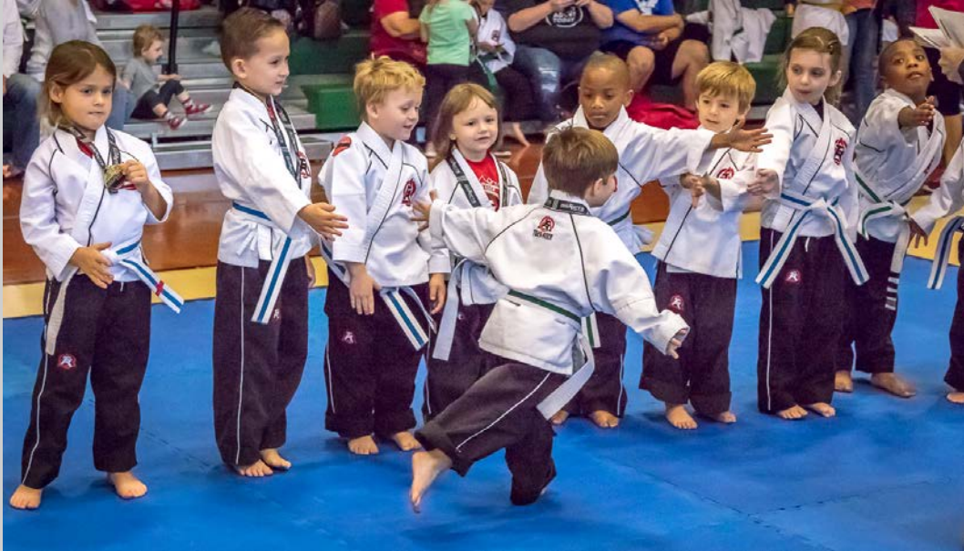
“BEST PART OF MY DAY” © GREGORY DALEY, EPSA 2017 S4C International Exhibition of Photography Photojournalism Human Interest