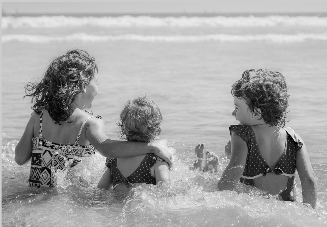
“SISTERS JOY” S4C International Exhibition of Photography Photojournalism Human Interest