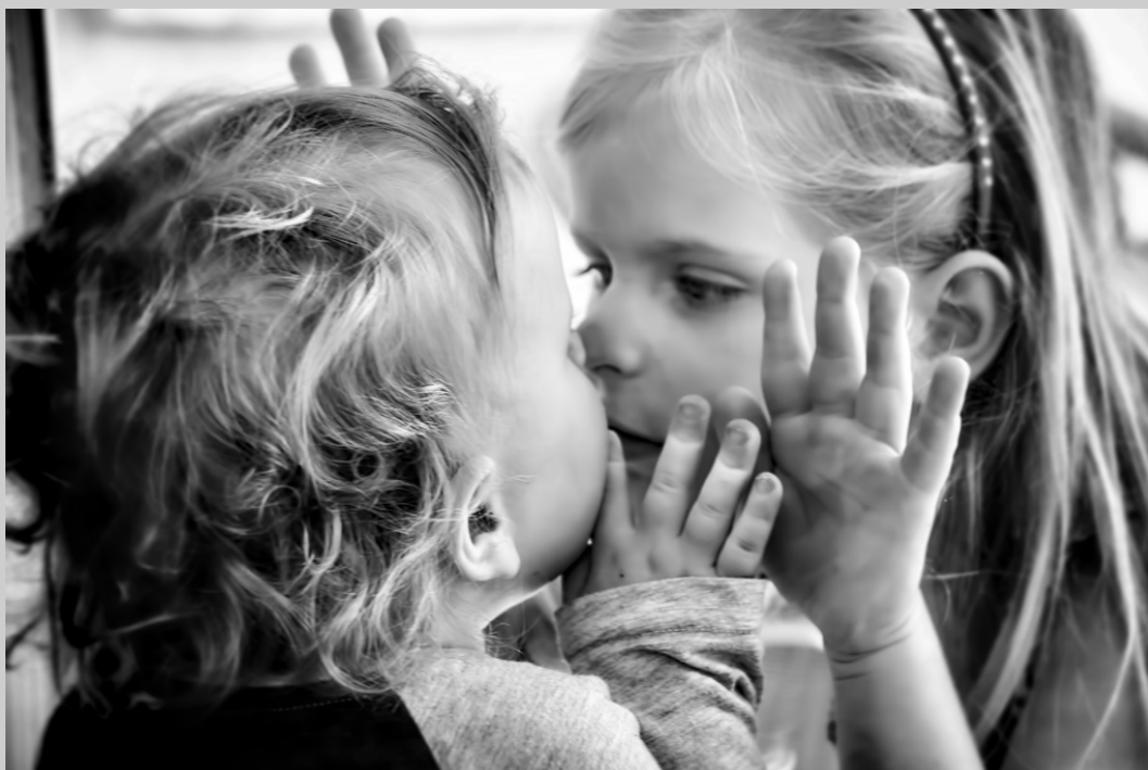
“WINDOW KISSES” © NORMA WARDEN 2017 S4C International Exhibition of Photography Photojournalism Human Interest