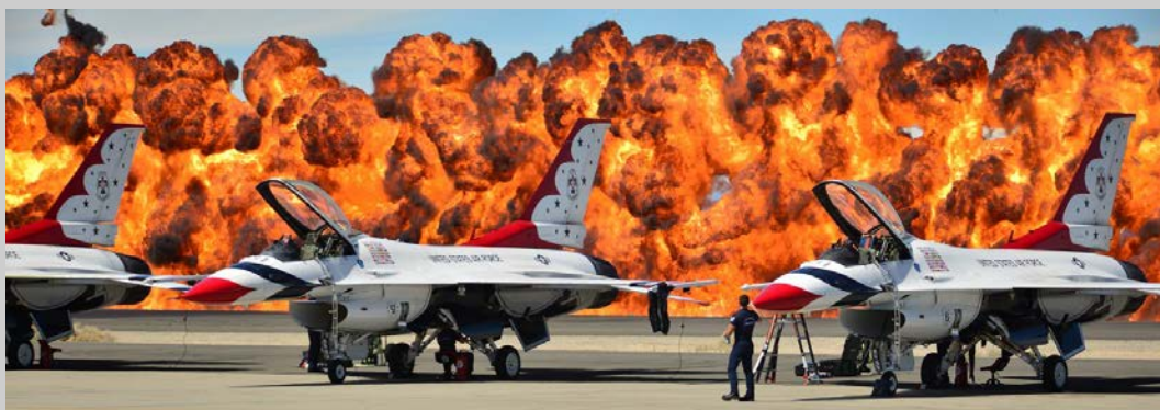
“A LITTLE COMMOTION” S4C International Exhibition of Photography Photojournalism General