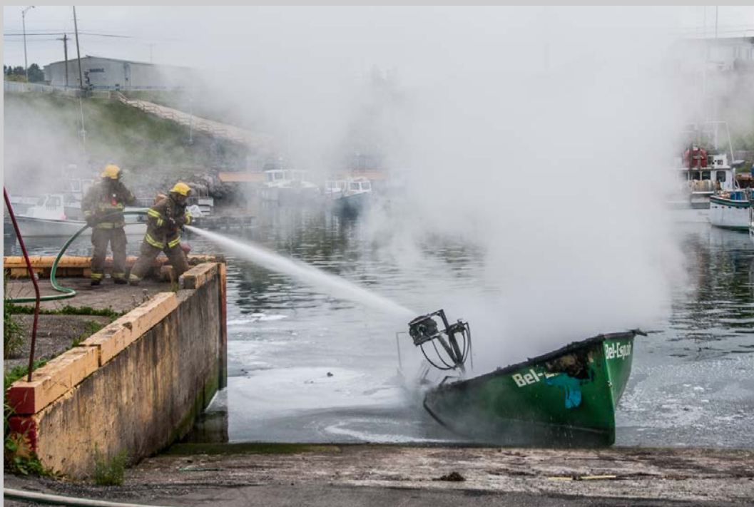
“FIREMEN DOUSING FIRE” 2017 S4C International Exhibition of Photography Photojournalism General HM