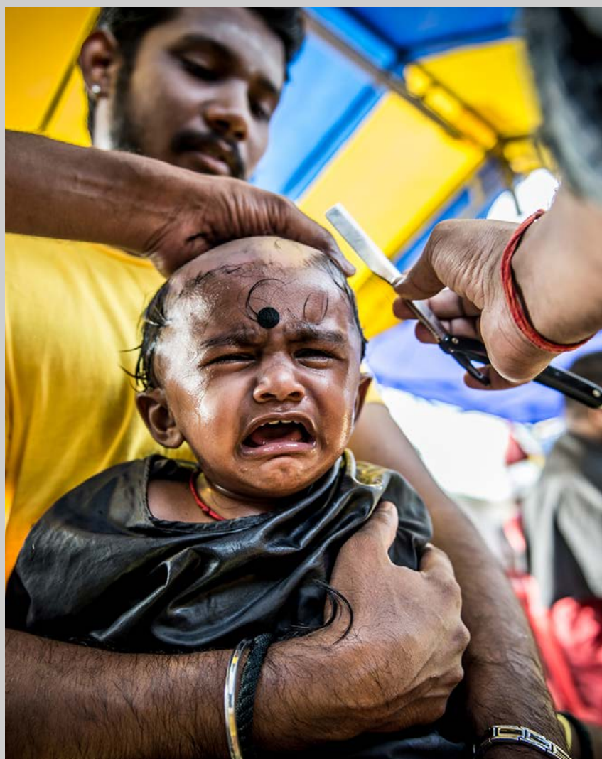
“APPRECIATION” © SAU FONG NEO 2017 S4C International Exhibition of Photography Photojournalism General