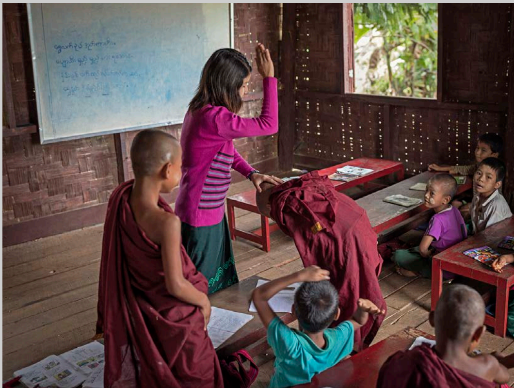
“PUNISH” © WEI FU 2017 S4C International Exhibition of Photography Photojournalism Human Interest