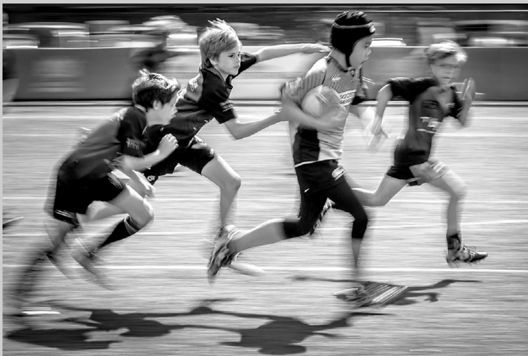
“ALMOST GOT YOU” © WOLFGANG LIN, PPSA 2017 S4C International Exhibition of Photography Photojournalism General