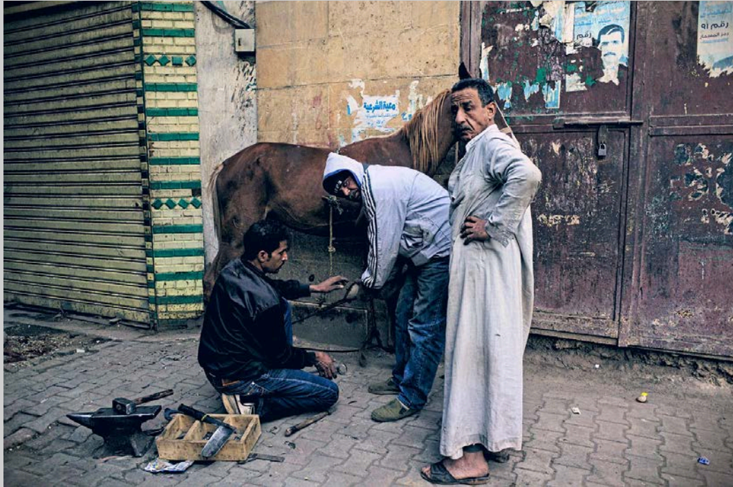
“STREET BLACKSMITH” S4C International Exhibition of Photography Photojournalism Human Interest