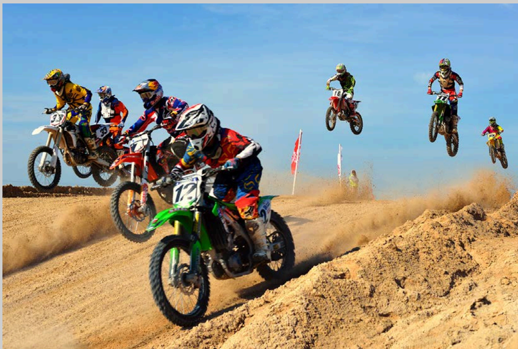
“DIRT BIKE” EPSA 2017 S4C International Exhibition of Photography Photojournalism General HM