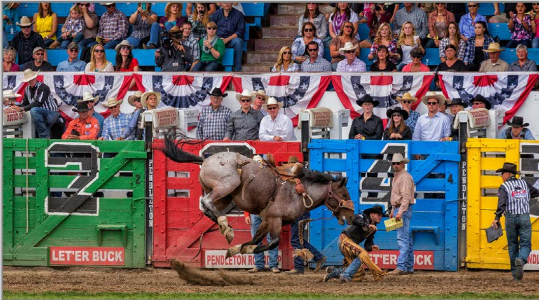
“SADDLE BRONC-36” S4C International Exhibition of Photography Photojournalism General