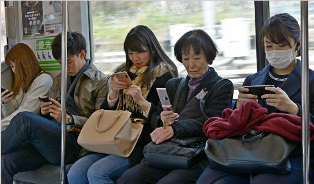
“TRAIN PASSENGERS - JAPAN” S4C International Exhibition of Photography Photojournalism General