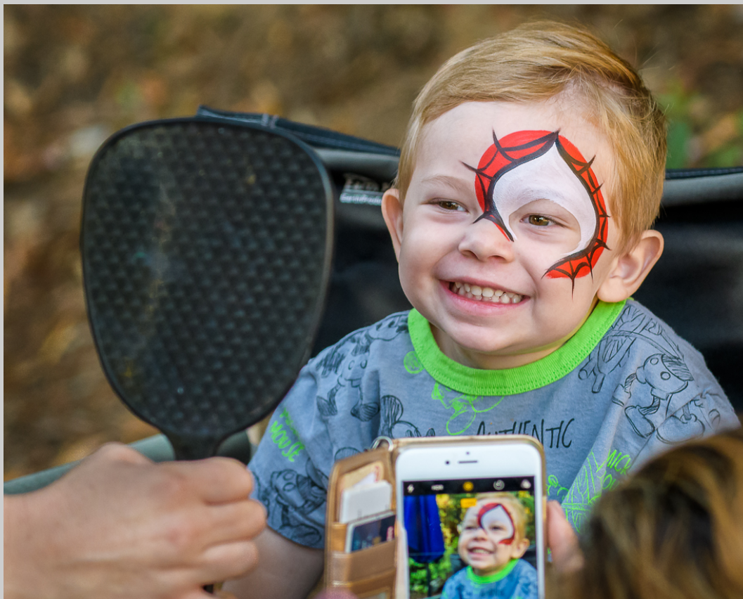
“SPIDER-MAN!” S4C International Exhibition of Photography Photojournalism Human Interest