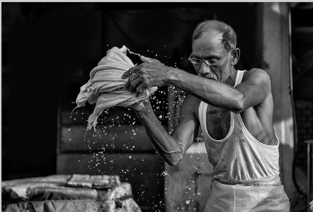
“OLD MAN WASHING DHOBI GHAT” © ABBAS KAPADIA, EPSA 2017 S4C International Exhibition of Photography Photojournalism Human Interest