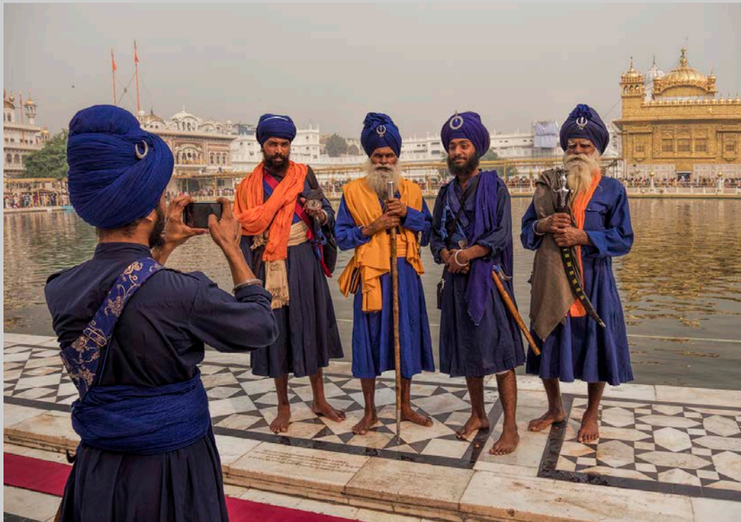
“ALL SMILES IN AMRITSAR” EPSA 2017 S4C International Exhibition of Photography Photojournalism Human Interest