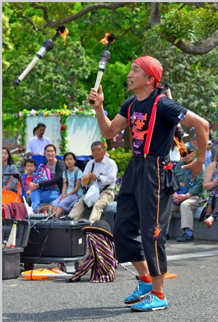
“A HOT CATCH” S4C International Exhibition of Photography Photojournalism Human Interest