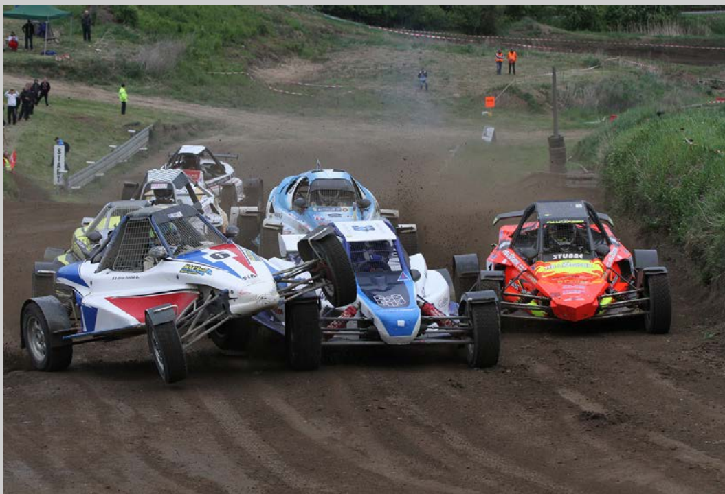
“AUTOCROSSER NO 6 ATTACK” © WOLFGANG KAEDING, GMPA 2017 S4C International Exhibition of Photography Photojournalism General