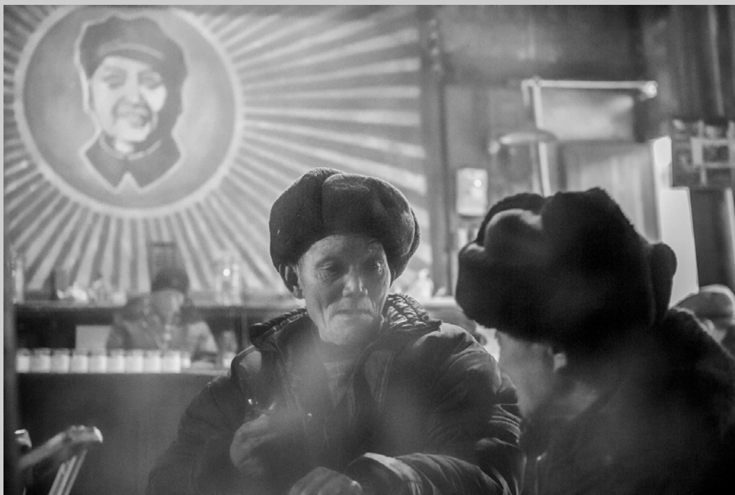
“TEA TIME IN AFTERNOON” © XINXIN CHEN, MPSA 2017 S4C International Exhibition of Photography Photojournalism Human Interest