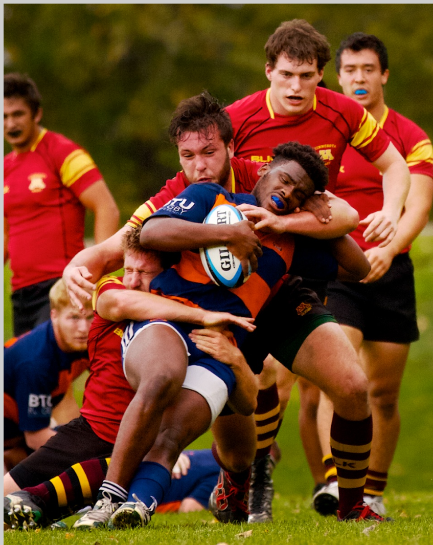
“ILLINOIS RUGGER TACKLED” S4C International Exhibition of Photography Photojournalism General