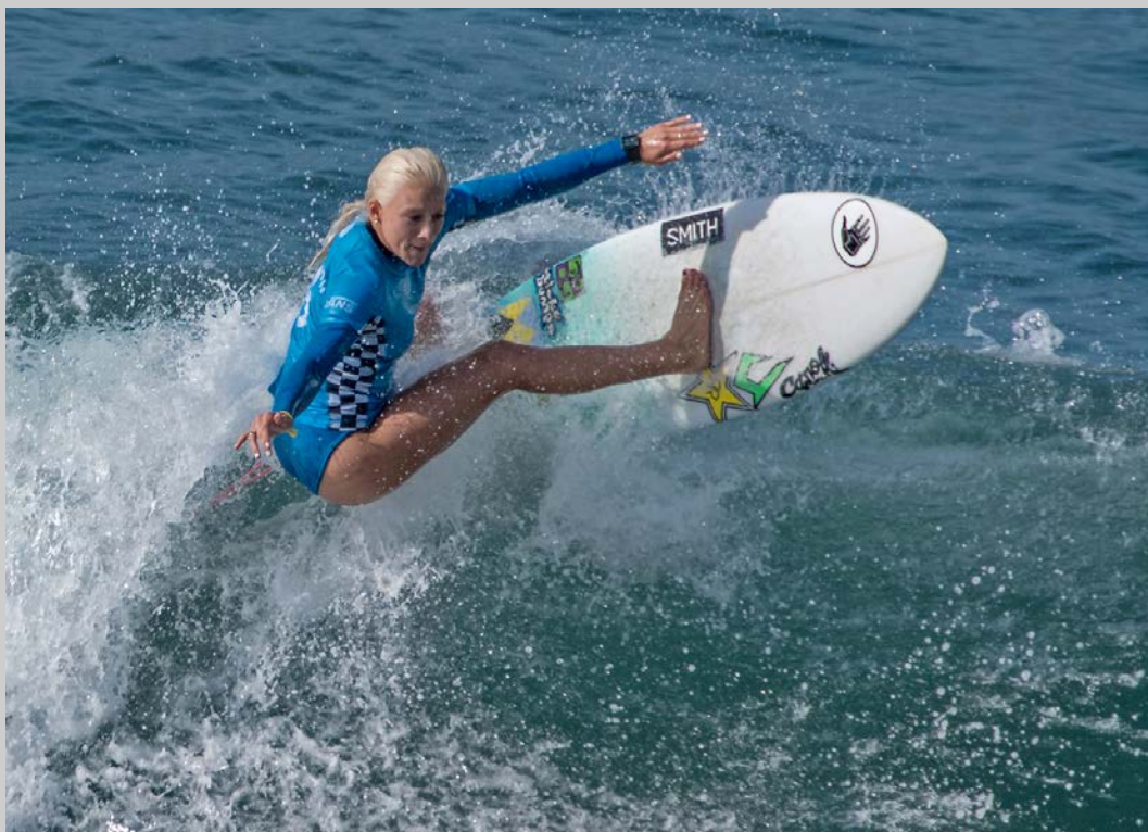
“2017 HB OPEN WINNER” © KEN CORDAS, APSA 2017 S4C International Exhibition of Photography Photojournalism General