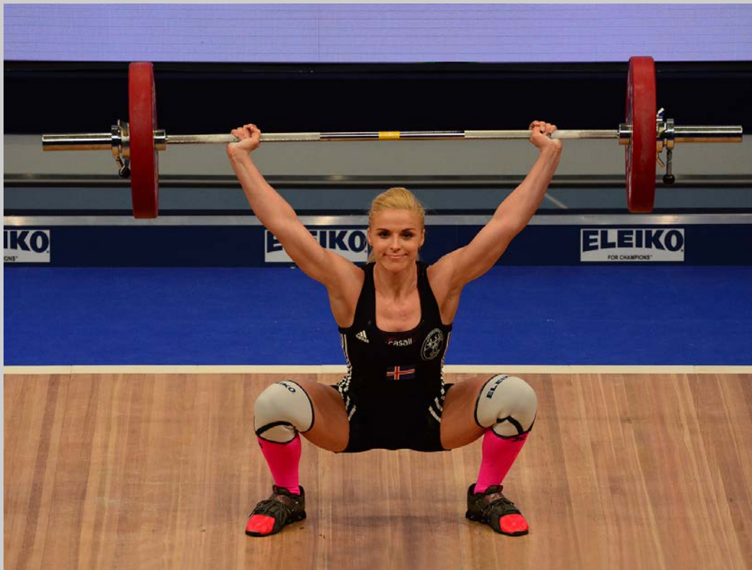
“FOR CHAMPIONS” EPSA 2017 S4C International Exhibition of Photography Photojournalism General