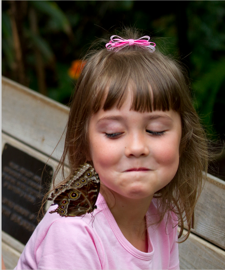
"I CAN'T BELIEVE IT" S4C International Exhibition of Photography Photojournalism Human Interest