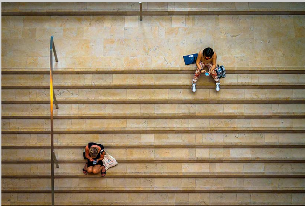
“PLAYING HANDPHONES” © WOLFGANG LIN, PPSA 2017 S4C International Exhibition of Photography Photojournalism Human Interest HM