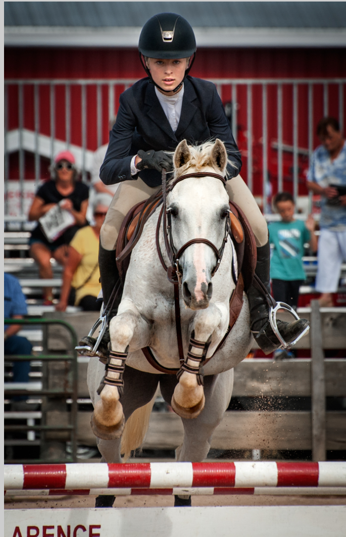
“UP AND OVER 2213” © VIKI GAUL, APSA, PPSA 2017 S4C International Exhibition of Photography Photojournalism General