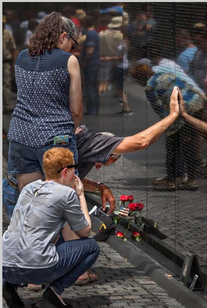
“HEARTACHE” S4C International Exhibition of Photography Photojournalism Human Interest