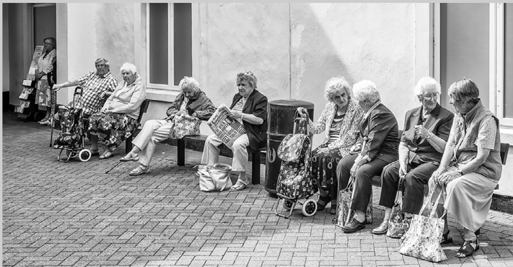
“THE END OF THE LINE” S4C International Exhibition of Photography Photojournalism Human Interest S4C Silver