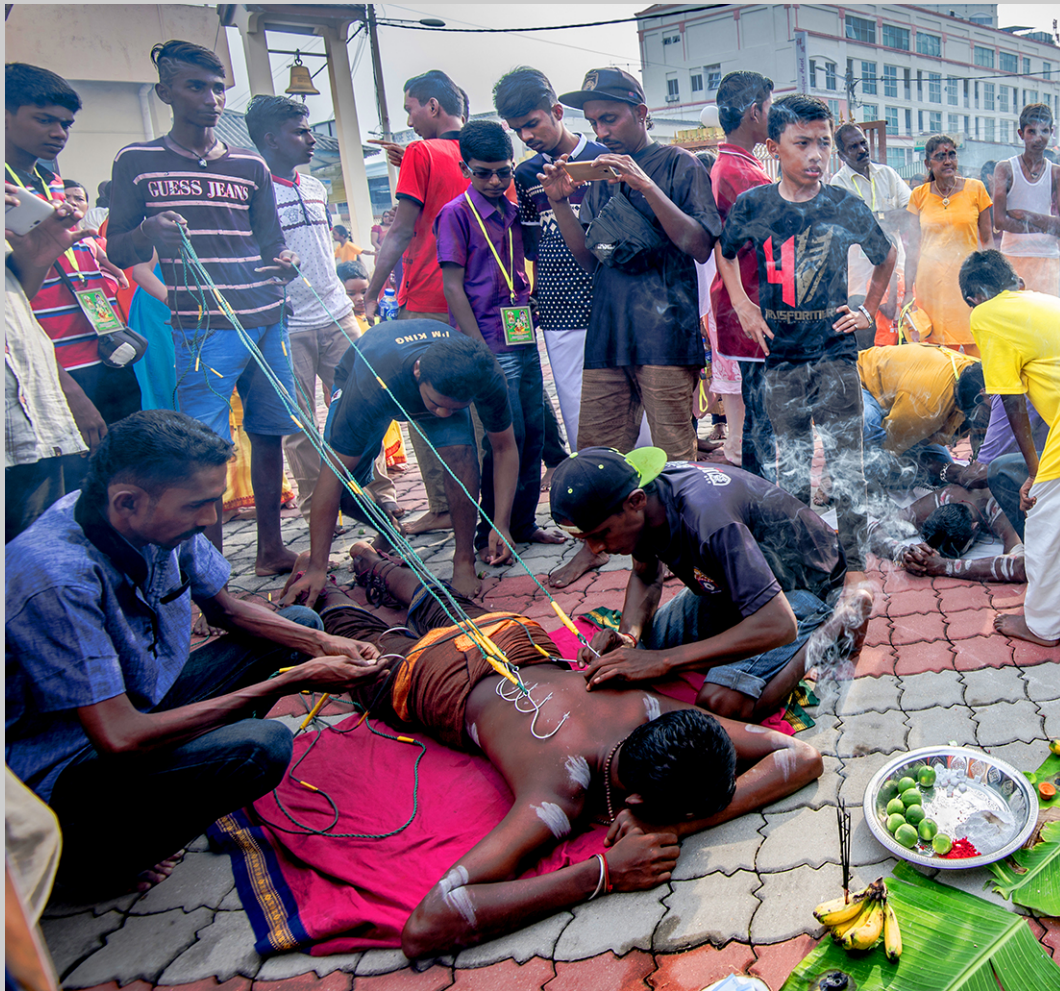
“THE PAIN” © SAU FONG NEO 2017 S4C International Exhibition of Photography Photojournalism General