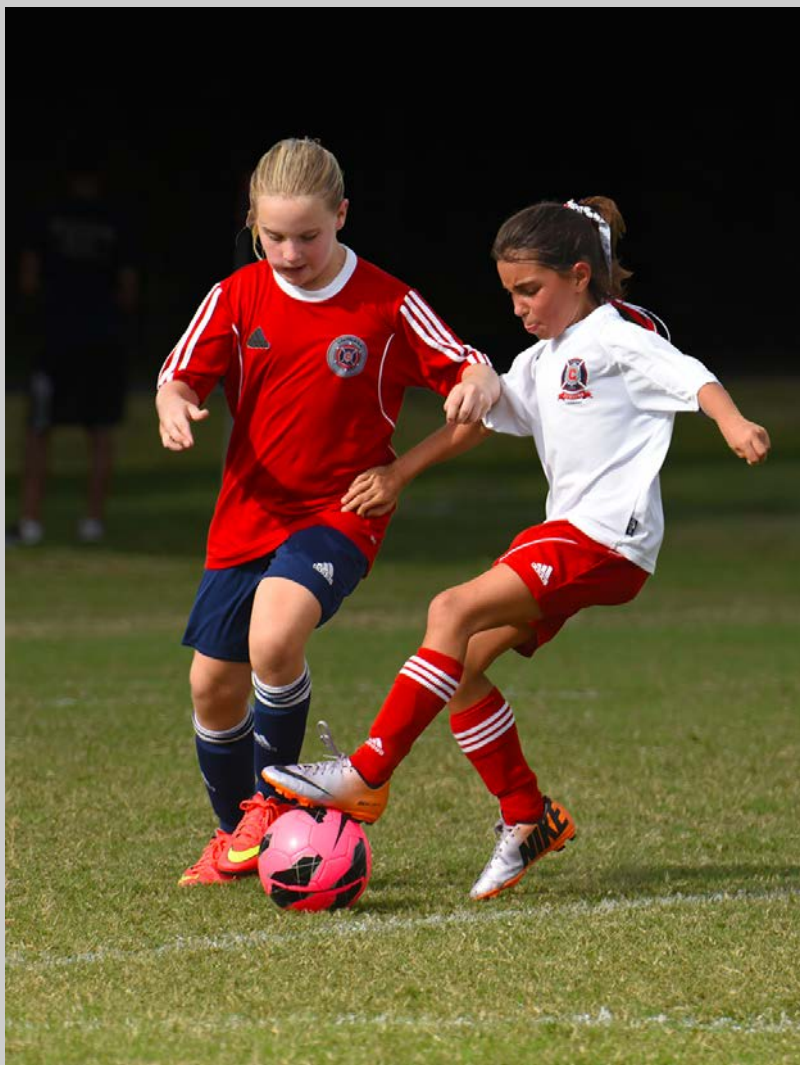
“GIRL TO GIRL MARKING” © SHU CHEUK, MPSA 2017 S4C International Exhibition of Photography Photojournalism General