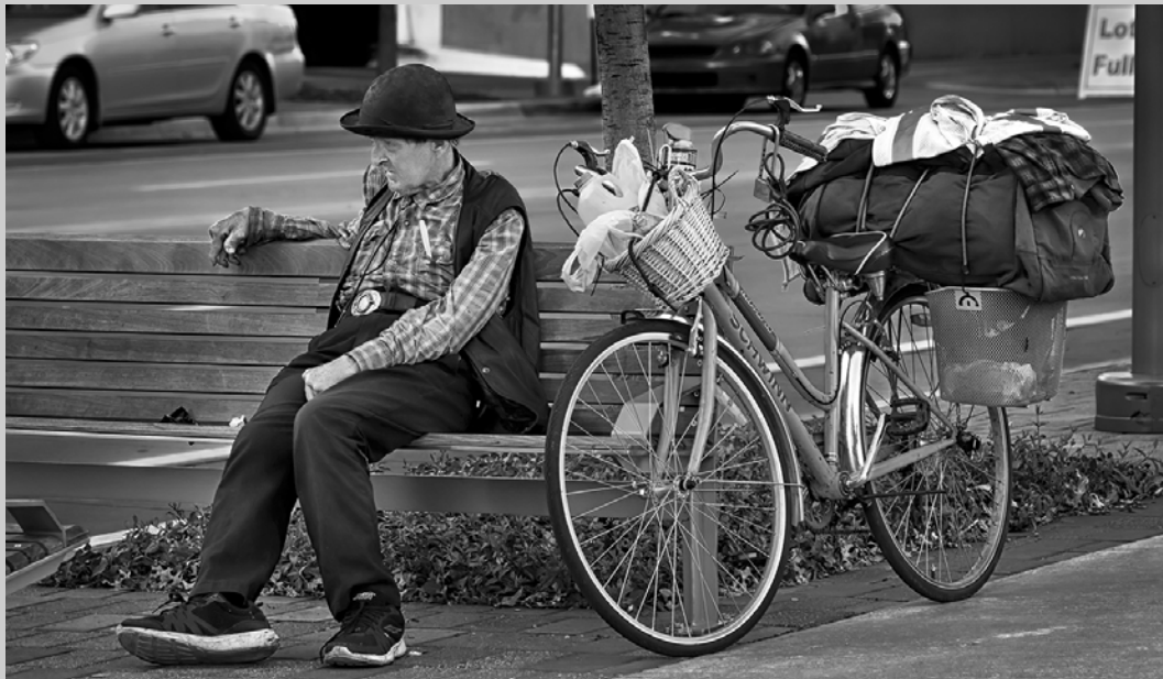
“LOST IN THOUGHT” © INGE VAUTRIN 2017 S4C International Exhibition of Photography Photojournalism Human Interest