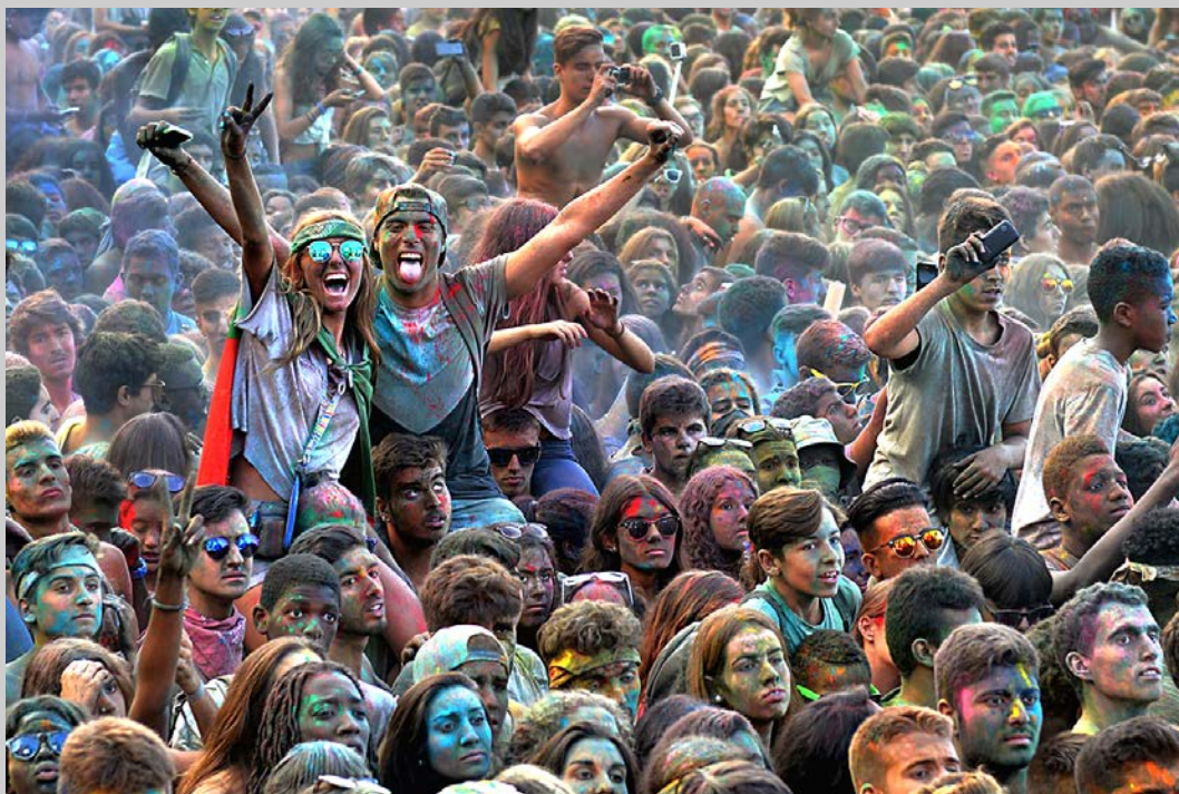
“YOUNG FUN” © JOAO TABORDA, PPSA 2017 S4C International Exhibition of Photography Photojournalism General