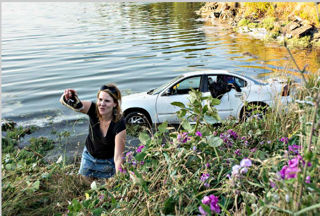
“WHY ARE YALL LOOKIN AT ME” 2017 S4C International Exhibition of Photography Photojournalism Human Interest