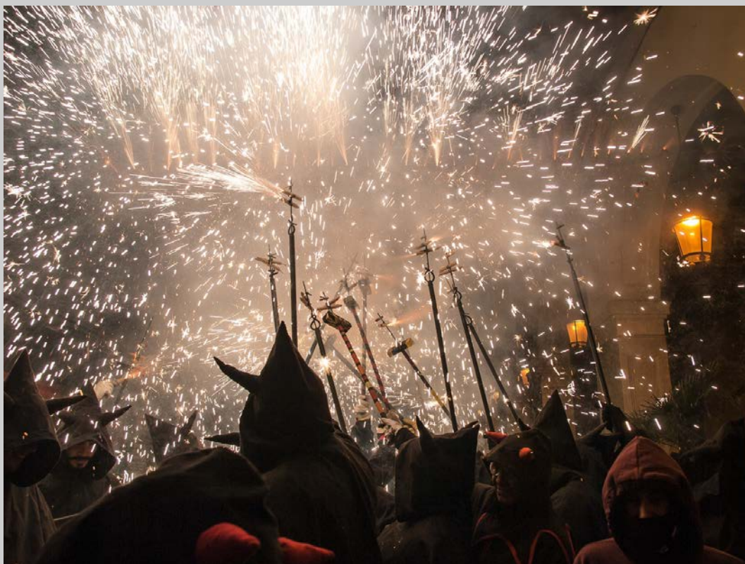
“DIABLES 9218” © SALVADOR ATANCE, PPSA 2017 S4C International Exhibition of Photography Photojournalism General