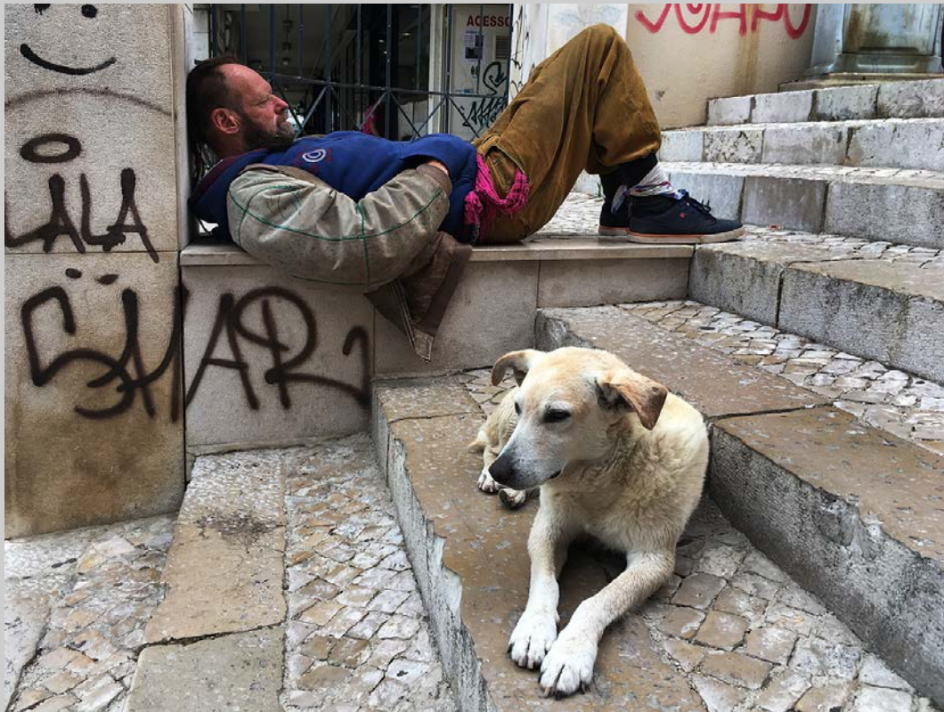
“MEDITATION TIME” © JOAO TABORDA, PPSA 2017 S4C International Exhibition of Photography Photojournalism Human Interest HM