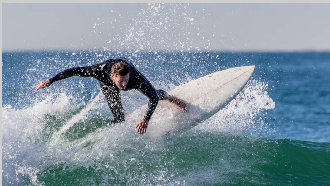
“SURFING J06” S4C International Exhibition of Photography Photojournalism General