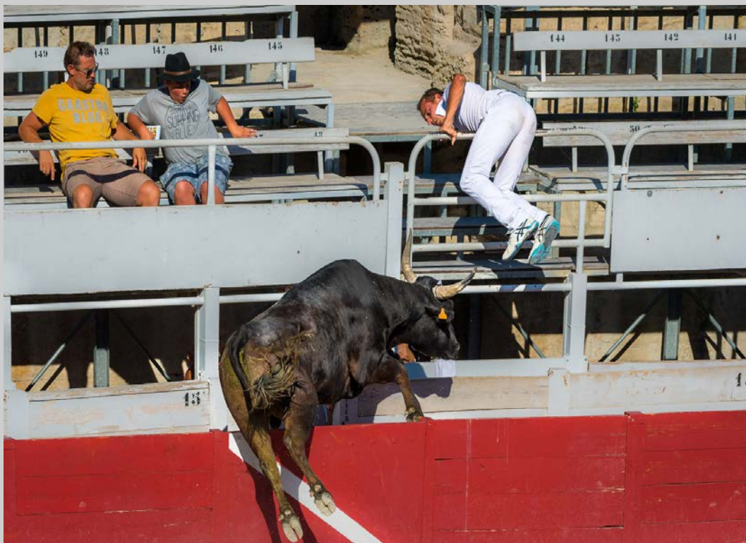
“DANGEROUS HORN” © DANY CHAN, MPSA 2017 S4C International Exhibition of Photography Photojournalism General