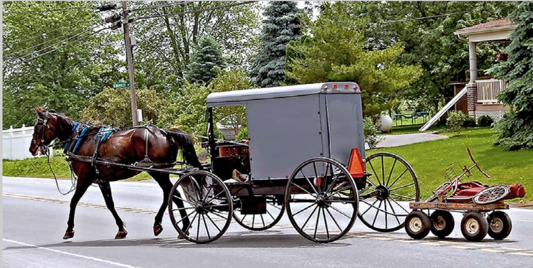
“AMISH SHOPPING TRIP” S4C International Exhibition of Photography Photojournalism General