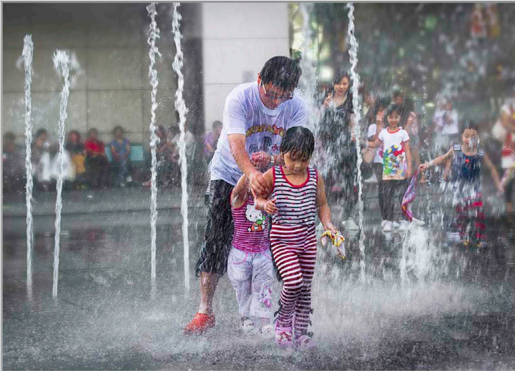
“I GO THROUGH EVERYTHING WITH U” © JAMES WAT 2017 S4C International Exhibition of Photography Photojournalism General