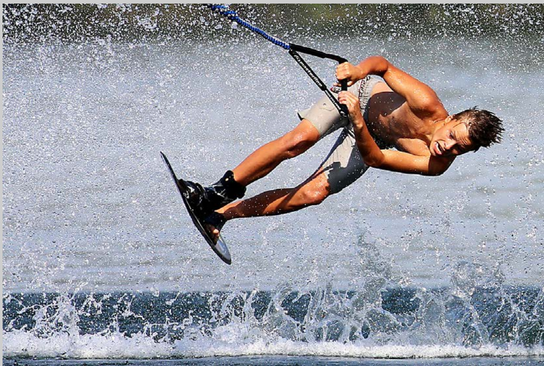
“FEAR” © ALBERT PEER 2017 S4C International Exhibition of Photography Photojournalism General S4C Silver