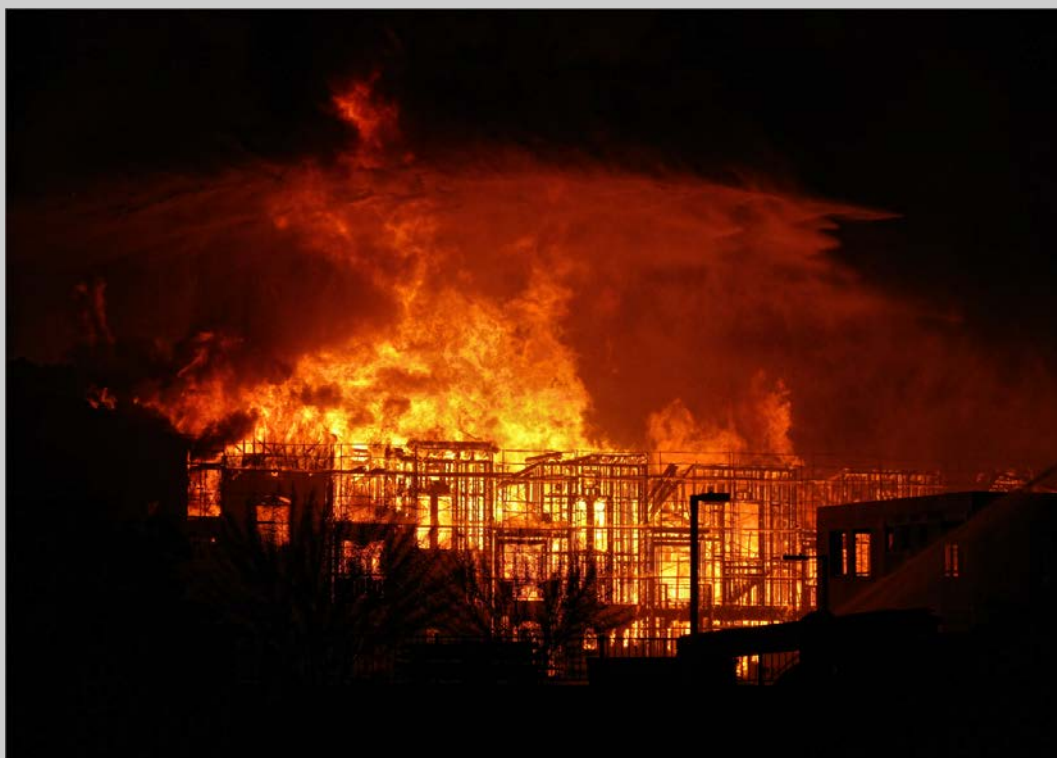
“HOUSING CONSTRUCTION FIRE” S4C International Exhibition of Photography Photojournalism General