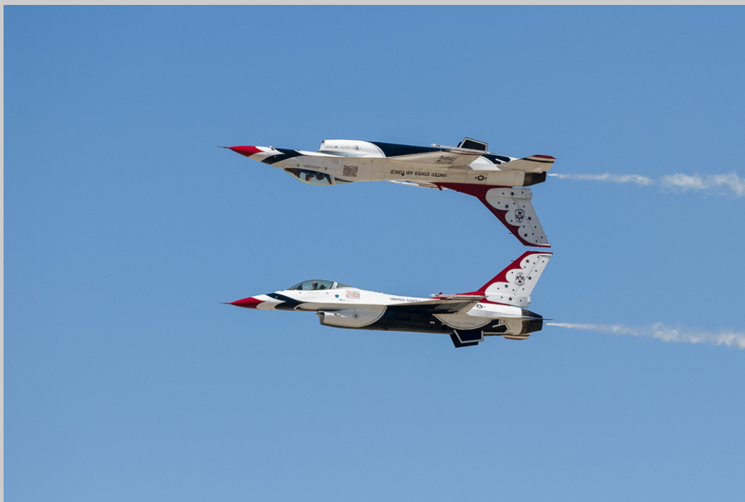
“THUNDERBIRDS 5 AND 6” © DAVID WILKINS 2017 S4C International Exhibition of Photography Photojournalism General