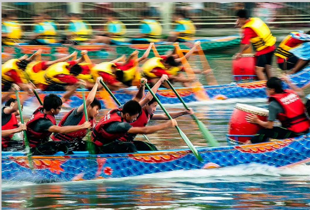
“DRAGON BOAT RACING _ 18” © MIN-SHENG KU, MPSA 2017 S4C International Exhibition of Photography Photojournalism General