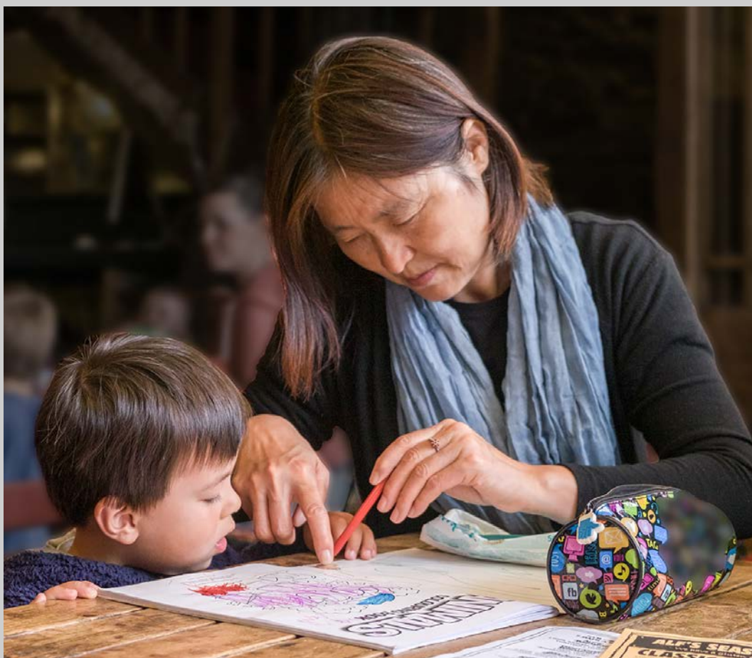
“LEARNING” © PETER ELLISTON 2017 S4C International Exhibition of Photography Photojournalism Human Interest S4C Silver