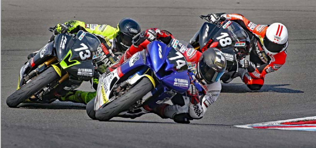
“BIKER 74 IN FRONT” © WOLFGANG KAEDING, GMP SA 2017 S4C International Exhibition of Photography Photojournalism General