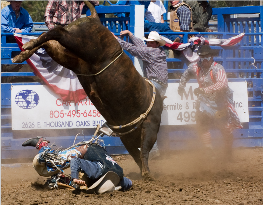
"TO THE RESCUE" S4C International Exhibition of Photography Photojournalism General