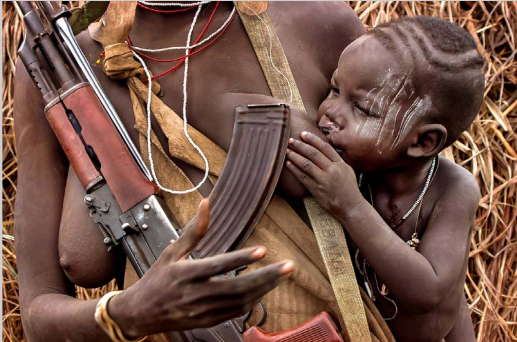
“SURVIVAL” S4C International Exhibition of Photography Photojournalism General