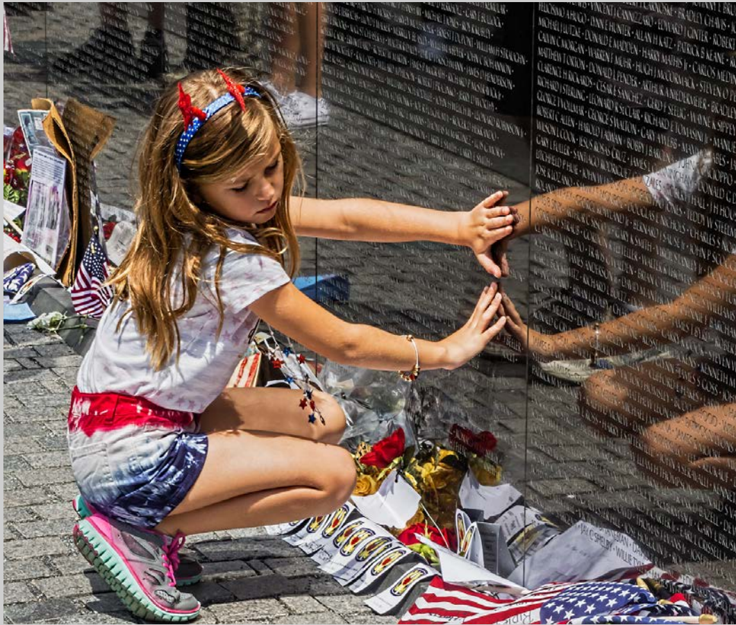
“HONORING THE FALLEN A07” S4C International Exhibition of Photography Photojournalism Human Interest