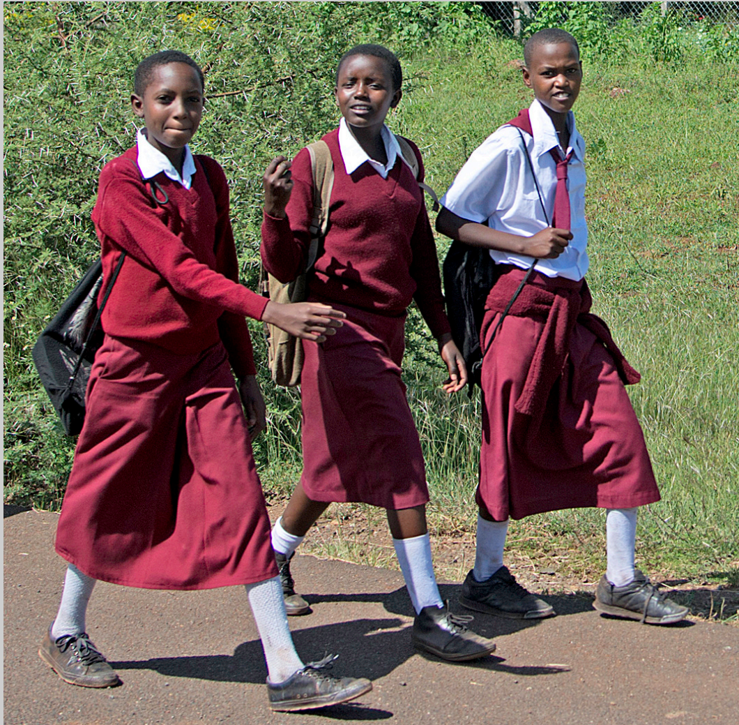
“RETURNING FROM SCHOOL IN TANZANIA” S4C International Exhibition of Photography Photojournalism Human Interest