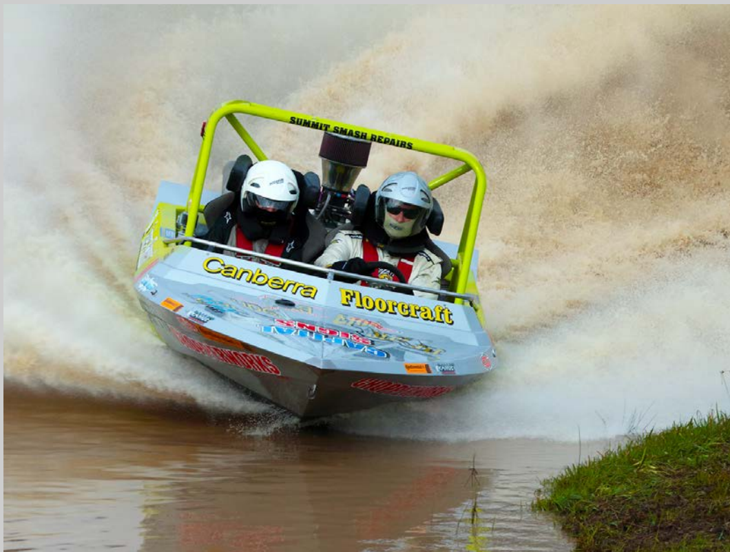
"CANBERRA ON TURN" © ANN SMALLEGANGE 2017 S4C International Exhibition of Photography Photojournalism General