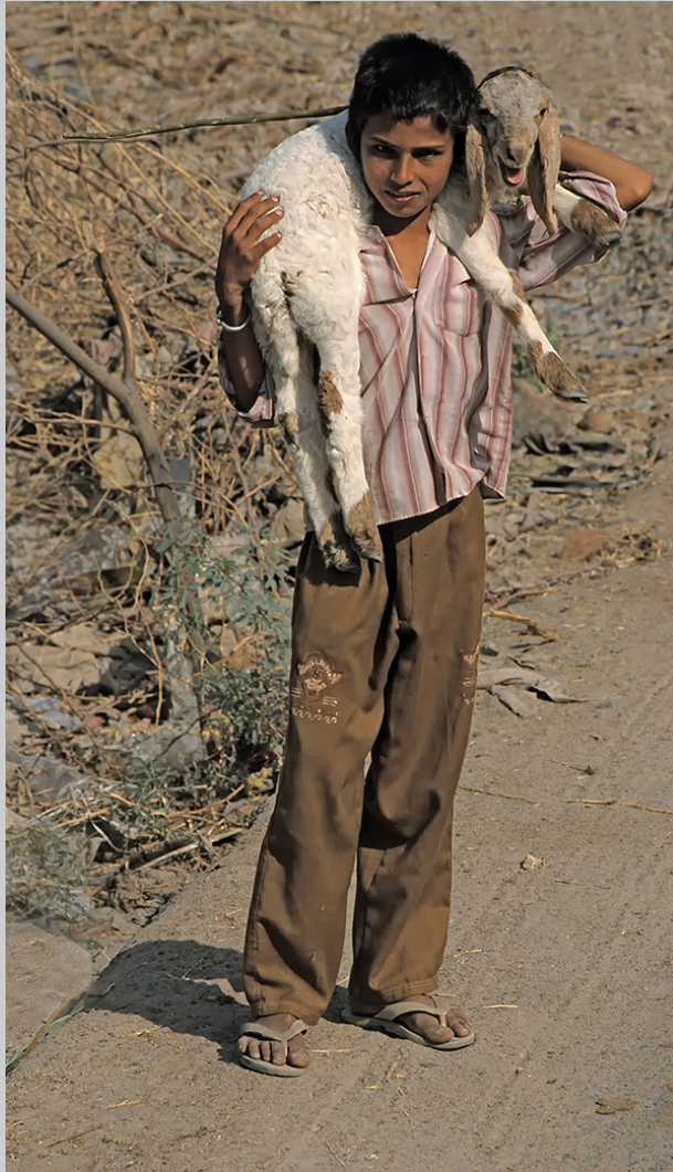
“A BOY AND HIS GOAT” 2017 S4C International Exhibition of Photography Photojournalism General