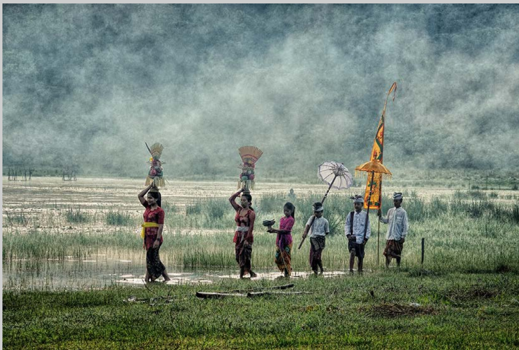
“MELASTI GROUP LAKESIDE” S4C International Exhibition of Photography Photojournalism Human Interest