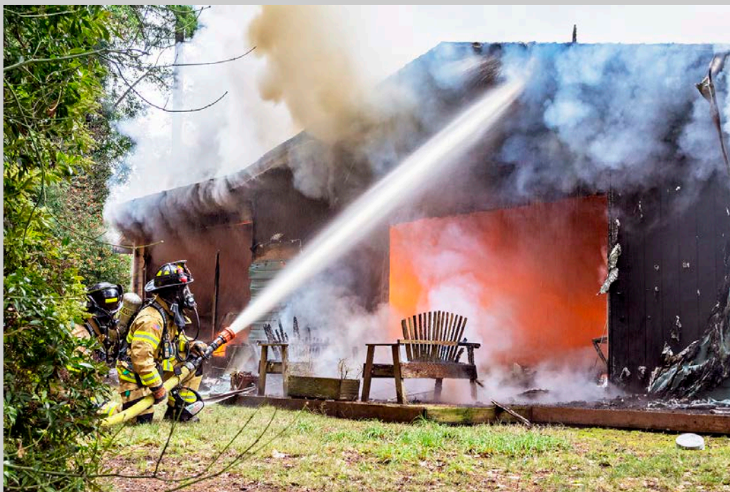
“LMDR. FIRE_1ST WATER” © STEVEN FISHER, FPSA, MPSA 2017 S4C International Exhibition of Photography Photojournalism General S4C Bronze