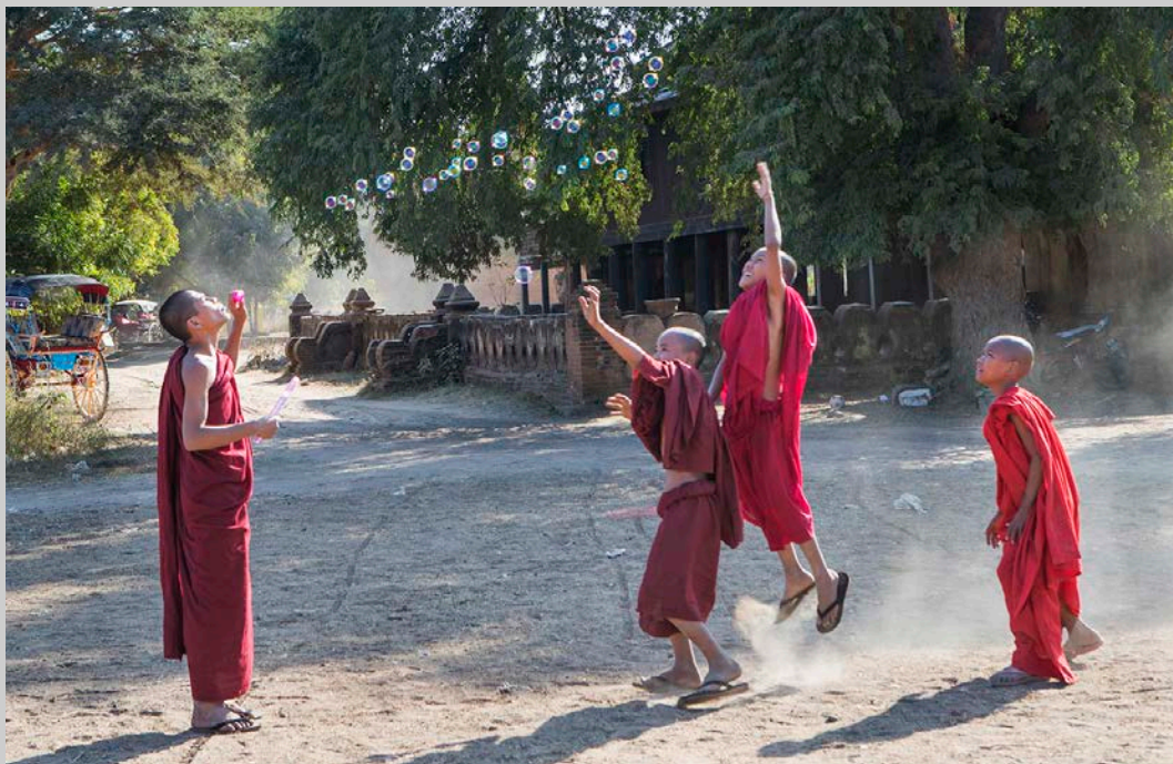
“PLAYING BUBBLE” © PHILLIP KWAN, GMPSA/B 2017 S4C International Exhibition of Photography Photojournalism General