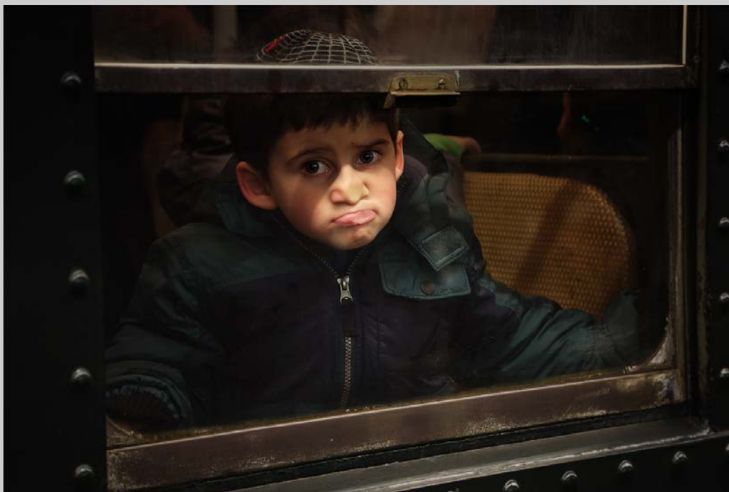
“BOY LOOKING” © WENYUAN LI, EPSA 2017 S4C International Exhibition of Photography Photojournalism Human Interest HM