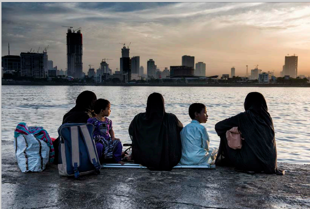
“HAJI ALI MUMBAI” © ABBAS KAPADIA, EPSA 2017 S4C International Exhibition of Photography Photojournalism Human Interest