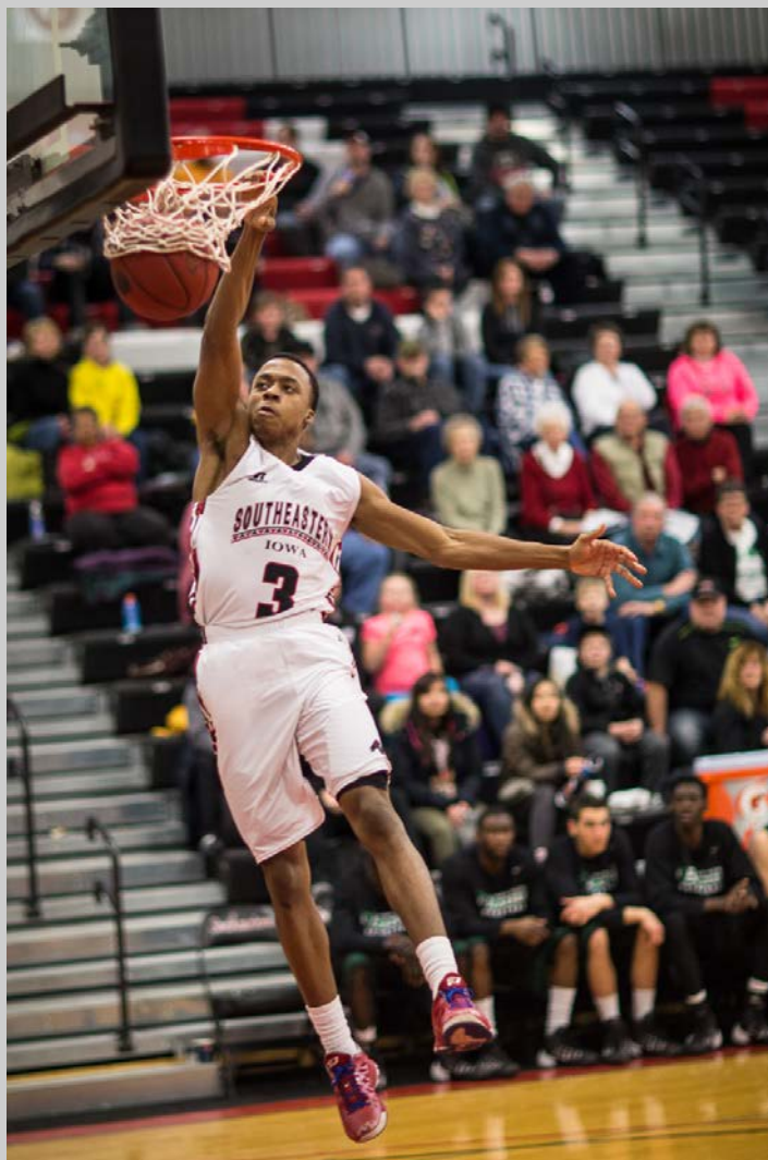
“RISING TO THE OCCASION” © JOHN F. LARSON, JR., FPSA, MPSA 2017 S4C International Exhibition of Photography Photojournalism General