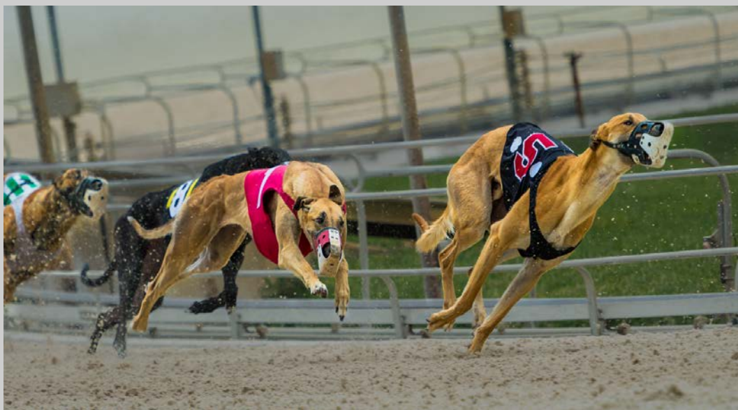
“HEADSTRONG 105” © DANY CHAN, MPSA 2017 S4C International Exhibition of Photography Photojournalism General HM