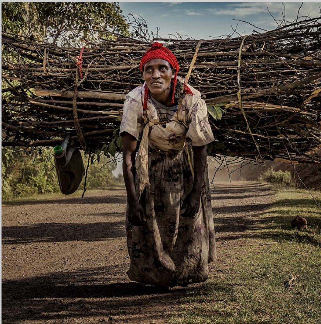
“BACKWOOD” © LANFENG CHEN 2017 S4C International Exhibition of Photography Photojournalism Human Interest