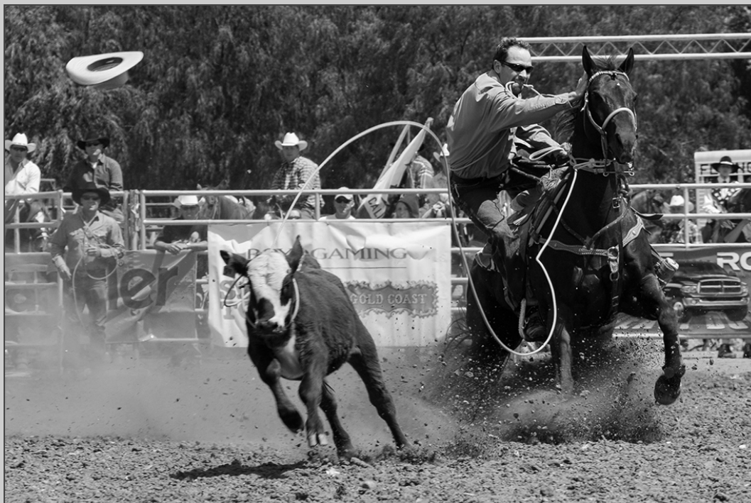
“QUICK STOP” S4C International Exhibition of Photography Photojournalism General