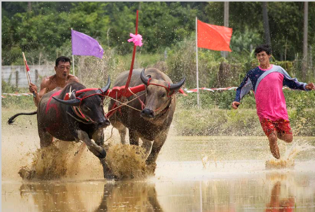
“ARE YOU OK” S4C International Exhibition of Photography Photojournalism General