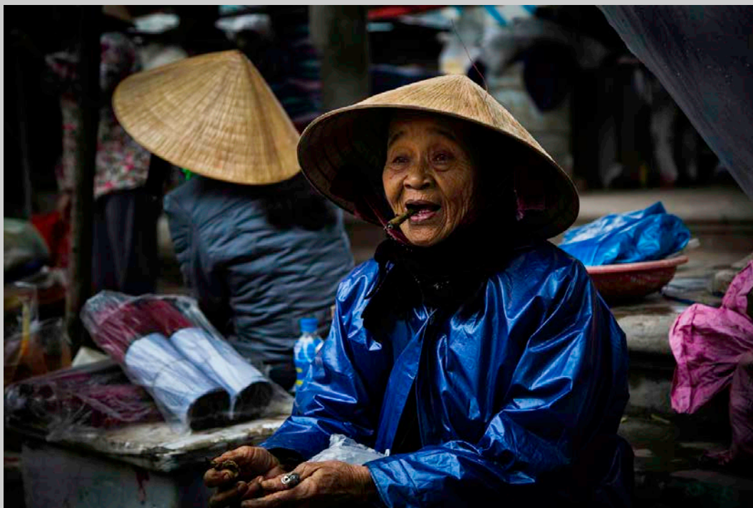
“MS. CIGAR” © GERALD FLEURY 2017 S4C International Exhibition of Photography Photojournalism General