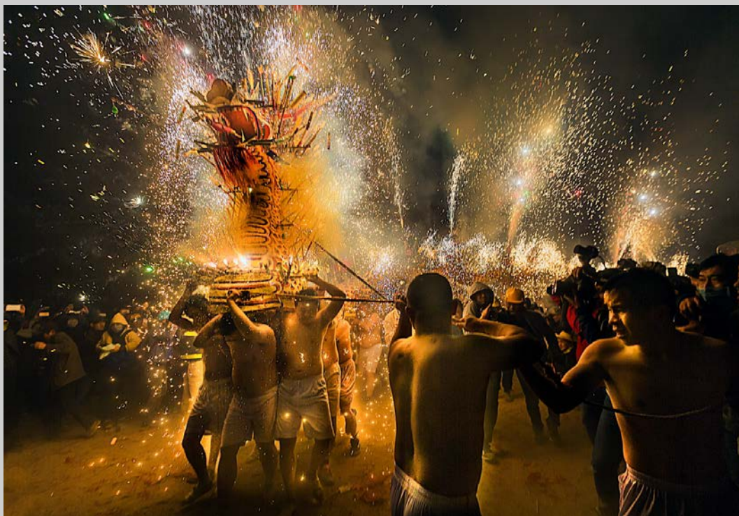
“FIERY DRAGON” © WENDY WAI MAN LAM 2017 S4C International Exhibition of Photography Photojournalism General