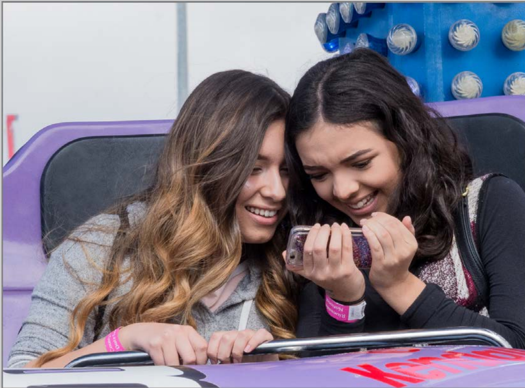
“A MOMENT CAPTURED 7884” S4C International Exhibition of Photography Photojournalism Human Interest