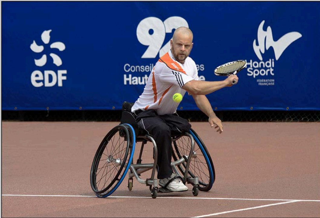
“GOOD BACKHAND” © GUY B. SAMOYVAULT, APSA, GMPA 2017 S4C International Exhibition of Photography Photojournalism General