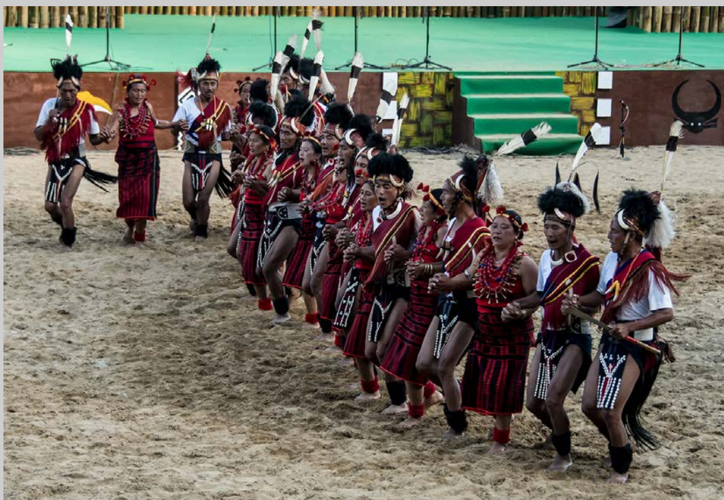
“TRIBE-DANCE” S4C International Exhibition of Photography Photojournalism Human Interest