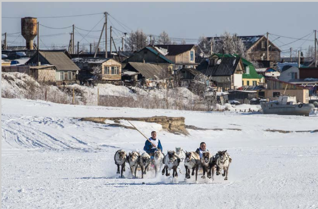
“WINTER RACE-YAMA” © ALEXEY SULOEV 2017 S4C International Exhibition of Photography Photojournalism General