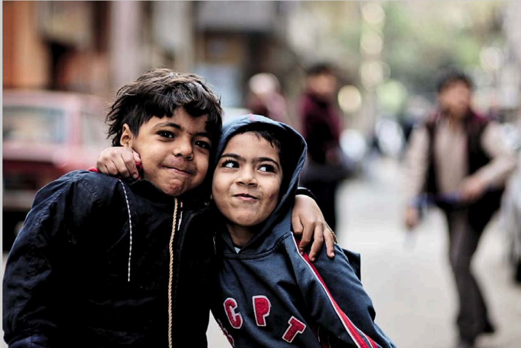
“TAHRIR SMILES” S4C International Exhibition of Photography Photojournalism Human Interest