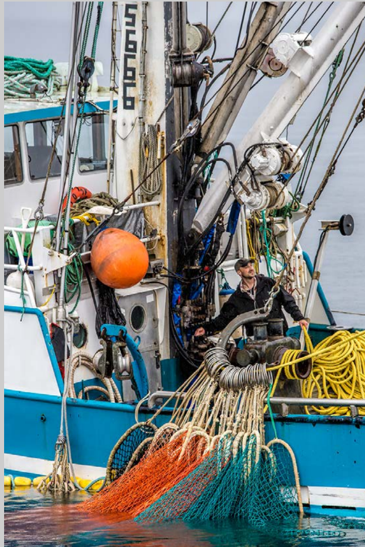
“SALMON FISHING” © DEE LANGEVIN, MPSA 2017 S4C International Exhibition of Photography Photojournalism General