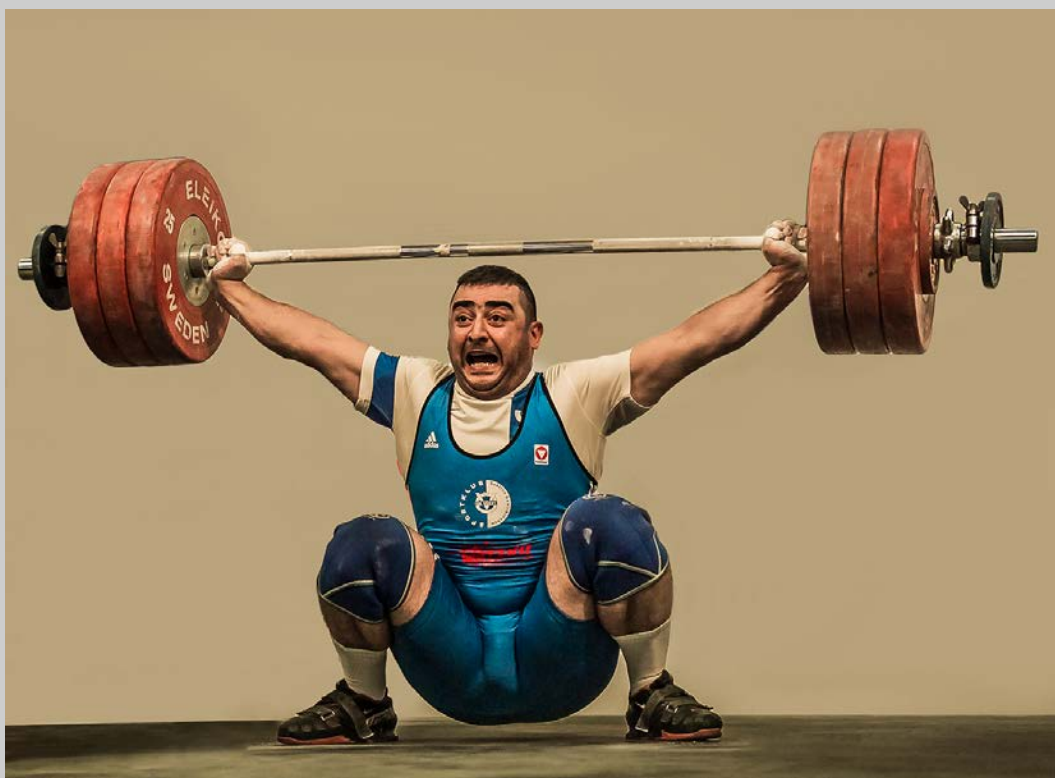
“SARGIS_1” S4C International Exhibition of Photography Photojournalism General