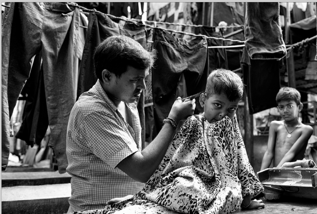
“HAIR CUT DHOBI GHAT” © ABBAS KAPADIA, EPSA 2017 S4C International Exhibition of Photography Photojournalism Human Interest