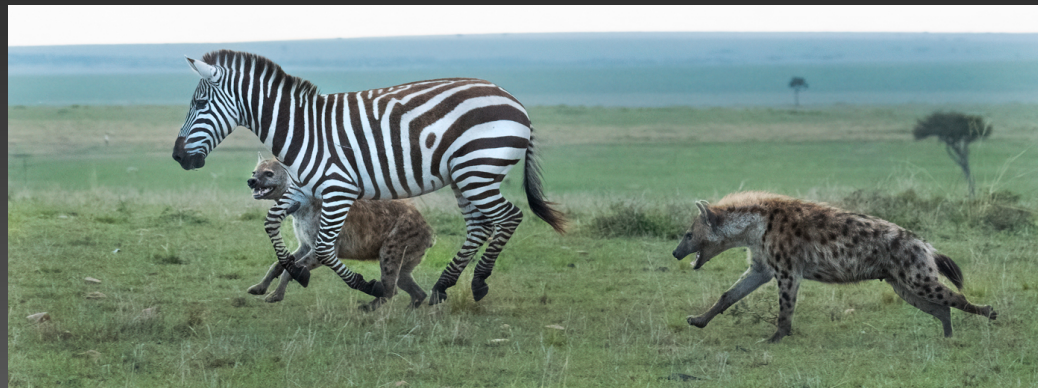
'ZEBRA VICTORY' BY ELOISE CARSON (Silver Medal)