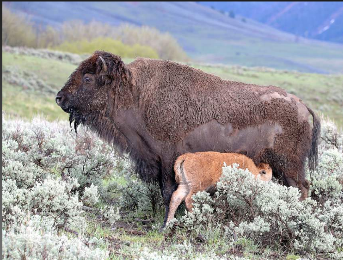
'FEEDING TIME' BY LORI KRUM (Bronze Medal)