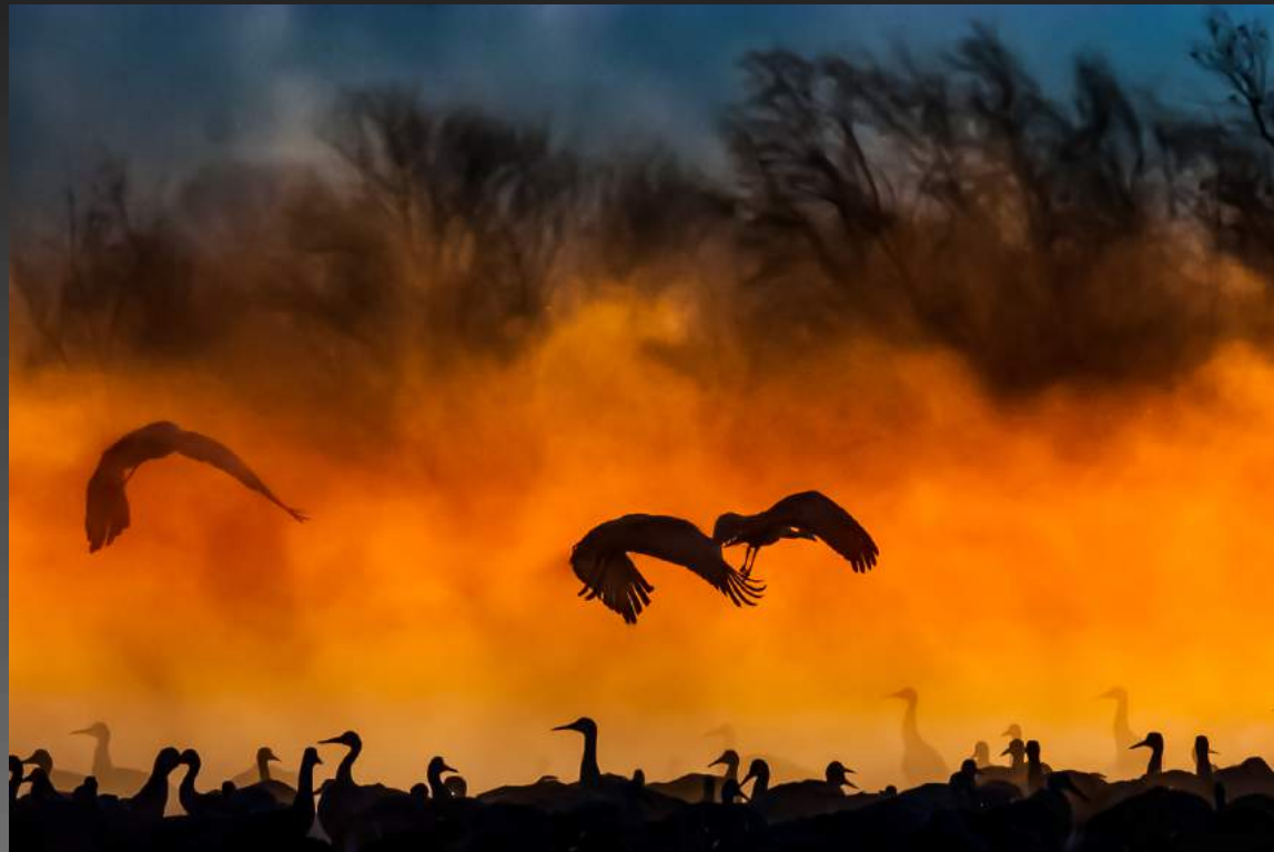
'INTO FIRE MIST' BY GERALD FLEURY (Silver Medal)