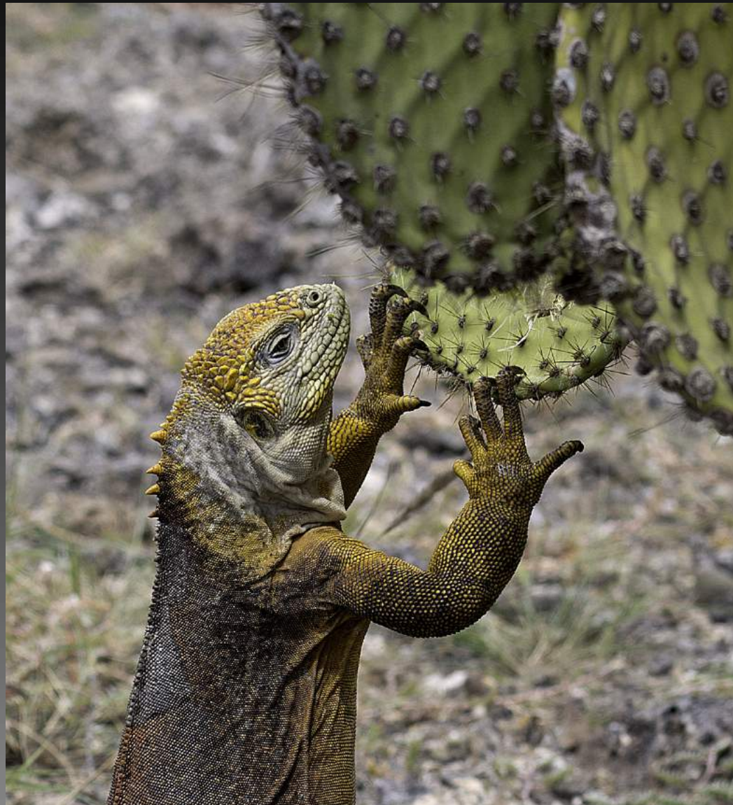
'IGUANA 4' BY HANS ZIMA (Silver Medal)