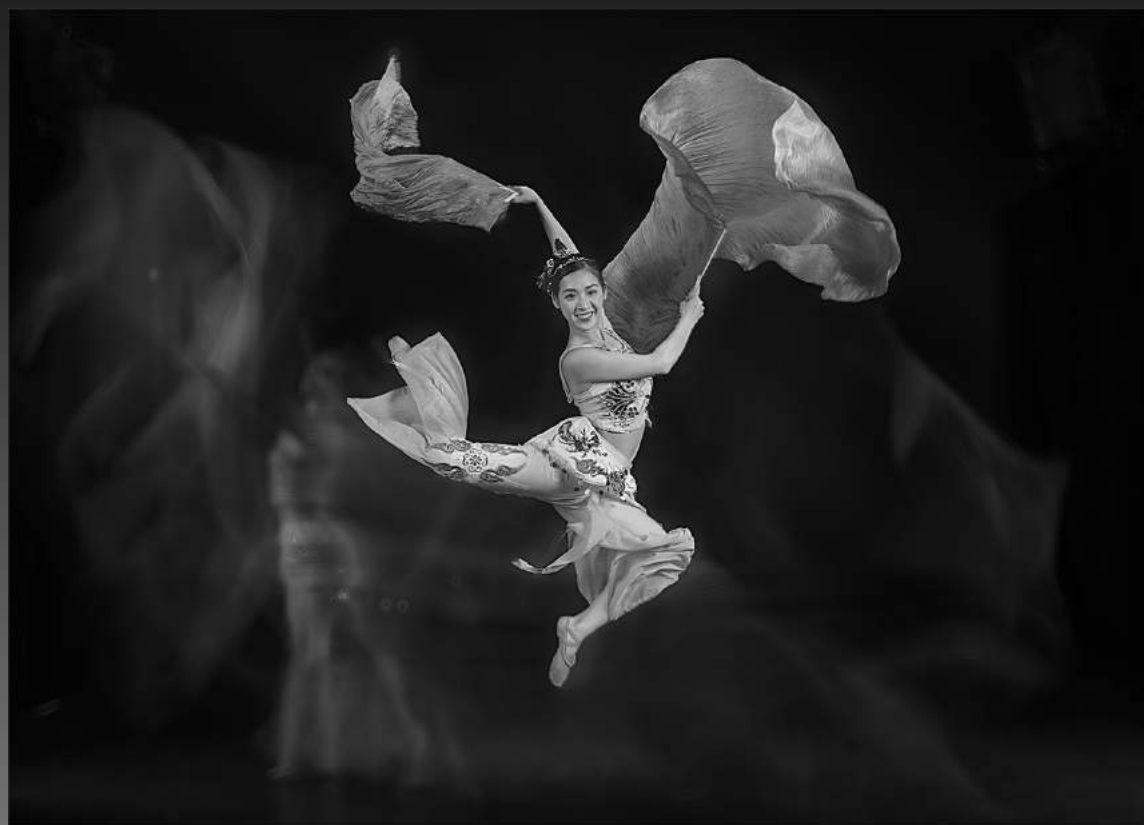
'JUMP TO YOUR BEST' BY JAMES WAT (Silver Medal)