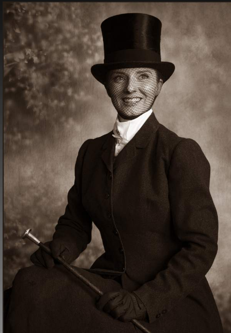
'READY TO RIDE' BY CRYSTAL OLGUIN (Bronze Medal)