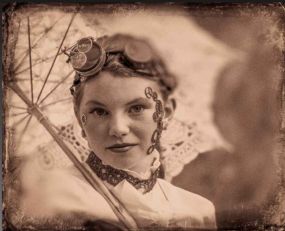
'AESLIN_WET_PLATE' BY KATHRYN NEWMAN (Silver Medal)