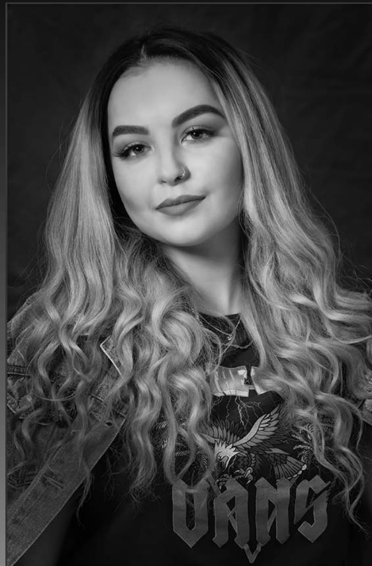
'DESIRRAE 8291' BY NAN CARDER (Bronze Medal)