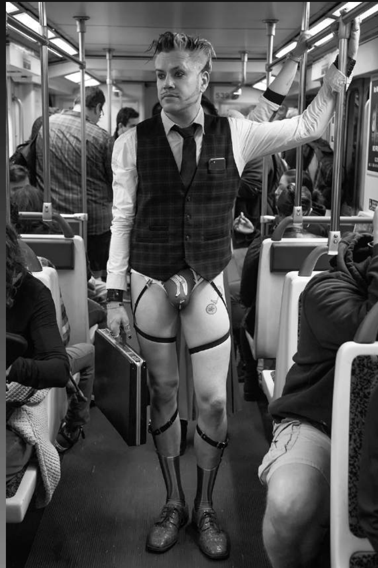
'DRESSED FOR SUCCESS' BY LARRY WHITE (Honor Award)