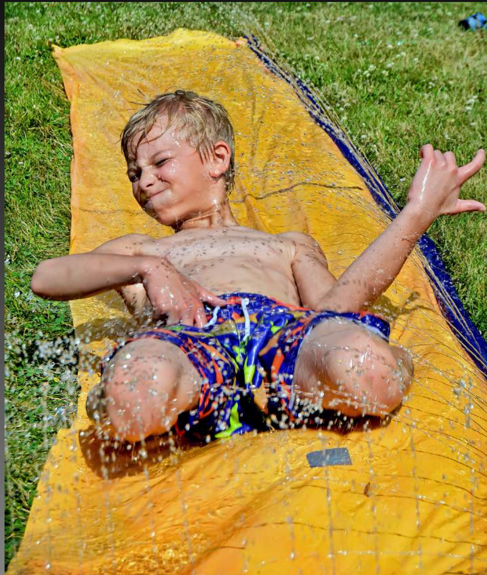
'WATER SLIDE ANTICS' BY SCOTT SHACKELFORD (Honor Award)