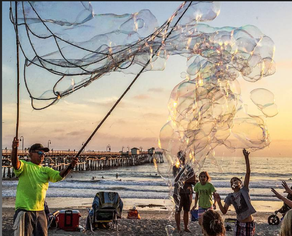
'BUBBLE FUNBUBBLE FUN' BY SANDRA CRANTZ (Honor Award)