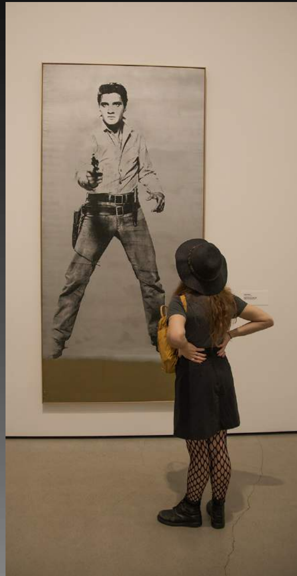
'ELVIS QUICK DRAW' BY LARRY WHITE (Honor Award)