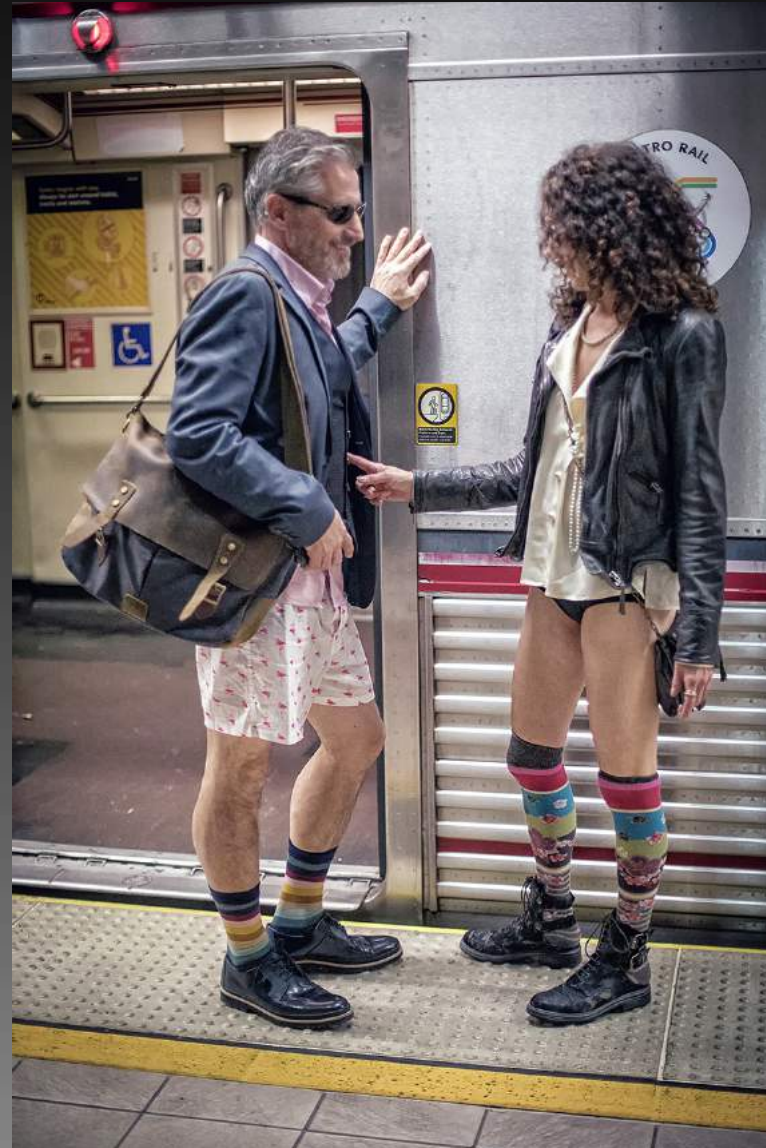
'HEY YOU' BY DEBORA SUTERKO (Honor Award)