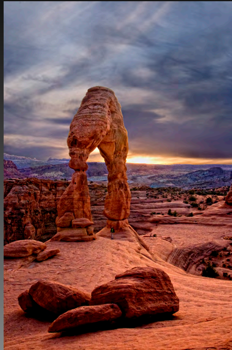
'DELICATE ARCH' BY BILL WIGHT (Honor Award)