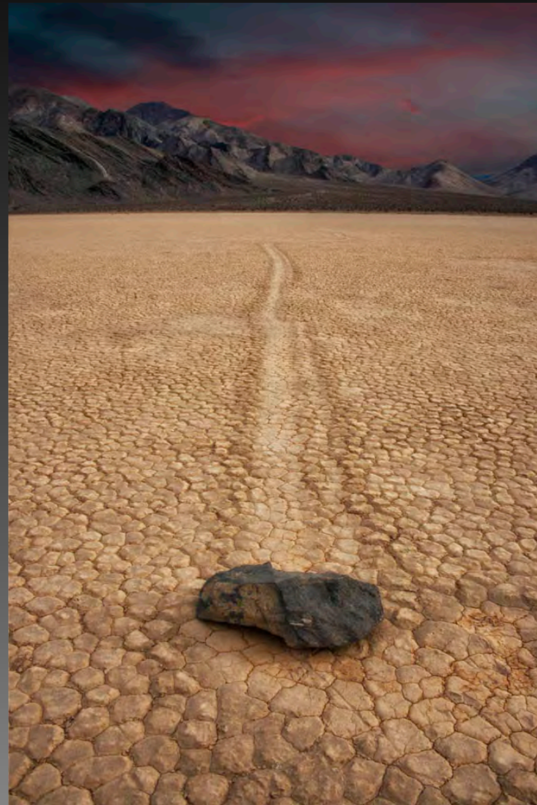
'RACETRACK ROCK' BY BILL WIGHT (Honor Award)